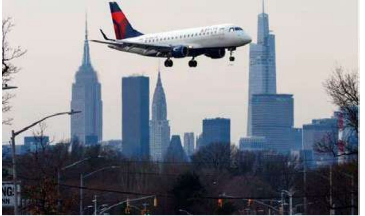
Laguardia Airport in New York

'CATASTROPHIC' FAILURE Planes resume flights following an FAA system outage at