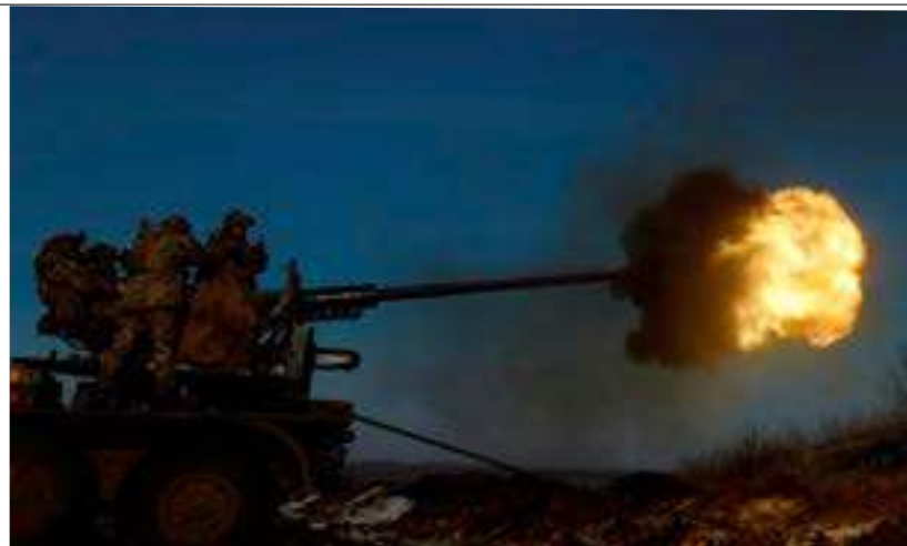
Ukrainian members of the military fire an anti-aircraft weapon, as Russia's attack on Ukraine continues, in the front-line city of Bakhmut, Ukraine.