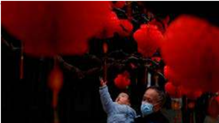
A child reaches for Spring Festival ornaments in a park ahead of Chinese Lunar New Year festivities in Beijing, China.