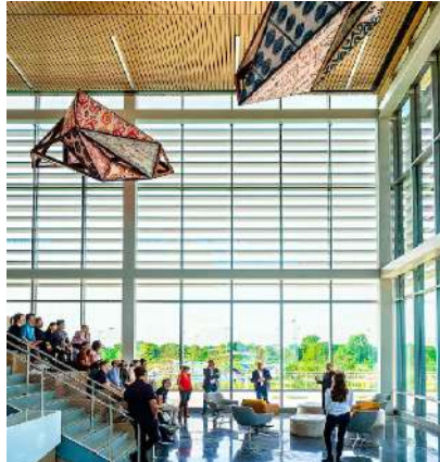
The main entry at Alief Neighborhood Center features bleacher seating, expansive views of the park, and artwork from the Red Thread Collective.

Key Point The New Alief Neighborhood Center Amenities Include A Skate Park, Health Center, and Library That Will Open Under One Innovative Roof