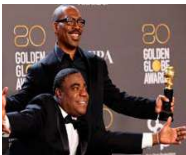
Eddie Murphy poses next to Tracy Morgan with the Cecil B. DeMille Award at the 80th Annual Golden Globe Awards in Beverly Hills, California.