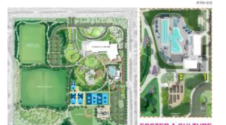
FOSTER A CULTURE OF HEALTH