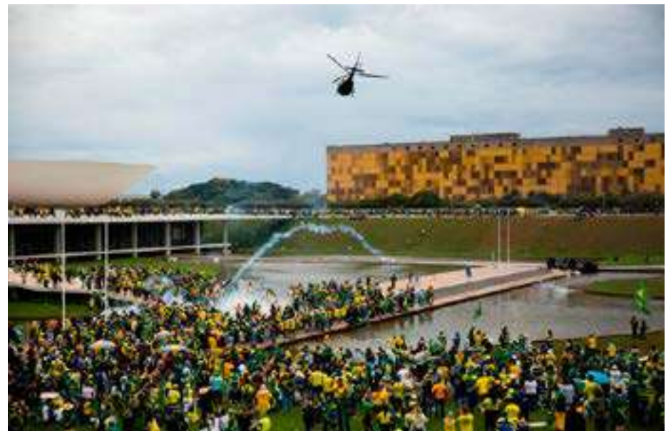
Supporters of Brazil's former President Jair Bolsonaro demonstrate against President Luiz Inacio Lula da Silva, in Brasilia, Brazil.