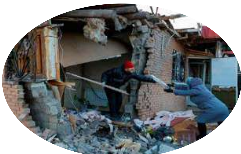
Local residents remove debris and carry belongings out of a shop destroyed in recent shelling in the course of Russia-Ukraine conflict in Donetsk, Russian-controlled Ukraine.