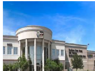
Southern News Group, Houston, Texas

Members of the community who have questions about any of the variety of issues the Center will address are encouraged to schedule interviews with the Center. The Center will link the person with a professional who can best address their needs.