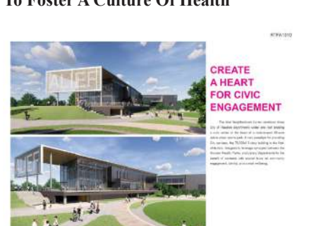
CREATE A HEART FOR CIVIC ENGAGEMENT