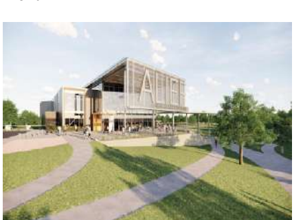
All In A Spirit Of Shared Collaboration