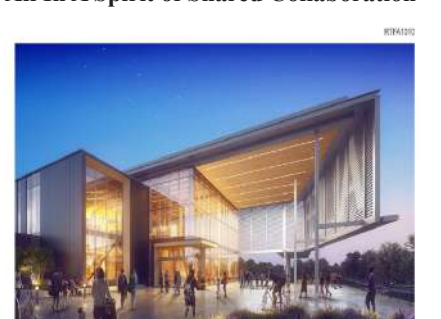
THE BIGGEST FRONT PORCH IN TEXAS