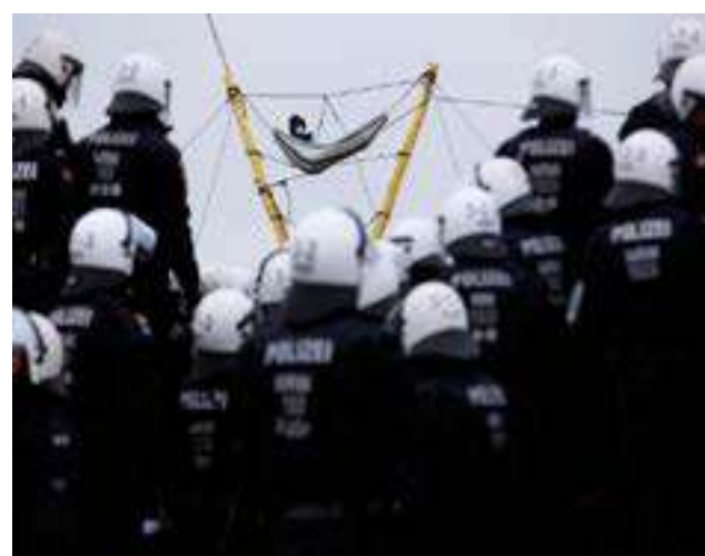
Police officers stand guard as an activist lies in a hammock connected to a structure, as activists demonstrate at Luetzerath, a village that is about to be demolished to allow for the expansion of the Garzweiler open-cast lignite mine of Germany's utility RWE, Germany, January 10, 2023.