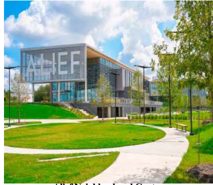
Alief Neighborhood Center