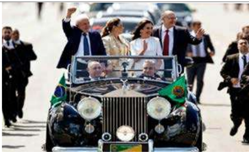
Brazil's President elect Luiz Inacio Lula da Silva and his wife Rosangela "Janja" da Silva, wave to supporters from a Rolls Royce on the day of his swearing-in ceremony, in Brasilia, Brazil, January 1, 2023. TPX IMAGES OF THE DAY