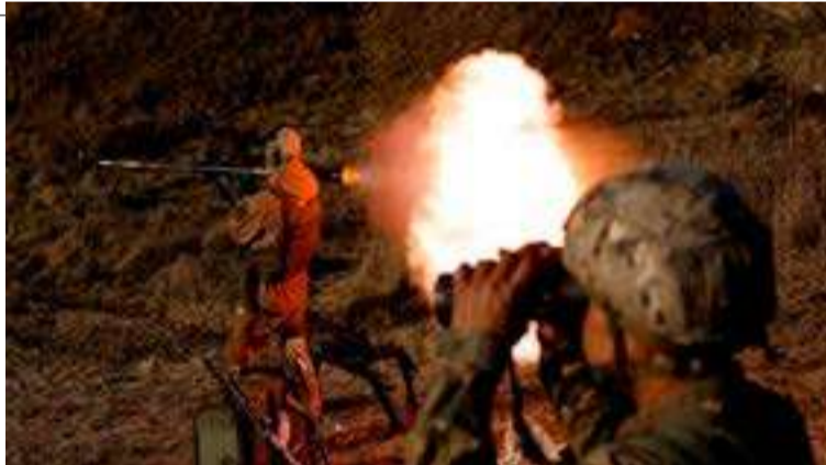
A soldier from Carpathian Sich international battalion fires an RPG while conducting manoeuvres near the front line, as Russia's attack on Ukraine continues, near Kreminna, Ukraine, January 3, 2023. TPX IMAGES OF THE DAY REFILE - CORRECTING LOCATION