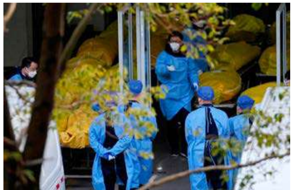
A staff member walks next to bodies in body bags at a funeral home, as coronavirus disease (COVID-19) outbreaks continue in Shanghai, China, January 4, 2023. REUTERS/Staff TPX IMAGES OF THE DAY