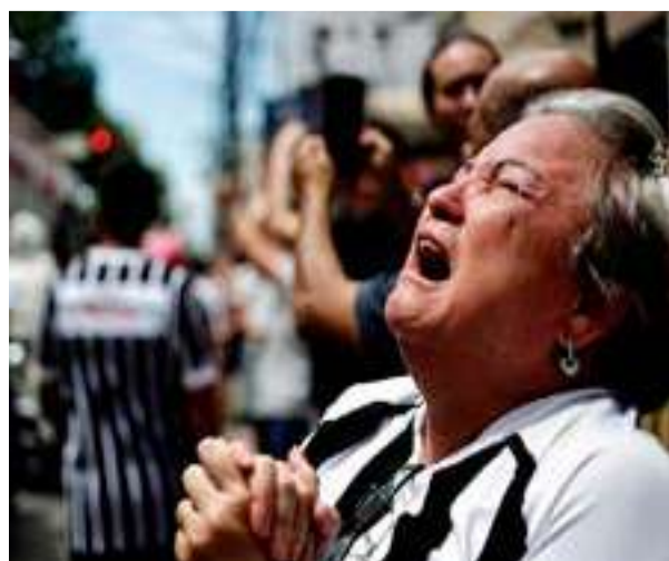
Soccer Football - Death of Brazilian soccer legend Pele - Vila Belmiro Stadium, Santos, Brazil - January 3, 2023 A mourner reacts as Brazilian soccer legend Pele is transported by the fire department, from his former club Santos' Vila Belmiro stadium TPX IMAGES OF THE DAY