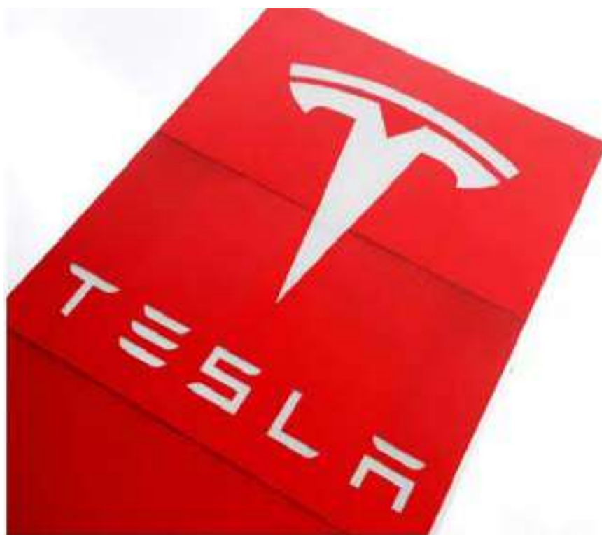
The logo of car manufacturer Tesla is seen at a dealership in London, Britain, May 14, 2021.

Traders are leaning toward bearish bets in Tesla options, with pricing implying a 53% probability that the stock will fall more than 12.5% over the next three months. Options positioning signals only a 31% probability that the shares will rise by more than 12.5% over the same period, Refinitiv data showed