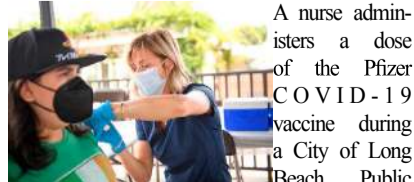
Health mobile vaccination clinic at the California State University, Long Beach campus.