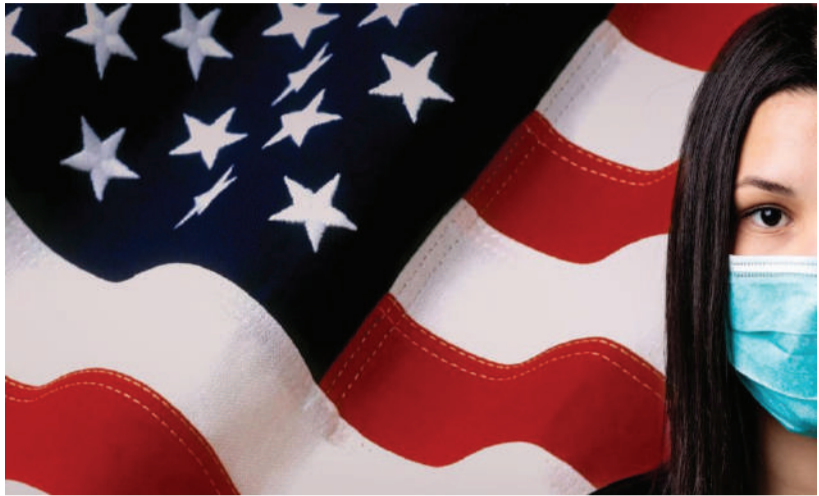
Attacks on East Asian people living in the US have shot up during the pandemic, revealing an uncomfortable truth about American identity.