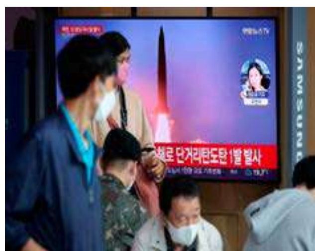
People watch a TV broadcasting a news report on North Korea firing a ballistic missile toward the sea off its east coast, in Seoul, South Korea, September 25.