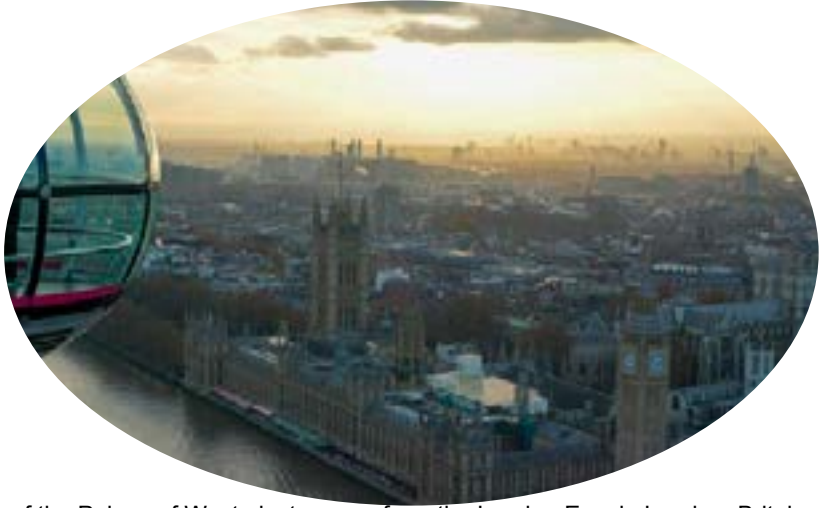
A view of the Palace of Westminster seen from the London Eye, in London, Britain.