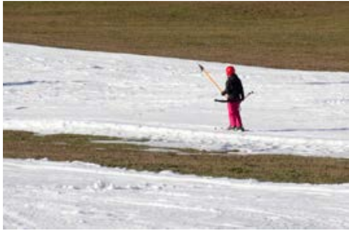
A person uses the ski lift on an artificial ski slope in the ski resort of St. Corona as unseasonably warm temperatures hit Austria.