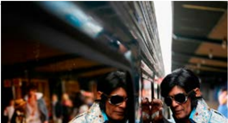
An Elvis Presley impersonator leans against the Elvis Express train at Sydney Central Railway Station before departing for the Parkes Elvis Festival, in Sydney, Australia.