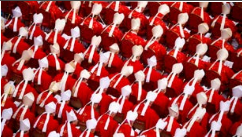
Cardinals attend the funeral of former Pope Benedict in St. Peter's Square at the Vatican, January 5, 2023.