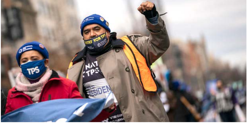
Activists and immigrants with temporary protected status march toward the White House on Feb. 23, 2021, in Washington, D.C., in a call for Congress and the Biden administration to pass immigration reform legislation.