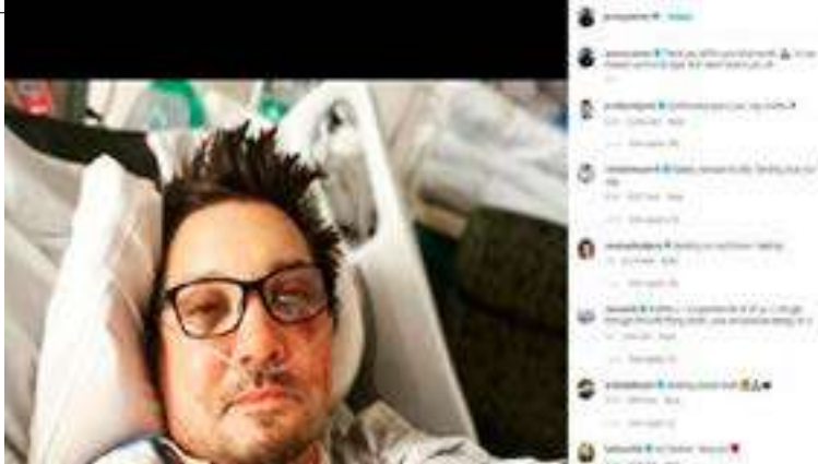
A screen grab shows a selfie of actor Jeremy Renner on a hospital bed, posted on Instagram with a caption reading, "Thank you all for your kind words. I'm too messed up now to type. But I send love to you all" in this picture obtained from social media.