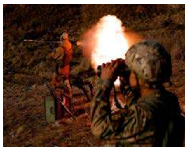
A soldier from Carpathian Sich international battalion fires an RPG while conducting maneuvers near the front line, as Russia's attack on Ukraine continues, near Kremenna, Ukraine.