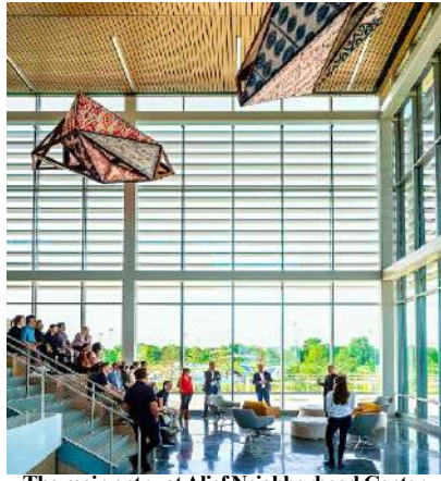
The main entry at Alief Neighborhood Center features bleacher seating, expansive views of the park, and artwork from the Red Thread Collective.

Key Point The New Alief Neighborhood Center Amenities Include A Skate Park, Health Center, and Library That Will Open Under One Innovative Roof