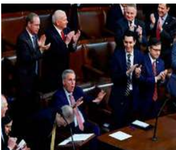
U.S. House Republican leader Kevin McCarthy reacts to the cheers of his Republican colleagues as he is reintroduced as a Republican candidate for a second round of voting in the race to be the next Speaker of the House during a vote in the House Chamber on the first day of the 118th Congress at the U.S. Capitol in Washington.