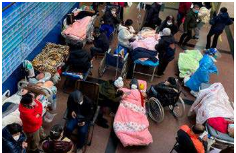
Patients lie on beds and stretchers in a hallway in the emergency department of a hospital, amid the coronavirus disease outbreak in Shanghai, China.