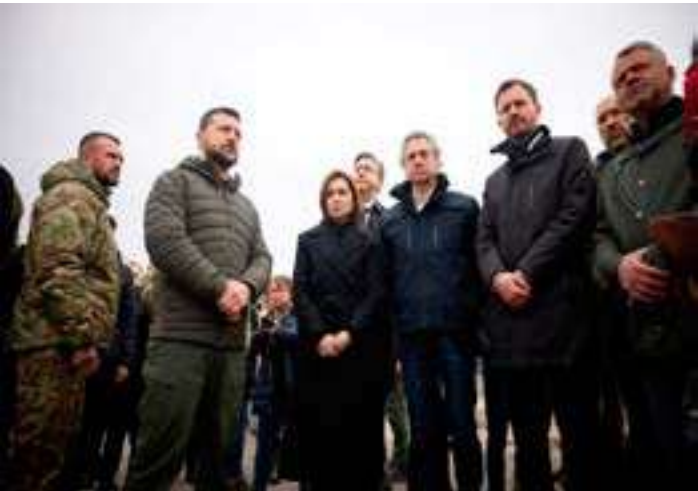
Slovenia's Prime Minister Robert Golob, Ukraine's President Volodymyr Zelenskyy, Moldovan President Maia Sandu, Croatian Prime Minister Andrej Plenkovic and Slovakian Prime Minister Eduard Heger visit the town of Bucha marking the first anniversary of its liberation, March 31.