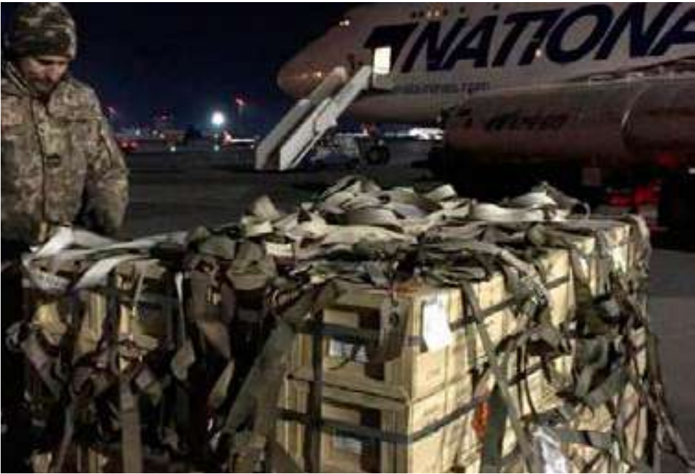
Military aid, delivered as part of the United States' security assistance to Ukraine, is unloaded from a plane at the Boryspil International Airport outside Kyiv, Ukraine February 13, 2022.