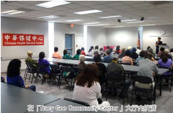
在「Tracy Gee Community Center」大厅内挤满了来参加庆生会的保健中心会友们