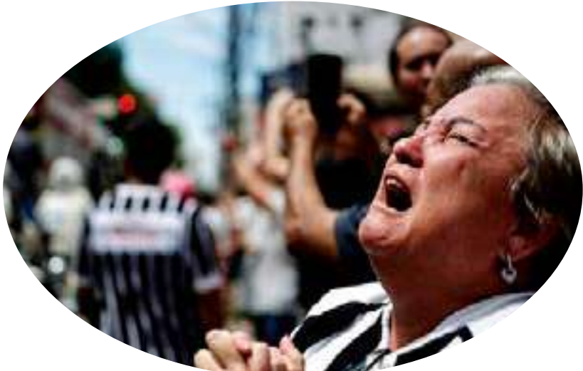
A mourner reacts as Brazilian soccer legend Pele is transported by the fire department, from his former club Santos' Vila Belmiro stadium, in Santos, Brazil.