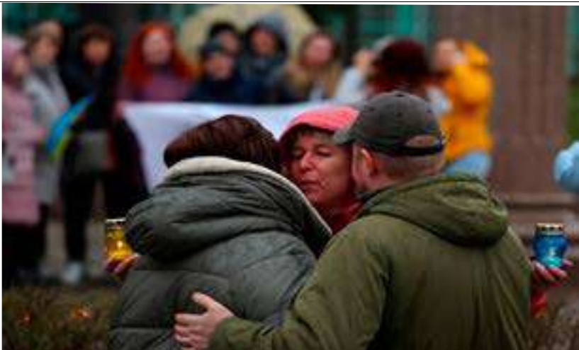
People attend a vigil marking the first anniversary of the liberation of the town of Bucha, outside Kyiv, Ukraine, March 31. Residents in Bucha speak of the deep psychological wounds left by the occupation and say it would take generations to get over it. Some buildings remain battered in the town and a scrapyard is full of cars and military vehicles destroyed during last year's fighting.