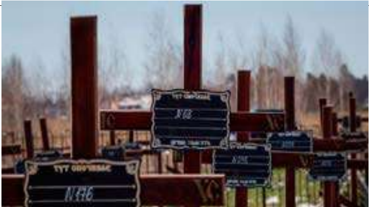
Graves of unidentified people killed by Russian soldiers during the occupation of Bucha are seen at the town's cemetery in Bucha, Ukraine, March 30.