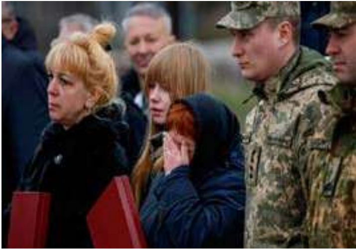
Ukrainian service members and relatives of the fallen defenders react as they attend a ceremony to mark the first anniversary of the liberation of Bucha, outside Kyiv, Ukraine, March 31.