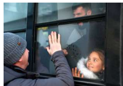
A volunteer (L) bids farewell to Ukrainians who are seeking asylum as they gather on a bus on their way to the El Chaparral port of entry, before entering the United States amid the Russian invasion of Ukraine, on April 6, 2022 in Tijuana, Mexico.