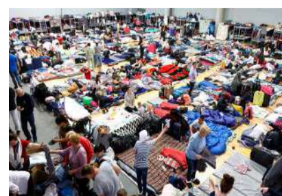
Ukrainians who are seeking asylum gather in a city government shelter for Ukrainians, amid the Russian invasion of Ukraine, on April 6, 2022 in Tijuana, Mexico.