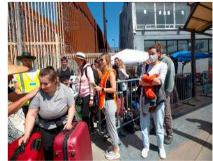
U.S. Customs and Border Protection allow Ukrainian refugees to enter the U.S. at the San Ysidro Port of Entry in Tijuana, Baja California as two Russian citizens watch on April 5, 2022.