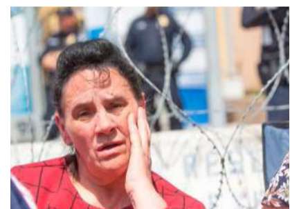
Ukrainian refugees wait for Customs and Border Protection authorities to allow them to enter the USA at the San Ysidro Port of Entry in Tijuana, Baja California, on April 5, 2022.