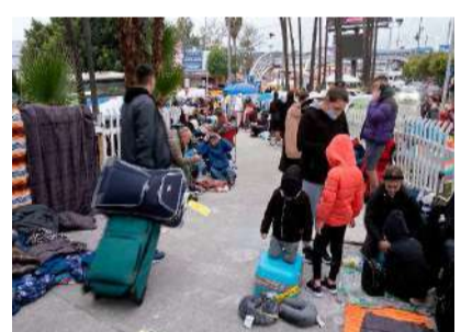
Ukrainians wait for processing by US authorities at the Texas-Mexico border.