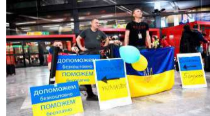
Volunteers with signs welcome Ukrainian refugees as they arrive at the Tijuana airport to help them on their journey to the United States after fleeing the war in Ukraine, in Tijuana, Baja California state, Mexico on April 8, 2022.