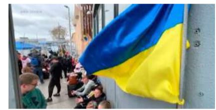
The Ukrainian flag hung on the side of a building offers solace to some.