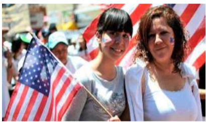
As part of its immigration crackdown, the Trump

June 30, 2024 — whichever date comes later. The June 30, 2024, extension also applies to certain Haitian and Sudanese immigrants, but they are also eligible to apply for work permits and deportation protections under expansions of TPS programs for Haiti and Sudan announced by the Biden administration that are not affected by the litigation in federal court. "DHS is well aware of the importance of Temporary Protected Status (TPS) in providing stability to people's lives," a DHS spokesperson said in a statement to CBS News on Thursday. As of the end of 2021, 241,699 Salvadorans, 76,737 Hondurans, 14,556 Nepalis and 4,250 Nicaraguans were enrolled in the TPS program, according to U.S. Citizenship and Immigration Services (USCIS) data. TPS allows beneficiaries to live and work in the country without fear of deportation, but it does not provide them a path to permanent residency or citizenship. Those who lose their TPS protections could become eligible for deportation, unless they apply for, and are granted, another immigration benefit.