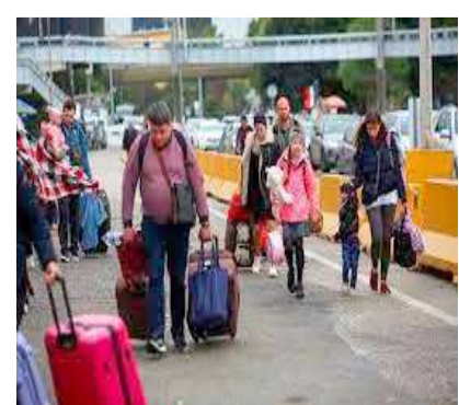
Ukrainian families gather their belongings hoping to cross the border into the U.S.