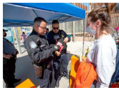
U.S. Customs and Border Protection stop a Russian citizen from entering the U.S. at the San Ysidro Port of Entry in Tijuana, Baja California on April 5, 2022.