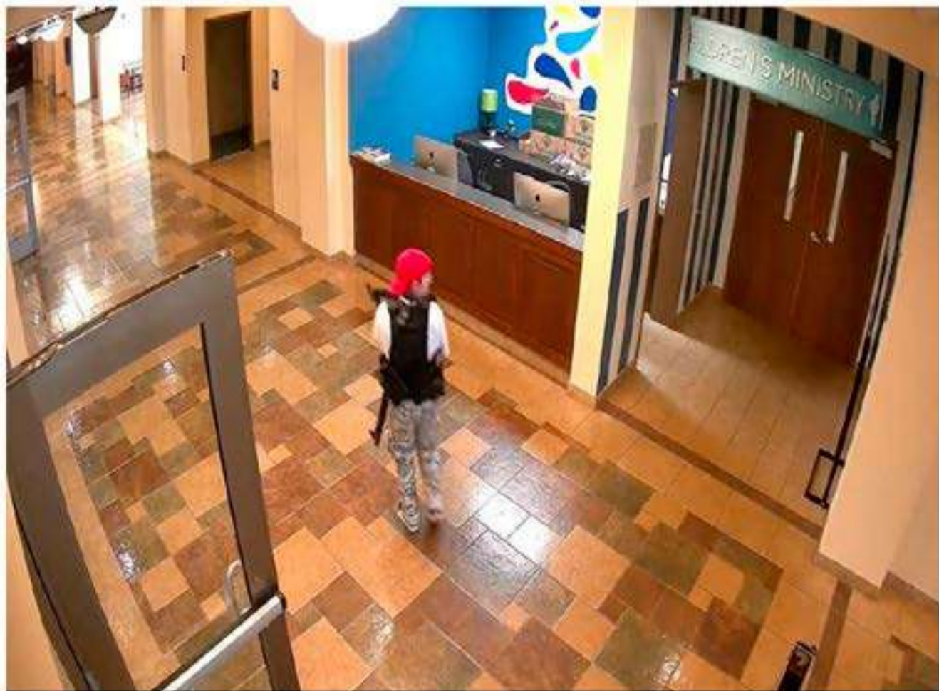
A still image from surveillance video shows what the Metropolitan Nashville Police Department describe as mass shooting suspect Audrey Elizabeth Hale, 28, entering The Covenant School carrying weapons in Nashville, Tennessee, U.S. March 27, 2023.