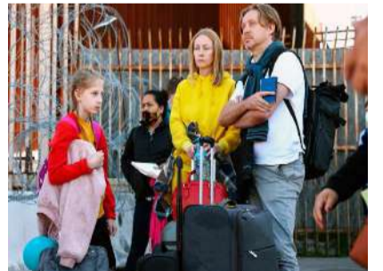
A Ukrainian family contemplates the future in a new country.