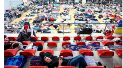
Ukrainians who are seeking asylum in the United States gather in a city government shelter for Ukrainians, amid the Russian invasion of Ukraine, on April 6, 2022 in Tijuana, Mexico. Authorities opened the nearby El Chaparral port of entry today solely for the processing of Ukrainian asylum-seekers. U.S. authorities are allowing Ukrainian refugees to enter the U.S. at the Southern border in Tijuana with permission to remain in the country on humanitarian parole for one year.