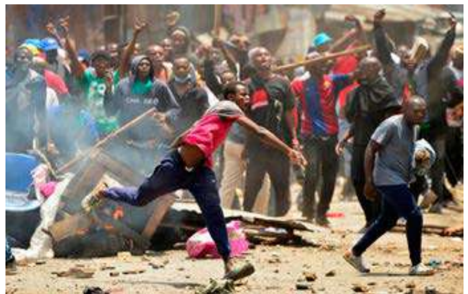
Supporters of Kenya's opposition leader Raila Odinga of the Azimio La Umoja (Declaration of Unity) One Kenya Alliance, throw stones at riot police officers as they participate in a nationwide protest over cost of living and President William Ruto's government in Mathare settlement of Nairobi, Kenya.