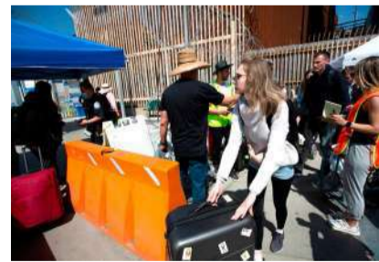
U.S. Customs and Border Protection allow Ukrainian refugees to enter the U.S. at the San Ysidro Port of Entry in Tijuana, Baja California on April 5, 2022.