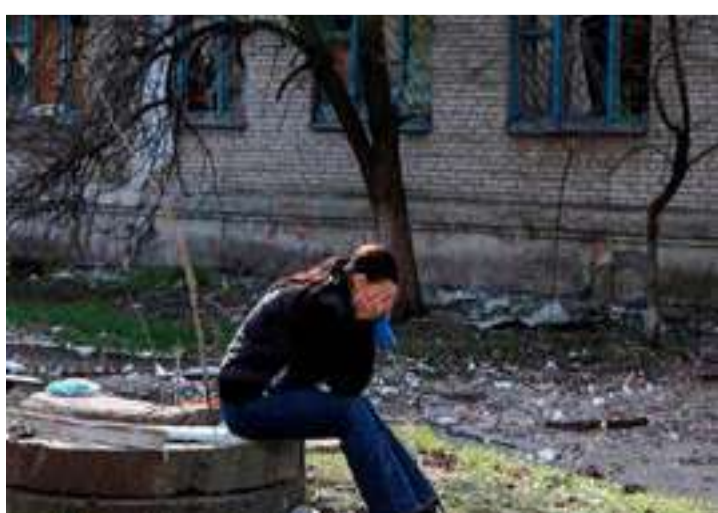
A woman reacts in the aftermath of deadly shelling of an army office building, amid Russia's attack, in Sloviansk, Ukraine.