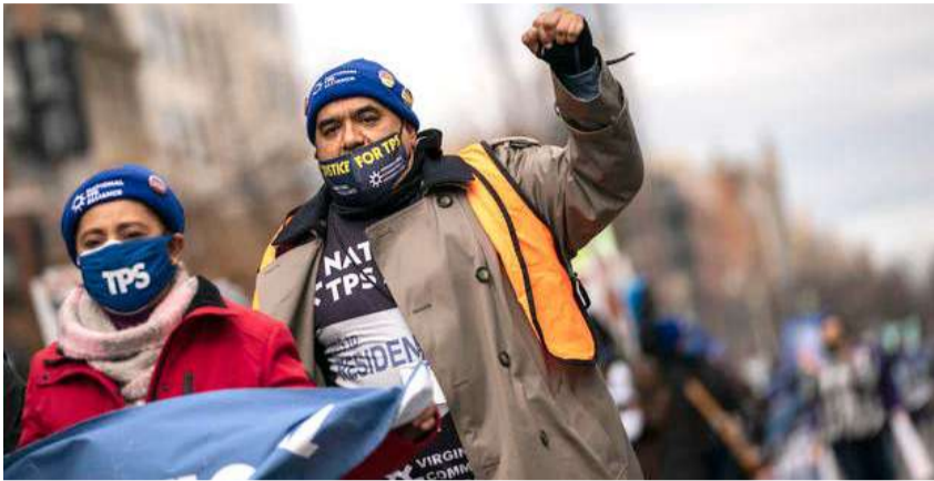
Activists and immigrants with temporary protected status march toward the White House on Feb. 23, 2021, in Washington, D.C., in a call for Congress and the Biden administration to pass immigration reform legislation.