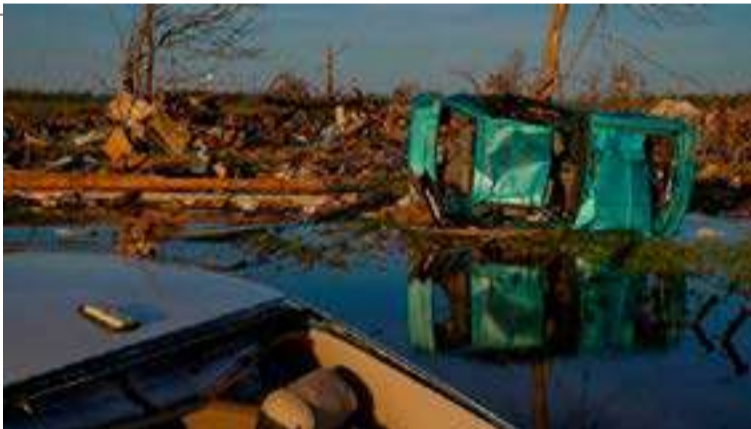
Debris litters a neighborhood after thunderstorms spawning high straight-line winds and tornadoes ripped across the state in Rolling Fork, Mississippi.