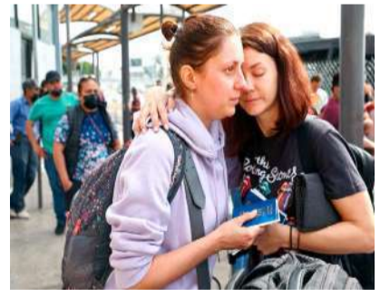
Family members offer each other comfort in the uncertain time.