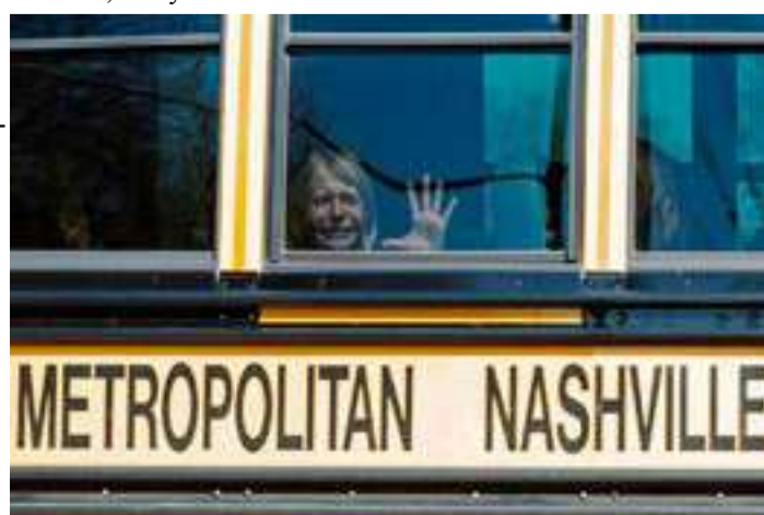
A still image from surveillance video shows what the Metropolitan Nashville Police Department describe as mass shooting suspect Audrey Elizabeth Hale, 28, entering The Covenant School carrying weapons in Nashville, Tennessee, U.S. March 27, 2023.