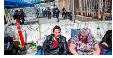
Two Ukrainian women sit and wait for U.S. Customs

and Border Protection to allow them to enter the U.S. at the San Ysidro Port of Entry in Tijuana, Baja California on April 5, 2022.