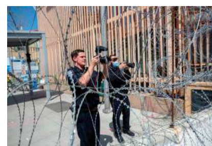
U.S. Customs and Border Protection officers take photos of Ukrainian refugees as they await to be allowed to enter the U.S. by Customs and Border Protection at the San Ysidro Port of Entry in Tijuana, Baja California on April 5, 2022.