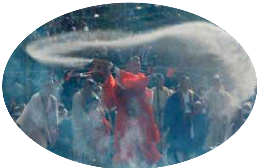
A Buddhist monk throws salt on a large bonfire of wood and Japanese cypress leaves, at the fire-walking festival, called Hiwatari matsuri in Japanese, at Mt. Takao in Tokyo, Japan, March 12.