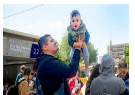
A father holds his son up to see the massive group of his fellow countrymen scattered together in a foreign land.