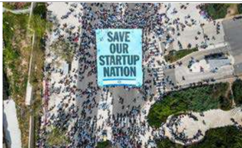
An aerial view shows protesters attending a demonstration after Israeli Prime Minister Benjamin Netanyahu dismissed the defense minister and his nationalist coalition government presses on with its judicial overhaul, in Jerusalem.