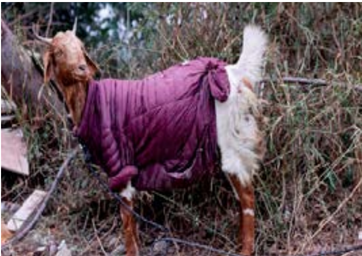
A goat wearing a jacket is seen on a farm on a cold winter morning in New Delhi, India, January 3, 2023.