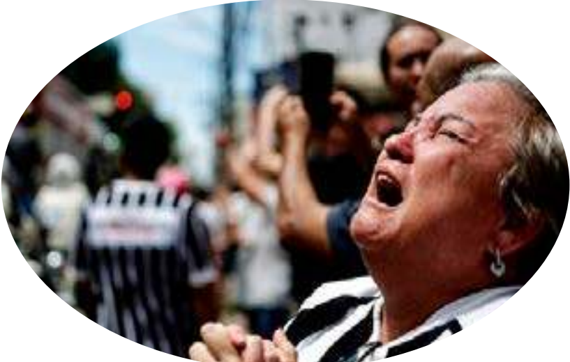
A mourner reacts as Brazilian soccer legend Pele is transported by the fire department, from his former club Santos' Vila Belmiro stadium, in Santos, Brazil.