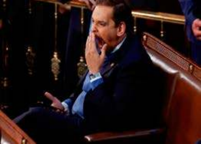
Newly elected freshman Rep. George Santos (R-NY), embroiled in a scandal over his resume and claims made on the campaign trail, yawns behind his hand as he sits alone in the House Chamber, on the first day of the 118th Congress at the U.S. Capitol in Washington.