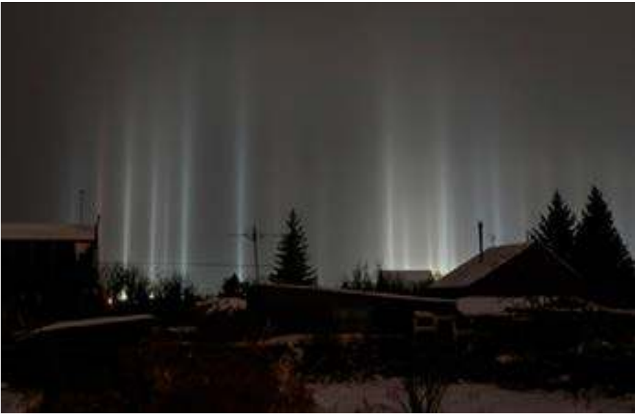
Pillars of light, which are optical atmospheric phenomena, beam up from the ground into the sky behind residential buildings in Omsk, Russia.