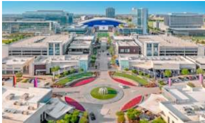
‘Smart City,’ The “Star” Corporate Destination In Frisco, Texas, Home Of The Dallas Cowboys

McAfee is the latest corporate addition to the city, and McAfee said it is committed to partnering with the community, local students, and local tech startups to expand awareness around STEM through programs such as McAfee’s Online Safety Program for Kids. The program seeks to educate children about online protection and inspire them to pursue careers in STEM and cybersecurity.