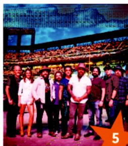
ZAC BROWN BAND