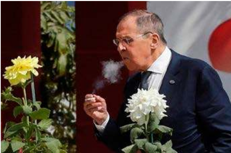
Russian Foreign Minister Sergei Lavrov smokes a cigarette on the sidelines of G20 foreign ministers' meeting in New Delhi, India.