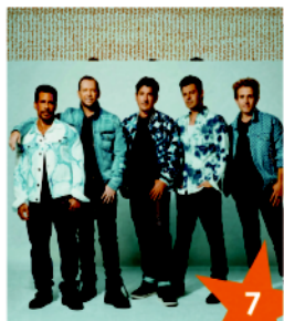
NEW KIDS ON THE BLOCK