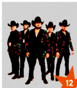
LA FIERA DE OJINAGA