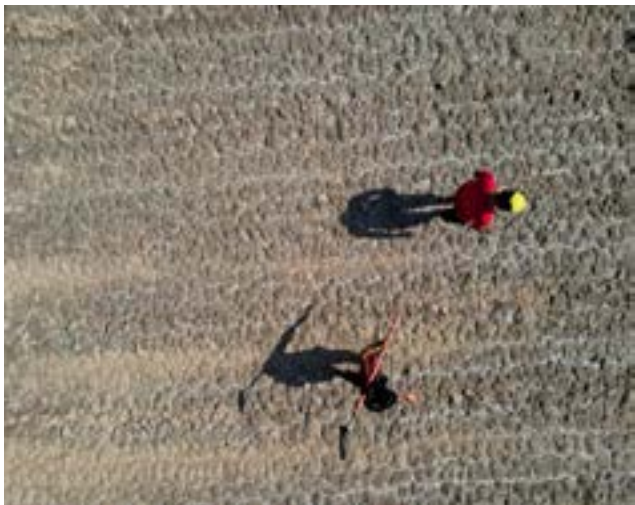
An aerial view shows Iraqi farmers walking on a dry ground during low water levels in Amara, Iraq.