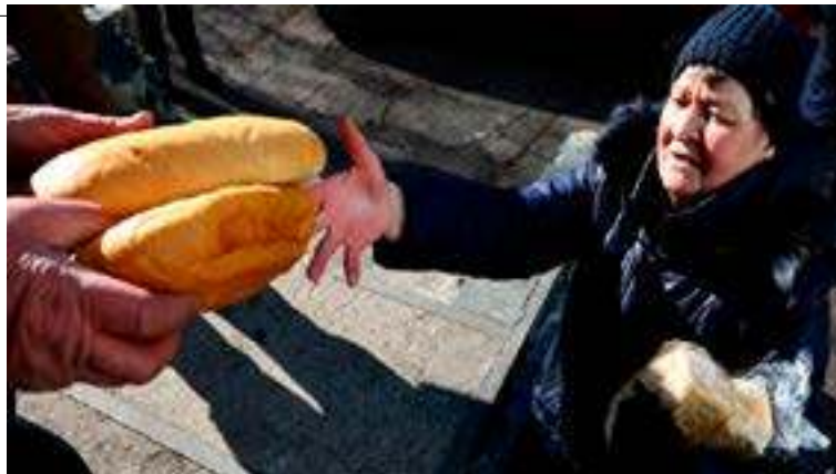
A resident receives bread from a food distribution amid Russia's attack on Ukraine, in Chasiv Yar, Donetsk region, Ukraine.