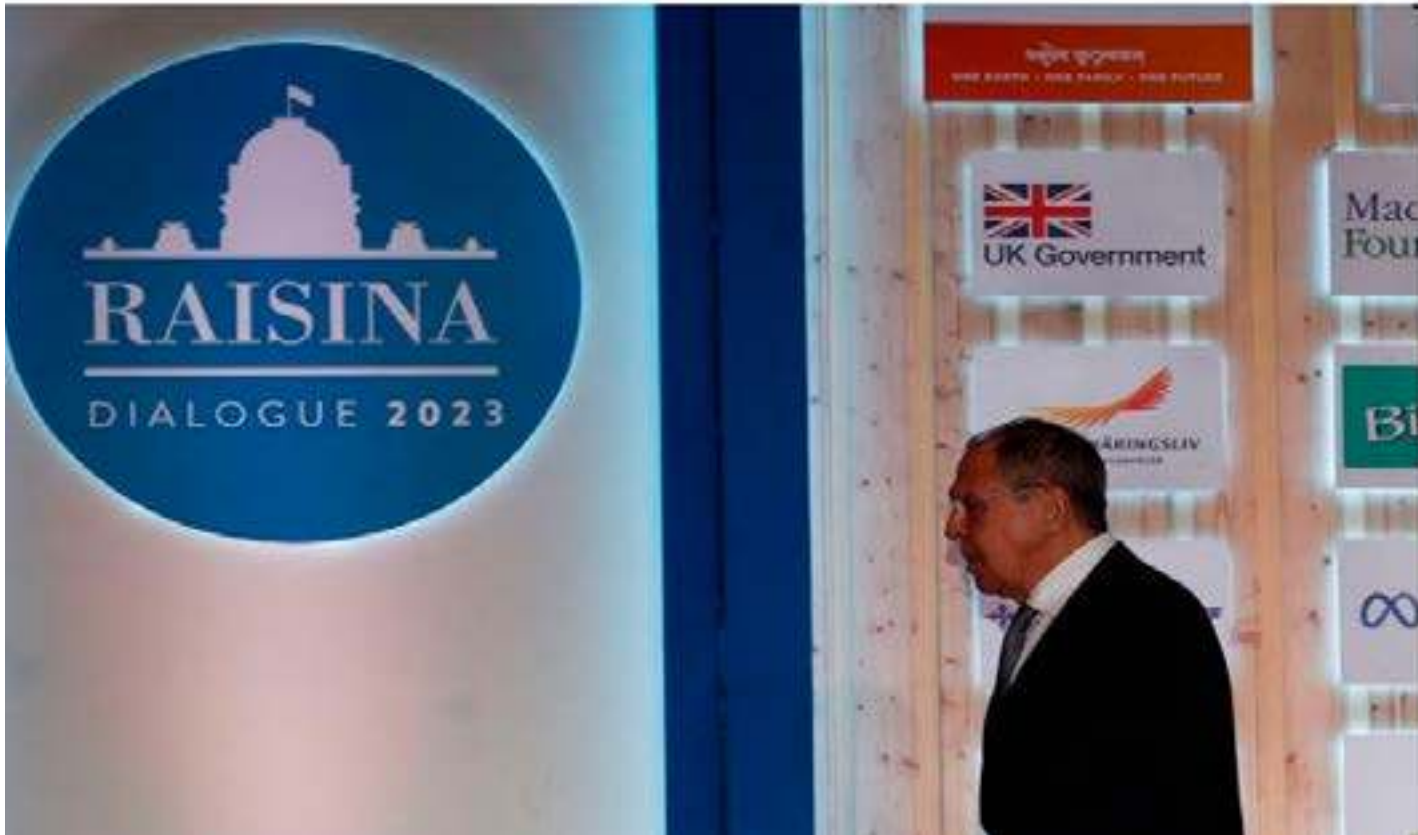
Russian Foreign Minister Sergei Lavrov attends the Raisina Dialogue 2023, in New Delhi, India, March 3, 2023.

Russians pound access routes to Ukraine's besieged Bakhmut Greece train crash: families of victims grieve as protests grow Turkey's opposition alliance splits over election candidate Portuguese Church struggles to adopt concrete measures to tackle child sexual abuse Canada will 'never tolerate' foreign interference, minister tells China Lavrov also said the question of when Russia will negotiate an end to the war should be put to Ukraine President Volodymyr Zelensky.