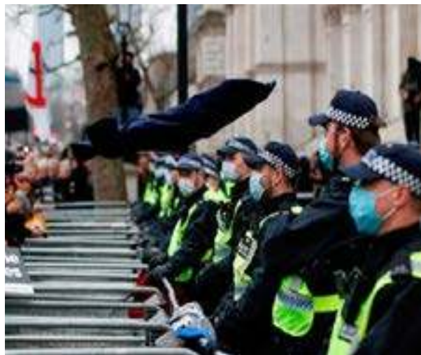
Police officers stand as NHS staff and others protesting against coronavirus vaccine rules throw NHS uniforms at the entrance to Downing Street in London, Britain.