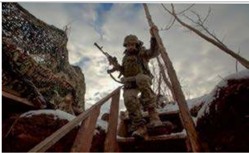
A service member of the Ukrainian armed forces walks at combat positions near the line of separation from Russian-backed rebels near Horlivka in the Donetsk region, Ukraine.