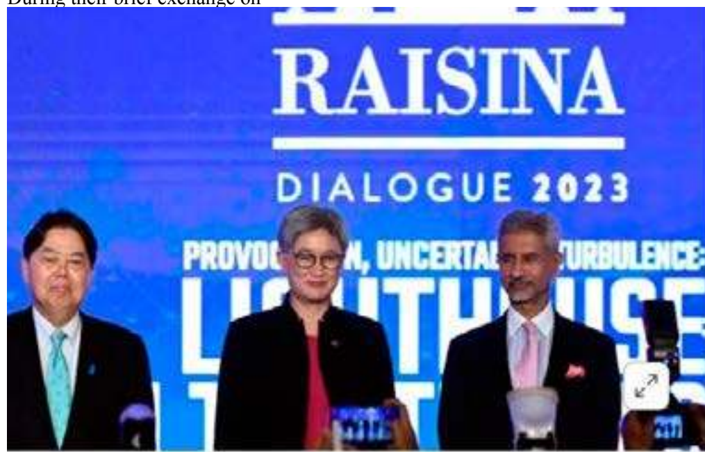
(L-R) US Secretary of State Antony Blinken, Japanese Foreign Minister Yoshimasa Hayashi, Australian Foreign Minister Penny Wong and Indian Foreign Minister Subrahmanya Jaishankar attend a Quad Ministers' panel at the Taj Palace Hotel in New Delhi, India on March 3, 2023.

the sidelines of the G20 meeting on Thursday, Blinken told Lavrov to end the war and urged Moscow to reverse its suspension of the New START (Strategic Arms Reduction Treaty) on nuclear weapons.