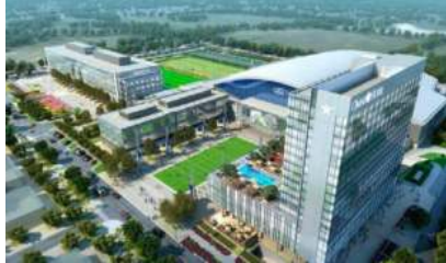
Rendering of the new Business and Innovation Hub at The Star in Frisco.