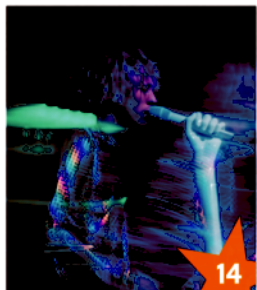
MACHINE GUN KELLY