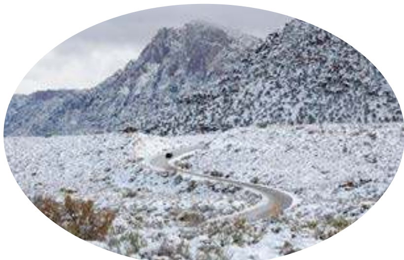
A vehicle makes its way through a snowy landscape along the Red Rock Canyon National Conservation Area's scenic loop drive in Clark County near Las Vegas, Nevada.