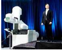
Musk discussing a Neuralink device during a live demonstration in 2020

In 2016, Musk co-founded Neuralink, a neurotechnology startup company to integrate the human brain with artificial intelligence (AI) by creating devices that are embedded in the human brain to facilitate its merging with machines. The devices will also reconcile with the latest improvements in artificial intelligence to stay updated. Such improvements could enhance memory or allow the devices to communicate with software more effectively.