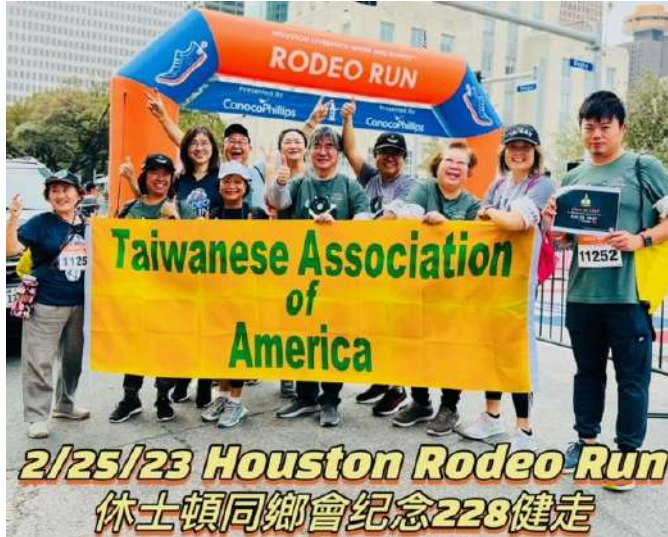
Houston Rodeo Run 休士頓同鄉會紀念 228 健走

健走之後也配合著牛仔節大遊行。牛仔、傳統的馬隊、大蓬車隊 wagon，是牛仔節遊行的重頭戲，紀念當年人們從東部移民德州的歷史。另外也有獨具風格的德州墨西哥裔馬隊，濃濃的老墨風情特別吸睛。從臺灣來的美南大專院校聯合校友會，也有花車參加遊行。我們臺美人從臺灣到德州，希望臺灣牛仔們以後也能成為德州歷史驕傲的一部分。