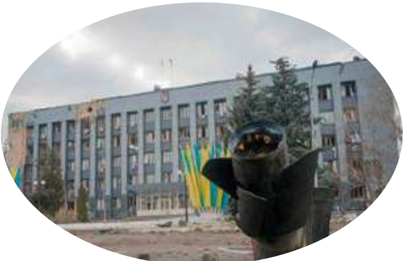
A part of a rocket is seen near a building damaged by a Russian military strike, amid Russia's attack on Ukraine, in the front line city of Bakhmut, Ukraine February 21.