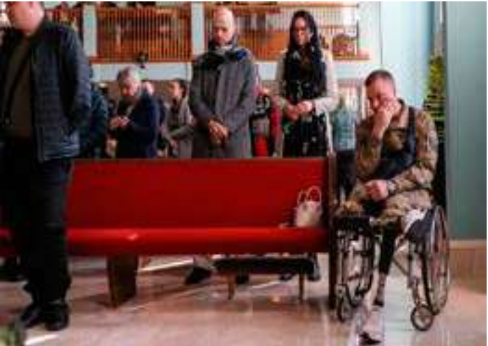
A man who served in the Ukrainian military attends a memorial service for those who have fallen during the first year of Russia's invasion of Ukraine, at St. Andrew Ukrainian Orthodox Cathedral in Silver Spring, Maryland.