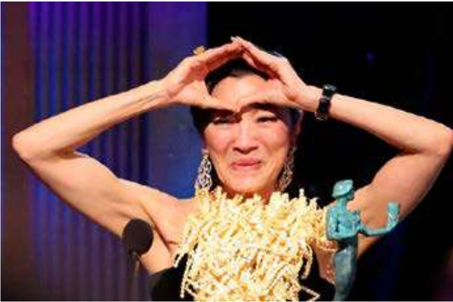
Michelle Yeoh accepts the Outstanding Performance by a Female Actor in a Leading Role for "Everything Everywhere All at Once" during the 29th Screen Actors Guild Awards at the Fairmont Century Plaza Hotel in Los Angeles, California.