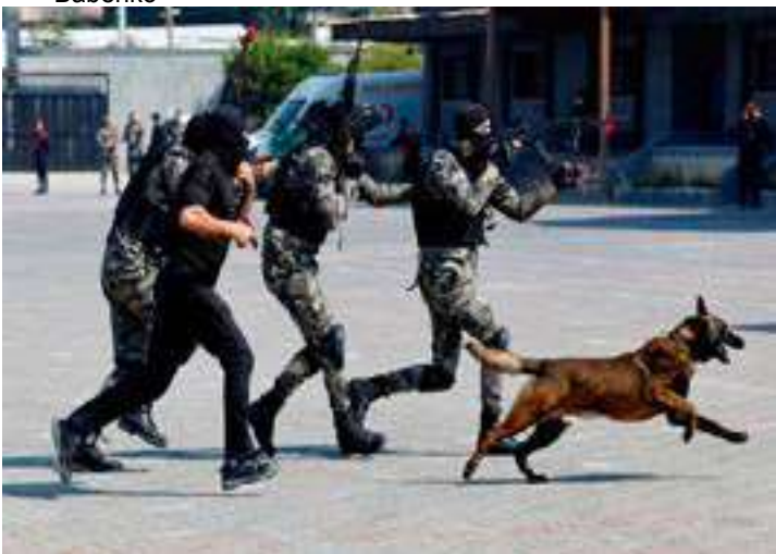
Members of Palestinian security forces loyal to Hamas, take part in a graduation ceremony in Gaza City.