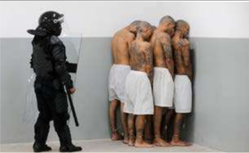
A prison agent guards gang members as they are processed at their arrival after 2000 gang members were transferred to the Terrorism Confinement Center, according to El Salvador's President Nayib Bukele, in Tecoluca, El Salvador.