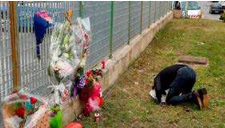
A Muslim man prays next to tributes laid outside PalaMilone sports hall, where victims' coffins are kept in the aftermath of a deadly migrant shipwreck, in Crotona, Italy.