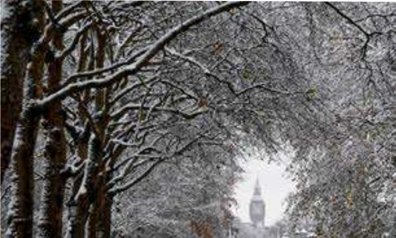
Trees are covered in snow in front of The Elizabeth Tower, more commonly known as Big Ben, as cold weather continues, in London.