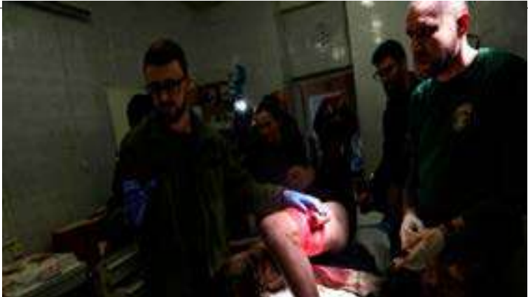
Medics from the First Volunteer Mobile Hospital unit treat soldiers transported from the frontlines, as Russia's attack on Ukraine continues, in the Donbas region of the Ukraine.