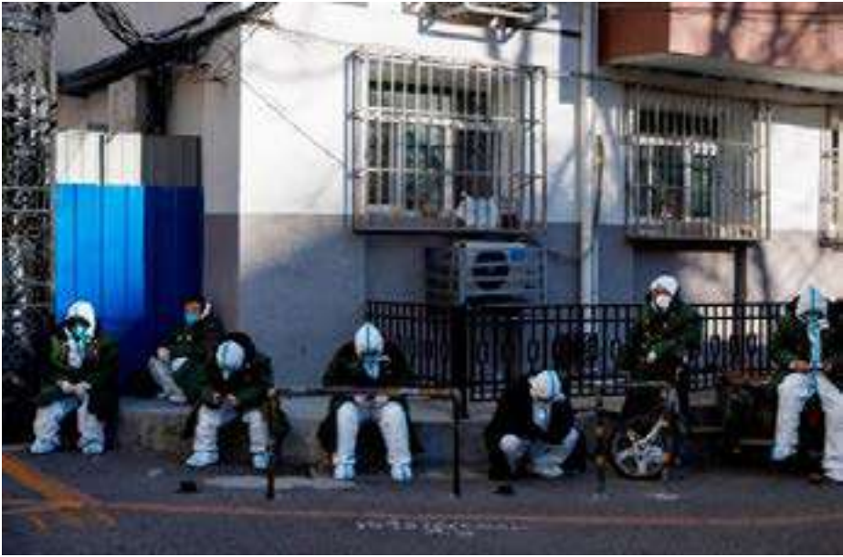
Police secures the area after 25 suspected members and supporters of a far-right group were detained during raids across Germany, in Berlin, Germany, December 7.