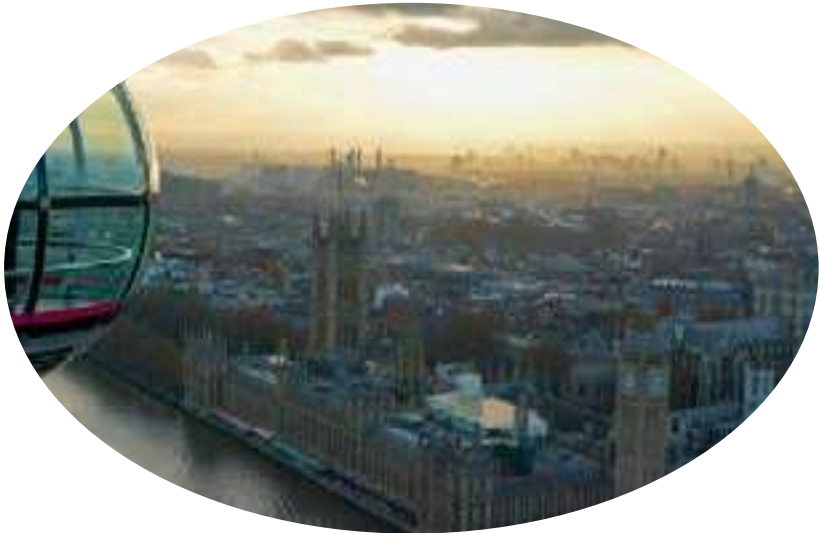
A view of the Palace of Westminster seen from the London Eye, in London, Britain.