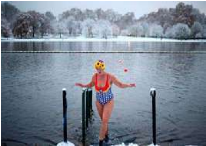
A swimmer dips her feet in Serpentine lake, as cold weather continues, in London, Britain.