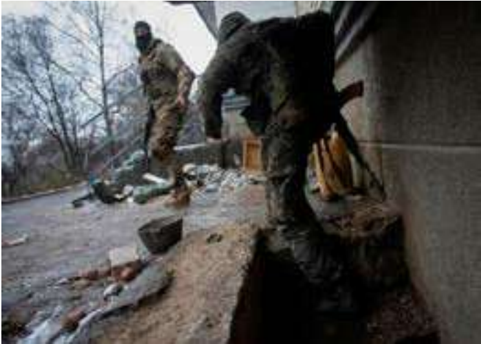
Ukrainian service members are seen in Bakhmut, as Russia's attack on Ukraine continues, in Donetsk region, Ukraine.