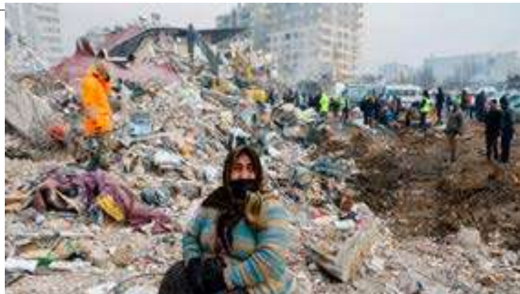
A woman reacts at the site of a collapsed building as the search for survivors continues, in the aftermath of a deadly earthquake in Kahramanmaraş, Turkey.