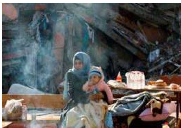
A woman holding a child sits by a collapsed building as search for survivors continues, in the aftermath of a deadly earthquake in Hatay, Turkey.