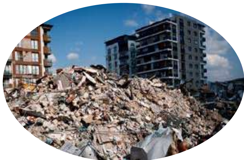
A woman reacts at the site of a collapsed building as the search for survivors continues, in the aftermath of a deadly earthquake in Kahramanmaraş, Turkey.