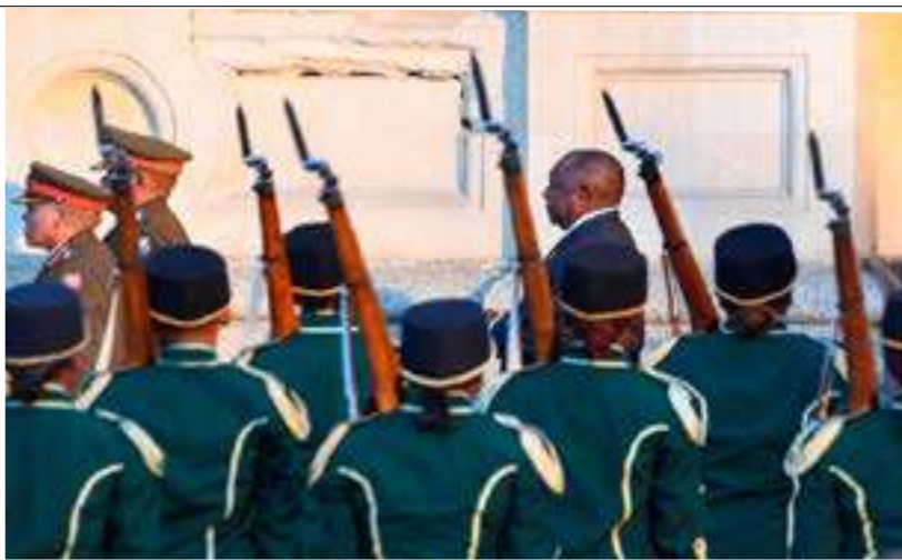
South African President Cyril Ramaphosa walks past the guard of honour upon his arrival for the 2023 state-of-the-nation address (SONA) at the Cape Town City Hall in Cape Town, South Africa. Rodger Bosch/Pool