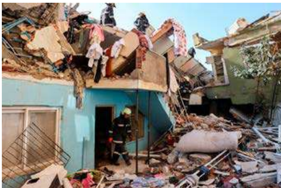
Rescuers work as search for survivors continues, in the aftermath of a deadly earthquake in Hatay, Turkey.