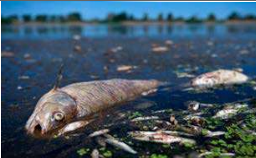
A dead fish lies on the bank of Oder River on the German-Polish border, in Brieskow-Finkenheerd, Frankfurt (Oder), Germany.