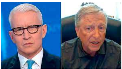
Bill Gates envisions a global health team to prevent the next pandemic.

Bill Gates wants world leaders to create a Global Epidemic Response and Mobilization team — or GERM, for short, to help prevent future pandemics. In a video interview from the Kirkland offices of his private investment firm, he said that for an estimated $1 billion a year, with the U.S. likely chipping in $250 million, the team would be "the best bargain you'll ever see."