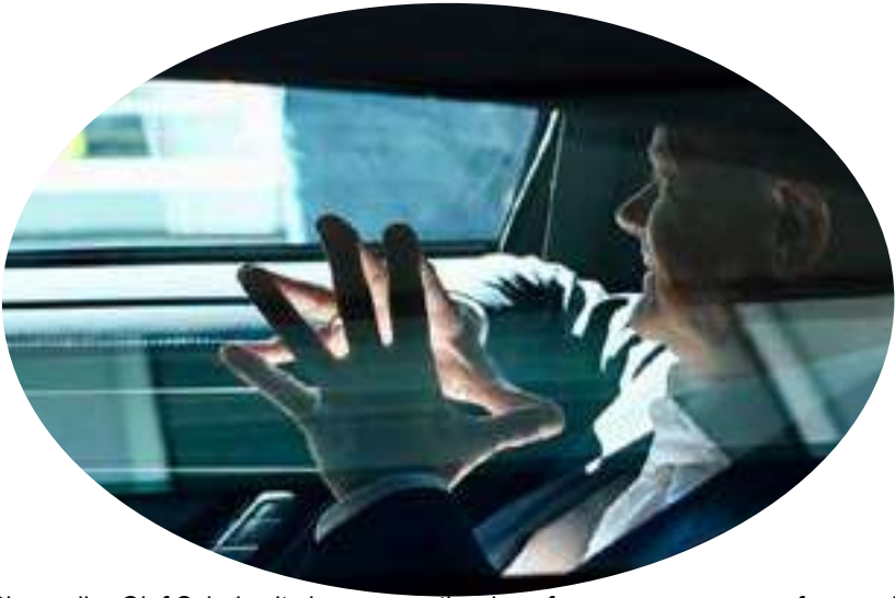
German Chancellor Olaf Scholz sits in a car on the day of a summer news conference in Berlin, Germany.