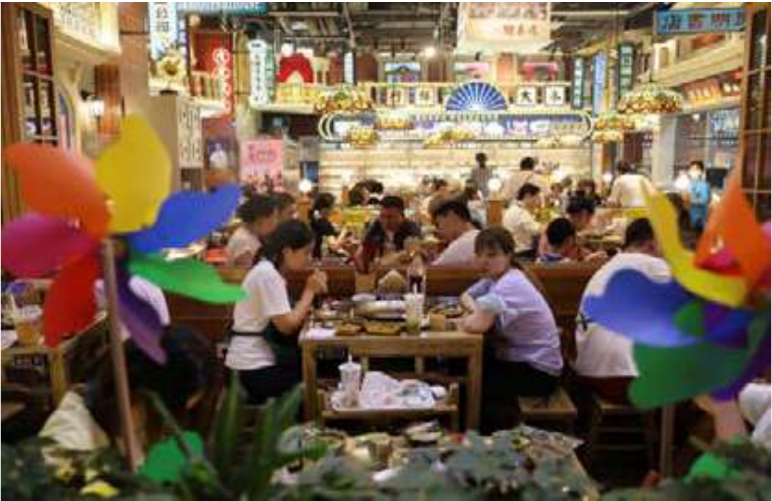
Customers dine at a restaurant in a shopping area in Beijing, China July 25, 2022.

"(We should) seize the time window of the peak season for construction in the third quarter, improve work efficiency" and "help create jobs for local people nearby as much as possible," said a Friday statement of the meeting by the National Development and Reform Commission.