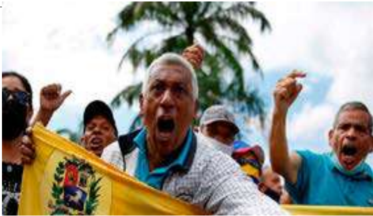
Teachers, health workers, retirees and public employees march in protest against the government of Venezuela's President Nicolas Maduro, in Caracas, Venezuela.