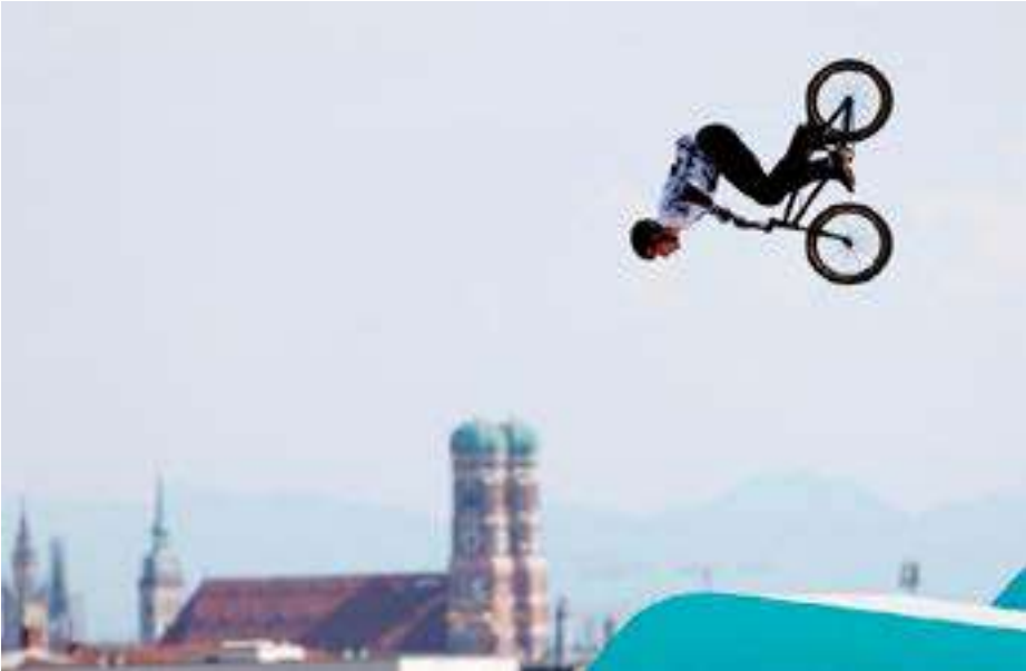
General view during the warm up before the Men's Park Qualification at the European Championships.