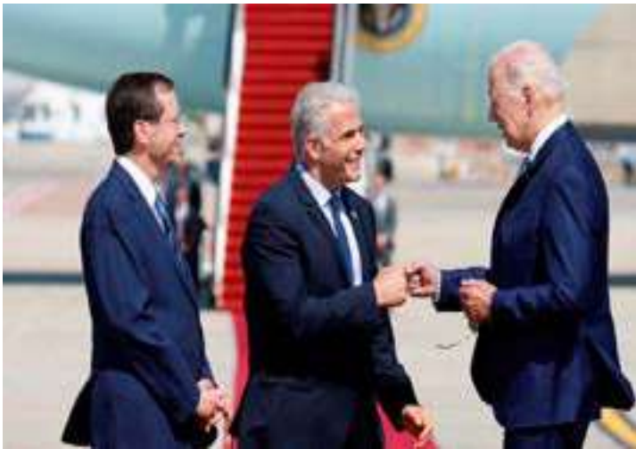
Israeli President Isaac Herzog looks on as Prime Minister Yair Lapid bumps fists with U.S. President Joe Biden during a welcoming ceremony at Ben Gurion International Airport in Lod, near Tel Aviv, Israel.