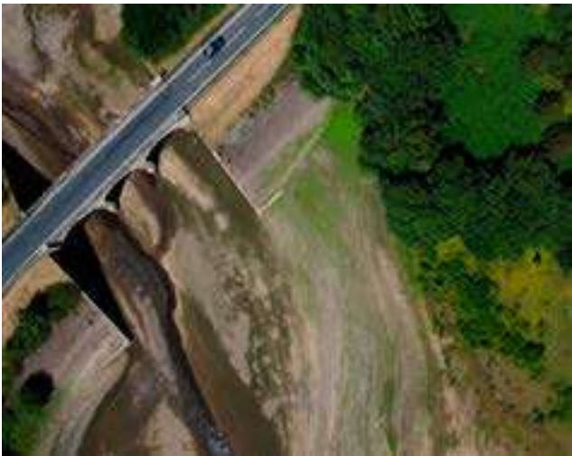
General view of Lindley Wood reservoir during the heatwave causing water levels to decline in Otley, Britain.