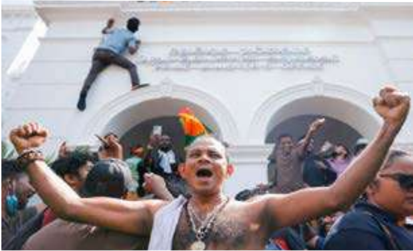
Demonstrators celebrate after they entered into Sri Lankan Prime Minister Ranil Wickremesinghe's office during a protest demanding for his resignation, after President Gotabaya Rajapaksa fled, amid the country's economic crisis, in Colombo, Sri Lanka.