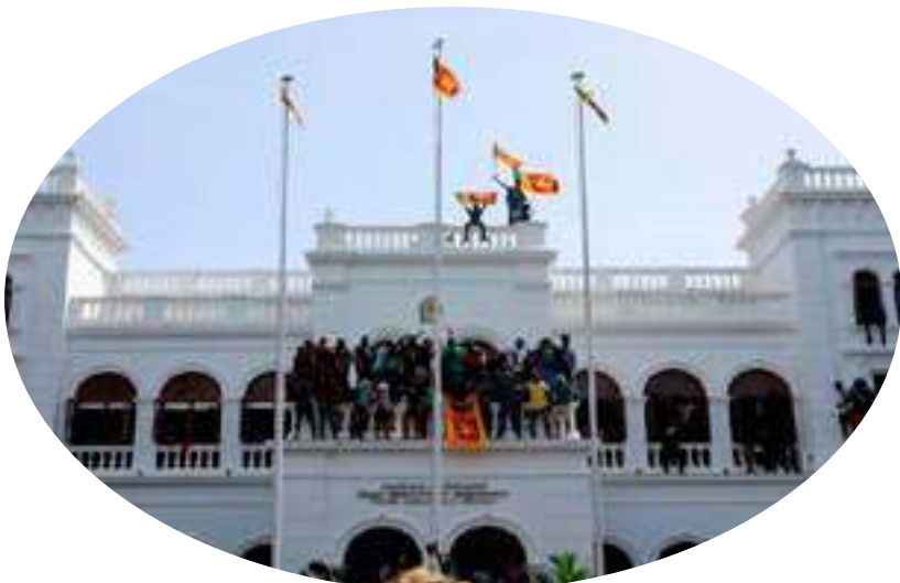
Protestors hold Sri Lankan flags as they stand on top of the office of Sri Lanka's Prime Minister Ranil Wickremesinghe, amid the country's economic crisis, in Colombo, Sri Lanka.