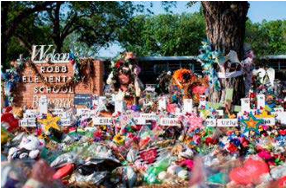
Privacy barriers and bike racks maintain a perimeter at a memorial outside Robb Elementary School, after a video was released showing the May shooting inside the school in Uvalde, Texas.