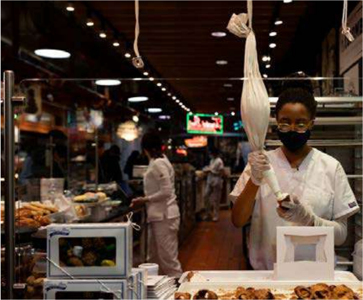
A worker fills a cannoli at a bakery at Reading Terminal Market after the inflation rate hit a 40-year high in January, in Philadelphia, Pennsylvania, U.S. February 19, 2022.

The ongoing war in Ukraine, which has caused a