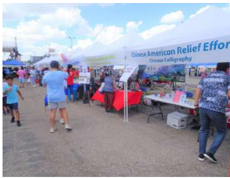
国庆游园会上虽气候炎热，各摊位前仍游人如织。