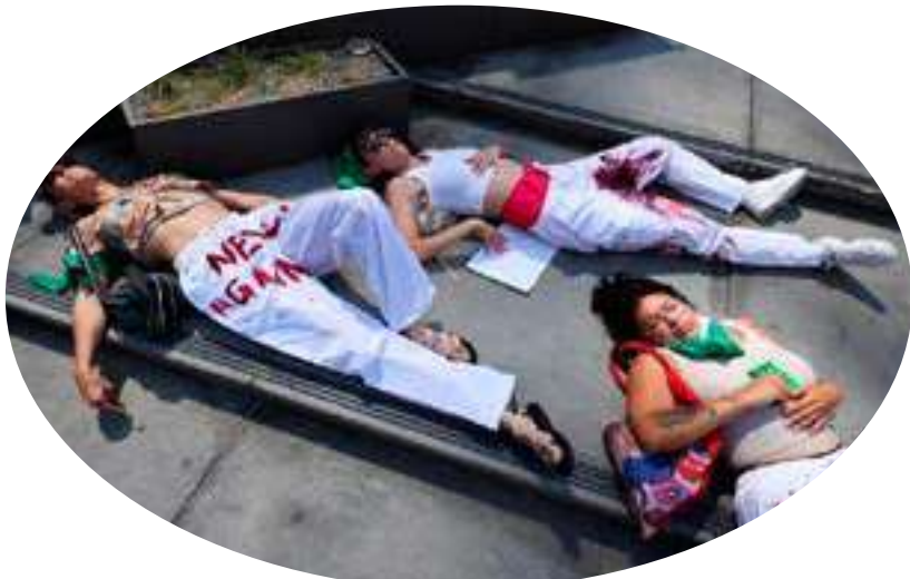
Abortion rights protesters demonstrate in Los Angeles, California, June 29.