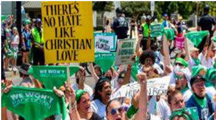
Abortion rights activists block an intersection near the United States Supreme Court in Washington, June 30.