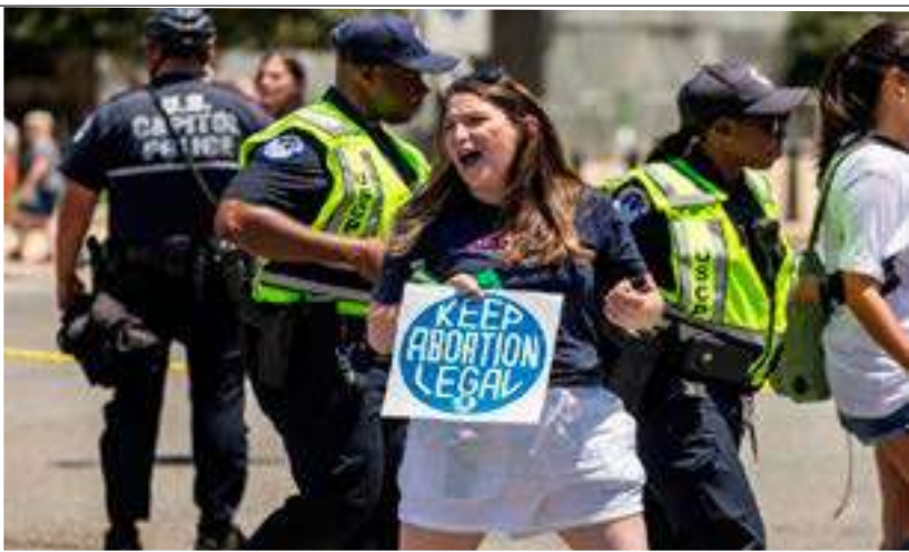
Abortion rights activists are detained by U.S. Capitol police after they blocked an intersection near the United States Supreme Court in Washington, June 30.