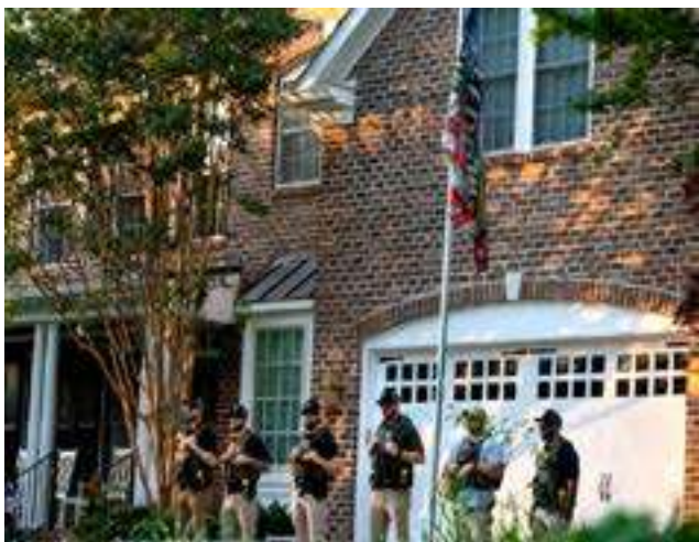
U.S. Marshals stand outside the home of United States Supreme Court Justice Samuel Alito as abortion activists march in the justice's neighborhood in Alexandria, Virginia, June 27.