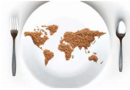
A grim outlook for 2022