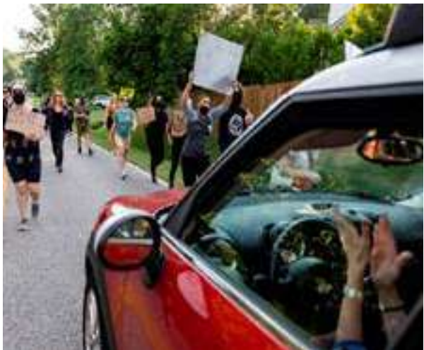
A woman claps in her car as abortion rights activists march to the home of United States Supreme Court Justice Samuel Alito in Alexandria, Virginia, June 27.