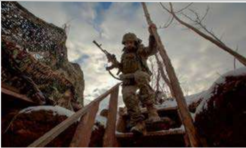
A service member of the Ukrainian armed forces walks at combat positions near the line of separation from Russian-backed rebels near Horlivka in the Donetsk region, Ukraine.