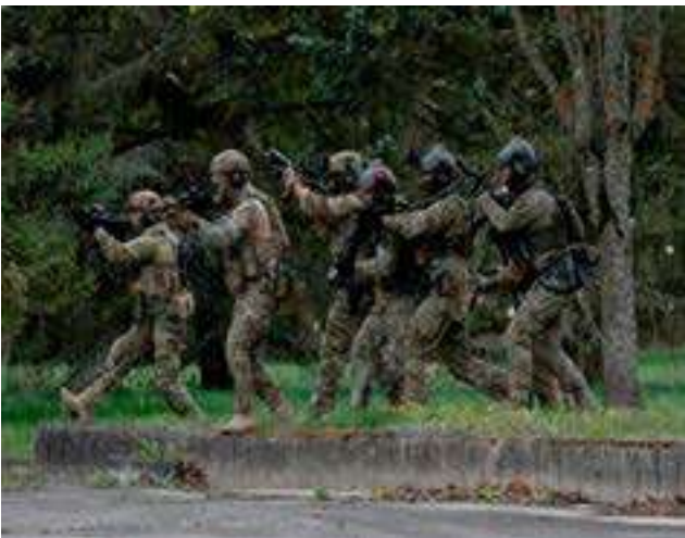
Soldiers participate in 'Flaming Sword' training carried out by NATO allied troops in Klaipeda, Lithuania, May 11.