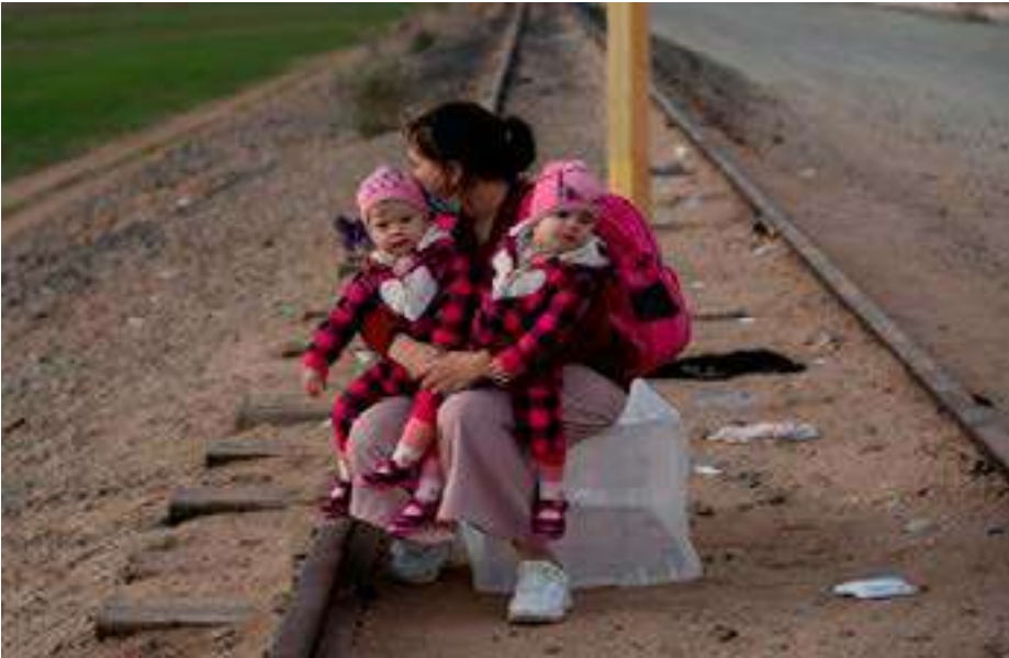
A migrant mother seeking asylum in the U.S. from Ukraine holds her twin daughters near the border fence while waiting to be processed by the U.S. border patrol after crossing the border from Mexico at Yuma, Arizona.