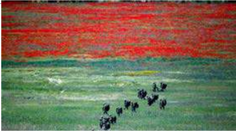
British soldiers participate in an exercise as NATO allied troops carry out Swift Response 22 exercises at Krivolak army base, North Macedonia, May 12, 2022.