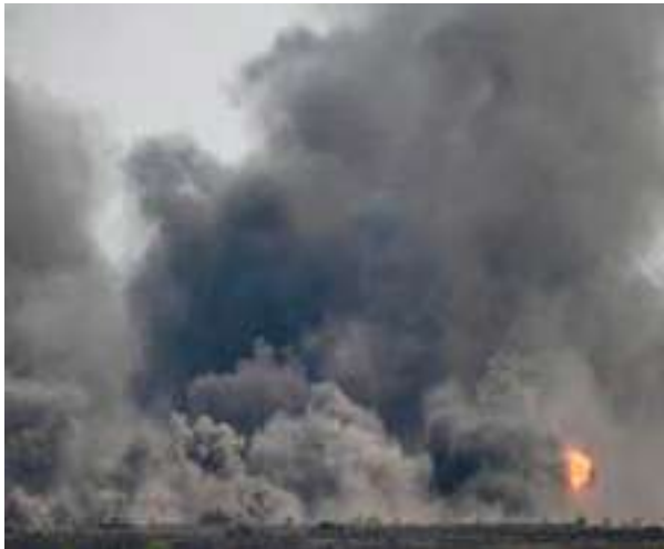
Smoke rises during training at a German army base on a NATO media day, in which up to 7,500 soldiers from 9 nations take part, in Munster, Germany, May 10.