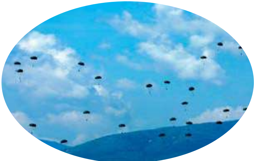
Italian paratroopers parachute after jumping from C-130 aircraft as NATO allied troops carry out Swift Response 22 exercises at Krivolak army base, North Macedonia, May 12.