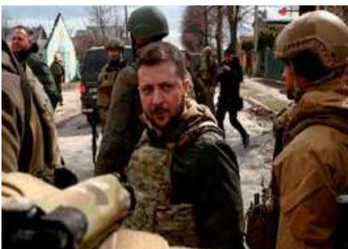
Ukraine's President Volodymyr Zelenskyy looks on as he is surrounded by Ukrainian servicemen as Russia's invasion of Ukraine continues, in Bucha, outside Kyiv, Ukraine, April 4.