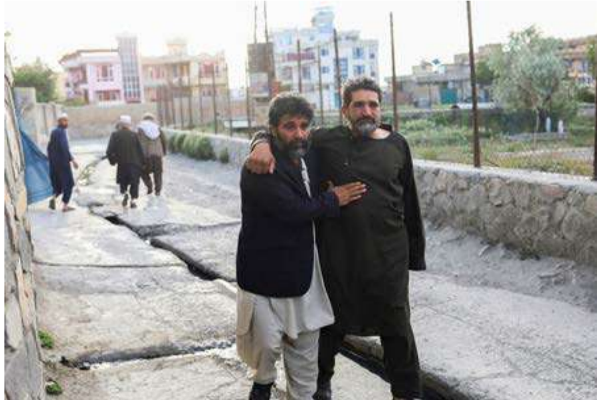
Afghan men flee near the site of explosions at Khalifa Sahib Mosque in Kabul, Afghanistan April 29, 2022.

Emergency Hospital in downtown Kabul said it was treating 21 patients and two were dead on arrival. A worker at another hospital treating attack patients said it had received 49 patients and around five bodies. Ten of the patients were in critical condition, the source added, and almost 20