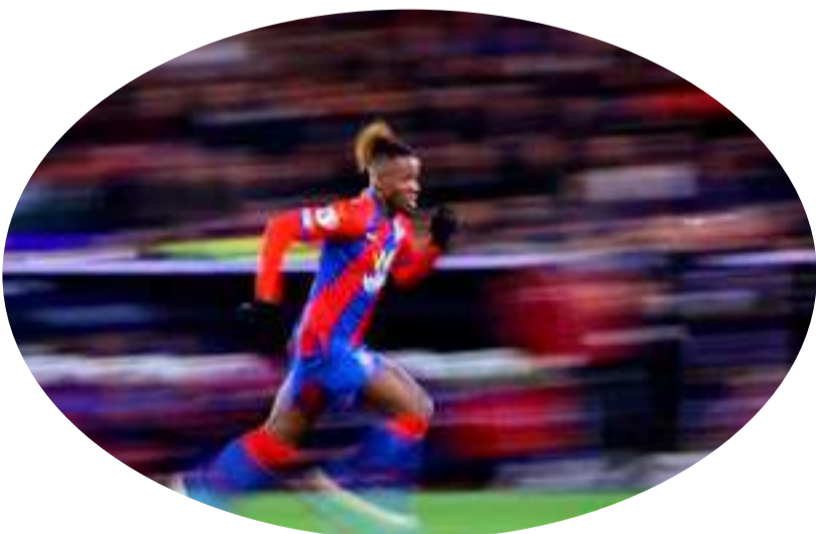
Crystal Palace's Wilfried Zaha in action during a Premier League match versus Arsenal at Selhurst Park, London, Britain, April 4.