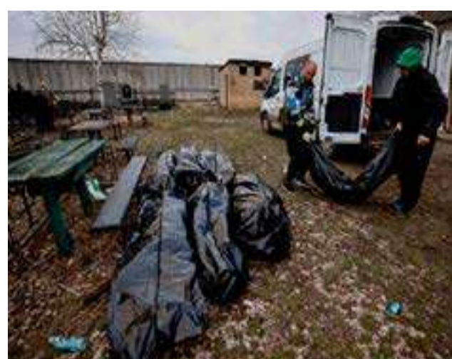
Volunteers unload from a van bags containing bodies of civilians after they collected them from the streets to gather them at a cemetery before they take them to the morgue in Bucha, in Kyiv region, Ukraine April 4.