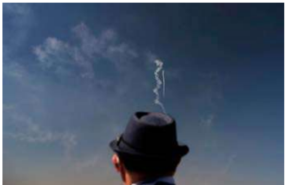
A Chilean Air Force's aerobatics team member performs ahead of the International Air and Space Fair (FIDAE) at Santiago international airport, Chile April 4.