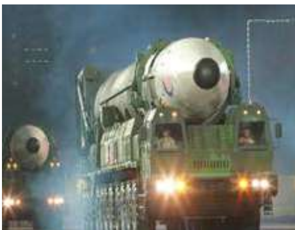
North Korea put Hwasong-17 intercontinental ballistic missiles on display in a night-time military parade in Pyongyang to mark the 90th founding anniversary of its armed forces.