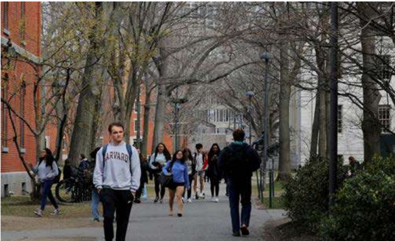
Students and pedestrians walk through the Yard at Harvard University in Cambridge, Massachusetts, U.S., March 10, 2020.