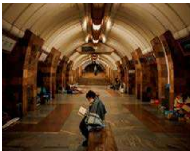
A woman reads a book as residents find shelter from shelling in a metro station, amid Russia's attack on Ukraine, in Kharkiv, Ukraine.