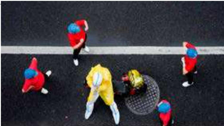
Workers in protective suits take a break on a street after nucleic acid testing during the COVID lockdown in Shanghai, China.