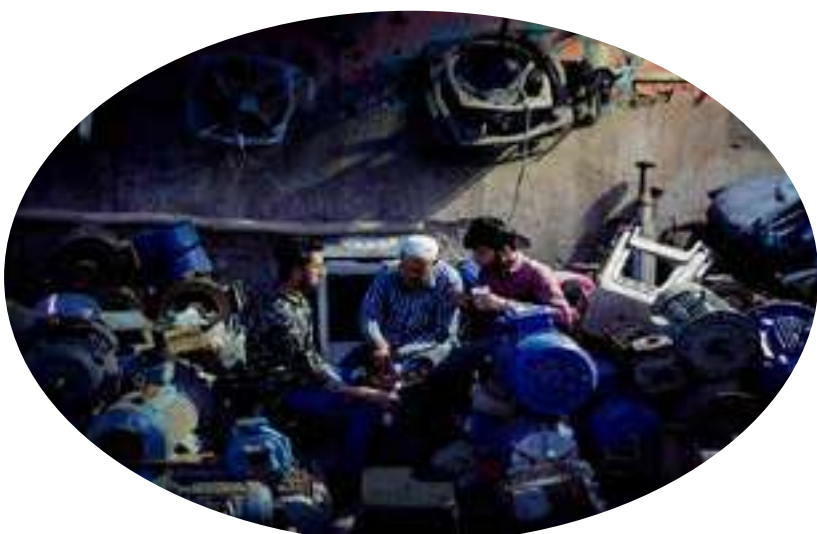
Muslims eat their Iftar (breaking of fast) meal at a water pump workshop during the fasting month of Ramadan in the old quarters of Delhi, India.