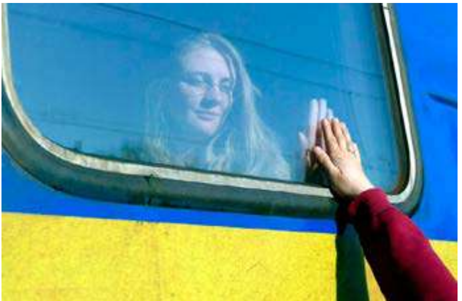
A woman says goodbye to her relative aboard a train travelling to Przemysl, Poland, amid Russia's invasion of Ukraine, in Odesa, Ukraine.