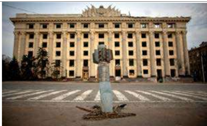
A bird is seen next to a missile from a previous Russian military attack as the damaged Kharkiv Regional State Administration building seen in the background, amid Russia's attack on Ukraine, in Kharkiv, Ukraine.