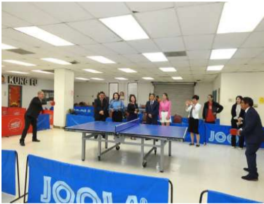
钟总领事与中心董事执委打球互动