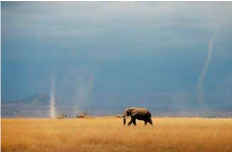
A whirlwind is seen as elephant and zebras walk through the Amboseli National Park, Kenya, August 2018.