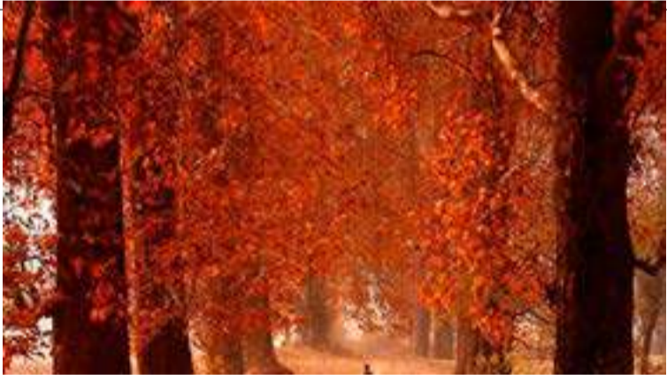
A man walks through a garden on an autumn day in Srinagar, Indian-administered Kashmir, November 2016.