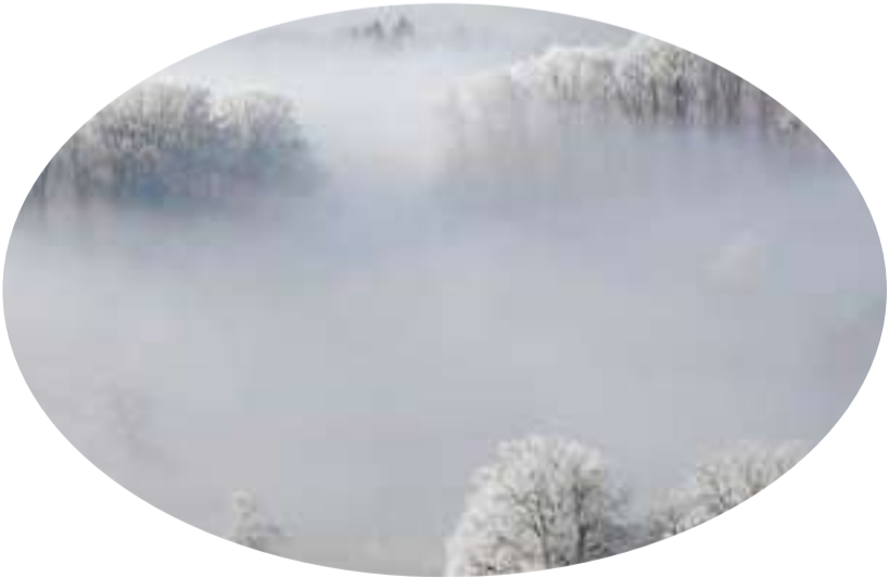
A jogger runs beside ice-covered trees near Albispass mountain pass, Switzerland January 2020.