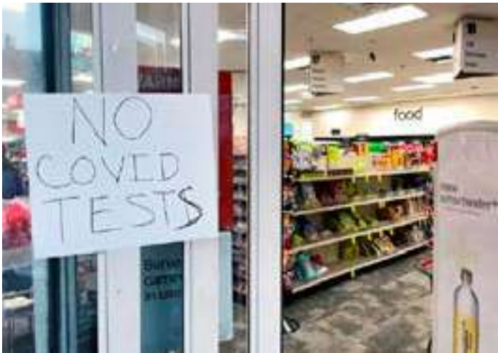
A hand-written sign attached to the door warns customers shopping for a home test that the kits are out of stock at a CVS store in Somerville, Massachusetts, December 22.