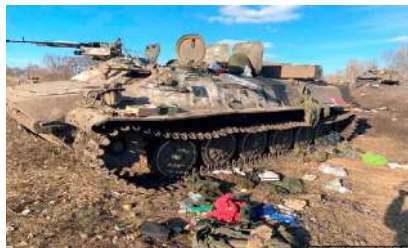
A Russian tank destroyed by Ukrainian forces. The lower orbit of Starlink also allows signals to trav-

Shortly after the invasion, Fedorov, who also serves as the country's vice-prime minister, had sent a tweet to Musk, asking to be given access to Starlink stations. Musk, currently valued at $232 billion according to the