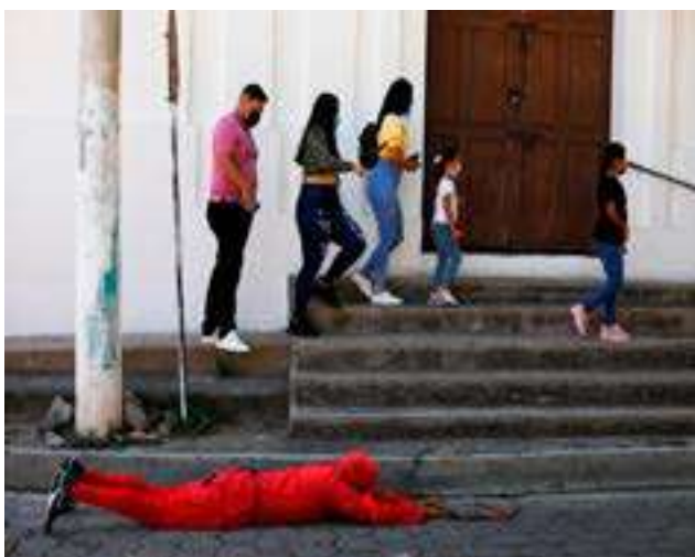
A man dressed as a demon rests as he participates in a ceremony known as Los Talciguines, as part of religious activities to mark the start of the Holy Week in Textistepeque, El Salvador, April 11.