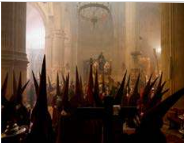
Penitents belonging to Los Gitanos brotherhood wait inside a church to take part in a Palm Sunday procession, after processions were cancelled for the last two years due to the coronavirus pandemic, in Ronda, Spain, April 10, 2022.