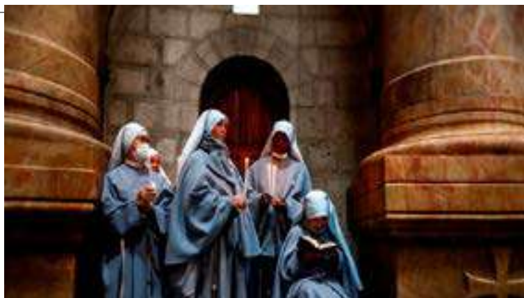
Nuns take part in the Catholic Washing of the Feet ceremony on Easter Holy Week in the Church of the Holy Sepulchre in Jerusalem's Old City, April 14.