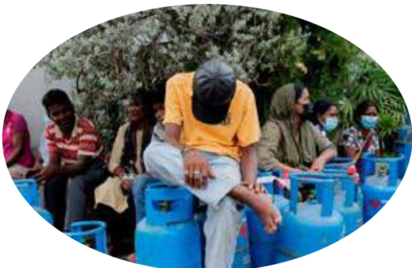
A man sits on a domestic gas cylinder as he waits in line to buy gas on a main road, amid the country's economic crisis in Colombo, Sri Lanka.