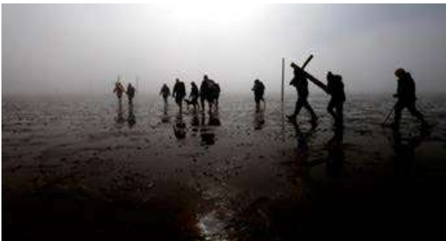
Pilgrims celebrate Easter as they walk over the tidal causeway to Lindisfarne during the final leg of their Good Friday pilgrimage in Berwick-upon-Tweed, Northumberland, Britain, April 15.