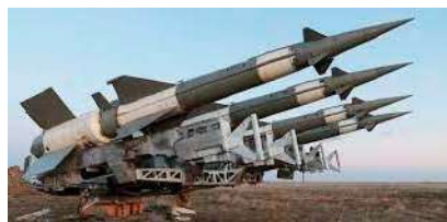
Kiev's Missiles Are All That Stand Between The Russian Air Force And Control Of Ukraine's Skies

Some of the most intense bombing came in 2016 during the battle for Aleppo, resulting in hundreds of civilian deaths. Russian President Vladimir Putin has termed the missile 'an ideal weapon' that flies at 10 times the speed of sound and can overcome air-defence systems. Hypersonic missiles can be used to deliver conventional warheads, more rapidly and precisely than other missiles. But their capacity to deliver nuclear weapons could add to a country's threat, increasing the danger of a nuclear conflict. Russia's announcement of the missile strike came as Kyiv's army high command claimed to have killed a fifth Moscow general since the war in Ukraine began. Lieutenant General Andrey Mordvichev was one of Vladimir Putin's most senior commanders, in charge of the 8th All-Military Army of the Kremlin's vast Southern Military District. Moscow did not initially confirm his death in keeping with most previous claims of the 'liquidation' of Generals. Ukraine now claims to have killed five holding the rank of General. The Ukrainians also claimed that wounded Russian soldiers have filled all hospital facilities in Gomel city in Belarus.