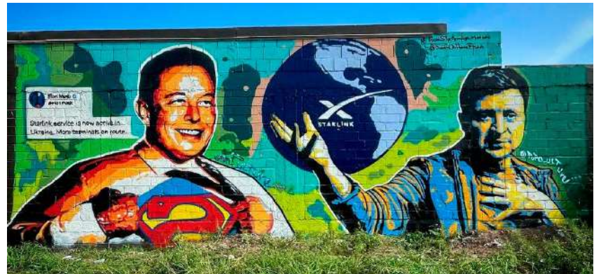
Artist Depiction Of Elon Musk (Left) And Ukraine President Zelinsky (Right) Showing Their Partnership With The Starlink Satellite System And Drone Initiative.