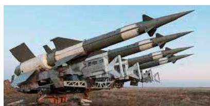
Kiev's Missiles Are All That Stand Between The Russian Air Force And Control Of Ukraine's Skies