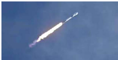
SpaceX said Saturday the 230-foot rocket, called the Falcon 9, successfully launched the satellites into orbit without a hitch.

During the speech, Biden asserted that the US is 'fully committed' to getting those weapons to Ukraine in the coming days.