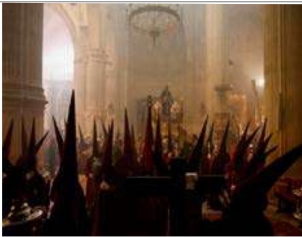
Penitents belonging to Los Gitanos brotherhood wait inside a church to take part in a Palm Sunday procession, after processions were cancelled for the last two years due to the coronavirus pandemic, in Ronda, Spain, April 10, 2022.