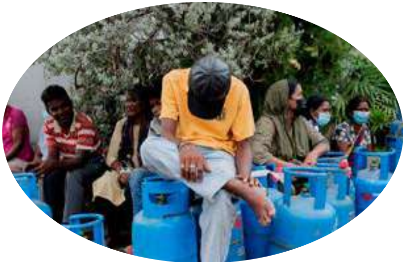
A man sits on a domestic gas cylinder as he waits in line to buy gas on a main road, amid the country's economic crisis in Colombo, Sri Lanka.