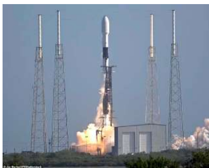
Early Saturday morning, a further 53 Starlink satellites were launched into space by rocket from Cape Canaveral Space Force Station in Florida, further bolstering the relatively new surveillance network

Following Zelensky's speech, Senate Minority Leader Mitch McConnell also criticized the Biden administration for what he's seen as a lackadaisical response to the conflict in Ukraine.