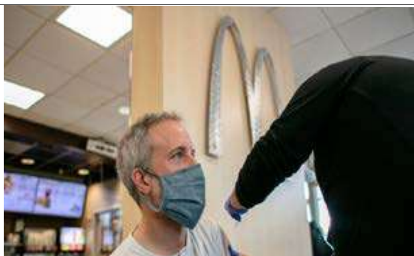
A man receives a booster shot for the coronavirus at a McDonald's in Chicago, Illinois, December 21.