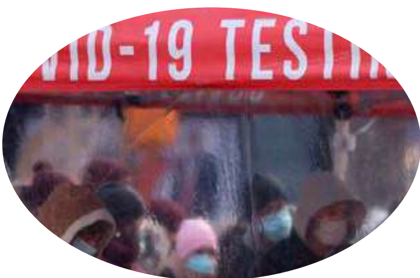
People queue to be tested for COVID-19 in Times Square, New York City, December 20.