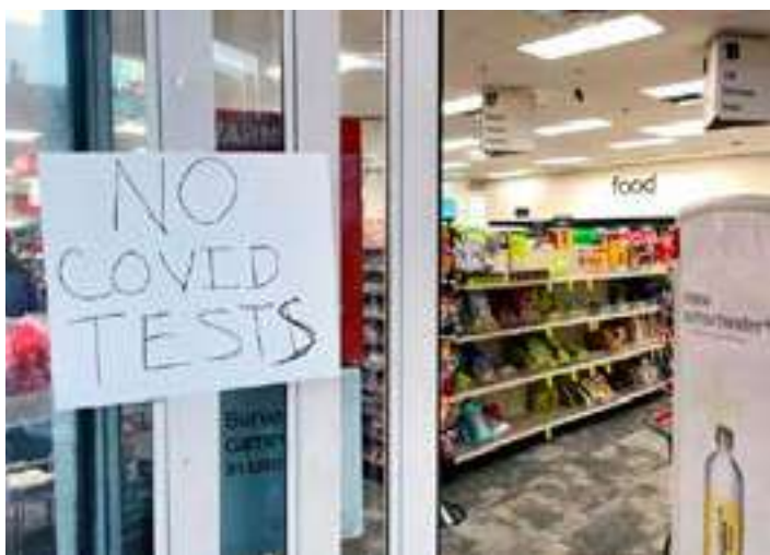
A hand-written sign attached to the door warns customers shopping for a home test that the kits are out of stock at a CVS store in Somerville, Massachusetts, December 22.