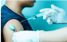
antibody response after vaccination alone, no cor-