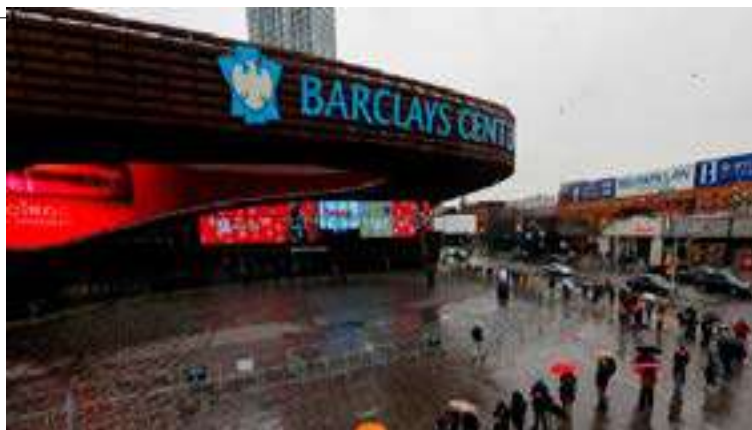
People line up outside the Barclays Center for coronavirus testing in Brooklyn, New York, December 18.