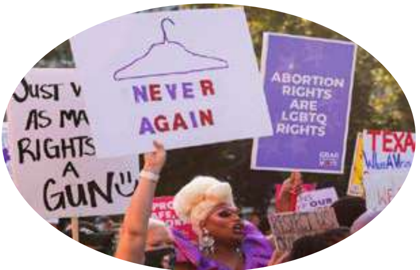
Brita Filter and supporters of reproductive choice take part in the nationwide Women's March, held after Texas rolled out a near-total ban on abortion procedures and access to abortion-inducing medications, in Manhattan, New York, .