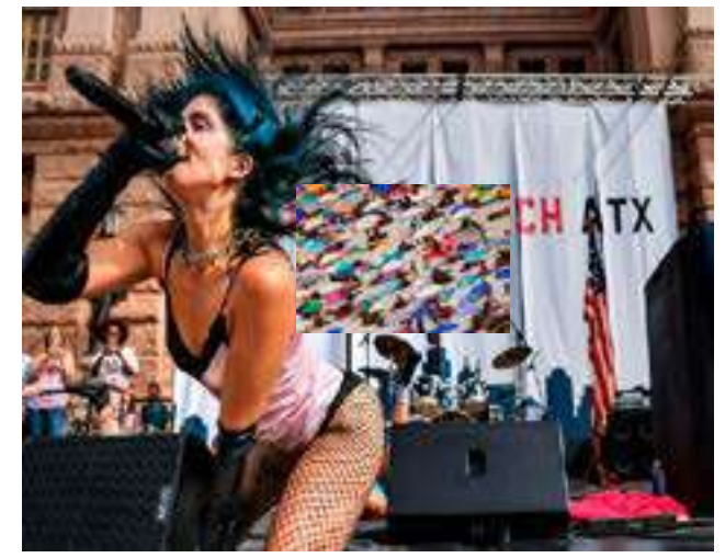
A member of Pussy Riot performs in the nationwide Women's March, held after Texas rolled out a near-total ban on abortion procedures and access to abortion-inducing medications, in Austin, Texas, October 2, 2021.