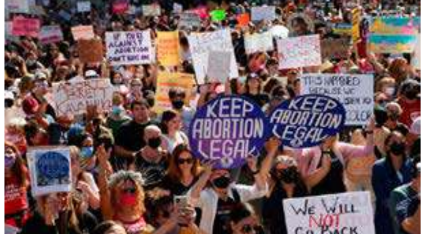
choice take part in the nationwide Women's March, held after Texas rolled out a near-total ban on abortion procedures and access to abortion-inducing medications, in New York City, New York