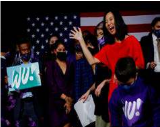
Michelle Wu celebrates with supporters and family after winning her race for Mayor of Boston, to become the first woman and first person of color to be elected to the office, in Boston, Massachusetts.