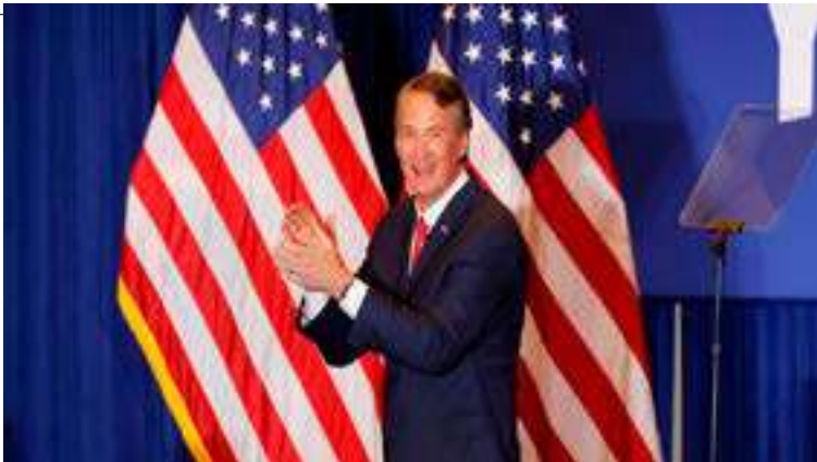
Virginia Republican gubernatorial nominee Glenn Youngkin speaks during his election night party at a hotel in Chantilly, Virginia.