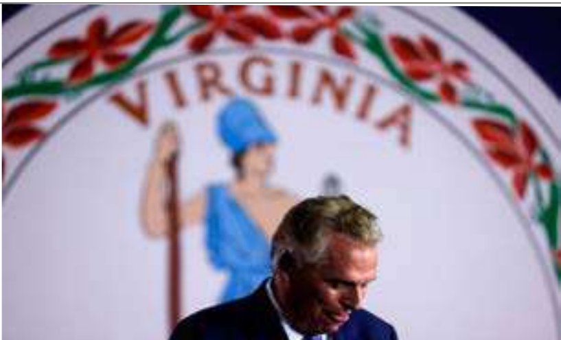
Democratic nominee for Virginia Governor Terry McAuliffe looks on as he addresses supporters during an election night party and rally in McLean, Virginia, November 2, 2021.