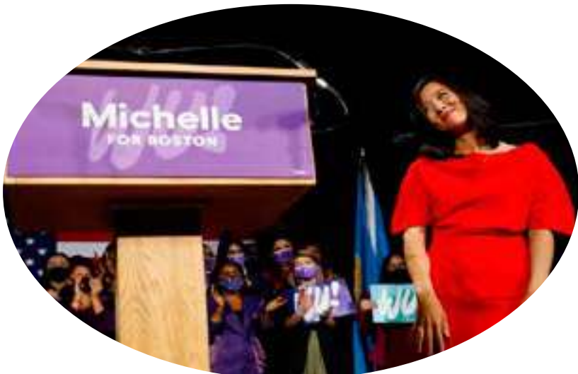
Michelle Wu takes the stage after winning her race for Mayor of Boston, to become the first woman and first person of color to be elected to the office, in Boston, Massachusetts.