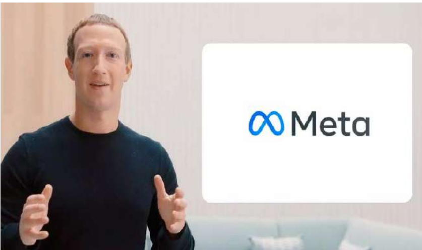
Screen shot of CEO Mark Zuckerberg at the company's "Connect" virtual event.

(Editor's Note: Below is the complete, unedited Founder's Letter as delivered by Facebook CEO Mark Zuckerberg on Thursday, October 28, 2021, as published on the internet. The only addition to Mr. Zuckerberg's statement has been photos and graphics for the purpose of emphasizing his announcement.)