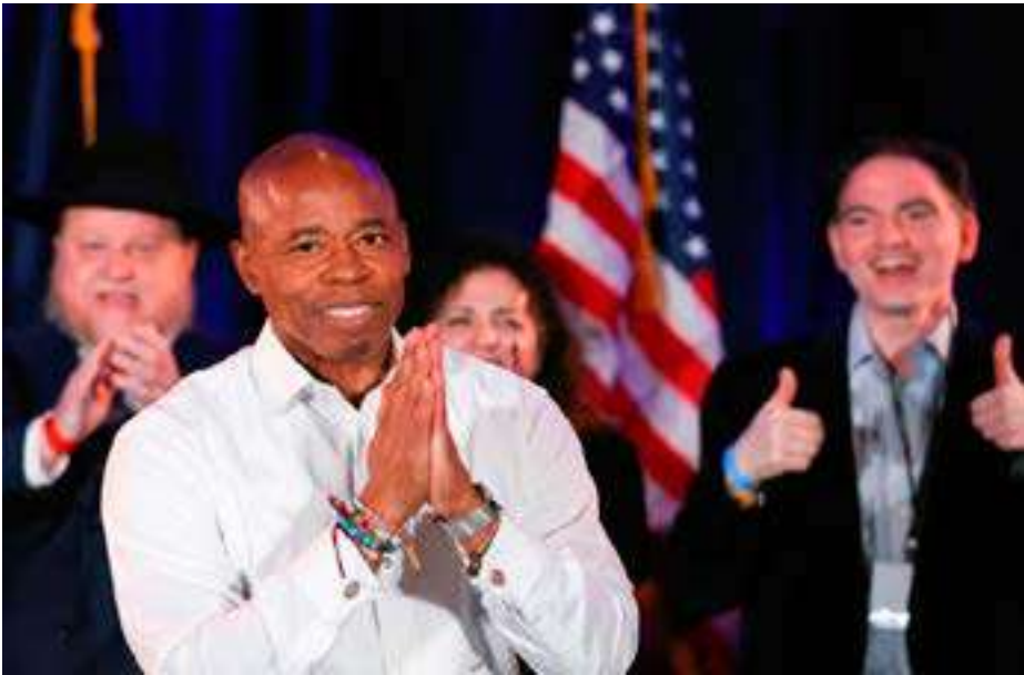
Democratic candidate for New York City Mayor Eric Adams reacts after being declared victor at his election night party in Brooklyn.