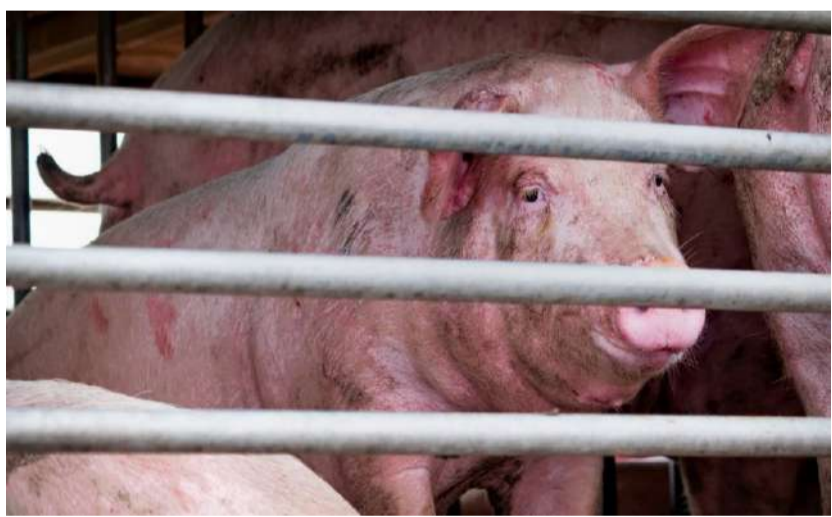
The new flu strain is similar to the swine flu that spread globally in 2009