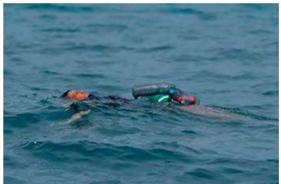
A Moroccan boy swims using bottles as a float, near the fence between the Spanish-Moroccan border, after thousands of migrants swam across the border, in Ceuta, Spain.