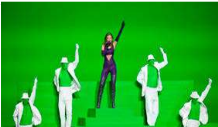
Stefania of Greece performs during the second semi-final of the 2021 Eurovision Song Contest in Rotterdam, Netherlands.