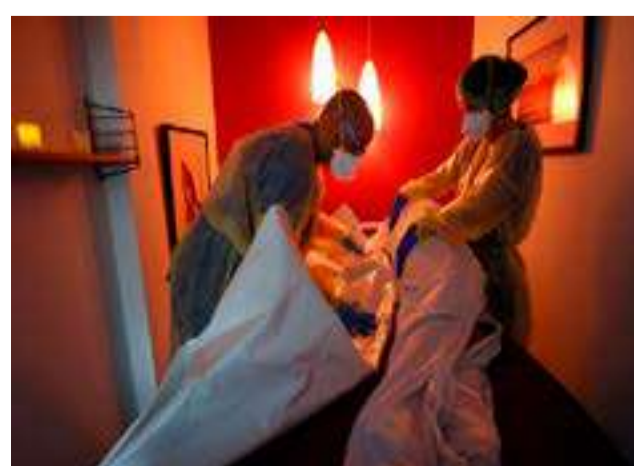
Medical personnel prepares the body of a patient who died of COVID-19 inside the "farewell room" at the coronavirus Intensive Care Unit (ICU) of the "Klinikum Darmstadt" clinic in Darmstadt, Germany.