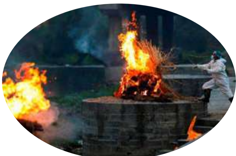
A man wearing personal protective equipment (PPE) cremates a body of a coronavirus victim at the crematory as the country recorded the highest daily increase in deaths since the pandemic began, in Kathmandu, Nepal.