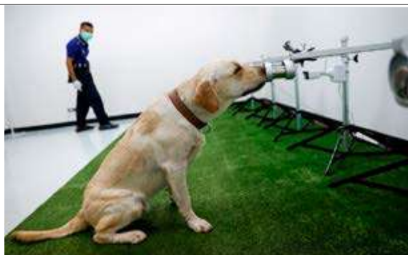
A dog that has been trained to sniff out the coronavirus screens a sweat sample at Chulalongkorn University, in Bangkok, Thailand.