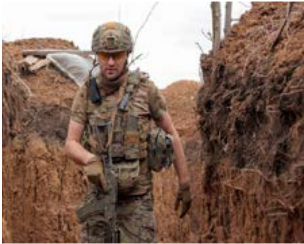
A service member of the Ukrainian armed forces walks with a weapon at fighting positions on the line of separation near the rebel-controlled city of Donetsk, Ukraine April 7, 2021.