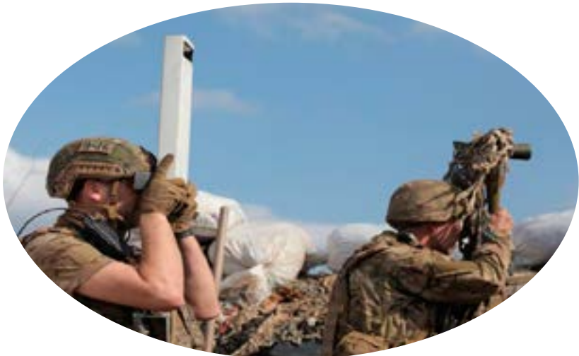
Service members of the Ukrainian armed forces use periscopes while observing the area at fighting positions on the line of separation near the rebel-controlled city of Donetsk, Ukraine April 7, 2021.