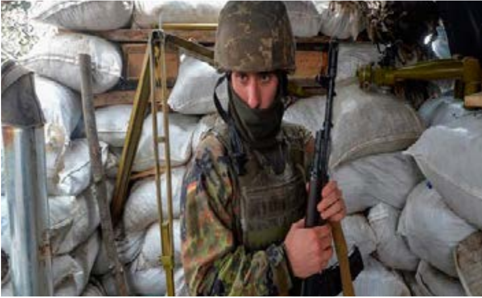
A service member of the Ukrainian armed forces stands guard at fighting positions on the line of separation from pro-Russian rebels near the town of Zolote in Luhansk Region, Ukraine