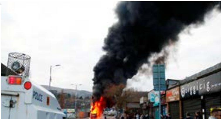
A hijacked bus burns on The Shankill Road as protests continue in Belfast, Northern Ireland, April 7, 2021.