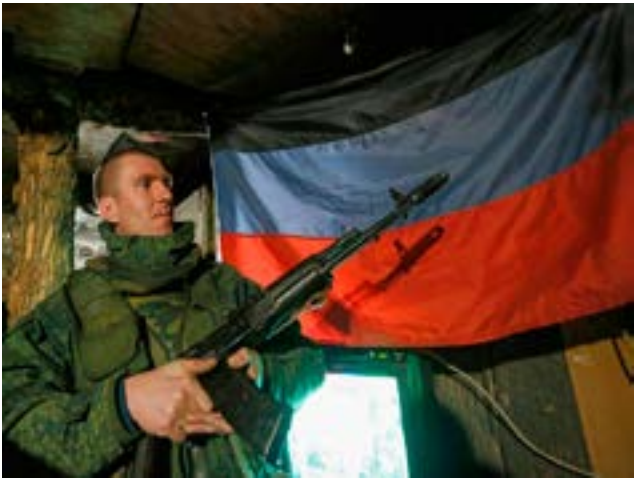
A militant of the self-proclaimed Donetsk People's Republic (DNR) holds a weapon at fighting positions on the line of separation from the Ukrainian armed forces south of the rebel-controlled city of Donetsk, Ukraine April 2, 2021.