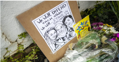
Flowers, candles and signs are displayed at a makeshift memorial