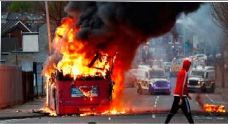
A man walks past a hijacked bus burning on The Shankill Road as protests continue in Belfast, Northern Ireland, April 7, 2021.