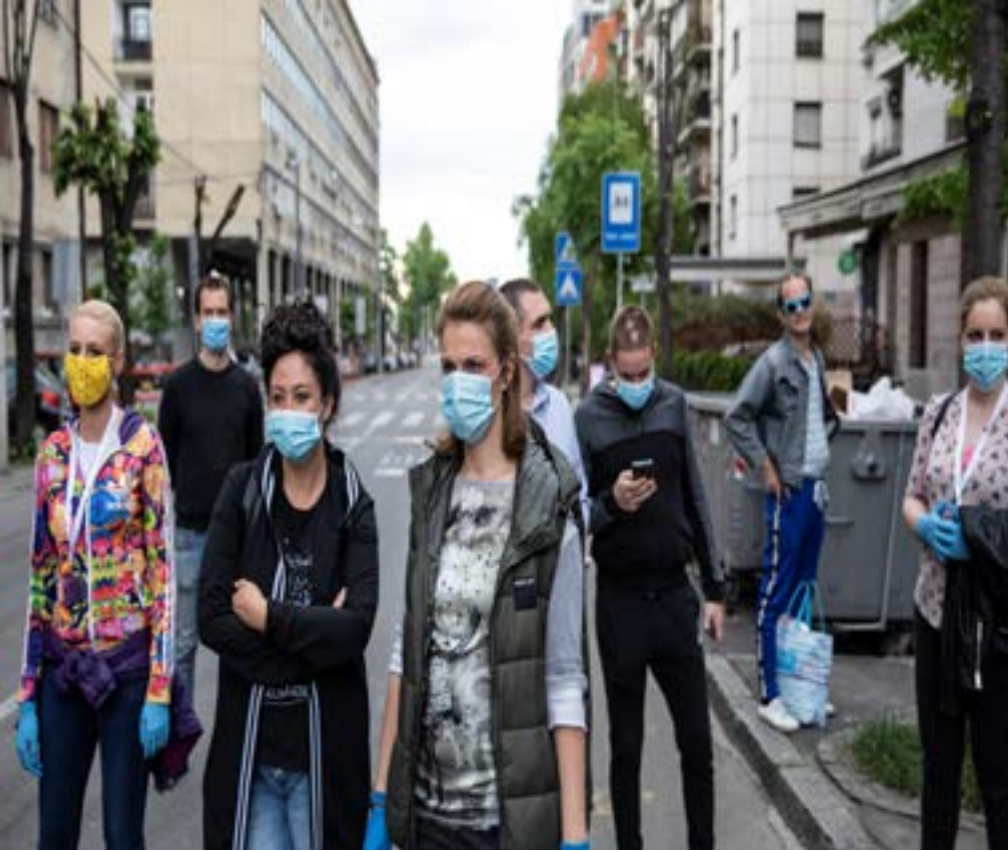
Opposition activists gather to protest government's policies during the coronavirus (COVID-19) crisis in Belgrade, Serbia, April 29, 2020.