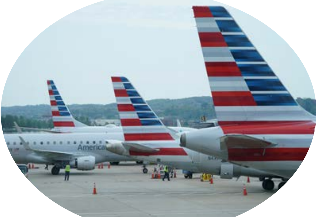
American airlines jets made by Embraer and other manufacturers sit at gates at Washington's Reagan National airport as the novel coronavirus (COVID-19) pandemic continues to keep airline travel at minimal levels and the U.S. economy contracts in the first quarter at its sharpest pace since the Great Recession, in Washington, U.S. April 29, 2020.