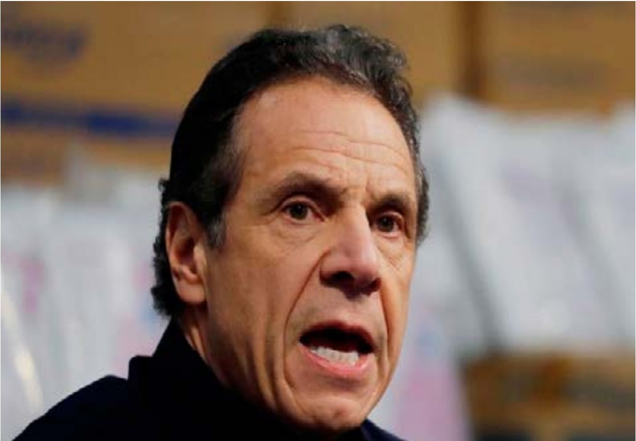
FILE PHOTO: New York Governor Andrew Cuomo speaks during a news conference at the Jacob K. Javits Convention Center which will be partially converted into a temporary hospital during the outbreak of the coronavirus disease (COVID-19) in New York City, New York, U.S., March 24

As part of his daily slide presentation Cuomo prepared one showing that Florida receives $30 billion more than it gives to the federal government on annual basis, while Kentucky, home to McConnell, is a net recipient of $37 billion in funds.