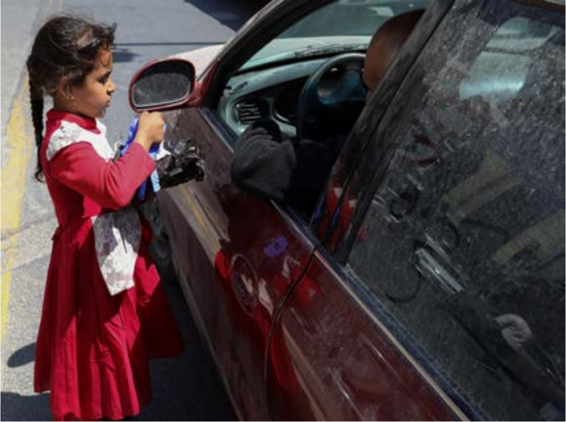
A girl sells protective face masks and gloves at the main market in downtown after the government eased the restrictions on movement aimed at containing the spread of the coronavirus disease (COVID-19), in Amman, Jordan April 29, 2020.