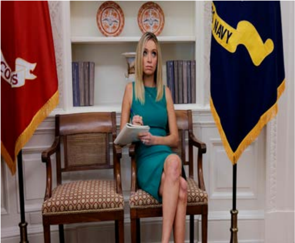
White House Press Secretary Kayleigh McEnany listens during a coronavirus response meeting between U.S. President Donald Trump and Louisiana Governor John Bel Edwards in the Oval Office at the White House in Washington, U.S., April 29, 2020.