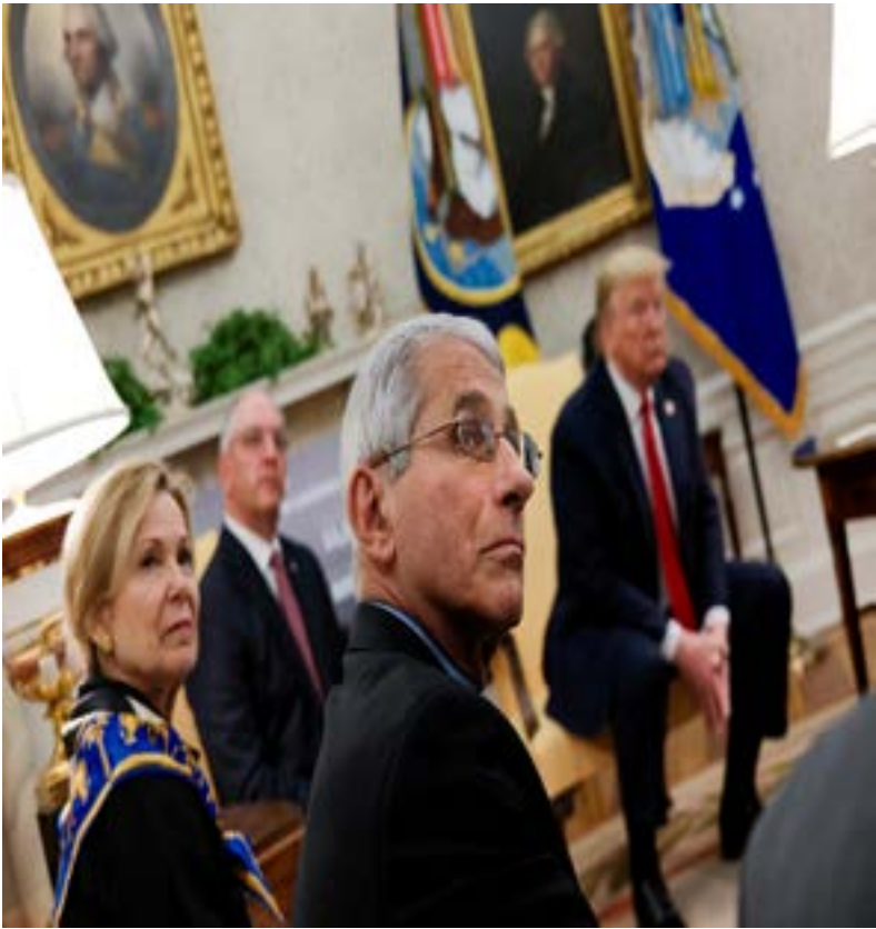
National Institute of Allergy and Infectious Diseases Director Dr. Anthony Fauci and Ambassador Debbie Birx, the White House coronavirus response coordinator, attend a coronavirus response meeting between U.S. President Donald Trump and Louisiana Governor John Bel Edwards in the Oval Office at the White House in Washington, U.S.. April 29, 2020.