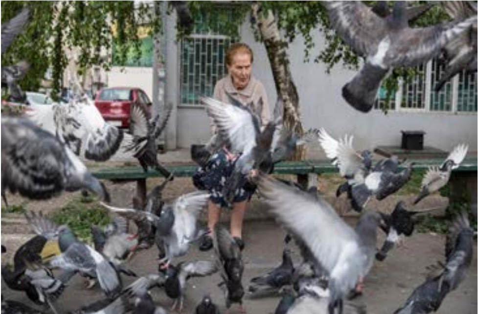
A woman feeds pigeons on a street as the spread of the coronavirus disease (COVID-19) continues in Belgrade