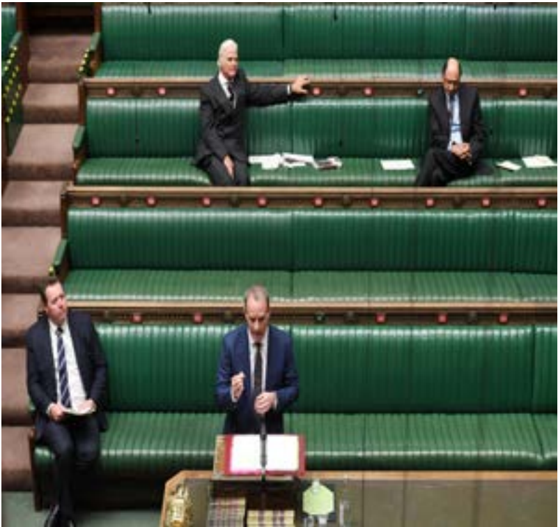
British Foreign Secretary Dominic Raab deputising for Prime Minister Boris Johnson speaks during Prime Minister's Questions in the House of Commons Chamber in London, Britain, April 29, 2020.