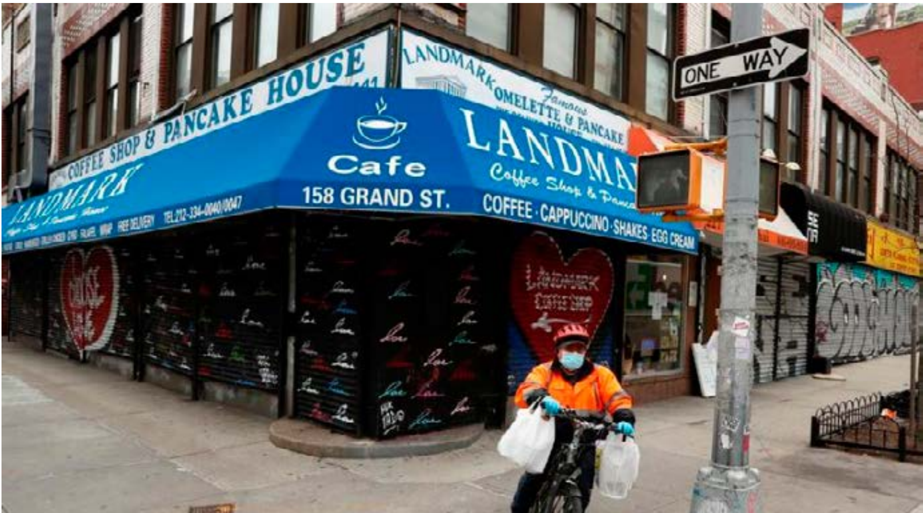
FILE PHOTO: A delivery man wearing a mask walks rides his bicycle as the spread of the coronavirus disease

WASHINGTON (Reuters) - The U.S. economy contracted in the first quarter at its sharpest pace since the Great Recession as stringent measures to slow the spread of the novel coronavirus almost shut down the country, ending the longest expansion in the nation's history.