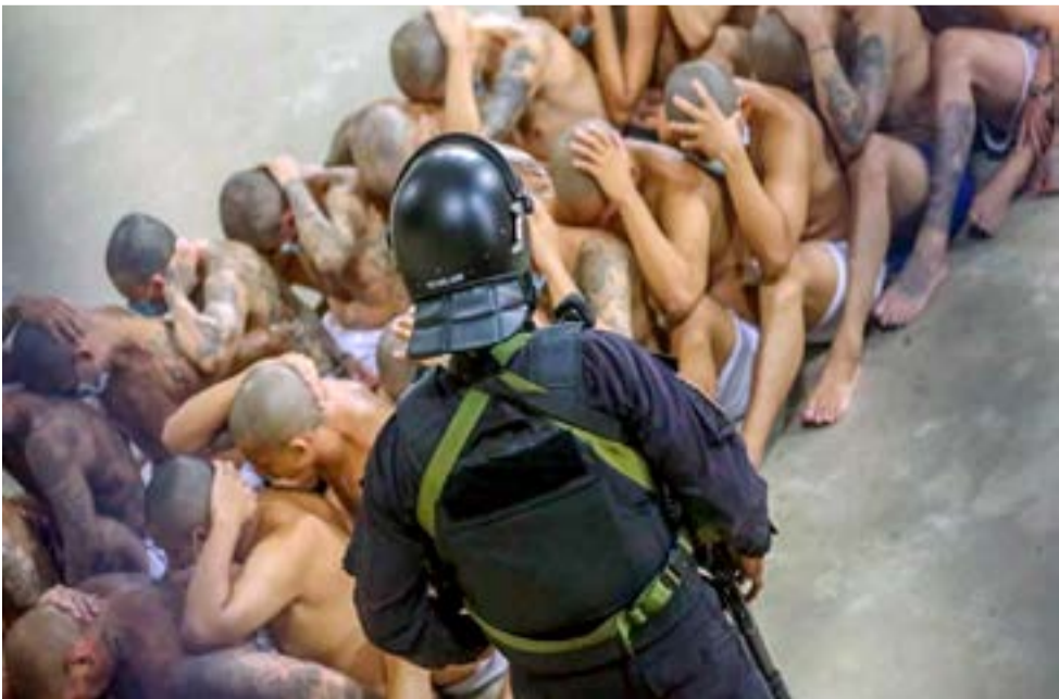
Gang members are secured during a police operation at Izalco jail during a 24-hour lockdown ordered by El Salvador's President Nayib Bukele in Izalco