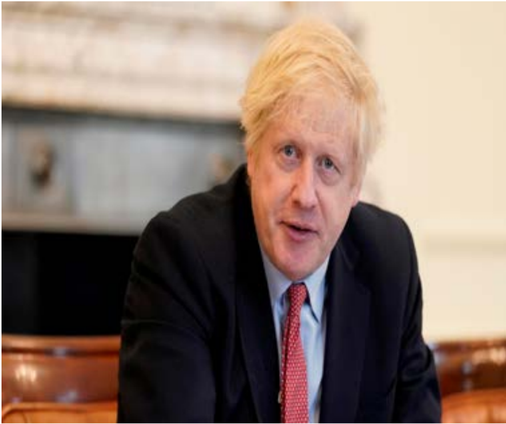
Britain's Prime Minister Boris Johnson chairs a meeting to update on the coronavirus disease (COVID-19) outbreak, in the cabinet room of the 10 Downing Street in London, Britain April 27, 2020.