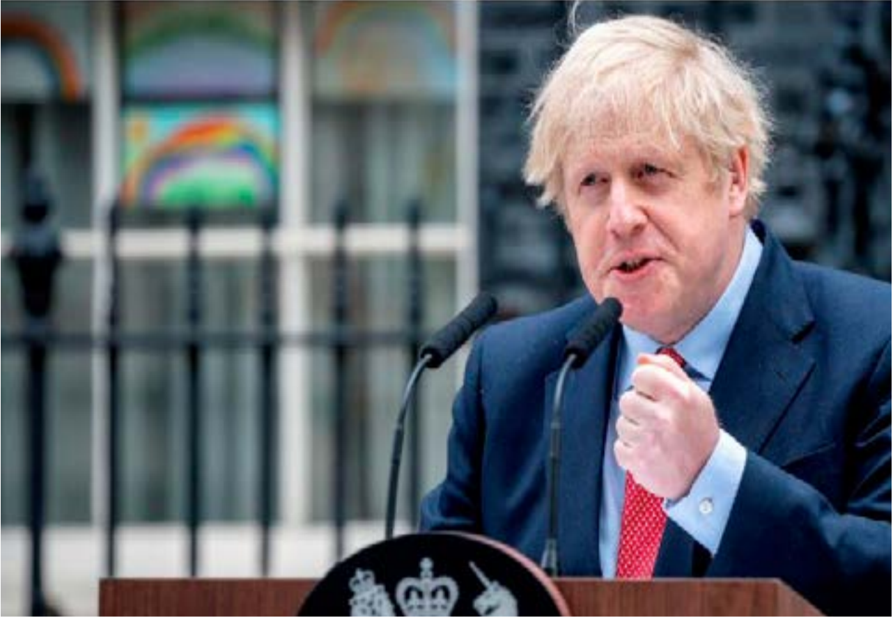
Britain's Prime Minister Boris Johnson speaks outside 10 Downing Street after recovering from the coronavirus disease (COVID-19), in London, Britain April 27, 2020.

Italy is looking ahead to a second phase of the crisis in