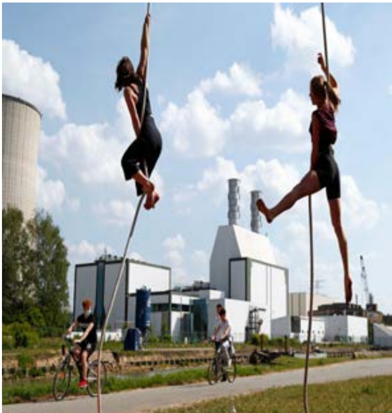
Student from a closed Brussels' circus school hang on ropes attached to an abandoned bridge during the lockdown imposed by the Belgian government to slow down the coronavirus disease (COVID-19) spread, Belgium April 27, 2020.