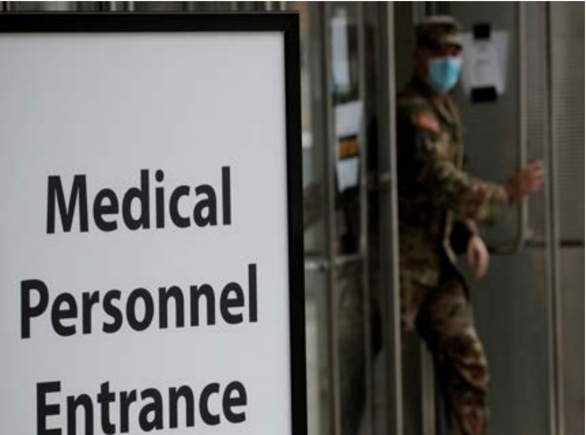
A U.S. military personnel wearing face mask walks outside the Jacob K. Javits Convention Center, which was converted into a hospital during the outbreak of the coronavirus disease (COVID-19), in New York City, U.S. April 27, 2020.