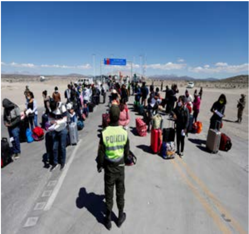
Bolivian citizens, who were stranded in Chile after the border was closed as preventive measure, gather as they cross the border between Chile and Bolivia to get to their country, following the outbreak of the coronavirus disease (COVID-19) in Colchane, Chile April 27, 2020.