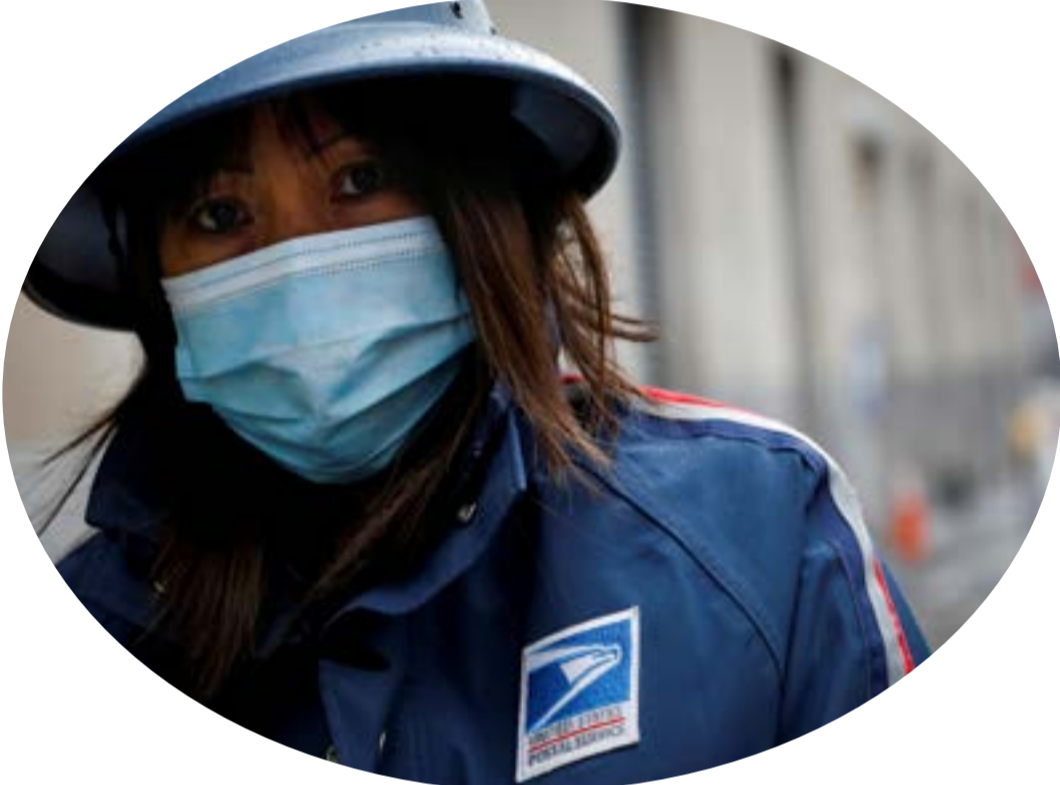
A United States Postal Service (USPS) worker works in the rain in Manhattan during outbreak of coronavirus disease (COVID-19) in New York