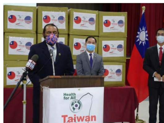
聯邦眾議員 Al Green 致詞感謝來自台灣政府及人民的支持與友誼。