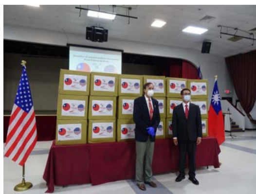
聯邦眾議員 Pete Olson（左）與「台北經文處」陳家彥處長（右）在捐贈現場合影。