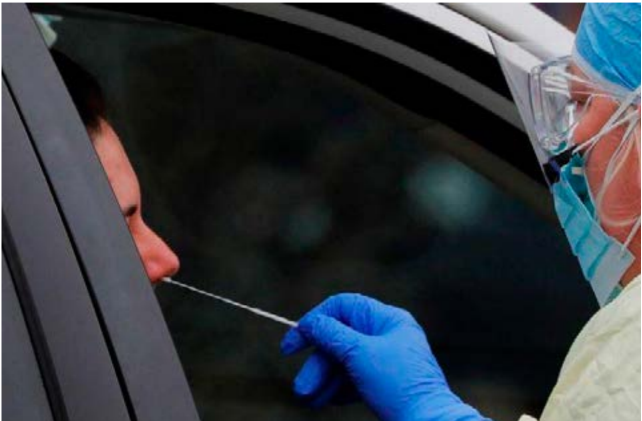
FILE PHOTO: A medical technician takes a sample to test for the coronavirus disease (COVID-19) at a drive through testing site in Medford, Massachusetts, U.S., April 4, 2020. REUTERS/Brian Snyder/File Photo

"We are receiving many calls today from citizens who went through the drive through testing in the earliest days