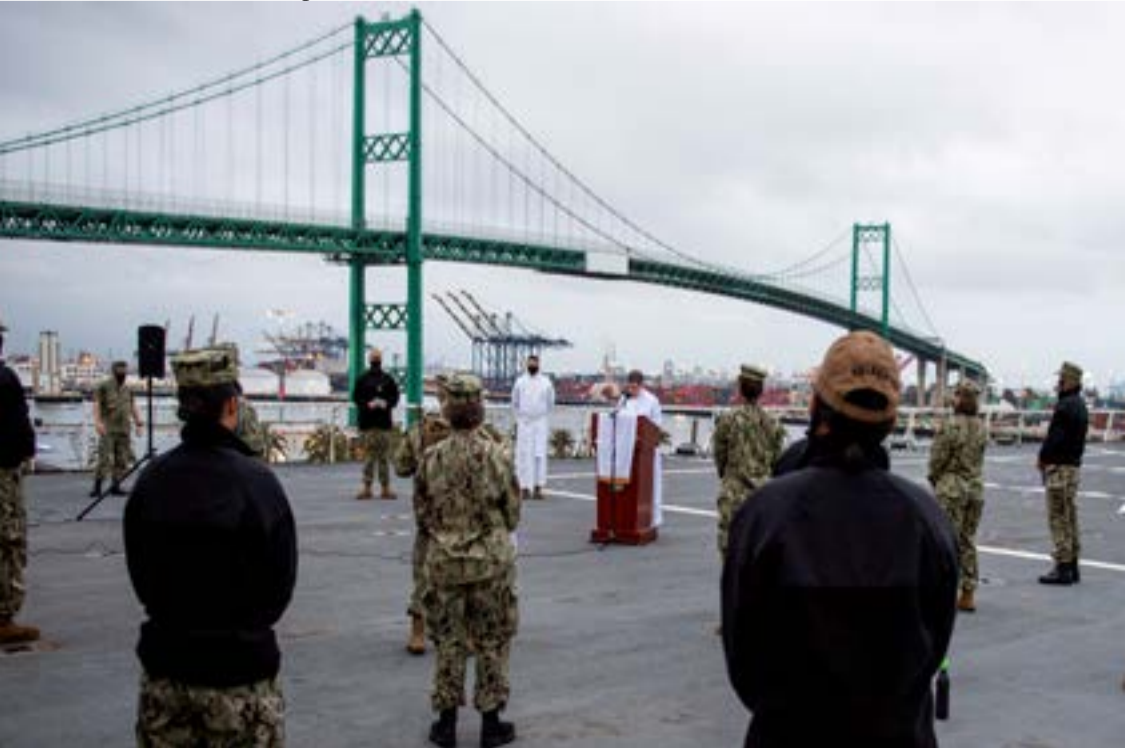
U.S. Navy sailors practice social distancing as they attend Sunday Easter sunrise service on the flight deck aboard the hospital ship USNS Mercy, serving as a referral hospital for non-coronavirus disease (COVID-19) patients currently admitted to shore-based hospitals, in Los Angeles, California, U.S. April 12, 2020.