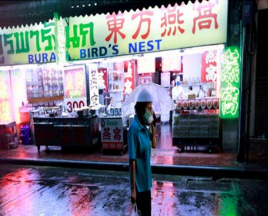
A woman wearing a protective face mask walks in the rain during the coronavirus disease (COVID-19) outbreak in Bangkok, Thailand, April 13, 2020. REUTERS/ Soe Zeya Tun TPX IMAGES OF THE DAY