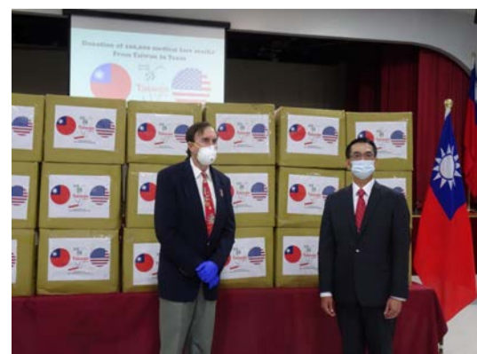
聯邦眾議員 Pete Olson（左）與「台北經文處」陳家彥處長（右）在捐贈現場合影。