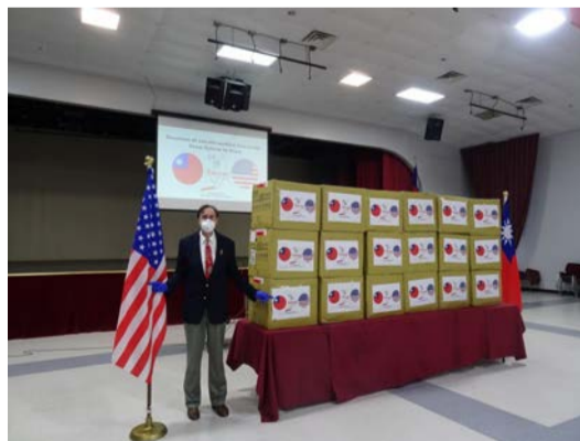
聯邦眾議員 Pete Olson 與捐贈醫療物品合影。