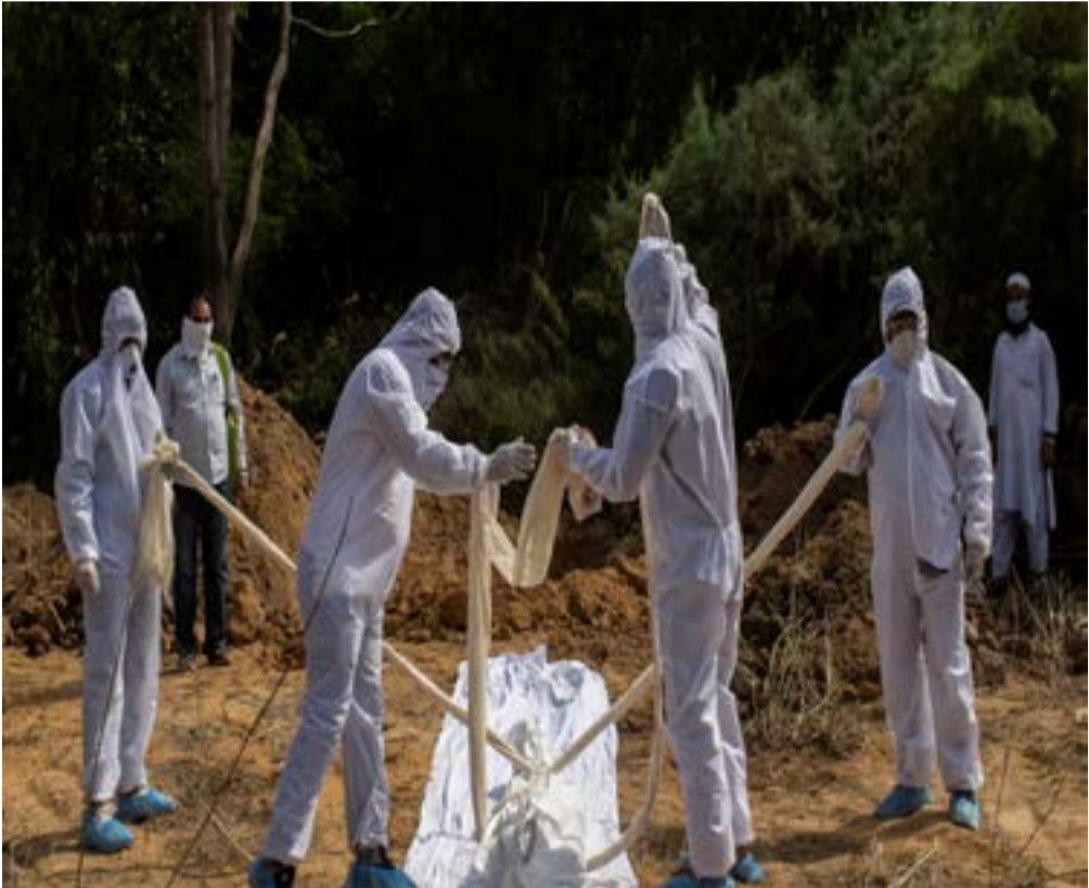
Relatives wearing protective gear prepare to bury the body of a man who died from the coronavirus disease (COVID-19), at a graveyard in New Delhi, India, April 14, 2020.