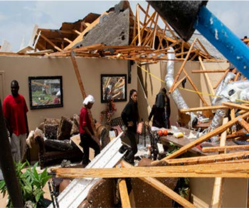
Residents comb through the wreckage of a collapsed house after an Easter Sunday tornado ripped through the Cherry Blossom Drive neighborhood in Monroe, Louisiana, U.S. April 12, 2020. Picture taken April 12, 2020