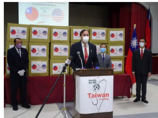
聯邦眾議員 Pete Olson 致謝詞。