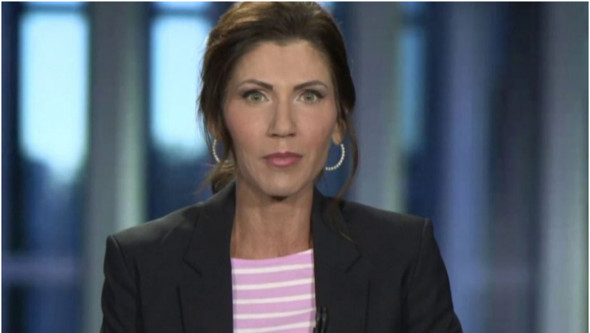
Gov. Kristi Noem (R) of South Dakota