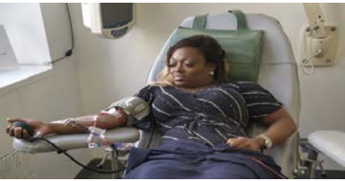
In this March 26, 2020 photo pro-