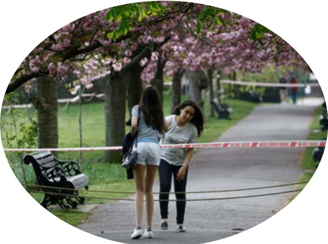
Two women are seen passing a police cordon in Greenwich Park as the spread of the coronavirus disease (COVID-19) continues, London, Britain, April 11, 2020.