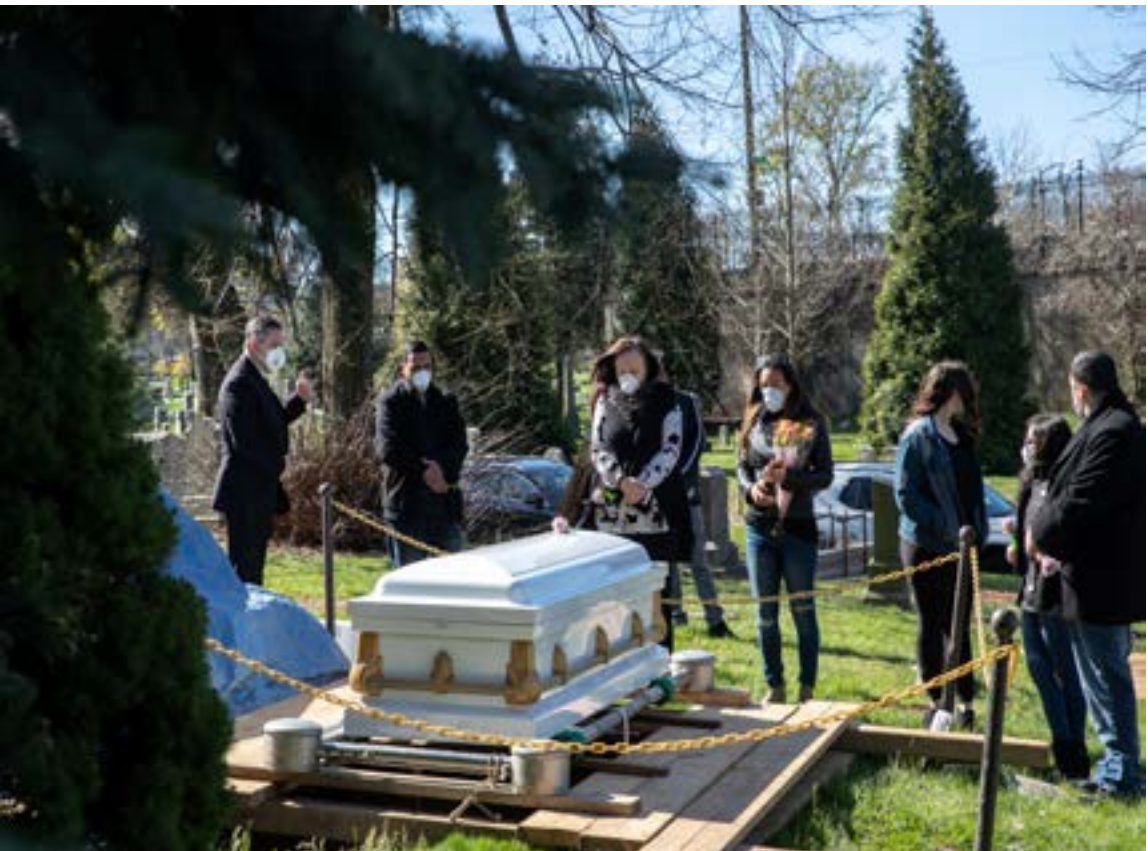
Mourners attend a funeral at The Green-Wood Cemetery during the outbreak of the coronavirus disease (COVID-19) in the Brooklyn borough of New York City