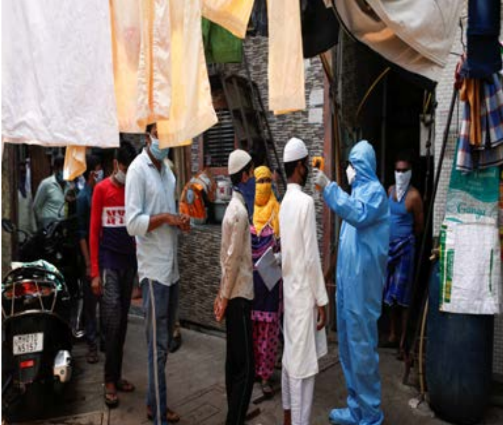
A doctor scans residents from Dharavi, one of Asia's largest slums, with an infrared thermometer to check their temperature as a precautionary measure against the spread of the coronavirus disease (COVID-19), in Mumbai, India, April 11, 2020.