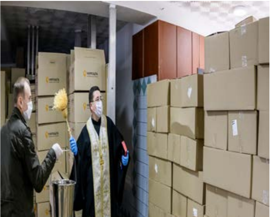
A priest of the Ukrainian Greek Catholic Church sprays holy water on boxes containing Easter cakes in an office of Ukrposhta, the state post of Ukraine, amid the coronavirus (COVID-19) pandemic, in Kiev, Ukraine April 11, 2020.