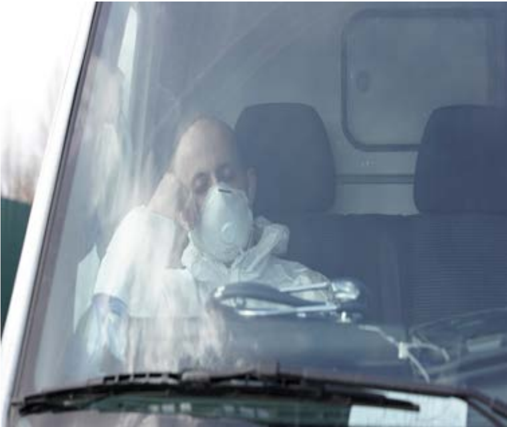
A medical specialist rests inside an ambulance, which queues before driving onto the adjacent territory of a local hospital amid the coronavirus (COVID-19) pandemic in Khimki outside Moscow, Russia April 11, 2020.