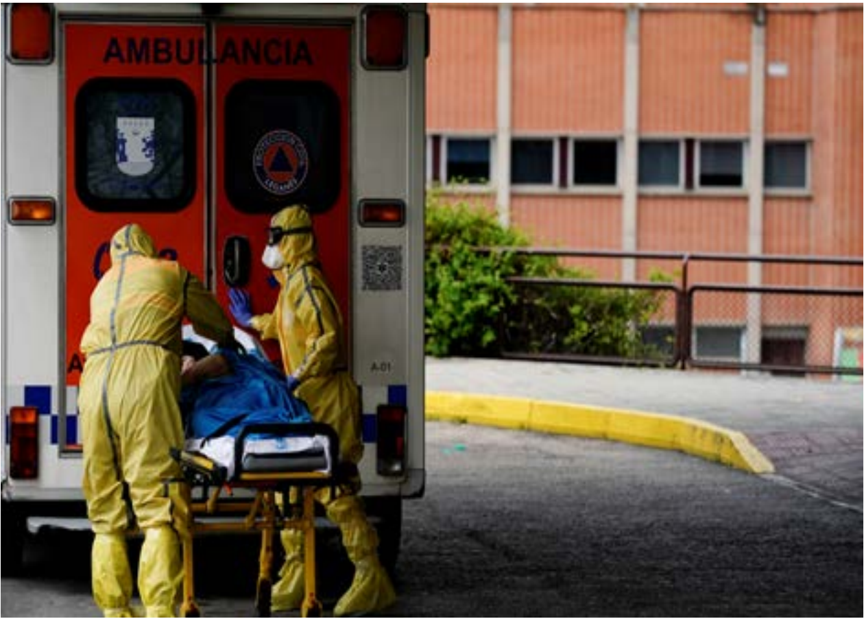
Healthcare workers push a patient on a stretcher at the emergency unit at Severo Ochoa hospital during the coronavirus disease (COVID-19) outbreak in Leganes, near Madrid, Spain April 11, 2020.

FILE PHOTO: A South Korean patient affected with the coronavirus disease (COVID-19) casts her ballot for the parliamentary election at a polling station set up at a quarantine center in Yongin, South Korea, April 11, 2020.