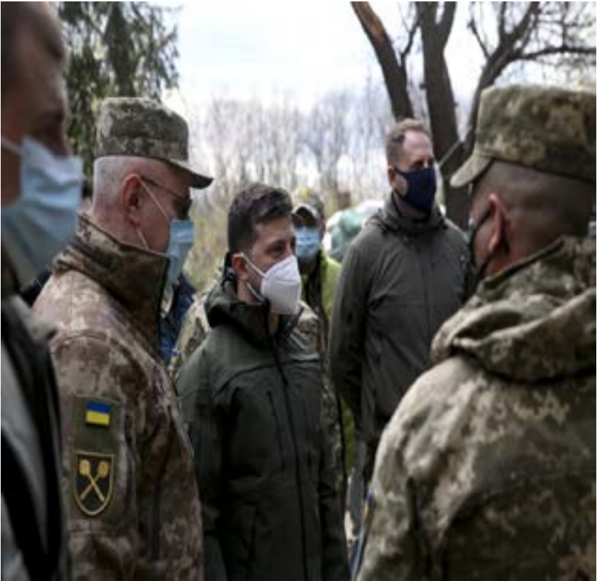
Ukraine's President Volodymyr Zelenskiy visits armed forces' positions near Petrivske village in Donetsk region