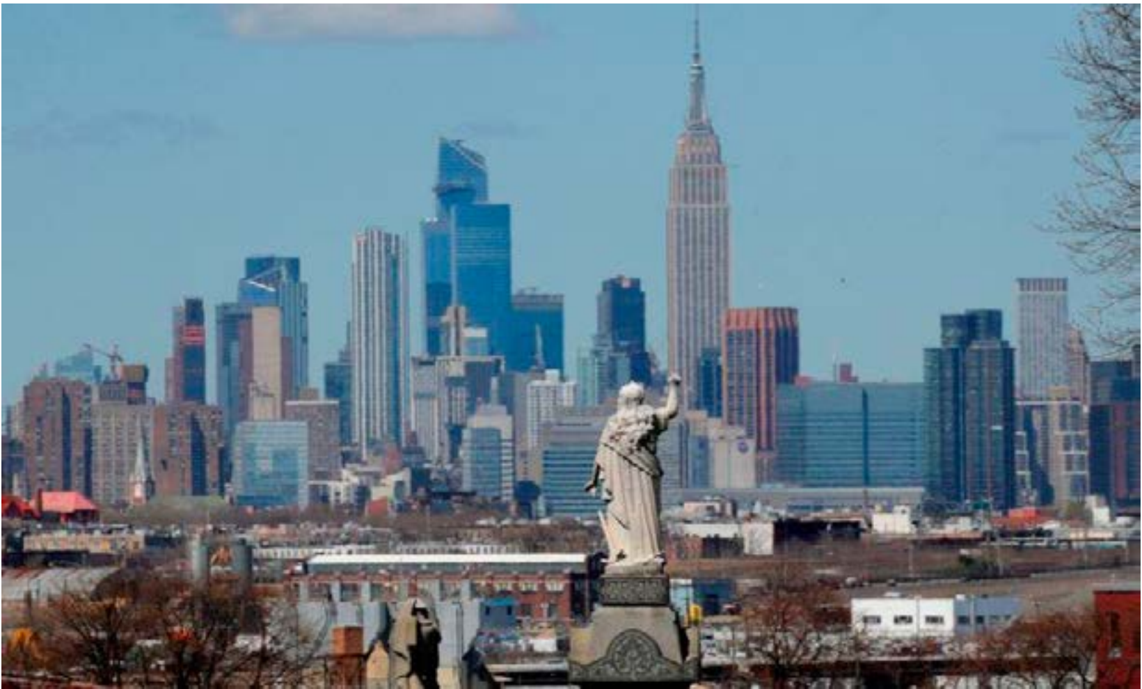
File Photo: A view of the Manhattan skyline as seen from the Linden Hill Cemetery during the outbreak of the coronavirus disease (COVID-19) in the Brooklyn borough of New York City, New York, U.S., April 6, 2020.

(Reuters) - New York City Mayor Bill de Blasio said on Saturday public schools will remain closed for the rest of the school year as the city battles the outbreak of the novel coronavirus. "Having to tell you that we cannot bring our schools back for the remainder of this school year is painful, but I can also tell you it is the right thing to do," he told a news conference.