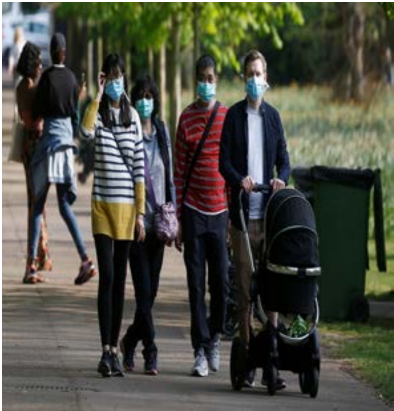
People are seen wearing protective face masks in Greenwich Park as the spread of the coronavirus disease (COVID-19) continues, London, Britain, April 11, 2020.