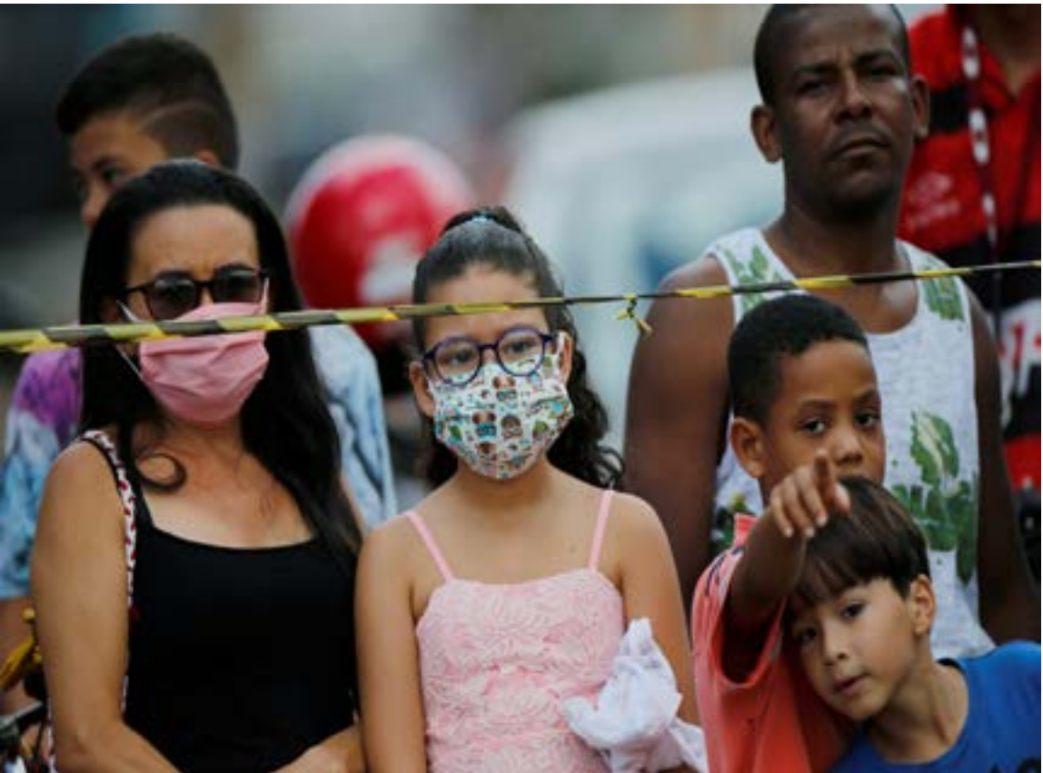
People look on during a visit of the Brazil's President Jair Bolsonaro to a temporary field hospital, amid coronavirus disease (COVID-19) outbreak, in Aguas Lindas, state of Goias,Brazil