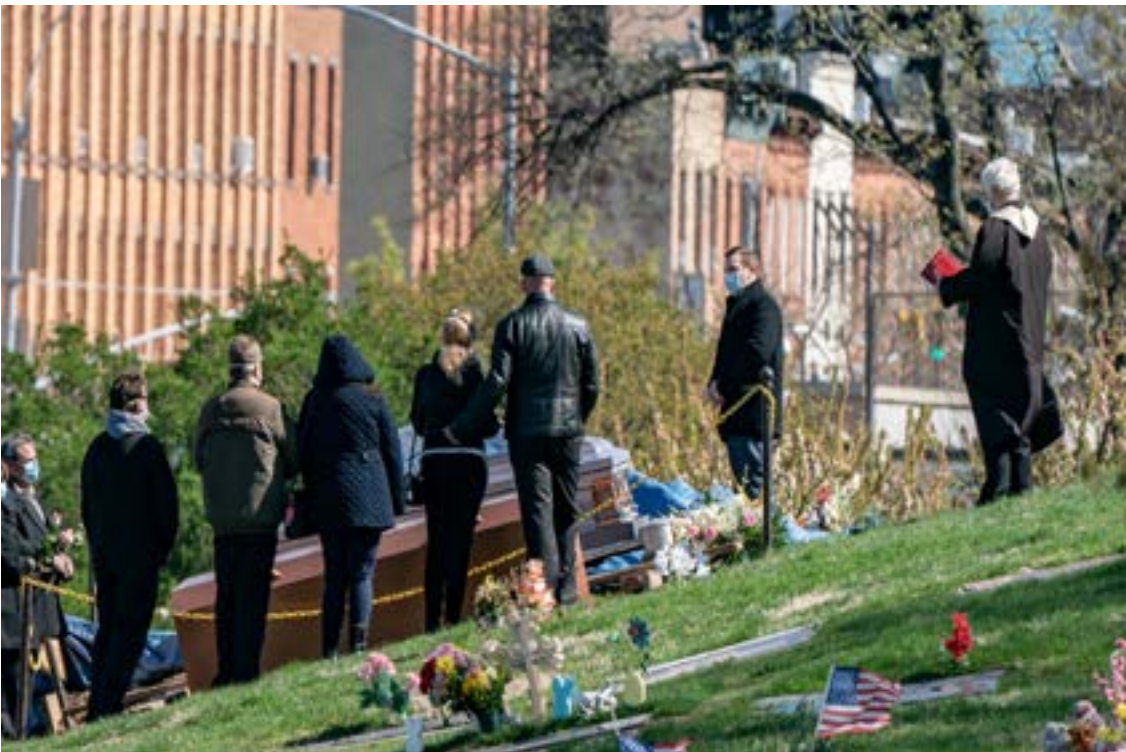
Volunteers are pictured while handing out approximately 300 laptops to students at East Los Angeles College during the global outbreak of the coronavirus disease (COVID-19) in Monterey Park, California, U.S., March 26, 2020.