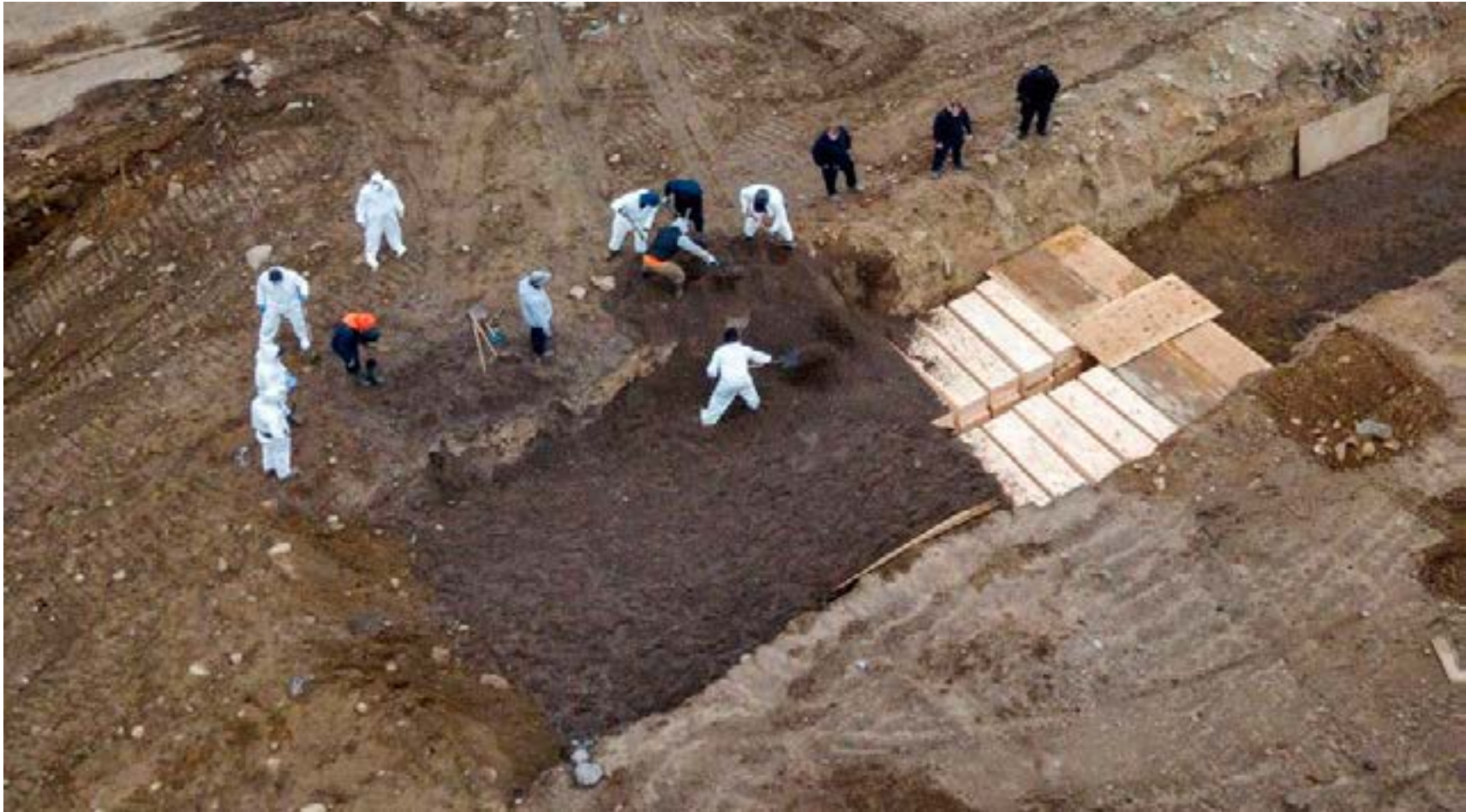
FILE PHOTO: Drone pictures show bodies being buried on New York's Hart Island where the department of corrections is dealing with more burials overall, amid the coronavirus disease (COVID-19) outbreak in New York City, U.S., April 9, 2020.

(Reuters) - U.S. deaths due to the coronavirus surpassed 20,000 on Saturday, the highest reported number in the world, according to a Reuters tally, although there are signs the pandemic might be nearing a peak.