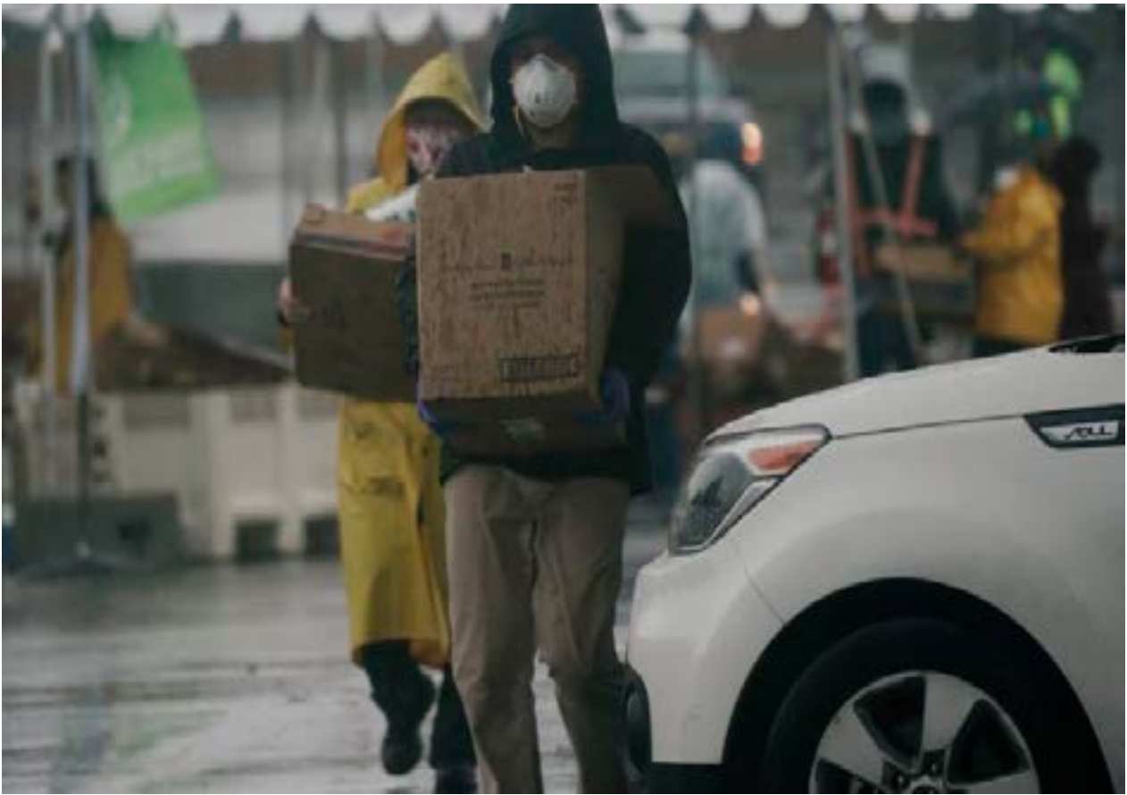
San Diego Food Bank volunteers carry boxes of left-over food after an emergency drive-through food and toilet paper distribution hosted at Southwestern College near the U.S.-Mexico border, amid the coronavirus disease (COVID-19) outbreak in Chula Vista, California, U.S., April 10, 2020. Picture taken through glass.

The United States by far accounts for most of the world’s confirmed cases of COVID-19, the highly contagious lung ailment caused by the novel coronavirus, with at least 500,000 known infections and more than 18,600 deaths. Only Italy has recorded more fatalities.