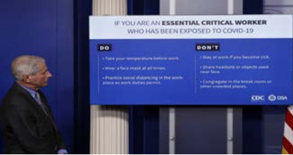
Dr. Anthony Fauci, director of the National Institute of Allergy and Infectious Diseases, looks at a chart as Dr. Robert Redfield, director of the Centers for Disease Control and Prevention, during a briefing about the coronavirus in the James Brady Press Briefing Room of the White House, Wednesday, April 8, 2020, in Washington.

If, by fall, things start to return to normal, Americans will still need to wash their hands frequently, sick schoolchildren should be kept home and people with fevers need to refrain from going to work, Fauci said during an online interview Wednesday with the editor of the Journal of the American Medical Association.