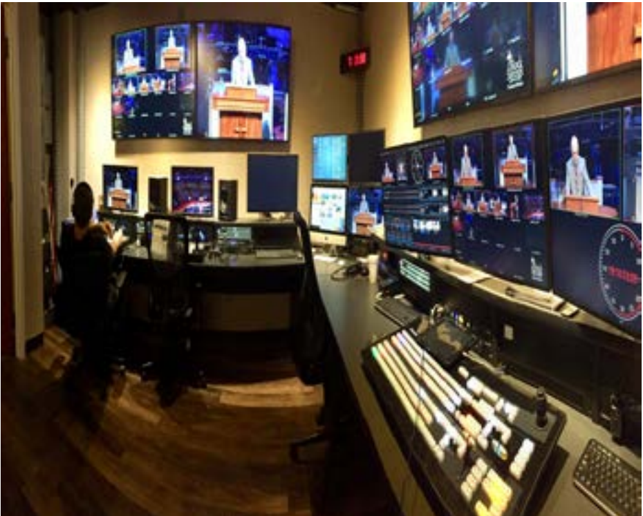
Volunteer in Rock Springs Baptist Church's Media Ministry oversees live streaming production of the main service