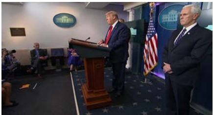
US President Donald Trump said on Wednesday social distancing and other measures aimed at stopping the spread of the coronavirus were having an impact. At the daily White House briefing, Trump told reporters Americans were heading into the “final stretch” and that there was “light at the end of the tunnel.” (April 8). On the other side of the globe, the journey back to normalcy is further along.

than 400,000 confirmed cases of infection.