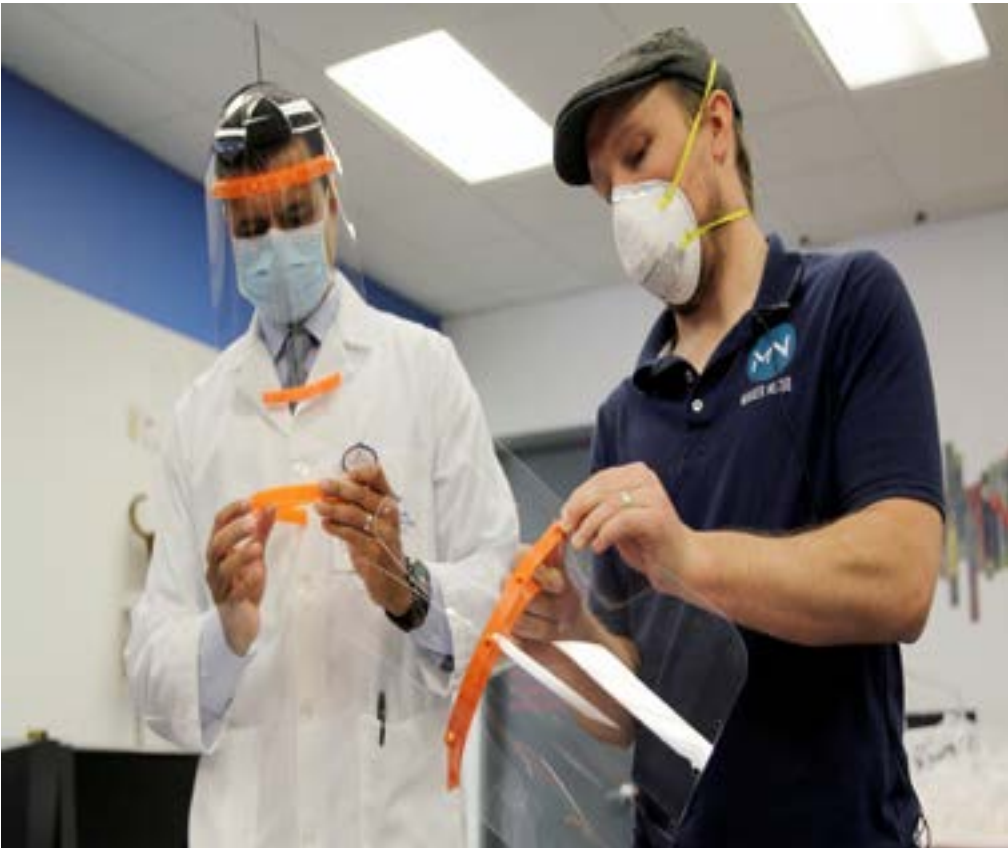
Mourners attend a funeral at The Green-Wood Cemetery during the outbreak of the coronavirus disease (COVID-19) in the Brooklyn borough of New York City