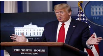
President Donald Trump speaks about the coronavirus in the James Brady Press Briefing Room of the White House, Wednesday, April 8, 2020, in

time when the most serious threat from COVID-19 will be in the country’s rear-view mirror. President Donald Trump said that while he knows workers are “going stir crazy” at home, he can’t predict when the threat from the virus will wane. “The numbers are changing and they’re changing rapidly and soon we’ll be over that curve. We’ll be over the top and we’ll be headed in the right direction. I feel strongly about that,” Trump said about the coronavirus, which he called “this evil beast.”