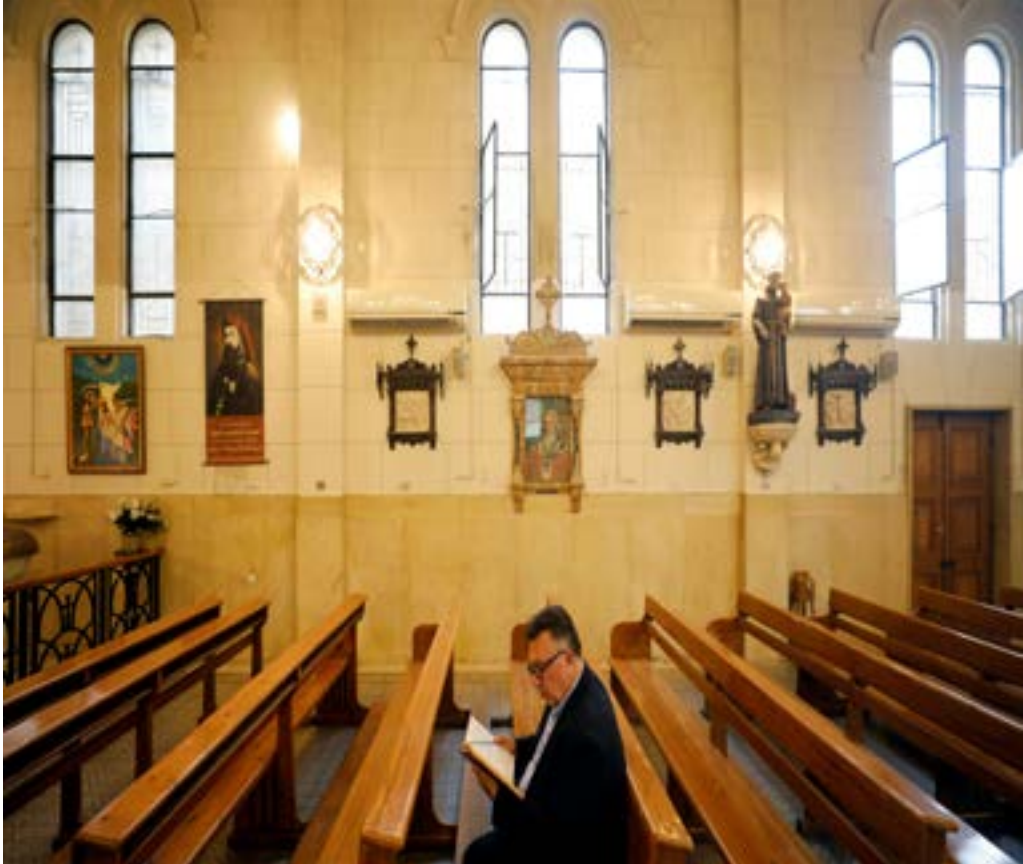
A man prays during an Easter mass led by Bishop Krikor Kousa at the Armenian Catholic Church as Egypt ramps up efforts to slow the spread of the coronavirus disease (COVID-19), in Cairo