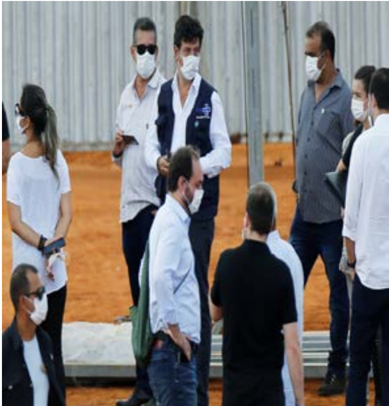
Brazil's Minister of Health Luiz Henrique Mandetta visits a temporary field hospital, amid coronavirus disease (COVID-19) outbreak, in Aguas Lindas