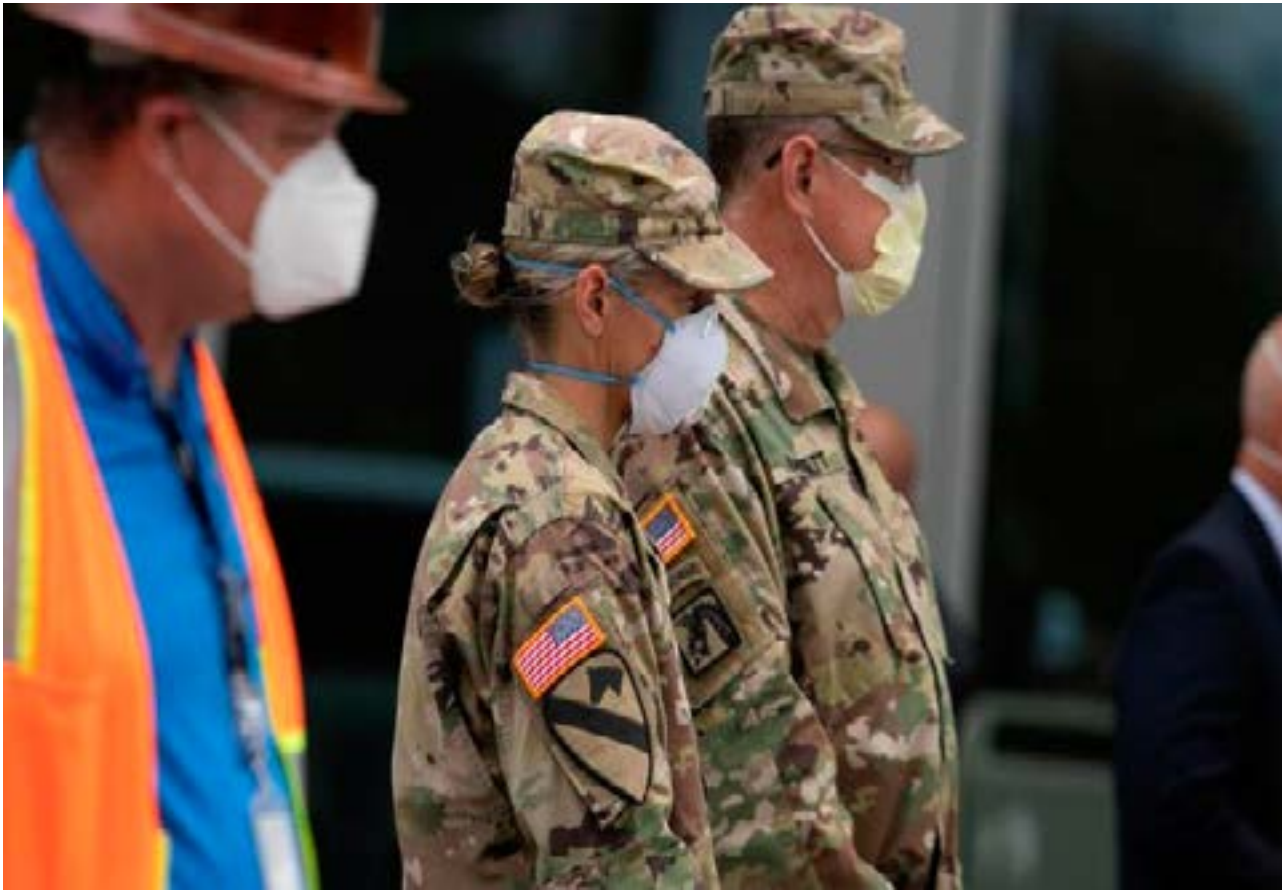
FILE PHOTO: Members of the U.S. Army Corps of Engineers stand outside the Miami Beach Convention Center as they prepare to build a coronavirus field hospital inside the facility, amid the coronavirus (COVID-19) disease outbreak, in Miami Beach, Florida,

In all, some 16.8 million American workers have applied