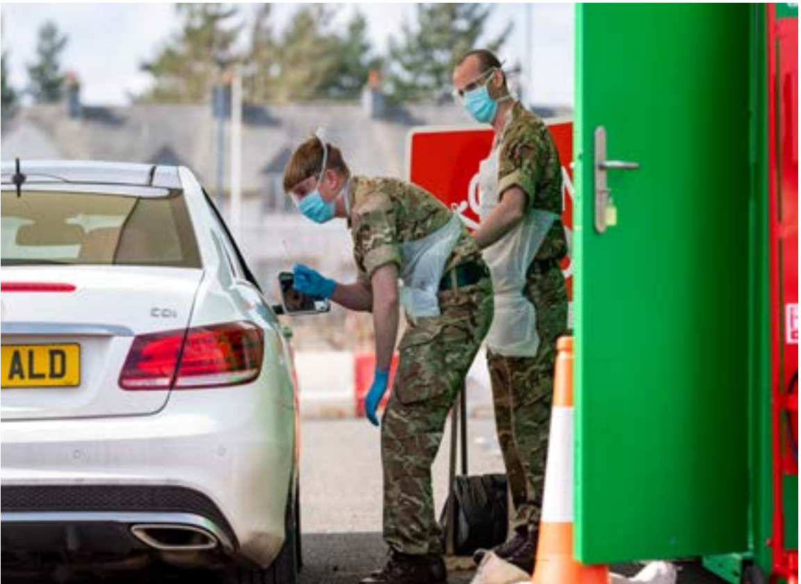
Scottish soldiers test the NHS workers for coronavirus disease (COVID-19), in a new testing facility, which has been set up at Glasgow Airport, in Glasgow, Scotland, Britain April 9, 2020.