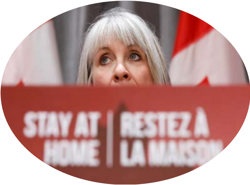
Canada's Minister of Health Patty Hajdu attends a news conference, as efforts continue to help slow the spread of coronavirus disease (COVID-19), in Ottawa, Ontario, Canada April 9, 2020.