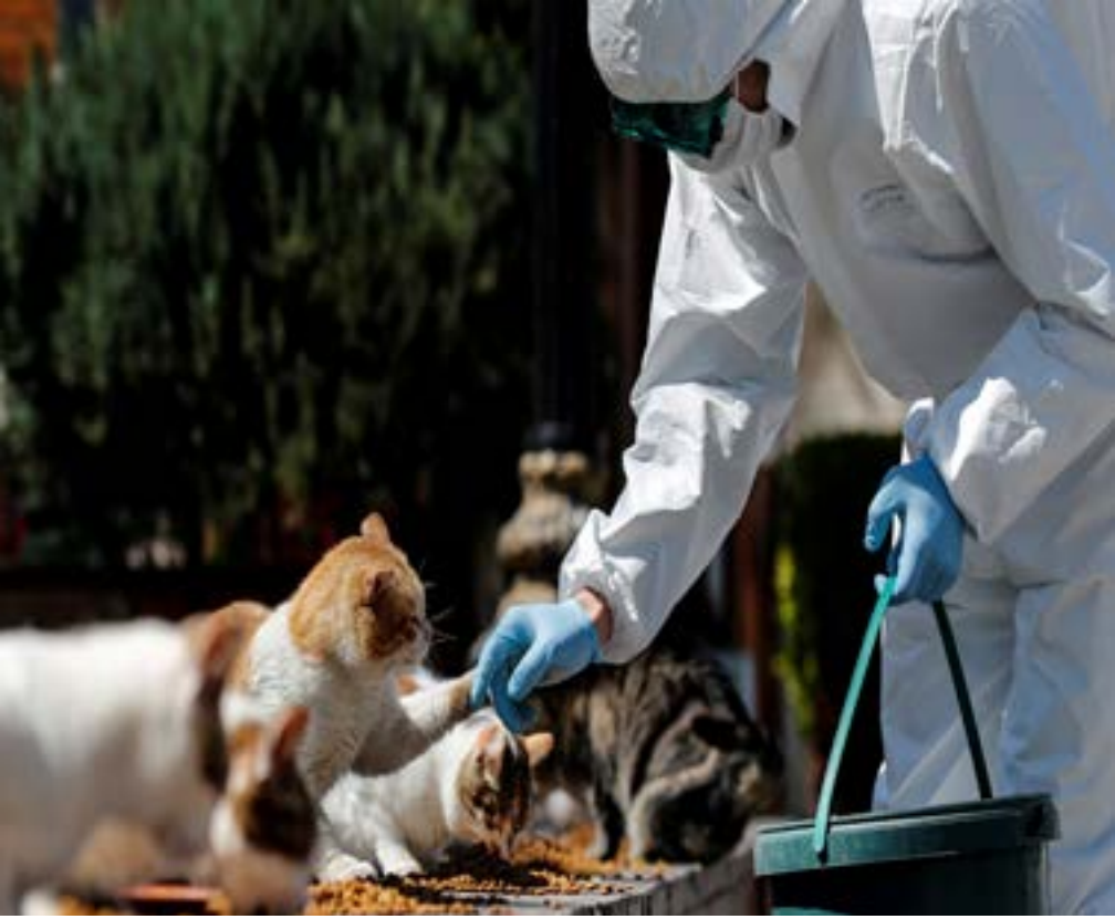
A municipality worker in a protective suit feeds street cats at Sultanahmet Square, as the spread of coronavirus disease (COVID-19) continues in Istanbul, Turkey, April 9, 2020.