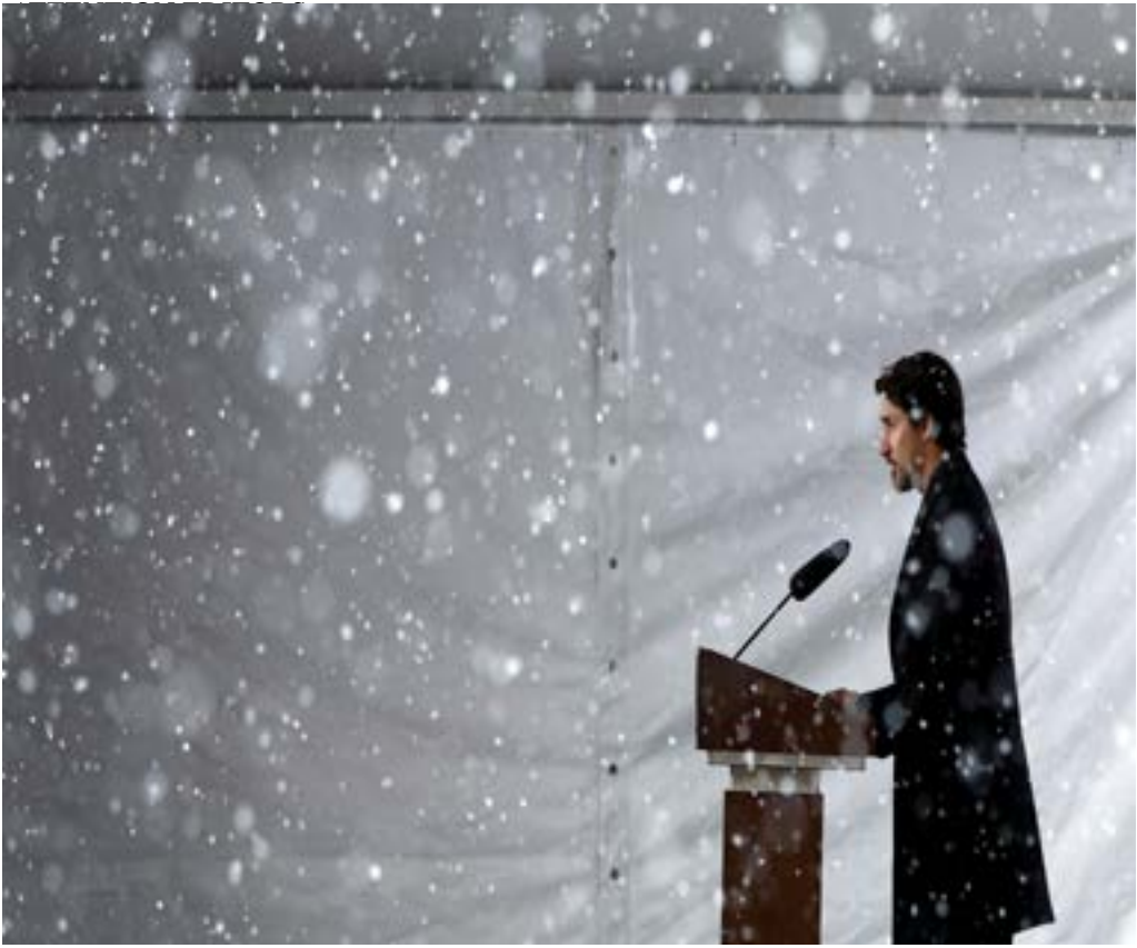
Canada's Prime Minister Justin Trudeau attends a news conference at Rideau Cottage, while the spread of the coronavirus disease (COVID-19) continues, in Ottawa, Ontario, Canada April 9, 2020.