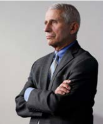
Dr. Anthony Fauci

Asked if he envisions a scenario in which all Americans would be tested and the results would allow certain people to return to society, Fauci expressed doubt that every American could be tested. But when the U.S. reaches the point of flooding society with the antibody tests, Fauci said, "I think something akin to what you're saying is possible." The Centers for Disease Control and Prevention issued new guidance Wednesday night for "critical infrastructure workers" that lay out criteria to meet and recommendations to follow before they return to work. (Courtesy https://www.nbcnews.com/ ) Dr. Fauci agrees NY likely seeing flattening of the curve on coronavirus Dr. Anthony Fauci agreed Thursday that New York is likely seeing the "flattening of the curve" in its coronavirus crisis — while revealing that antibody tests could be available in "days to weeks." America's top infectious disease expert agreed "with cautious optimism" that Gov. Andrew Cuomo was correct in predicting the Empire State had reached its peak and could soon see lowering daily death tolls. "I don't want to jump the gun on that, but I think that is the case," Fauci said on the "Today" show Thursday.