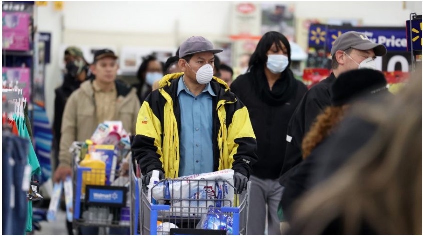
Compiled And Edited By John T. Robbins, Southern Daily Editor

Jobless claims filed in the United States soared to a near-record high of more than 6 million for the week ending April 4, as CCP virus-related lockdowns and closures continued to drive deep layoffs. The number of initial jobless claims filed across the country, which is a measure of the number of Americans filing new unemployment claims and is the most timely data on economic health, surged to 6,606,000, a slight drop of 261,000 from the previous week’s revised level, the Department of Labor figures show (pdf). The previous week’s figures were revised up by 219,000 from 6,648,000 to 6,867,000. Economists polled by Reuters said they expected weekly jobless claims for the week ended April 4 to come it at 5.25 million, while some estimates were as high as 9.295 million. “These dismal numbers suggest another record-breaking April jobs report,” said Beth Ann Bovino, chief U.S. economist at S&P Global Ratings in New York. “America is now in recession and as it appears to deepen, the question is how