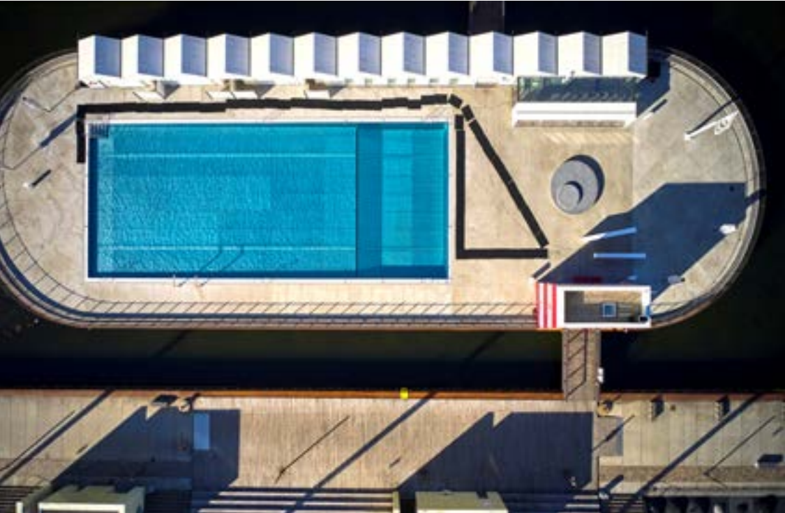
A view of an Odense Havnebad during the spread of the coronavirus disease (COVID-19) in Odense, Denmark April 9, 2020. Picture taken with a drone. Mikkel Berg Pedersen/Ritzau Scanpix/via REUTERS ATTENTION EDITORS -