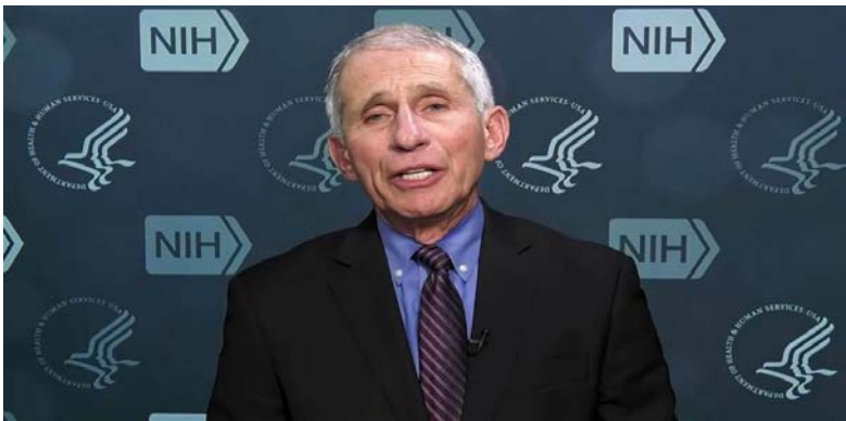
Dr. Anthony Fauci