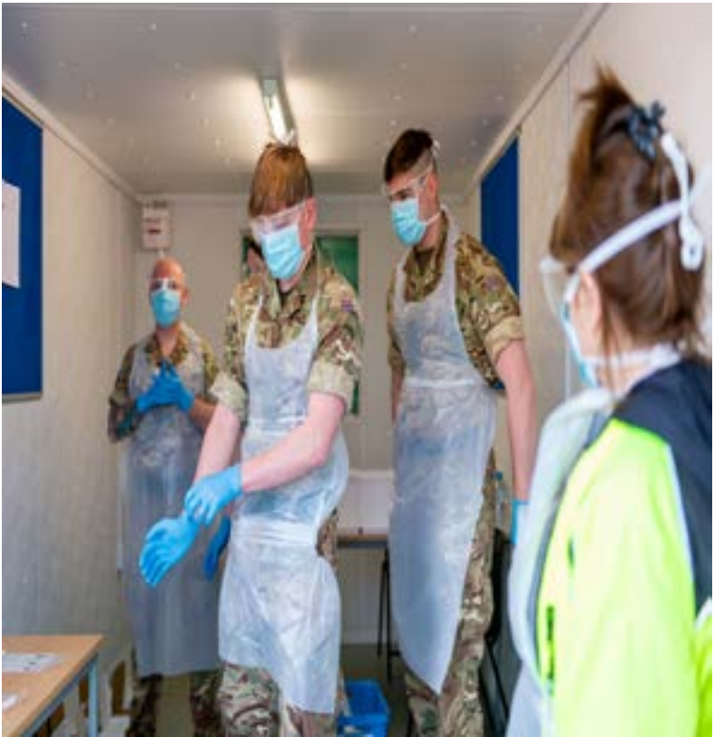
Scottish soldiers prepare to test the NHS workers for coronavirus disease (COVID-19), in a new testing facility, which has been set up at Glasgow Airport, in Glasgow, Scotland, Britain April 9, 2020.