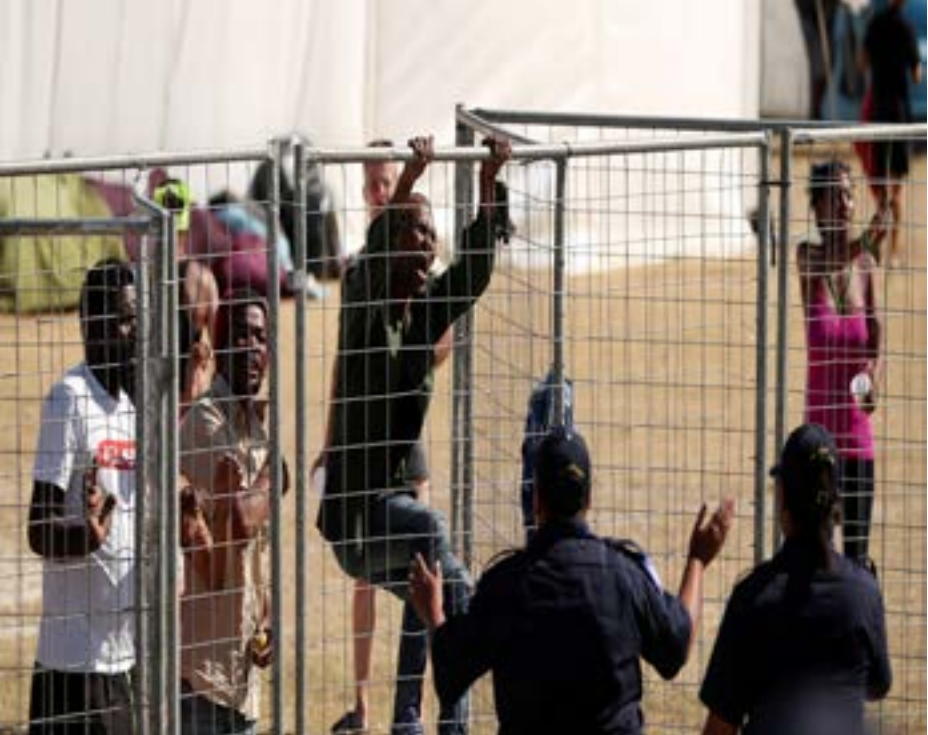
Tensions flare as homeless people attempt to speak to journalists at a camp set up by disaster management authorities during the 21-day nationwide lockdown aimed at limiting the spread of coronavirus disease (COVID-19) in Cape Town