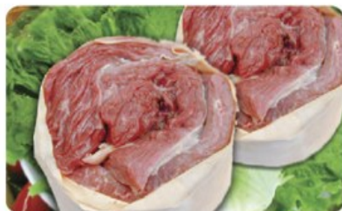
BEEF DROP FLANK 牛腩