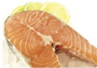
FRESH SALMON STEAK