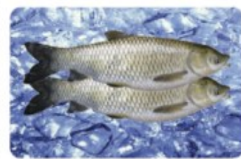
FRESH GRASS CARP