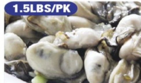
PREMIUM FROZEN OYSTER MEAT