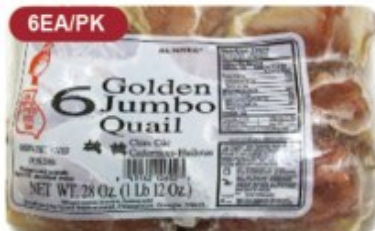
QUAIL G/D 6 JUMBO 鸕鶿