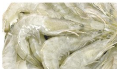
30/40 H/O WHITE SHRIMP