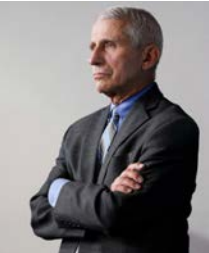
Dr. Anthony Fauci

Asked if he envisions a scenario in which all Americans would be tested and the results would allow certain people to return to society, Fauci expressed doubt that every American could be tested. But when the U.S. reaches the point of flooding society with the antibody tests, Fauci said, "I think something akin to what you're saying is possible." The Centers for Disease Control and Prevention issued new guidance Wednesday night for "critical infrastructure workers" that lay out criteria to meet and recommendations to follow before they return to work. (Courtesy https://www.nbcnews.com/ ) Dr. Fauci agrees NY likely seeing flattening of the curve on coronavirus Dr. Anthony Fauci agreed Thursday that New York is likely seeing the "flattening of the curve" in its coronavirus crisis — while revealing that antibody tests could be available in "days to weeks." America's top infectious disease expert agreed "with cautious optimism" that Gov. Andrew Cuomo was correct in predicting the Empire State had reached its peak and could soon see lowering daily death tolls. "I don't want to jump the gun on that, but I think that is the case," Fauci said on the "Today" show Thursday.