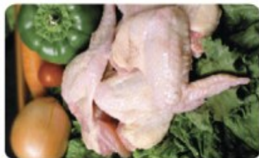
CHICKEN WING 雞翅膀