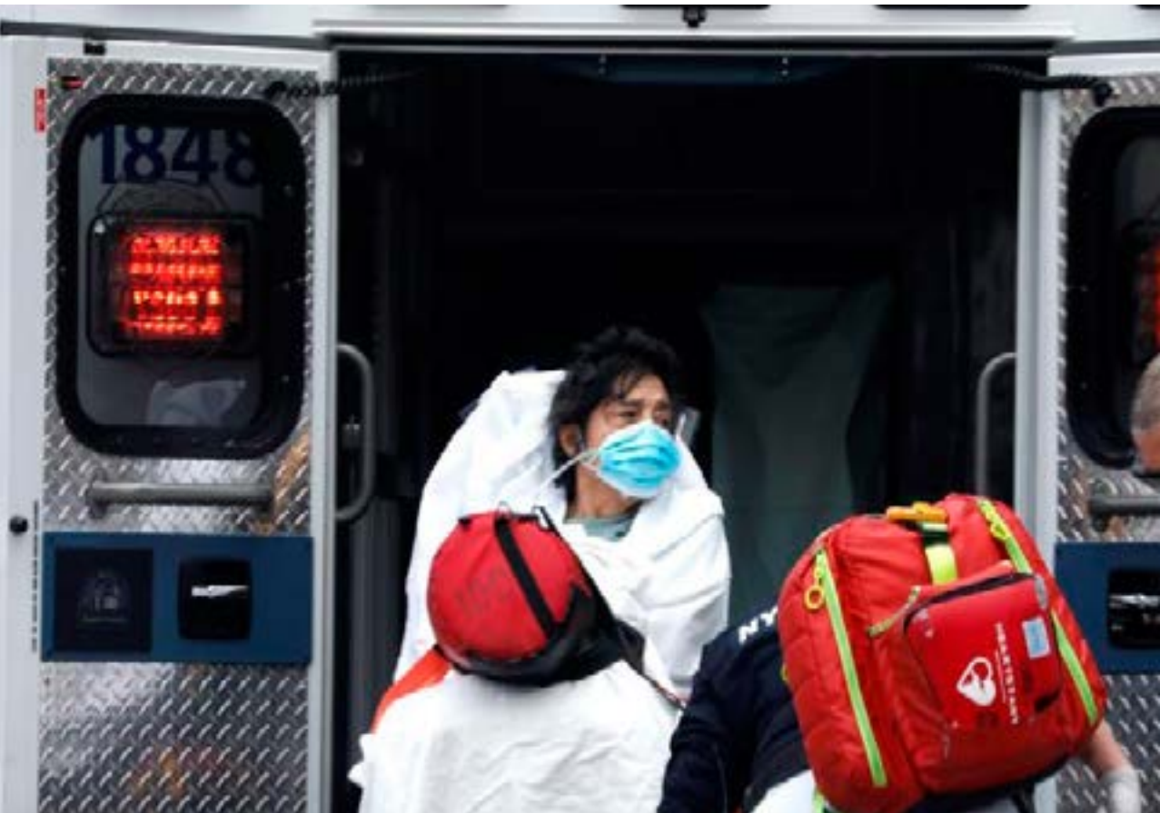
A woman is loaded into an ambulance by paramedics in the Harlem neighbourhood of Manhattan during the outbreak of the coronavirus disease (COVID19) in New York City, New York, U.S., April 8, 2020.

Even that revised forecast suggested months of pain ahead for the United States. All told, about 400,000 U.S. infec-