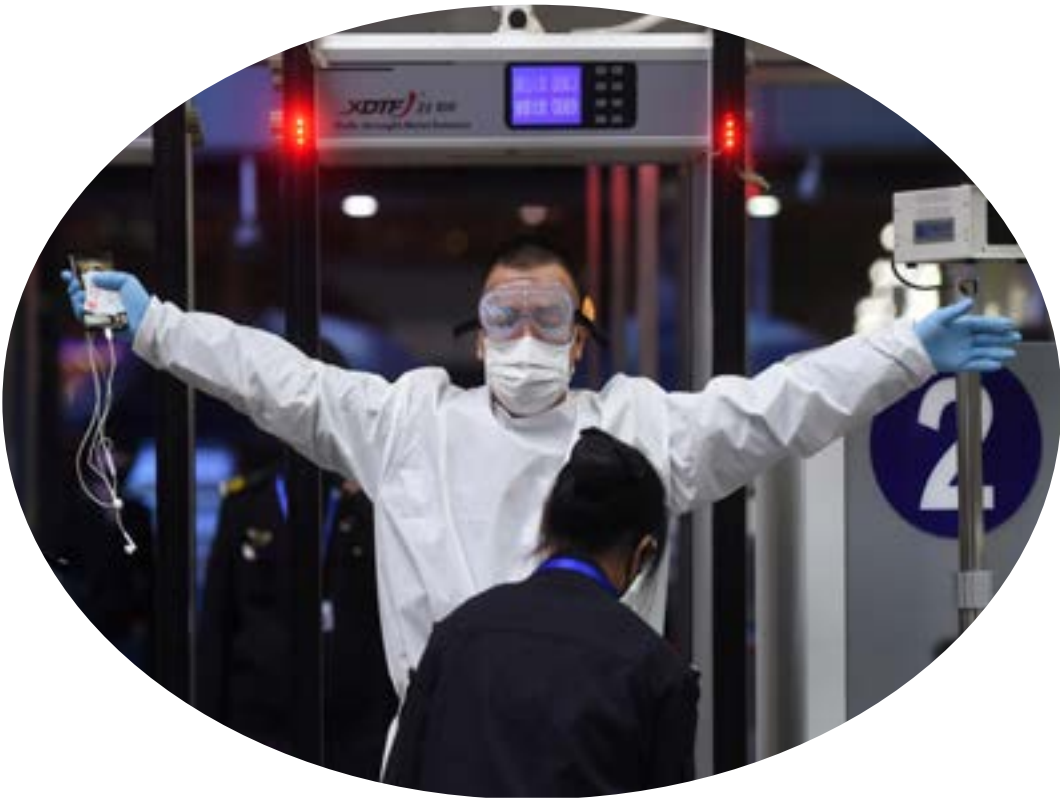
A man wearing protective gear gets through security check at Wuchang Railway Station before travel restrictions to leave Wuhan, the capital of Hubei province and China's epicentre of the novel coronavirus disease (COVID-19) outbreak, are lifted, April 7, 2020. Picture taken April 7, 2020. REUTERS/Stringer CHINA OUT.