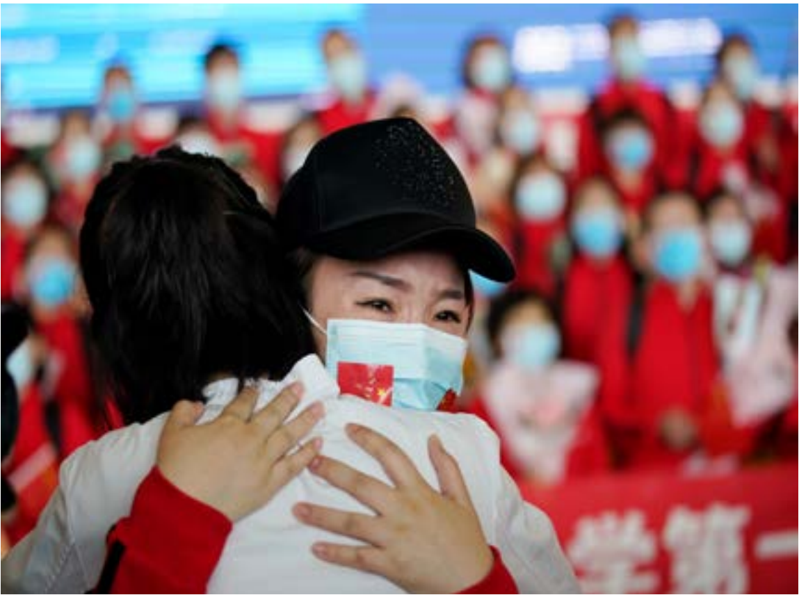
A member of a medical team reacts at the Wuhan Tianhe International Airport after travel restrictions to leave Wuhan, the capital of Hubei province and China's epicentre of the novel coronavirus disease (COVID-19) outbreak, were lifted, April 8, 2020.