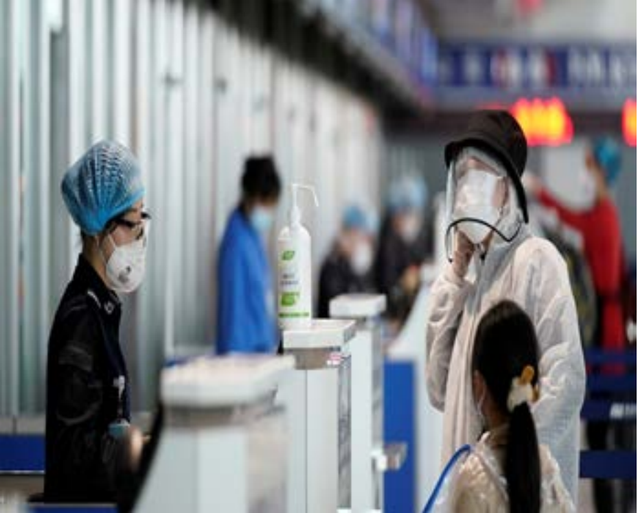
Travellers wearing protective gear are seen at a check-in counter at the Wuhan Tianhe International Airport after travel restrictions to leave Wuhan, the capital of Hubei province and China's epicentre of the novel coronavirus disease (COVID-19) outbreak, were lifted, April 8, 2020.