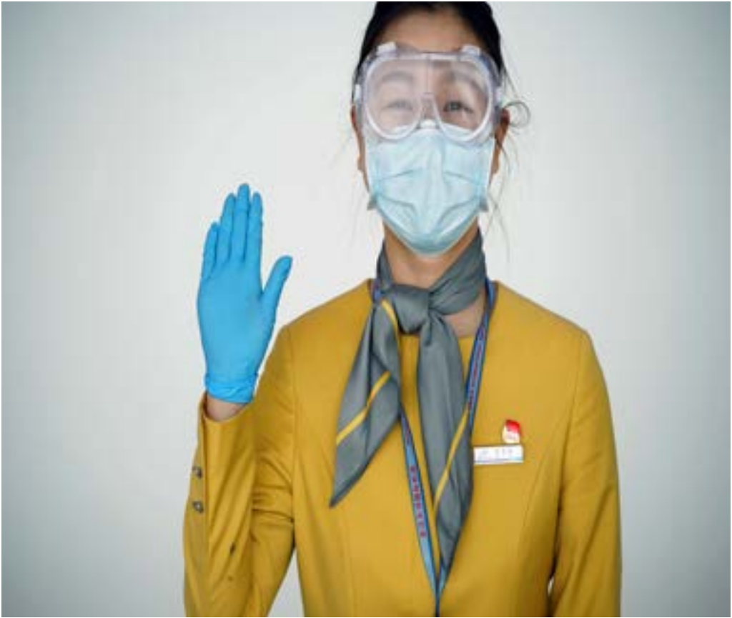
A staff member wearing face mask and goggles reacts to the camera at a counter at the Wuhan Tianhe International Airport after travel restrictions to leave Wuhan, the capital of Hubei province and China's epicentre of the novel coronavirus disease (COVID-19) outbreak, were lifted, April 8,