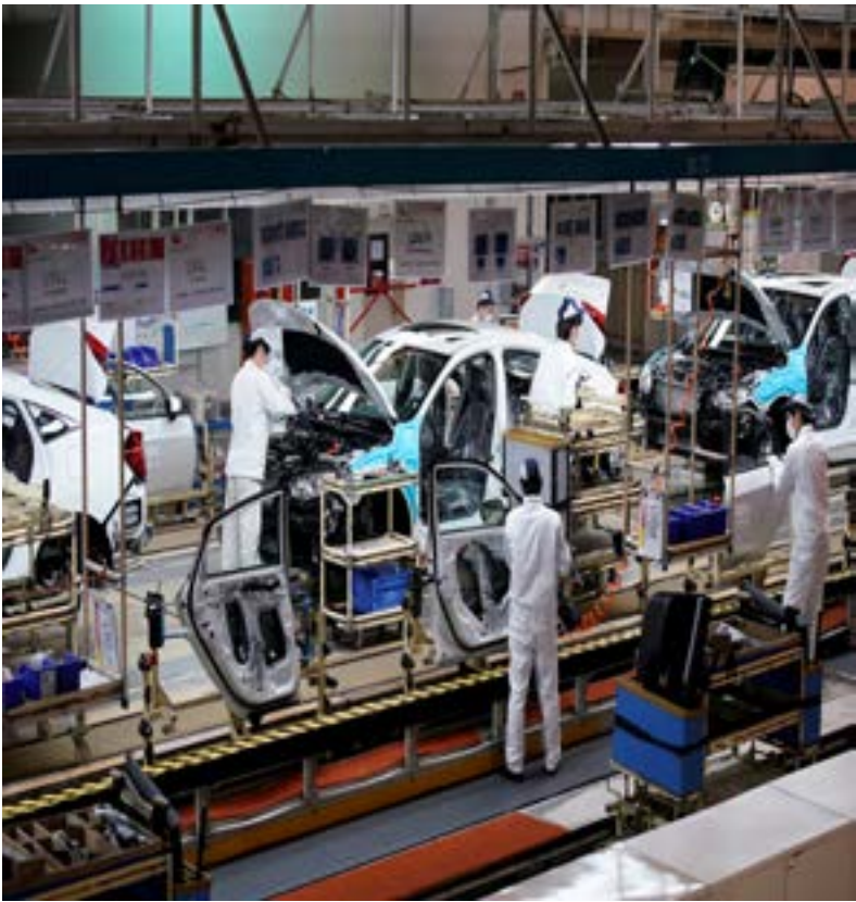
Employees work on a production line inside a Dongfeng Honda factory after lockdown measures in Wuhan, the capital of Hubei province and China's epicentre of the novel coronavirus disease (COVID-19) outbreak, were further eased, April 8, 2020.