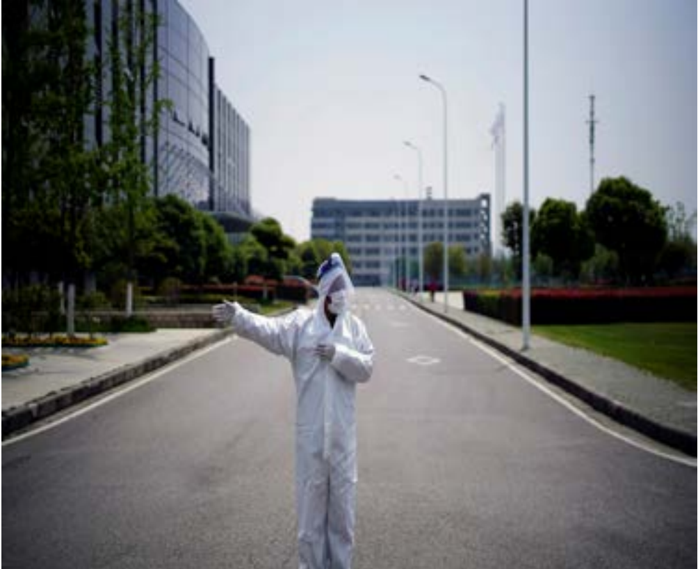
A worker in a protective suit is seen at a Dongfeng Honda factory after lockdown measures in Wuhan, the capital of Hubei province and China's epicentre of the novel coronavirus disease (COVID-19) outbreak, were further eased, April 8, 2020.