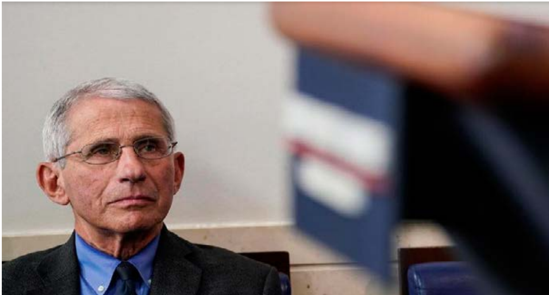
FILE PHOTO: Dr. Anthony Fauci, director of the National Institute of Allergy and Infectious Diseases, listens during the daily coronavirus task force briefing at the White House in Washington, U.S., April 7, 2020.

WASHINGTON (Reuters) - U.S. health officials are planning ways for the country to return to normal activities if distancing and other steps to mitigate COVID-19 this month prove successful in curbing the outbreak, the top U.S. infectious disease official said on Wednesday. The Trump administration has called for 30 days of measures, including staying at least six feet away from other people, that have upended American life as most people stay isolated at home, shuttering schools and closing businesses through at least the end of April, with some states continuing certain closures through May and June. Dr. Anthony Fauci, the head of the National Institute of Allergy and Infectious Diseases, said such steps must continue but that there are hopeful signs they are working.