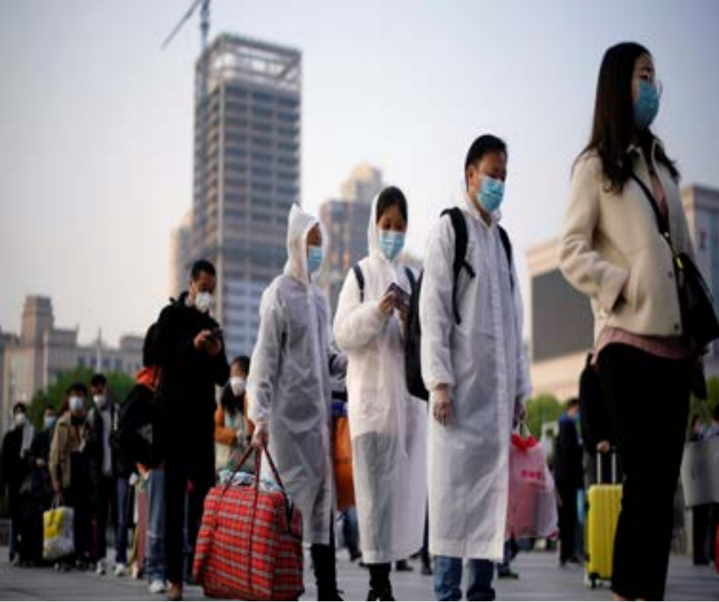
Travellers line up with their belongings outside Hankou Railway Station after travel restrictions to leave Wuhan, the capital of Hubei province and China's epicentre of the novel coronavirus disease (COVID-19) outbreak, were lifted, April 8, 2020.