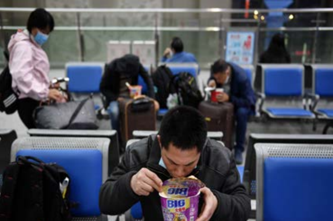
Travellers eat instant noodles at Wuchang Railway Station before travel restrictions to leave Wuhan, the capital of Hubei province and China's epicentre of the novel coronavirus disease (COVID-19) outbreak, are lifted, April 7, 2020. Picture taken April 7, 2020