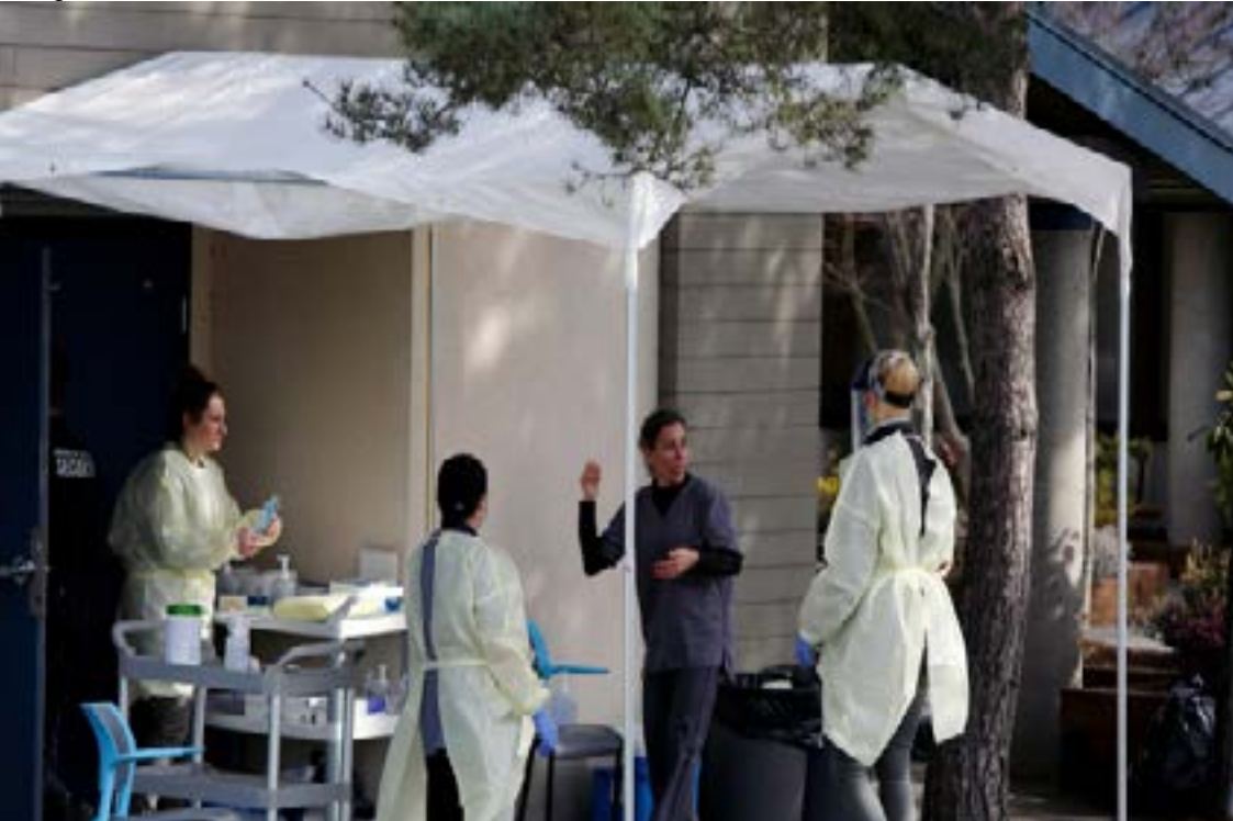
Medical staff assess for COVID-19 at public Victoria Health Unit, BC