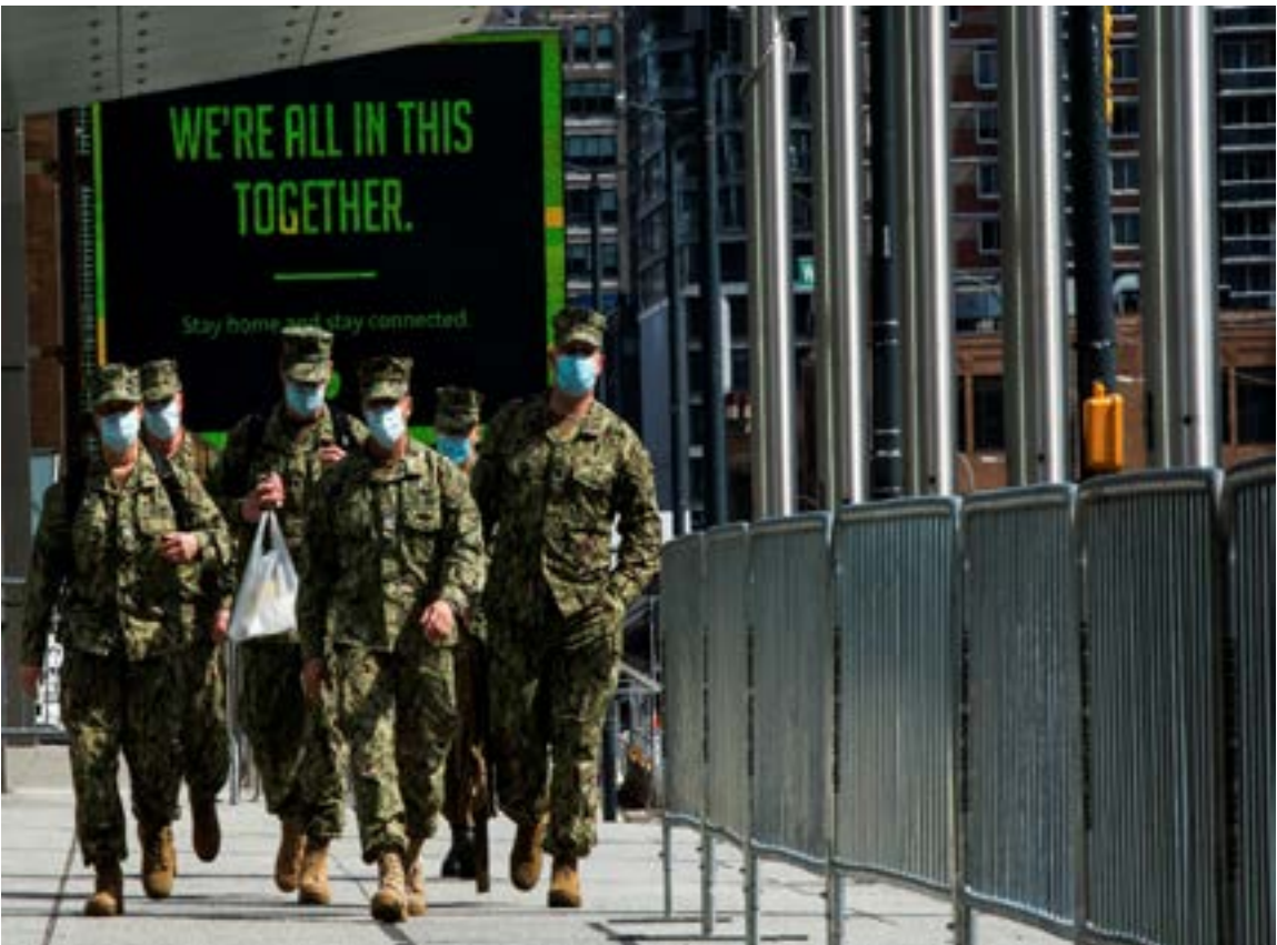
U.S. military personnel wearing face masks arrive at the Jacob K. Javits Convention Center as the outbreak of the coronavirus disease (COVID-19) continues, in the Manhattan borough of New York City, New York, U.S., April 7, 2020.