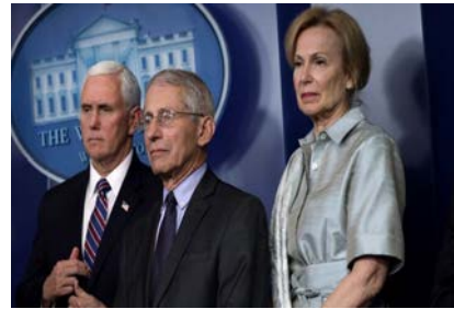
U.S. Vice President Mike Pence, Director of the National Institute of Allergy and Infectious Diseases Dr. Anthony Fauci, and White House Coronavirus Response Coordinator Deborah Birx listen during a news briefing on the latest development of the coronavirus outbreak in the U.S. at the James Brady Press Briefing Room at the White House.

WASHINGTON - The White House Coronavirus Task Force over the weekend urged Americans to avoid going to grocery stores and pharmacies over the next two weeks as the pandemic is expected to worsen across the country. Dr. Deborah Birx, the White House’s task force coordinator, made the warning during a weekend press conference. “The next two weeks are extraordinarily important,” said Birx. “This is the moment to not be going to the grocery store, not going to the pharmacy, but doing everything you can to keep your family and your friends safe and that means everybody doing the 6-feet distancing, washing their hands.” Her remarks were echoed by Dr. Anthony Fauci, the director of the National Institute of Allergy and Infectious Diseases and a member of the task force, who emphasized the importance of social distancing to slow the spread of COVID-19. “As sobering and a difficult as this is, what we are doing is making a difference,” Fauci said. But even as Fauci urged Americans to be patient and let mitigation efforts work, Trump said: “Mitigation does work. But again, we’re not going to destroy our