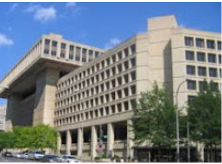
The FBI office in Houston, Texas, is located at 1 Justice Park Dr, Houston, TX 77092

Please use the information on this link https://www.fbi.gov/coronavirus to keep you and your family safe from threats at this time.