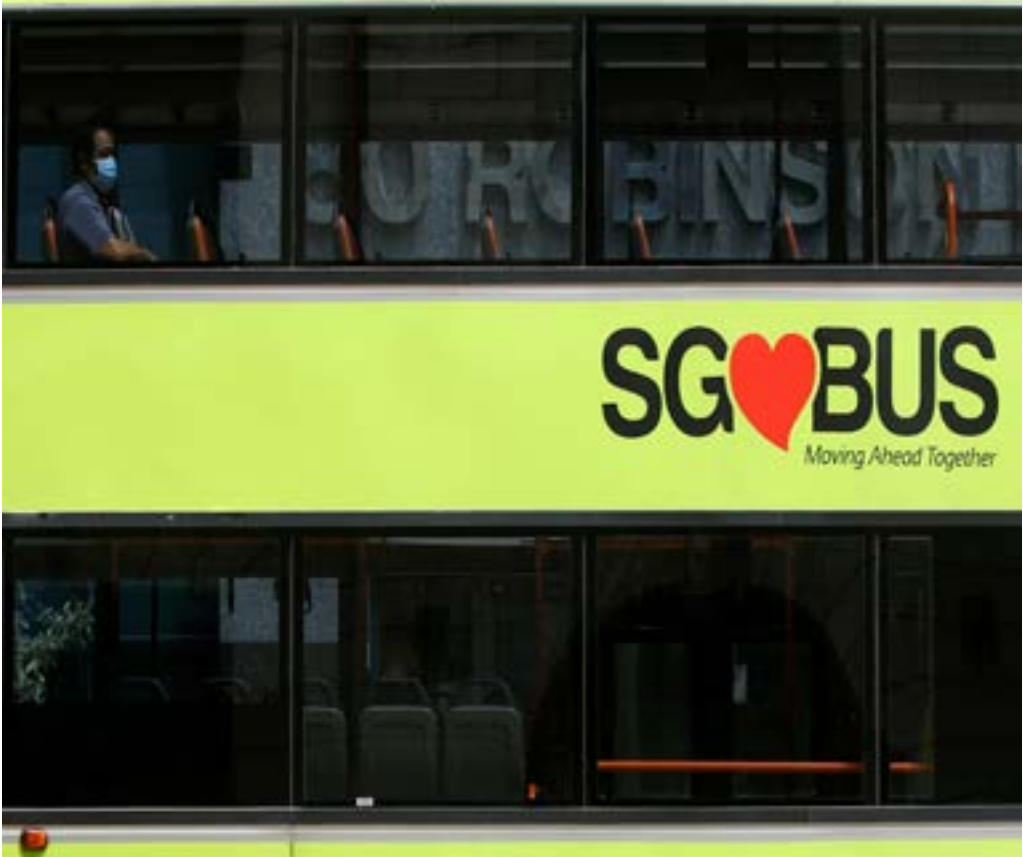
A man travels on an almost empty bus on the first day of “circuit breaker” measures to curb the outbreak of coronavirus (COVID-19) at the central business district in Singapore, April 7, 2020.