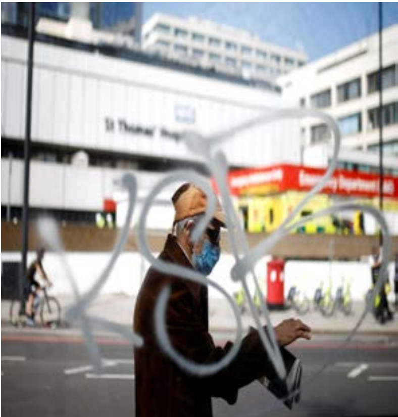
A man wears a protective face mask outside St Thomas’ Hospital, after British Prime Minister Boris Johnson was moved to intensive care while his coronavirus (COVID-19) symptoms worsened and has asked Secretary of State for Foreign affairs Dominic Raab to deputise, in London, Britain, April 7, 2020.