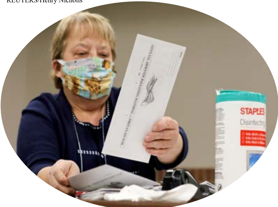
Absentee ballots are counted during the presidential primary election in Wisconsin