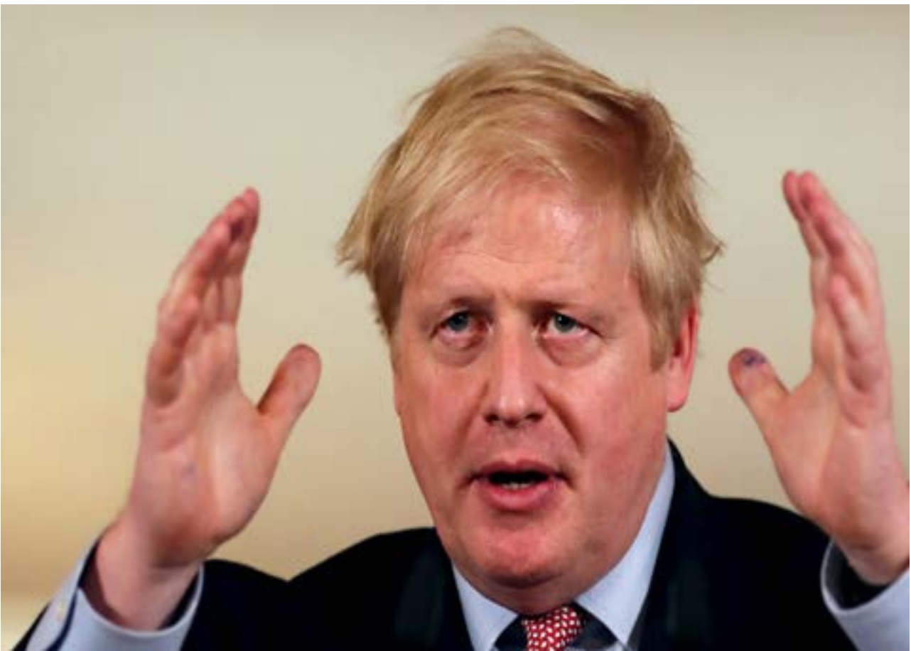
FILE PHOTO: British Prime Minister Boris Johnson delivers a joint statement with French President Emmanuel Macron (not seen) before a meeting on Brexit at the Elysee Palace in Paris, France, August 22, 2019.

WHO LEADS? The absence of Johnson, the first leader of a major power to be admitted to hospital with COVID-19, the illness caused by the novel coronavirus, has raised questions about who is truly in charge at such a crucial time.