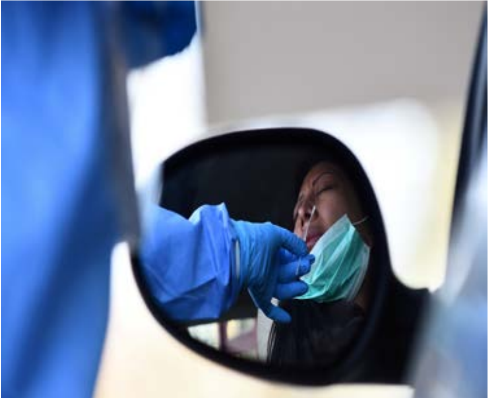
A health worker wearing a protective gear takes a swab from a person sitting in a car, as the spread of coronavirus disease (COVID-19) continues, in Collegno, near Turin, Italy, April 7, 2020.