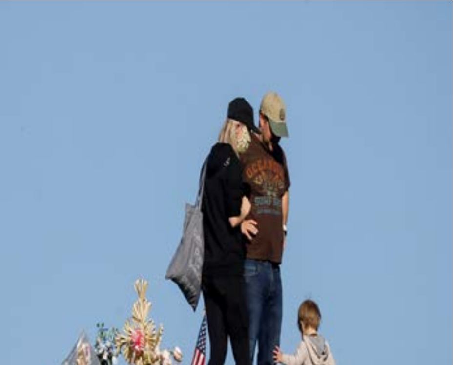
A family walk in Green-Wood Cemetery, during the outbreak coronavirus disease (COVID-19) in the Brooklyn borough of New York City, U.S., April 6, 2020.