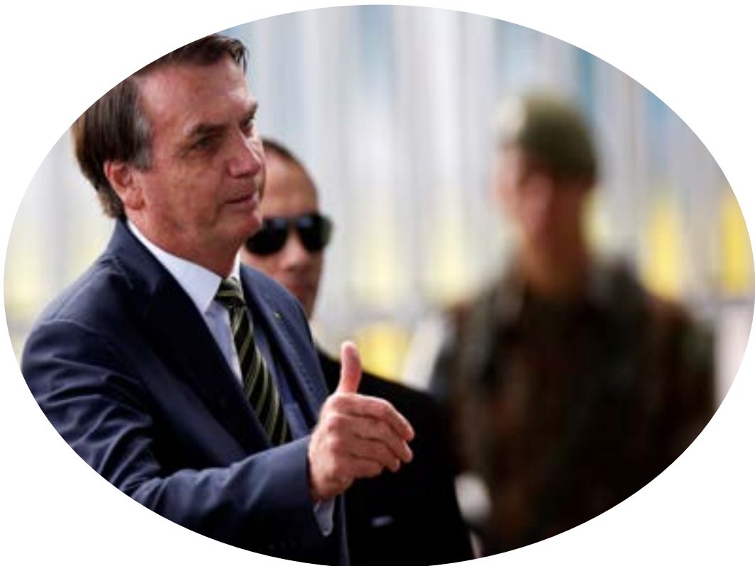
Brazil's President Jair Bolsonaro looks on near a Brazilian Army soldier as he leaves the Alvorada Palace, amid the coronavirus disease (COVID-19) outbreak