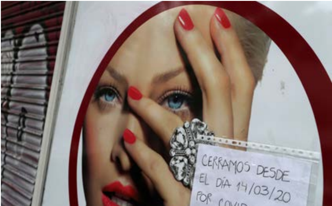
A banner reading "we are closed from March 14 until further notice due to COVID-19" is seen on the door of a closed business during the lockdown amid the coronavirus disease (COVID-19) outbreak, in Madrid, Spain, April 6, 2020.