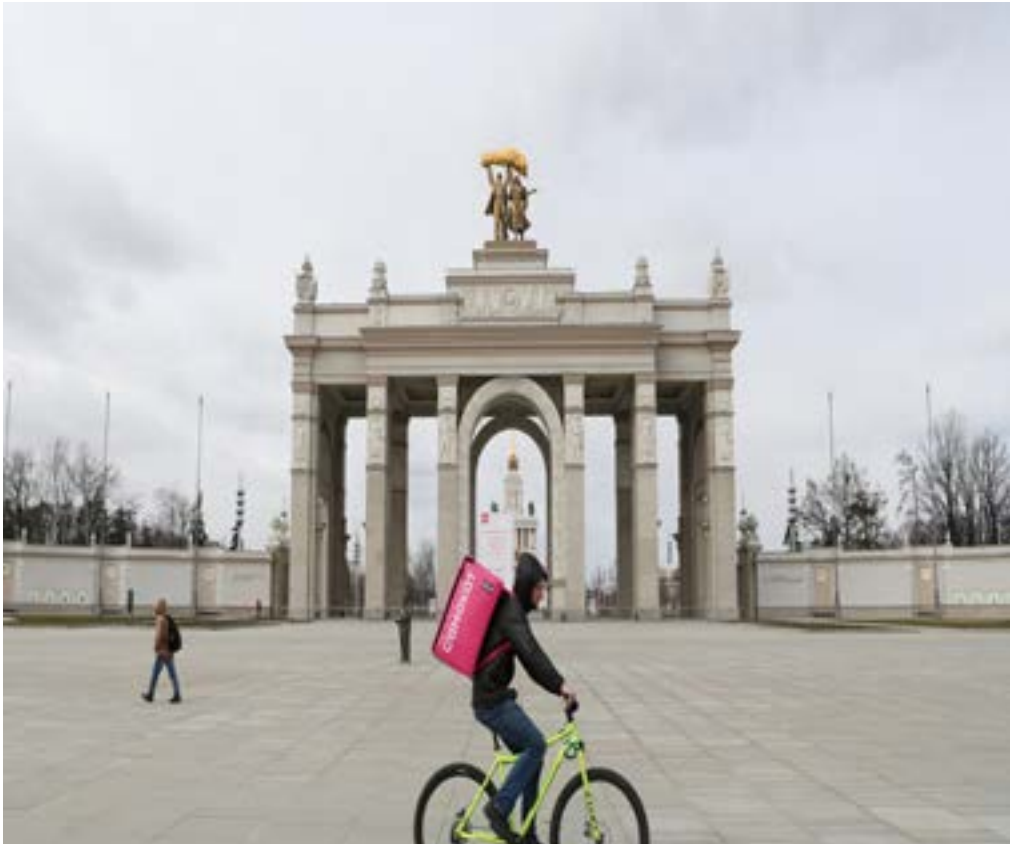
A delivery courier rides a bicycle past an entrance of the temporarily closed Exhibition of Achievements of National Economy (VDNKh), after the city authorities announced a partial lockdown ordering residents to stay at home to prevent the spread of the coronavirus disease (COVID-19), in Moscow, Russia April 6, 2020.