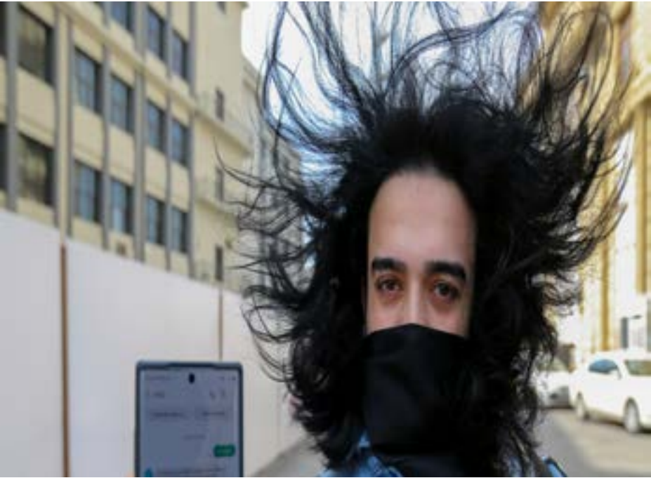
A man shows his mobile phone with permission to leave home, received in a text message, after the authorities imposed restrictions on movement to prevent the spread of the coronavirus disease (COVID-19) in Baku, Azerbaijan April 6, 2020. According to the new restrictions, citizens have to obtain permission by sending a text message in order to leave home for essential trips, including visits to grocery stores, pharmacies, medical facilities, banks or post offices, or to attend funerals.