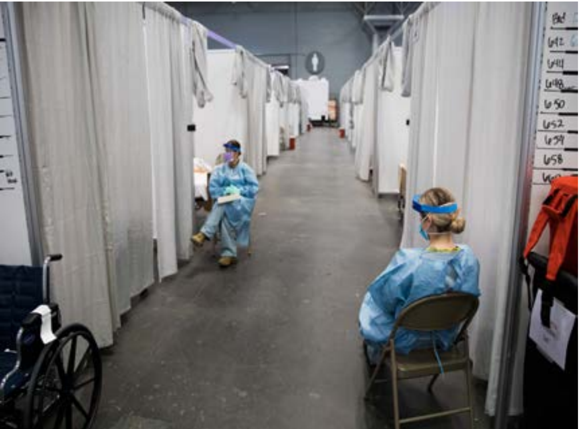
Soldiers assigned to the Javits New York Medical Station monitor coronavirus disease (COVID-19) patients in the facility's intensive care unit in the Manhattan borough of New York City, U.S., April 4, 2020. Picture taken April 4, 2020.