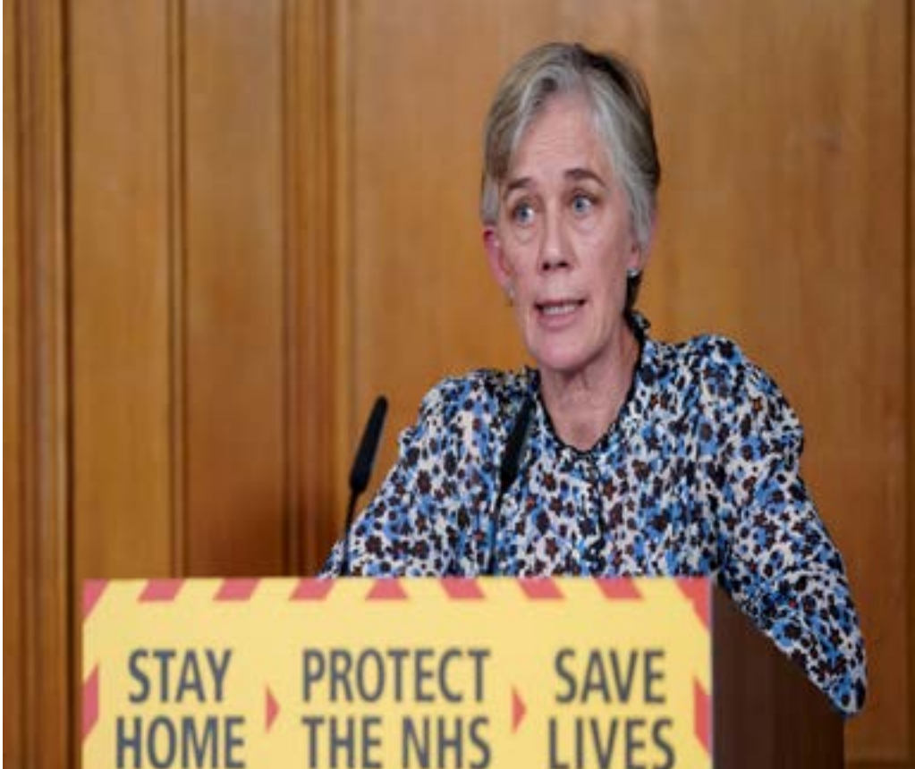
Britain's Chief Scientific Adviser for the Ministry of Defence Angela MacLean speaks during a COVID-19 Digital Press Conference at 10 Downing Street in London, Britain April 6, 2020