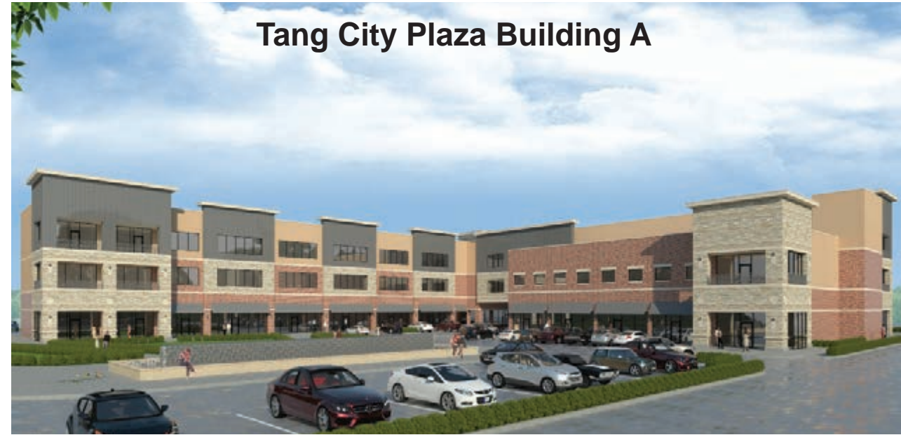
Tang City Plaza Building A