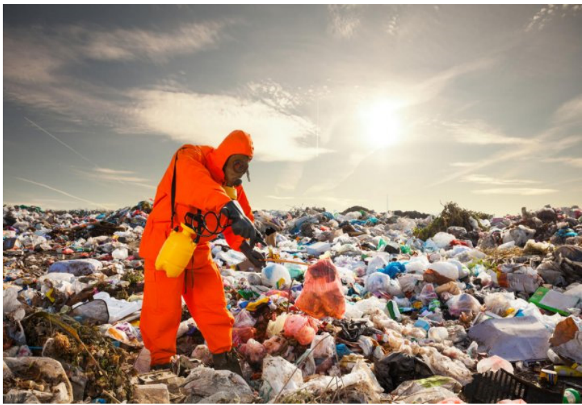
A worker sifts through a mountain of medical waste. China has also seen staggering amounts of medical waste. It is unclear if U.S. impacts might be similar, but U.S. companies are closely monitoring new developments and seeking new guidelines from the federal government.