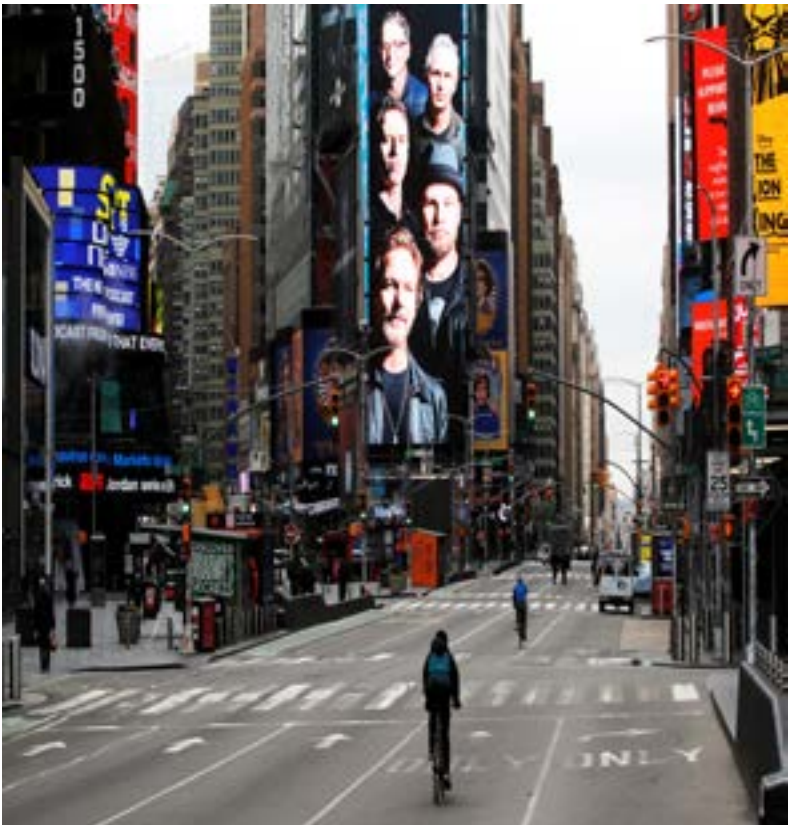
FILE PHOTO: Cyclists ride through a nearly empty Times Square during the coronavirus disease (COVID-19) in New York