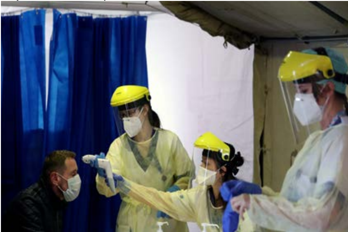
Members of medical personnel test a person for the coronavirus disease (COVID-19) at the testing site of the Erasme Hospital in Brussels, Belgium, March 30, 2020. REUTERS/Yves Herman - RC-2FUF97ROL6/File Phot