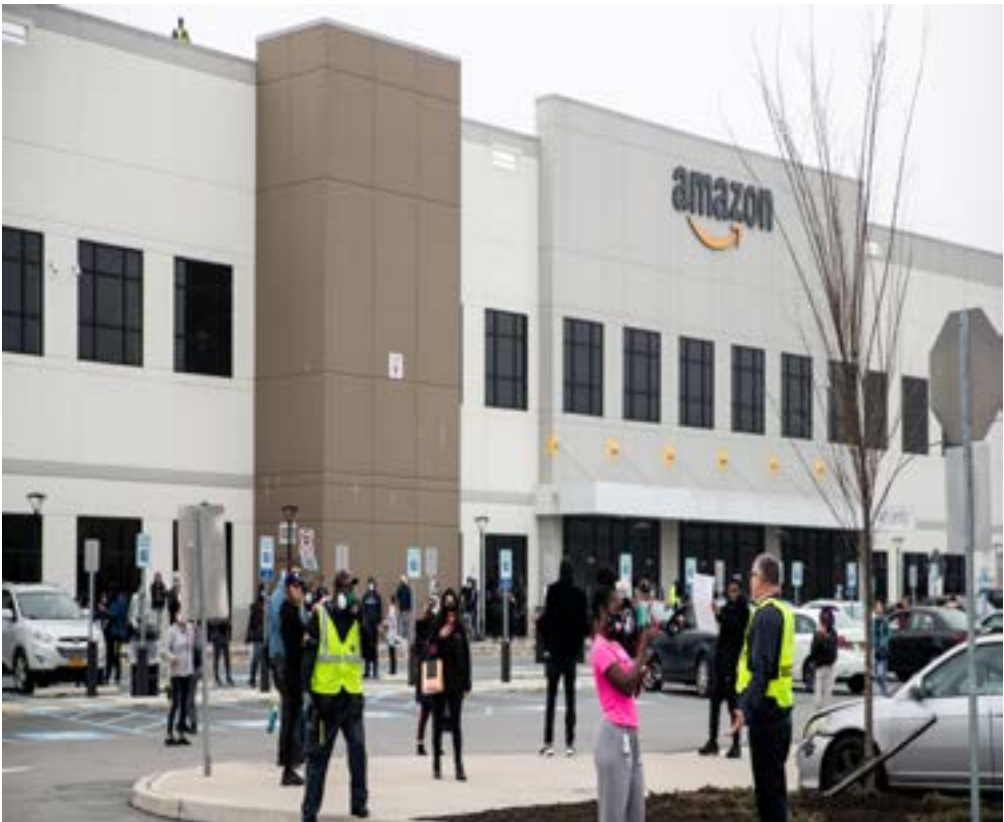
FILE PHOTO: FILE PHOTO: Protesters are seen at Amazon building in the Staten Island borough of New York City, U.S., March 30, 2020.