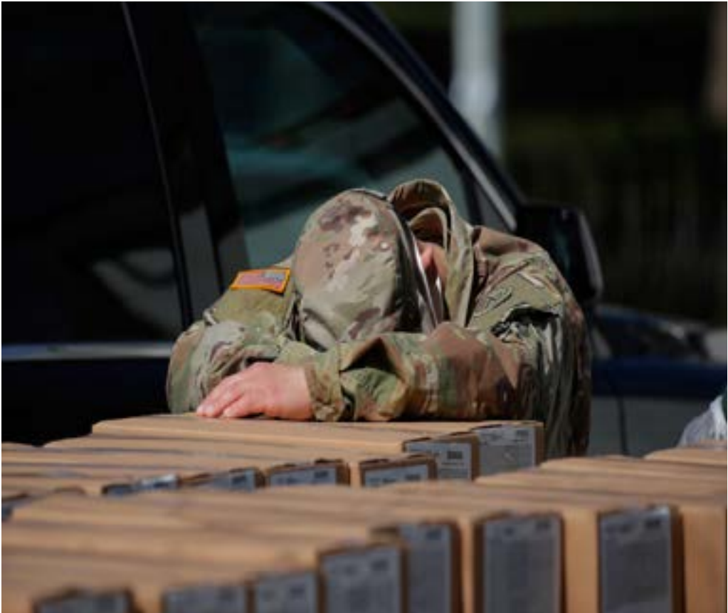
A U.S. Army National Guard member rests on boxes of preferred meals that were being distributed free to residents in the East Harlem section of Manhattan during the outbreak of the coronavirus disease (COVID-19) in New York City, New York, U.S., April 1, 2020.