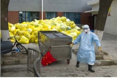
China, where the coronavirus first emerged, built a new medical waste plant

quickly as it is now, "networks of hospitals, waste haulers and treatment centers could be overburdened by a surge of regulated medical waste — masks, gloves, booties, bed linens, cups, plates, towels, packaging and disposable medical equipment," the LA Times said. That surge in contaminated trash threatens the health of disposal workers, according to the Times.