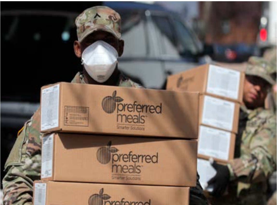
U.S. Army National Guard personnel unload boxes of preferred meals to distribute free to residents in the East Harlem section of Manhattan during the outbreak of the coronavirus disease (COVID-19) in New York City, New York, U.S., April 1, 2020.