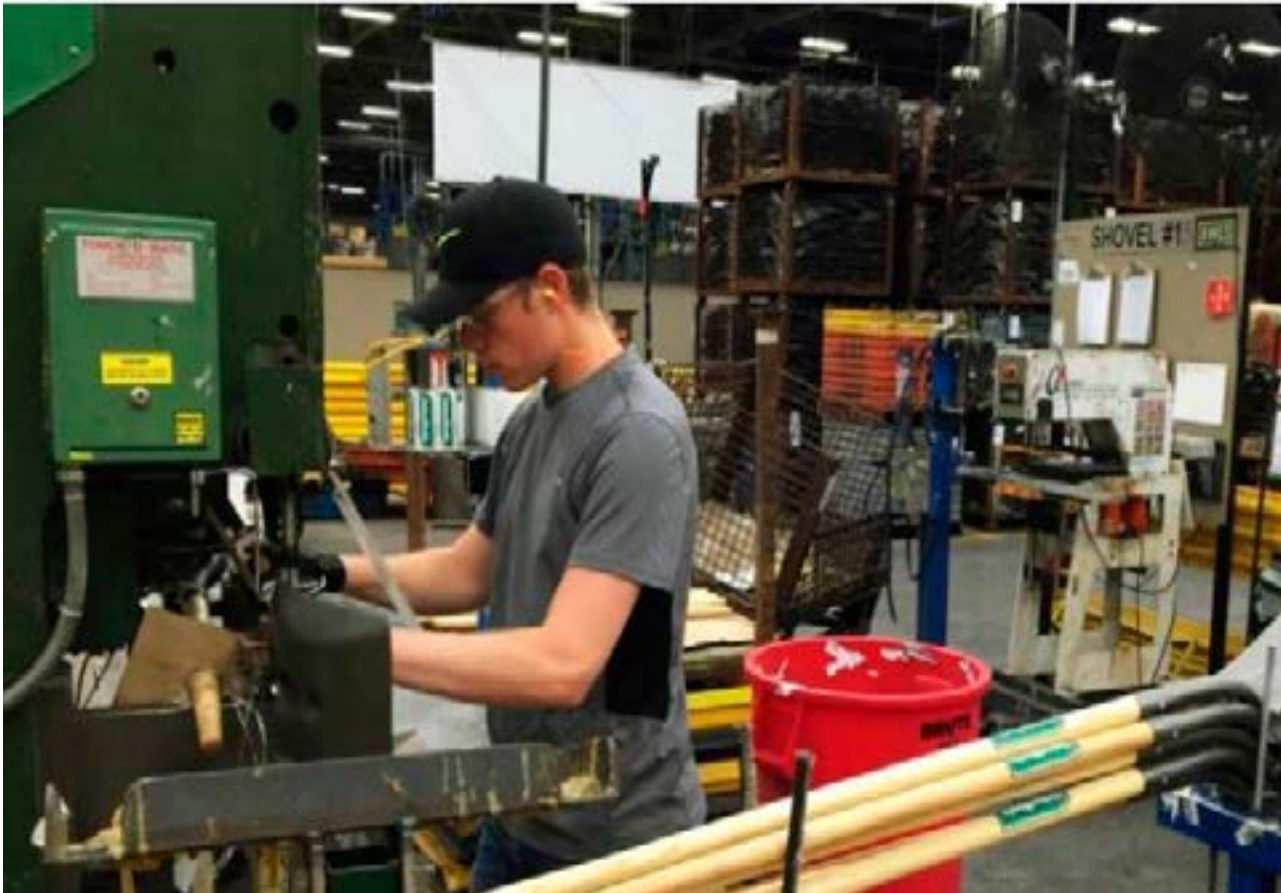
FILE PHOTO: A production line employee works at the AMES Companies shovel manufacturing factory in Camp Hill, Pennsylvania, U.S. on June 29, 2017.

The smaller-than-expected drop in the ISM index reflected a jump in the survey's measure of supplier deliveries to a reading of 65.0 this month from 57.3 in February. A lengthening in suppliers' delivery times is normally associated with increased activity, which would be a positive contribution to the index. But in this case slower supplier deliveries indicate supply shortages related to the coronavirus pandemic and not stronger demand.