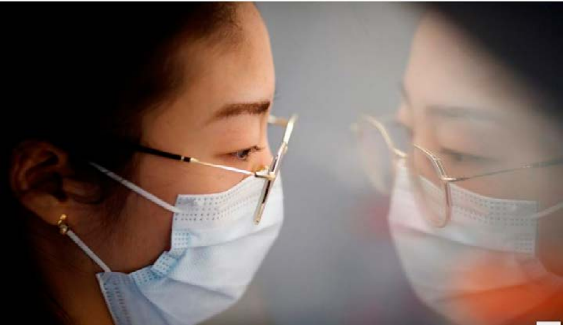
A scientist works in the lab of Linqi Zhang on research into novel coronavirus disease (COVID-19) antibodies for possible use in a drug at Tsinghua University’s Research Center for Public Health in Beijing, China, March 30, 2020.

BEIJING (Reuters) - A team of Chinese scientists has isolated several antibodies that it says are “extremely effective” at blocking the ability of the new coronavirus to enter cells, which eventually could be helpful in treating or preventing COVID-19. There is currently no proven effective treatment for the disease, which originated in China and is spreading across the world in a pandemic that has infected more than 850,000 and killed 42,000.