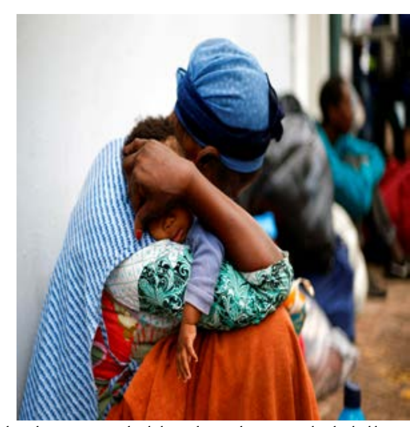
A homeless woman puts her baby to sleep as they queue to be checked by health officials before heading to shelters, during a nationwide 21 day lockdown in an attempt to contain the coronavirus disease (COVID-19) outbreak, in Durban, South Africa, March 27, 2020.