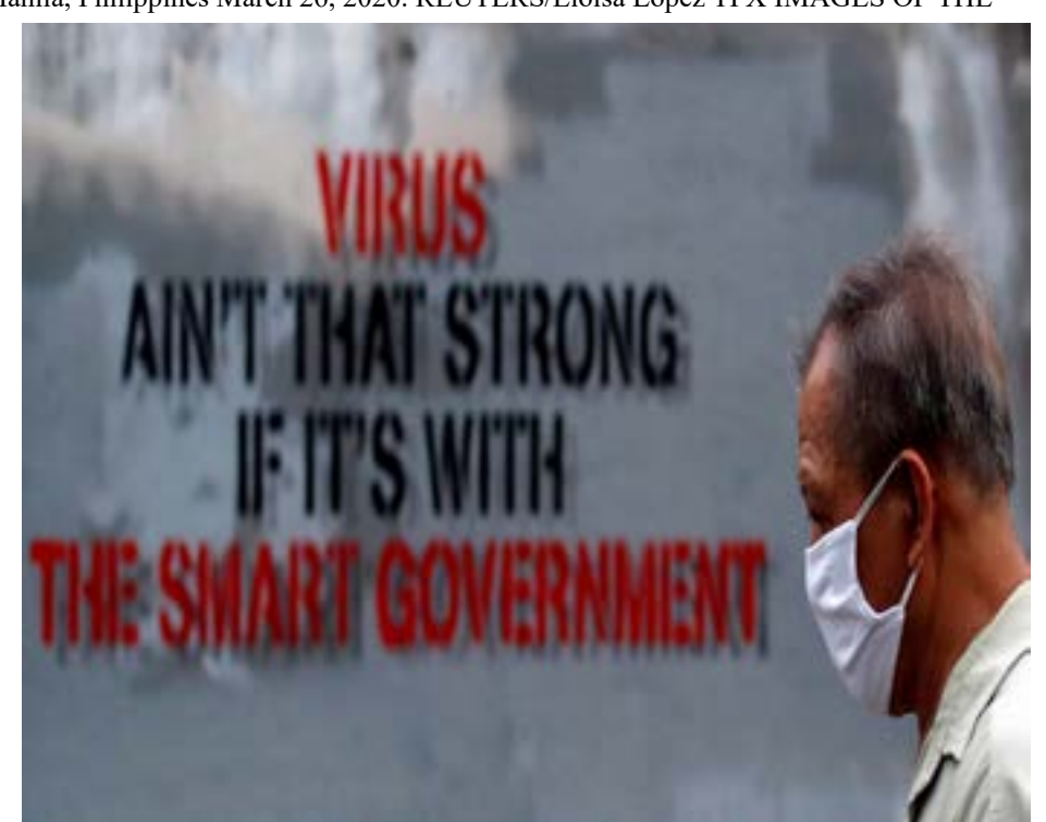
A man wearing a protective face mask walks a graffiti in a street amid the coronavirus disease (COVID-19) outbreak in Bangkok, Thailand March 26, 2020. REUTERS/Jorge Silva TPX IMAGES OF THE DAY