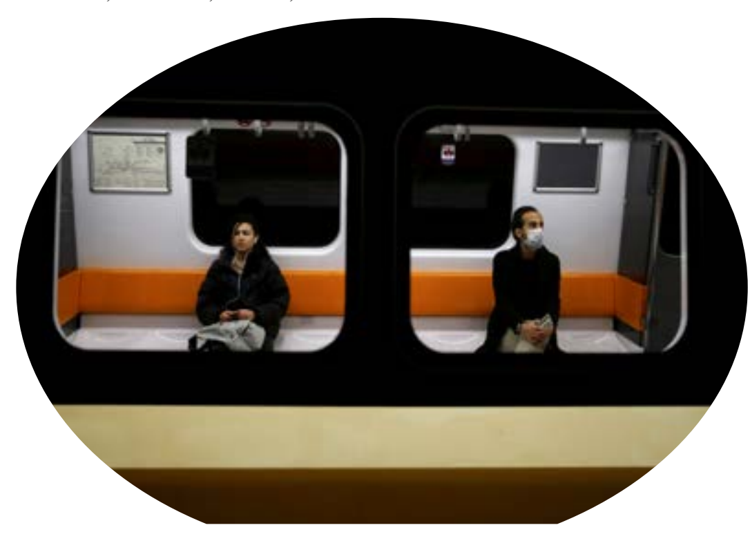
A man wearing a protective face mask and a woman are seen on a train as the spread of the coronavirus disease (COVID-19) continues, Istanbul, Turkey, March 26, 2020.