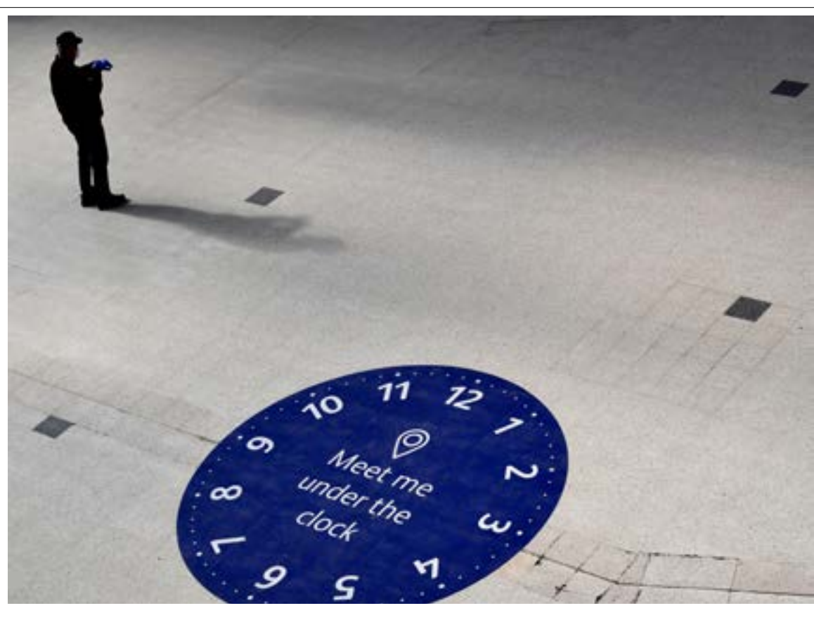
A man wearing a protective mask and gloves checks his watch on an almost empty concourse at Waterloo station as the spread of the coronavirus disease (COVID-19) continues, in London, Britain, March 26, 2020. REUTERS/ Toby Melville TPX IMAGES OF THE DAY