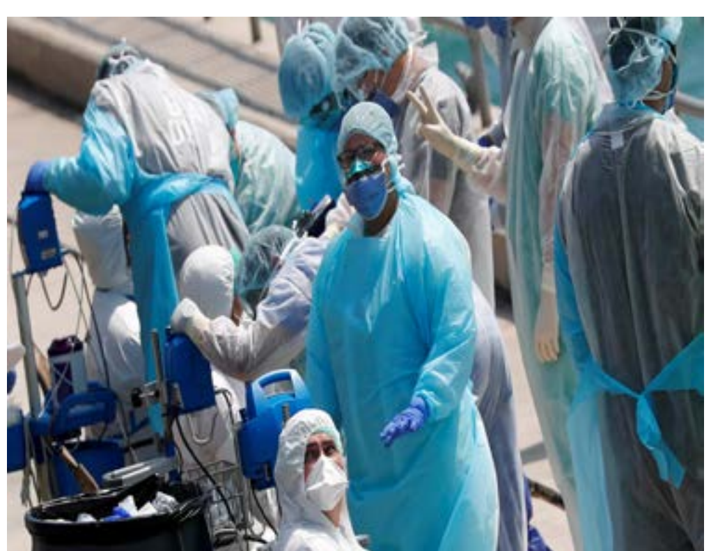
First responders evacuate sick crew members with flu-like symptoms from two cruise ships, the Costa Favolosa and Costa Magica at U.S. Coast Guard station at Port of Miami after the Florida Department of Health reported more than 2300 confirmed cases of coronavirus disease (COVID-19), in Miami, Florida U.S., March 26, 2020