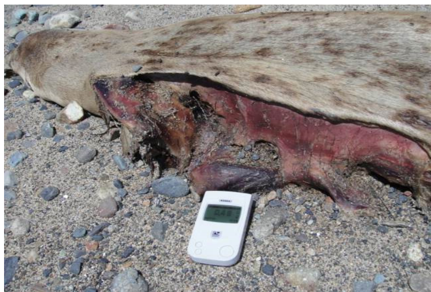
Shown Above: A dead sea lion on Californina's coast shows high radiation readings.