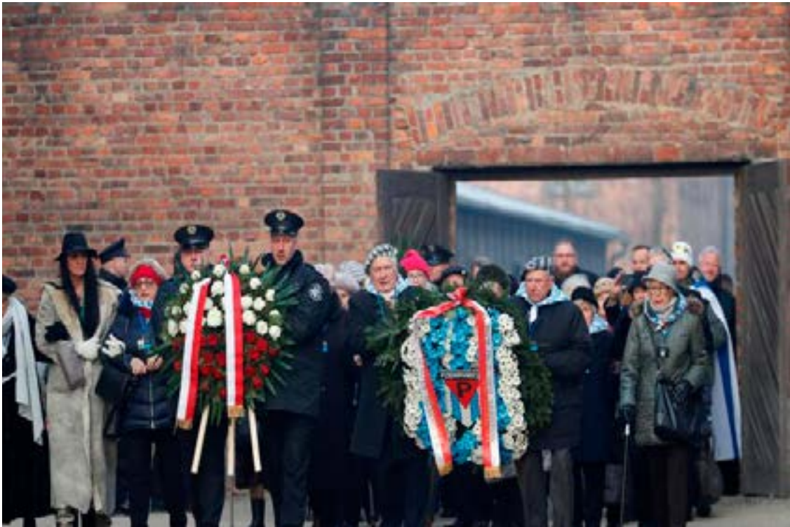
Survivors and other guests arrive to attend a wreath-laying ceremony at the “death wall” at Auschwitz, January 27, 2020. A 2019 survey by the U.S.-based Anti-Defamation League showed that about one in four Europeans harbor “pernicious and pervasive”...MORE