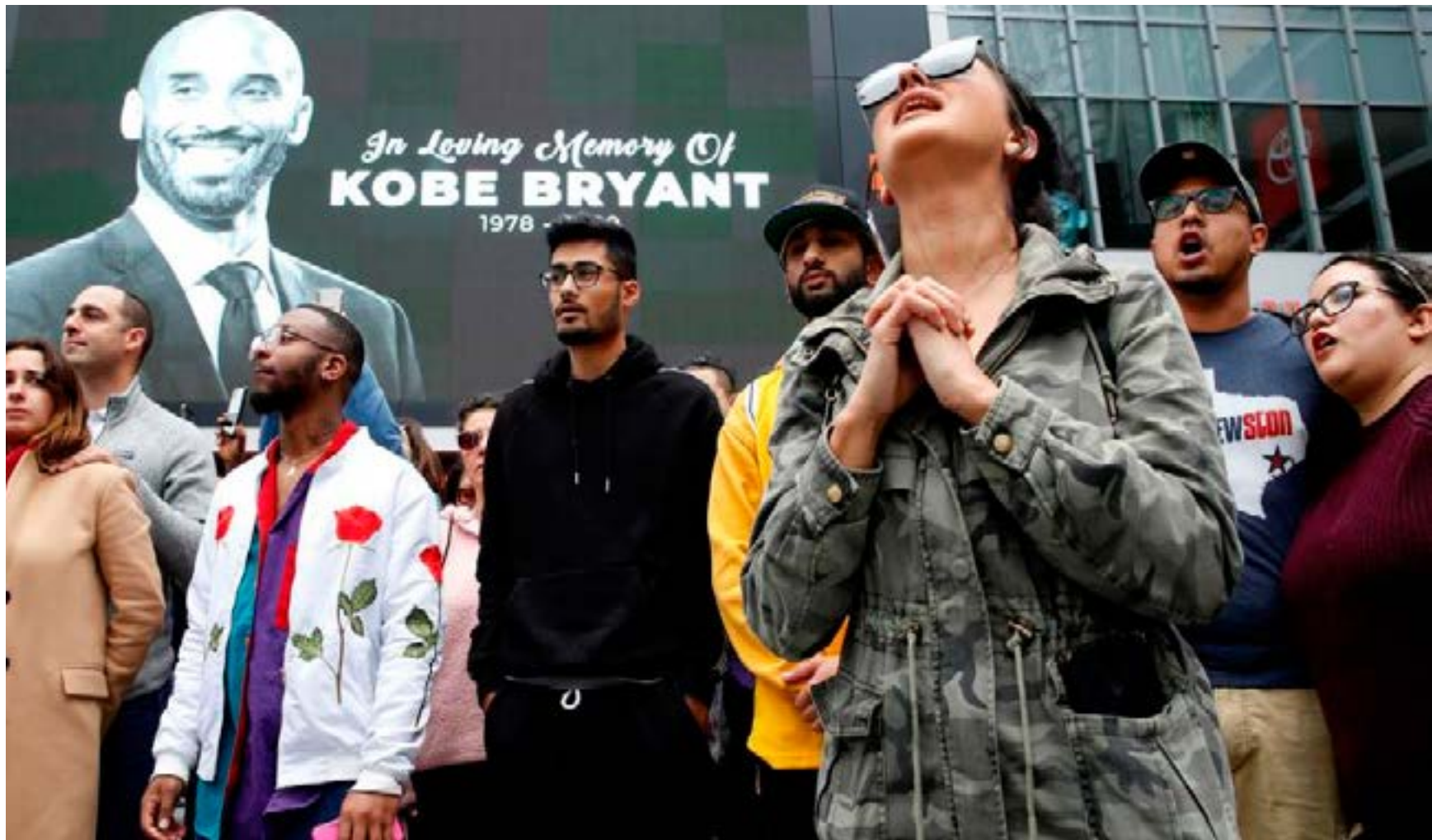
Mourners gather near an image of Kobe Bryant shown on a large screen outside the Staples Center after the retired Los Angeles Lakers basketball star was killed in a helicopter crash, in Los Angeles, California, U.S. January 26, 2020.

CALABASAS, Calif. (Reuters) - The pilot of Kobe Bryant's ill-fated helicopter was flying too low to be monitored in fog, air traffic controller recordings showed on Monday, as coroner's investigators said they had recovered three bodies from the crash site and were searching for more remains.