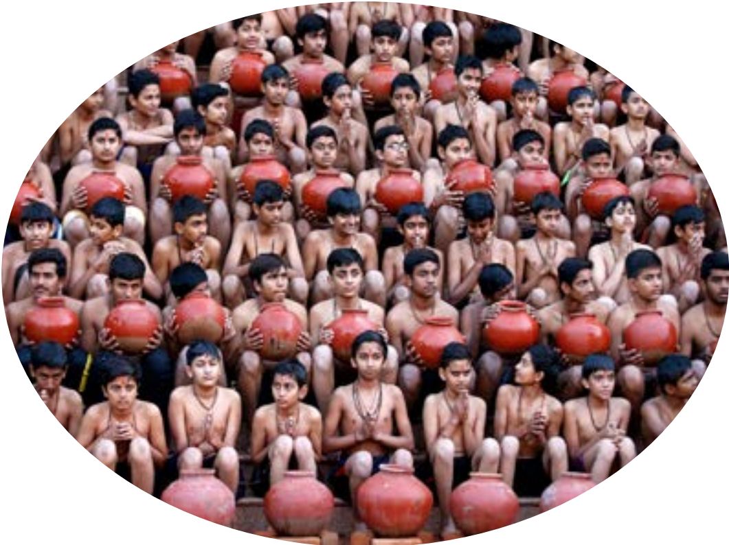
Students offer prayers after taking a holy bath during a ceremony organised to resemble the annual month-long Hindu religious festival of Magh Mela, in Ahmedabad