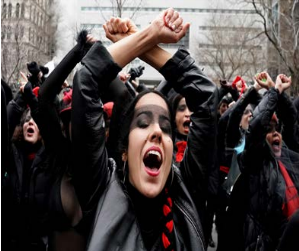
Women hold a protest across the street from the court where producer Harvey Weinstein’s ongoing sexual assault trial is held in the Manhattan borough of New York City