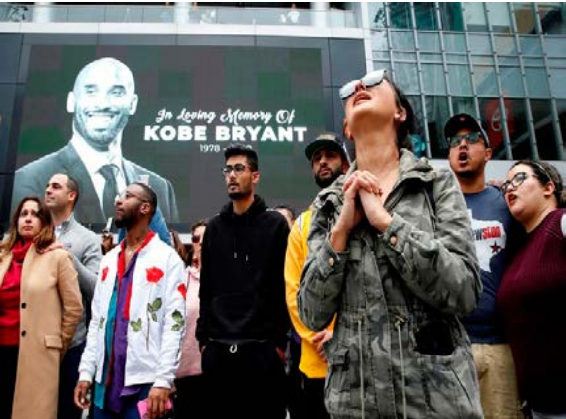
Mourners gather near an image of Kobe Bryant shown on a large screen outside the Staples Center after the retired Los Angeles Lakers basketball star was killed in a helicopter crash, in Los Angeles.