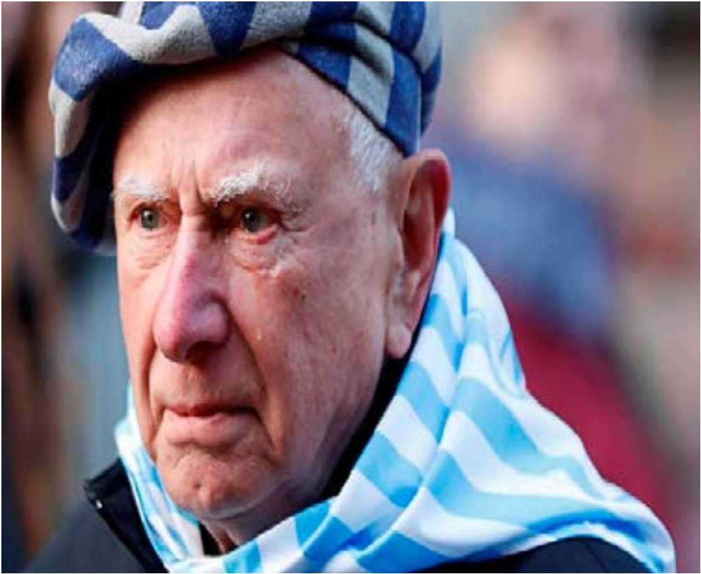
A survivor reacts as he attends a wreath-laying ceremony at the “death wall” at the former Nazi German concentration and extermination camp Auschwitz, during ceremonies marking the 75th anniversary of the liberation of the camp and International...MORE