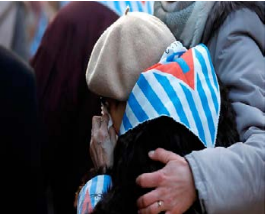
Survivors and other guests arrive to attend a wreath-laying ceremony at the “death wall” at Auschwitz, January 27, 2020. A 2019 survey by the U.S.-based Anti-Defamation League showed that about one in four Europeans harbor “pernicious and pervasive”...MORE