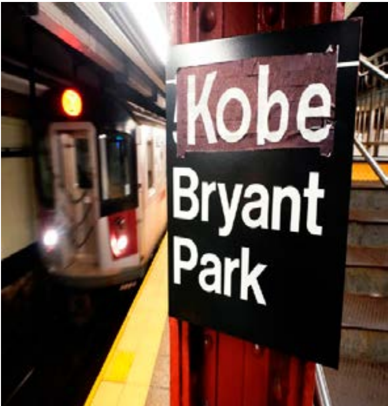
A New York City subway sign that has been changed to read “Kobe Bryant Park” in reference to the deceased NBA player is pictured in Manhattan, New York, January 27.