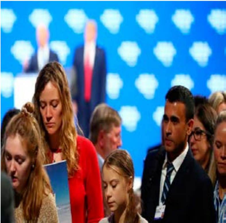
Swedish climate change activist Greta Thunberg leaves after U.S. President Donald Trump’s speech at the 50th World Economic Forum annual meeting in Davos, Switzerland, January 21, 2020. The two sparred indirectly at the forum -- Trump said the United...MORE