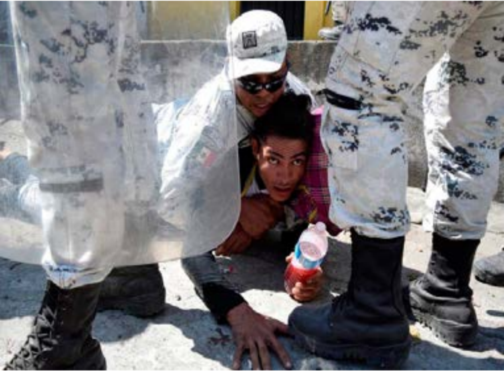
A member of Mexico’s National Guard detains a migrant, part of a caravan traveling to the U.S., near the border between Guatemala and Mexico, in Ciudad Hidalgo, Mexico January 20, 2020. Mexican security forces fired tear gas at rock-hurling Central...MORE