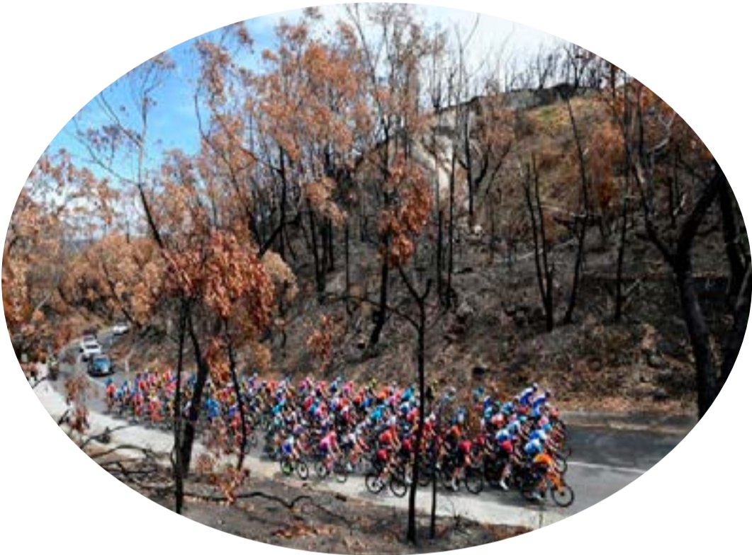
The peloton is seen in a bushfire-damaged area in the Adelaide Hills during stage two of the Tour Down Under from Woodside to Stirling in South Australia, Australia, January 22, 2020.