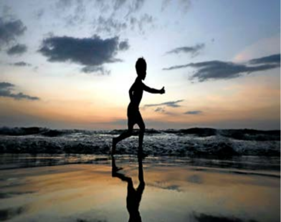
A boy is seen in silhouette as he runs on a beach in Colombo