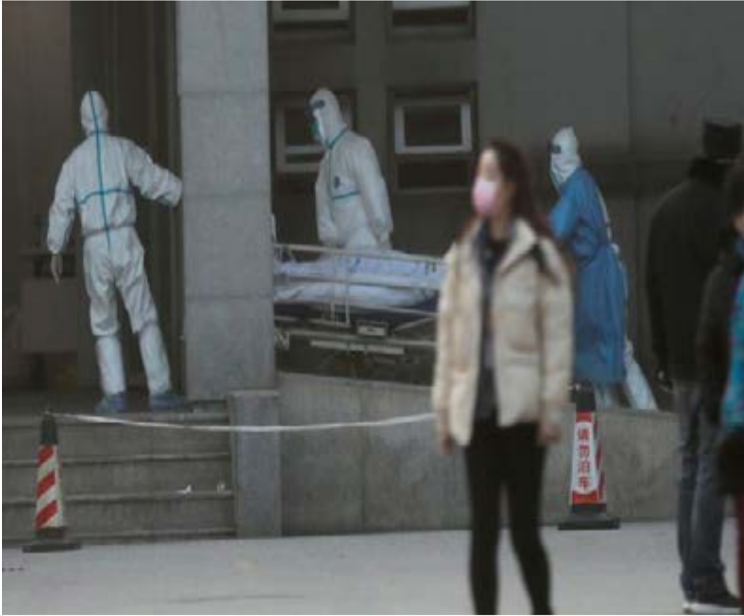
Medical staff transfer a patient at Jinyintan hospital, where patients are being treated for a new coronavirus, in Wuhan, Hubei province, China January 20, 2020. China has put millions of people on lockdown amid an outbreak that has killed at least...MORE