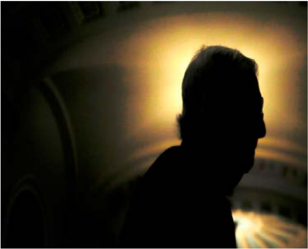
Senate Majority Leader Mitch McConnell walks to his office from the Senate Chamber during a break in the opening arguments of President Donald Trump’s Senate impeachment trial on Capitol Hill in Washington, January 21, 2020.