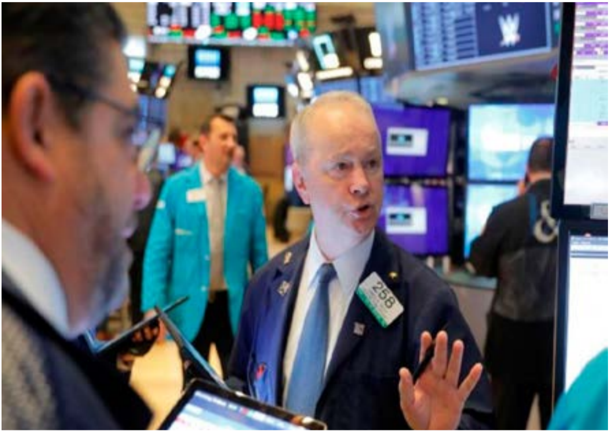
Traders work on the floor of the New York Stock Exchange shortly after the opening bell in New York, U.S., January 24, 2020.

Traders work on the floor of the New York Stock Exchange shortly after the opening bell in New York, U.S., January 24, 2020. Intel Corp's (INTC.O) stock surged 8.1% after reporting jumps in data center and cloud computing revenue and forecasting