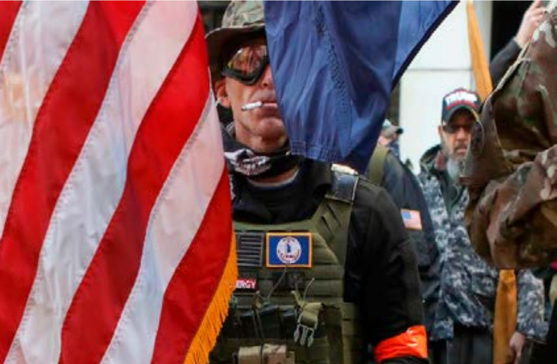
Gun rights advocates and militia members attend a rally in Richmond, Virginia, January 20, 2020. More than 22,000 armed gun-rights activists peacefully filled the streets around Virginia’s capitol building to protest gun-control legislation making...MORE