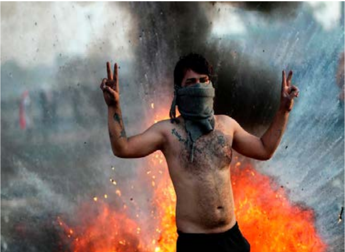
An Iraqi demonstrator gestures during anti-government protests in Baghdad, Iraq January 20, 2020. Iraq has been beset by unrest since October, as protesters demand an end to what they say is deeply-rooted corruption among an elite that has run Iraq...MORE