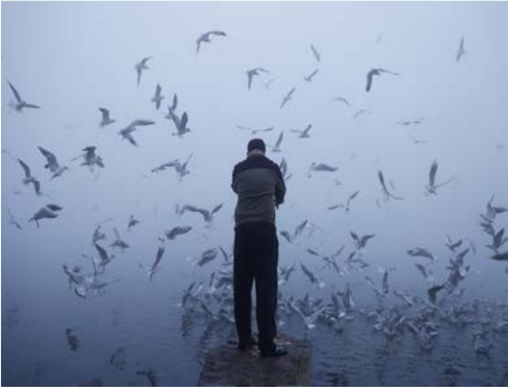
A man feeds seagulls as he stands on the banks of the Yamuna river on a foggy winter morning in New Delhi