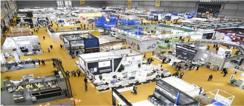
The Equipment exhibition area during the second China International Import Expo (CIIE) in Shanghai, east China, Nov. 10, 2019.

China will continue to open up its market and welcome more high-quality overseas products and services to enter the Chinese market in 2020.