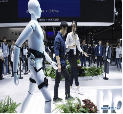
A visitor (C) experiences Honda Walking Assist device at the Automobile exhibition area during the second China