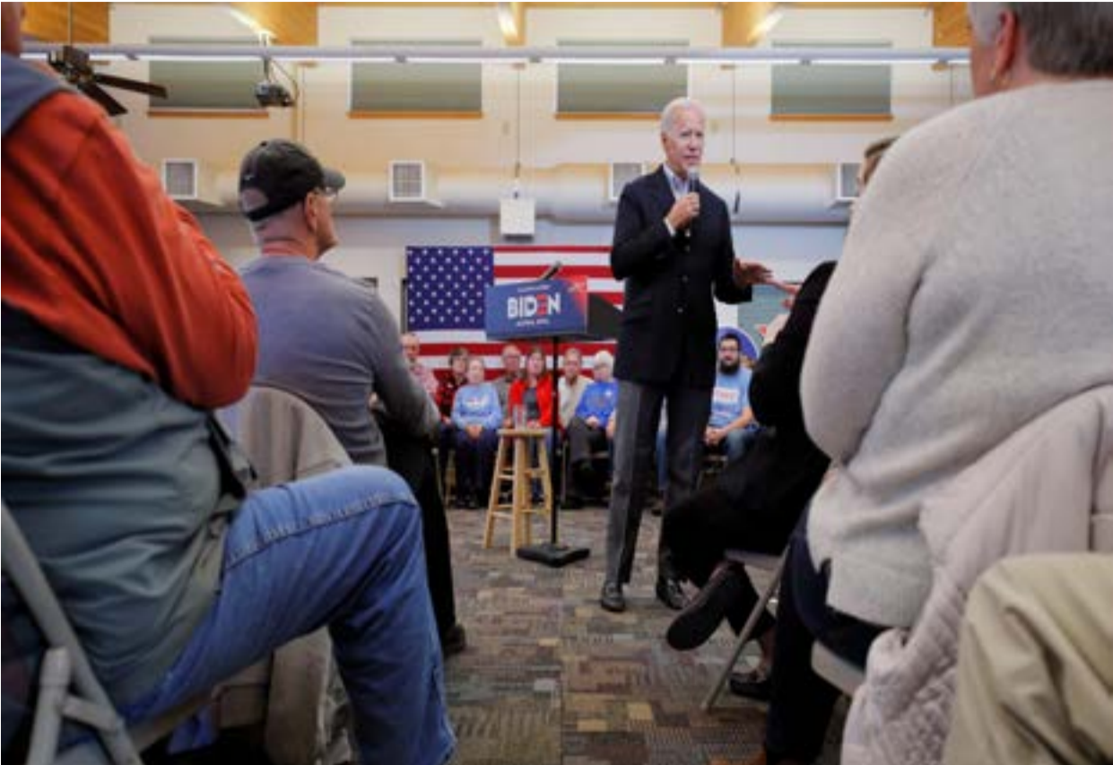
Democratic 2020 U.S. presidential candidate Biden speaks during a stop in Algona