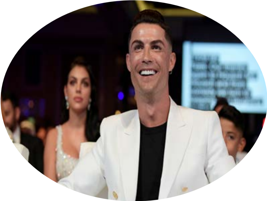
Soccer Football - Dubai Globe Soccer Awards - Madinat Jumeirah Resort, Dubai, United Arab Emirates - December 29, 2019 Juventus’ Cristiano Ronaldo during the awards. Picture taken December 29, 2019. Fabio Ferrari/Pool via REUTERS TPX IMAGES OF THE DAY