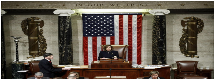
House Speaker Nancy Pelosi, D-Calif. (center), holds the gavel as House members vote on article II of impeachment against President Donald Trump, Dec. 18 on Capitol Hill.