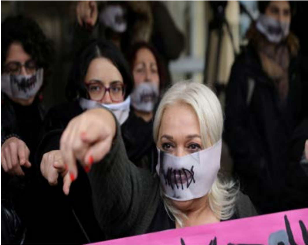
Activists take part in a demonstration, after a British woman was found guilty of faking a rape claim, outside the Famagusta courthouse in Paralimni