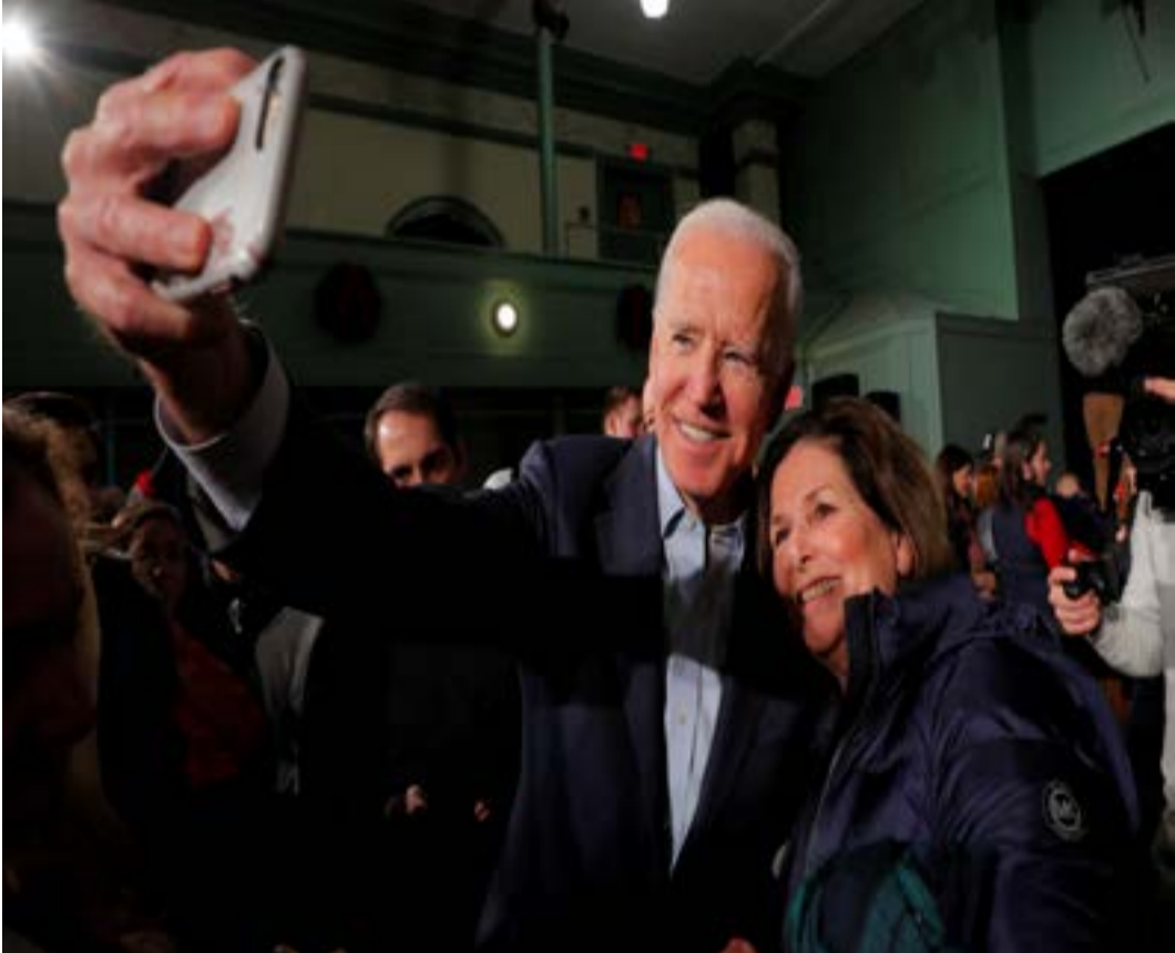
Democratic 2020 U.S. presidential candidate Biden takes a selfie with an audience member in Exeter