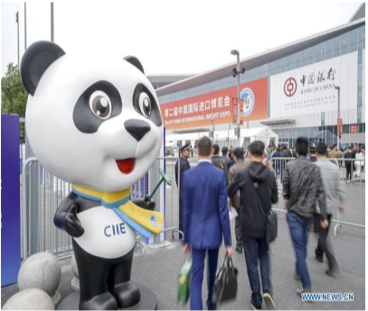
Visitors arrive at the National Exhibition and Convention Center, main venue of the second China International Import Expo (CIIE), in Shanghai, east China, Nov. 7, 2019. The second CIIE is held from Nov. 5 to Nov. 10.

BEIJING, Dec. 26 (Xinhua) -- Over 300 firms have applied to attend the third China International Import Expo (CIIE), the Ministry of Commerce (MOC) said Thursday. Their registered exhibit space totaled over 100,000 square meters, MOC spokesperson Gao Feng told a press conference. The CIIE is the first dedicated import exhibition in the world and has seen fruitful outcomes in the past two expos.