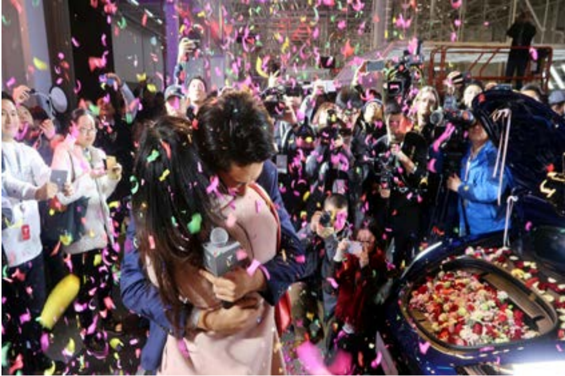
Tesla employee proposes to his girlfriend with a China-made Tesla Model 3 vehicle filled with flowers at a delivery ceremony in the Shanghai Gigafactory of the U.S. electric car maker in Shanghai