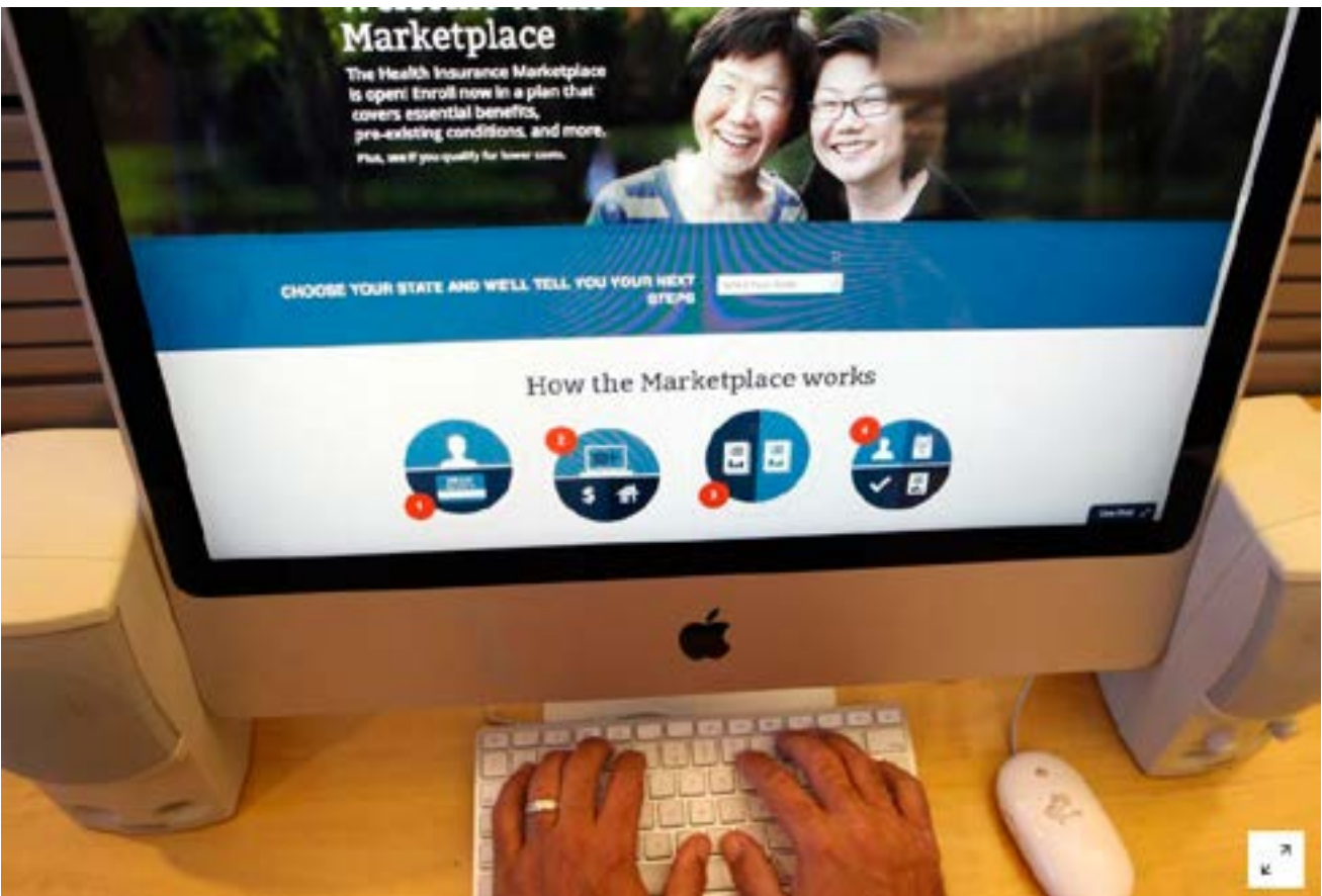
FILE PHOTO: A man looks over the Affordable Care Act (commonly known as Obamacare) signup page on the HealthCare.gov website in New York in this October 2, 2013 photo illustration. REUTERS/Mike Segar

The CMS runs enrollment for insurance plans created by the ACA, often referred to as Obamacare, through the online marketplace HealthCare.gov for 38 states.