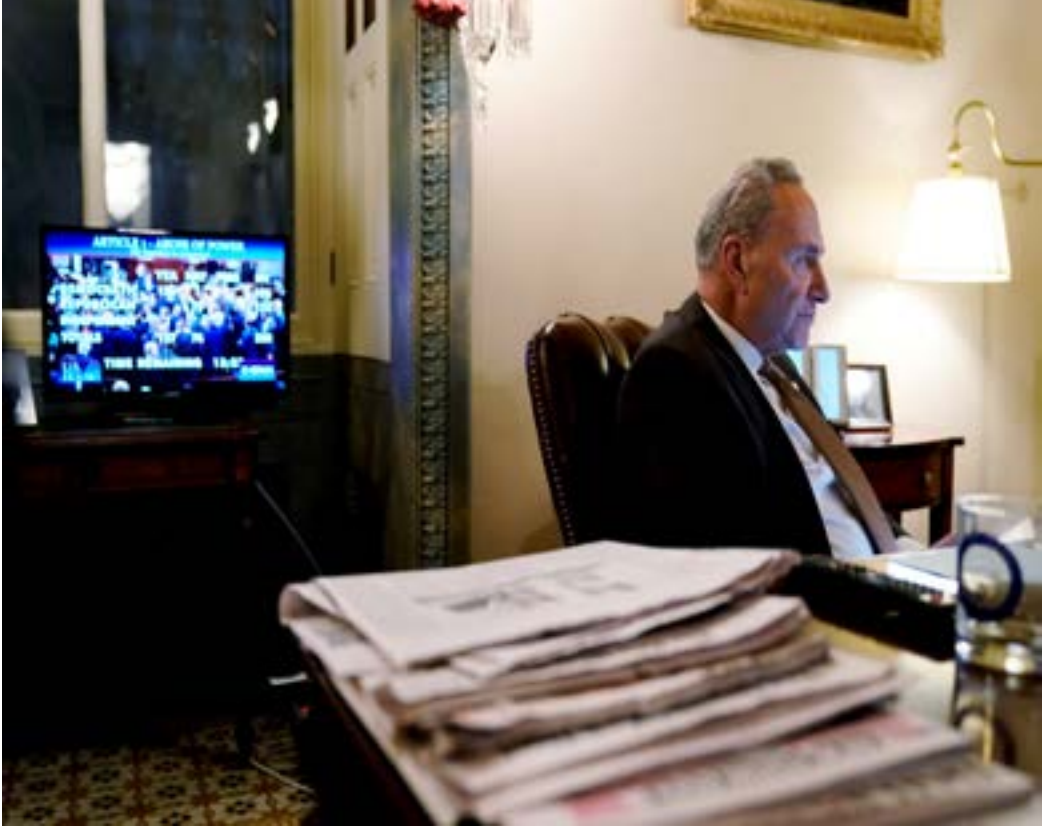
Senate Democratic Leader Schumer watches Trump impeachment vote count at the U.S. Capitol in Washington.