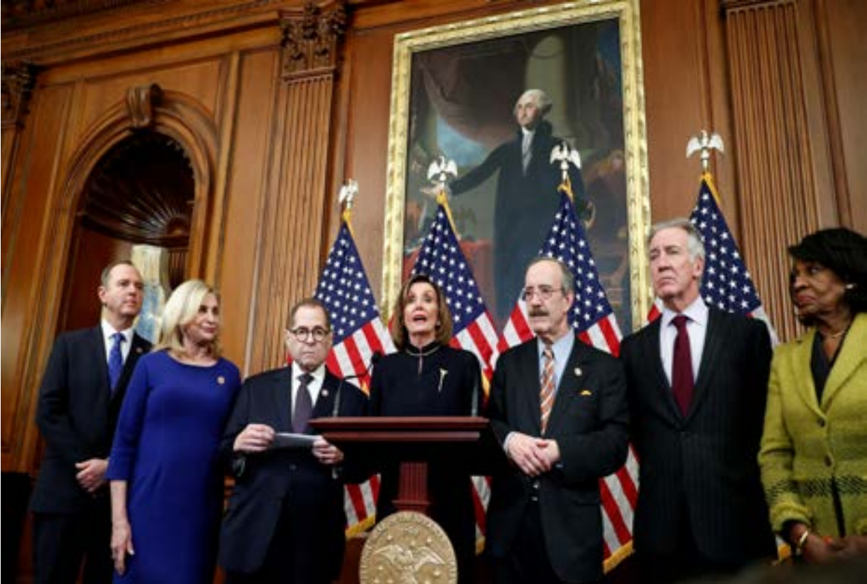
U.S. Speaker of the House Nancy Pelosi speaks to the media after voting on impeachment of U.S. President Trump