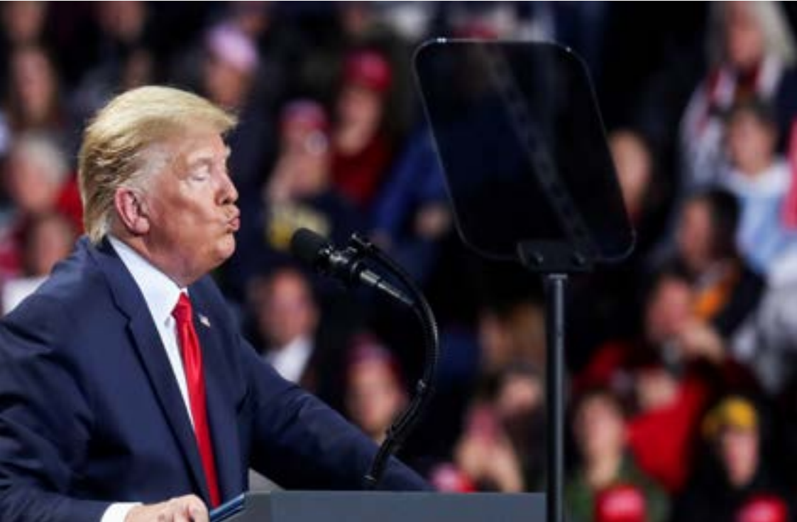
U.S. President Donald Trump reacts while speaking during a campaign rally in Battle Creek, Michigan