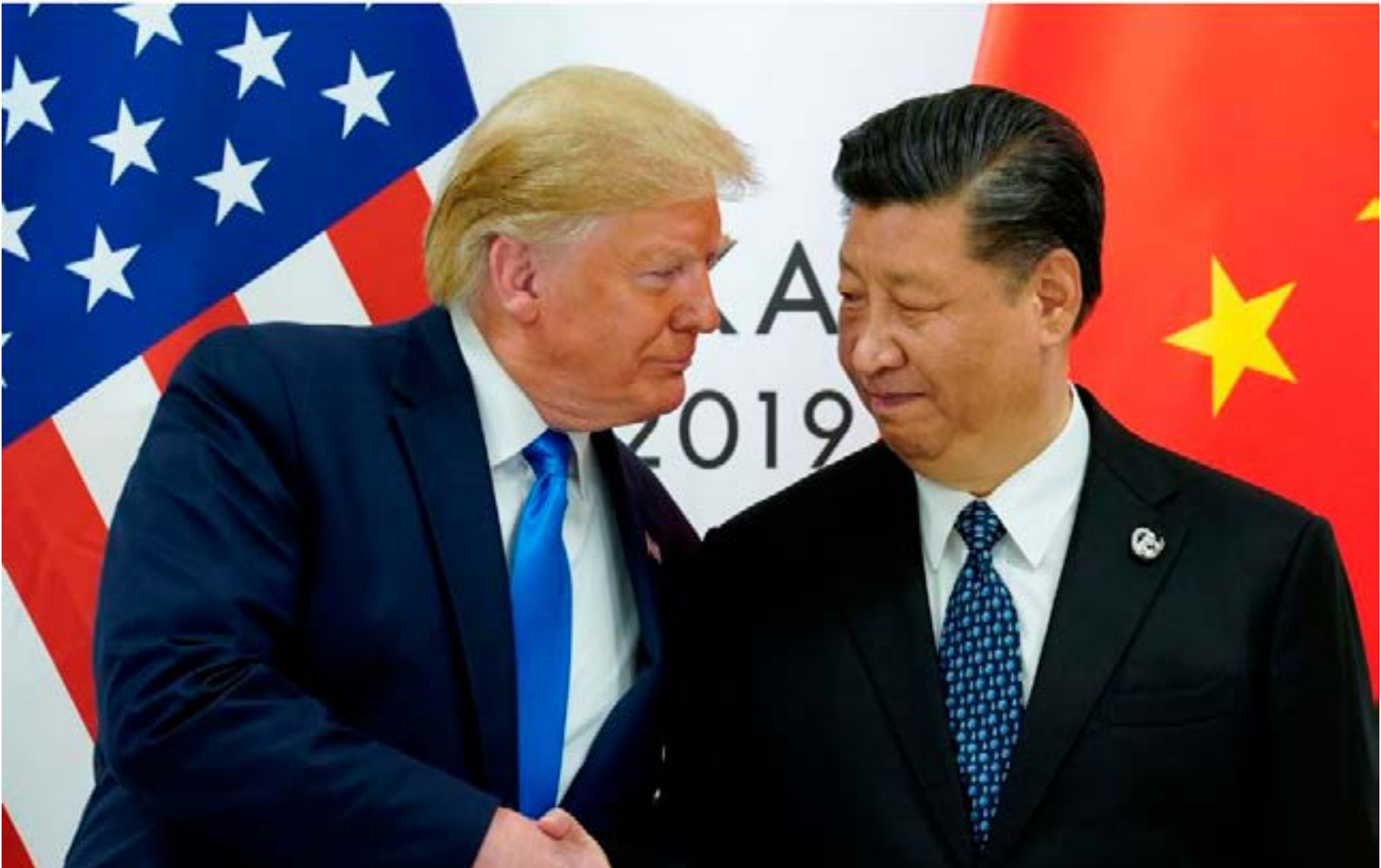
FILE PHOTO: U.S. President Donald Trump meets with China’s President Xi Jinping at the start of their bilateral meeting at the G20 leaders summit in Osaka, Japan, June 29, 2019. REUTERS/Kevin Lamarque/File Photo

WASHINGTON/BEIJING (Reuters) - U.S. President Donald Trump spoke on Friday with Chinese President Xi Jinping and claimed progress on issues from trade to North Korea and Hong Kong, but China said Xi accused the United States of interfering in its internal affairs. The two leaders spoke a week after their envoys sealed a “Phase 1” agreement aimed at ending an 18-month trade war that has rattled markets and raised tensions. Trump announced the phone call in a tweet. A White House official said they spoke on Friday morning. China Central Television said Xi spoke to Trump at the request of the U.S. president. “Had a very good talk with President Xi of China concerning our giant Trade Deal. China has already started large scale purchase of agricultural product & more. Formal signing being arranged. Also talked about North Korea, where we are working with China, & Hong Kong (progress!)” Trump tweeted. RELATED COVERAGE China’s Xi, in call with Trump, says U.S. interfering in its affairs: Xinhua China’s Xinhua news agency said Xi told Trump that China is deeply concerned about “the negative words and deeds” of the United States on issues related to Taiwan, Hong Kong, Xinjiang and Tibet.