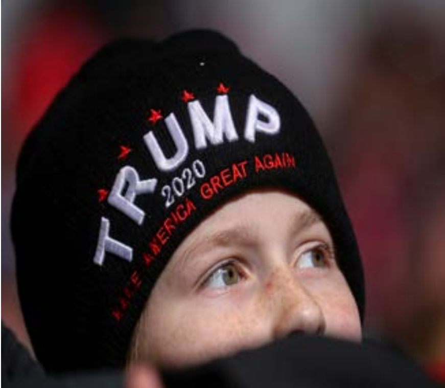
A supporter wearing a Trump 2020 beanie attends U.S. President Donald Trump's campaign rally in Battle Creek, Michigan