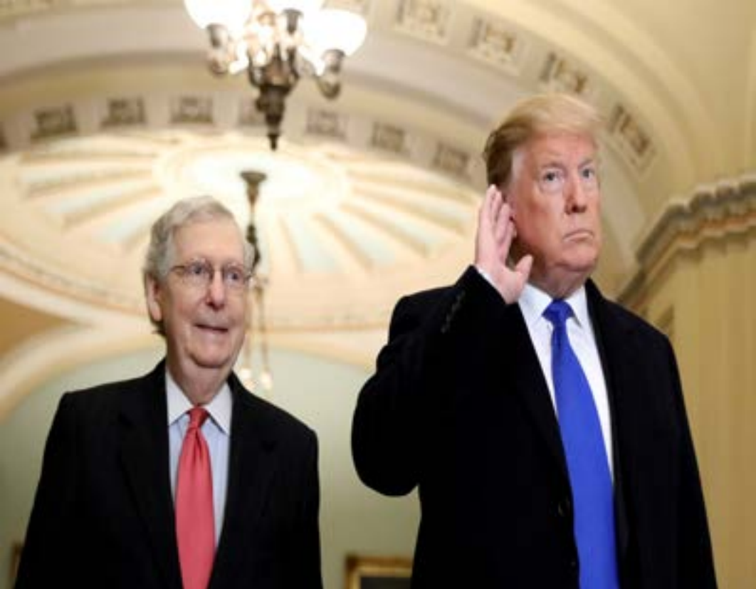
FILE PHOTO: U.S. President Trump arrives for closed Senate Republican policy lunch on Capitol Hill in Washington