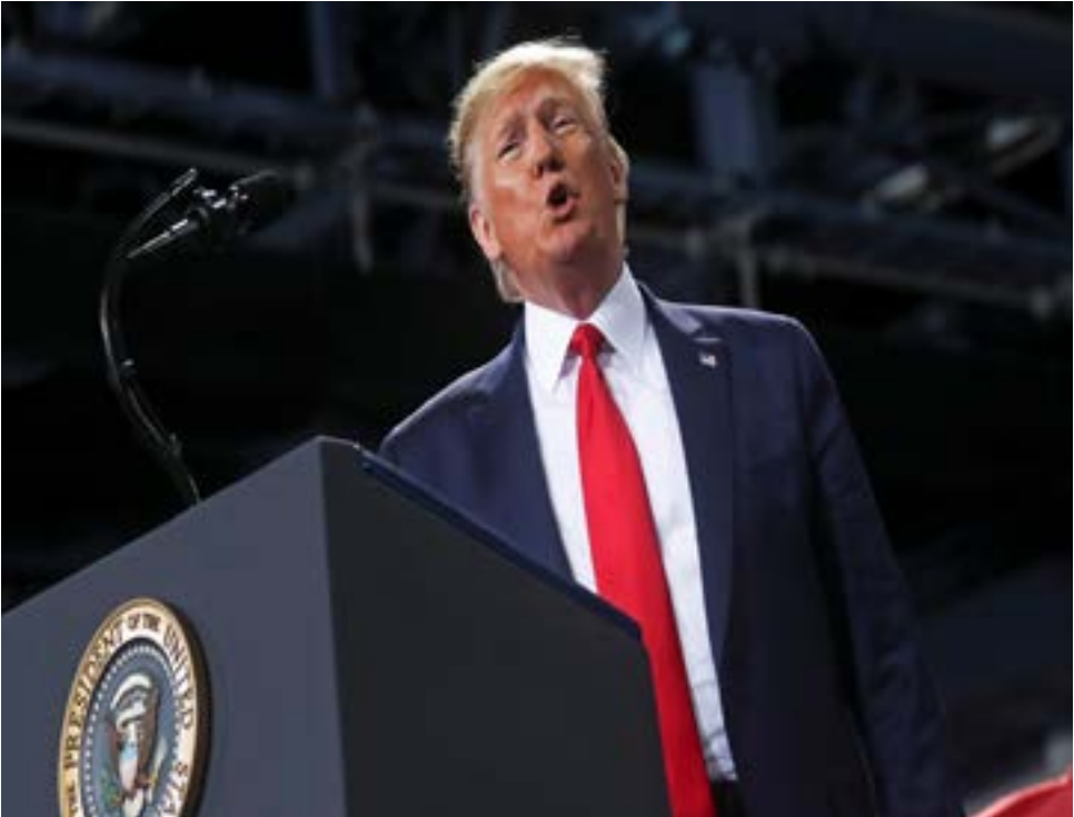
U.S. President Donald Trump speaks during a campaign rally in Battle Creek, Michigan, U.S., December 18, 2019.