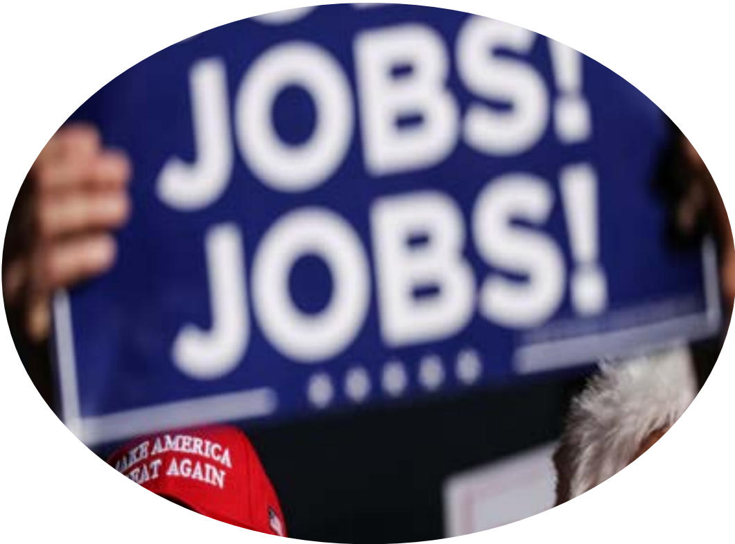
Supporters attend U.S. President Donald Trump's campaign rally in Battle Creek, Michigan