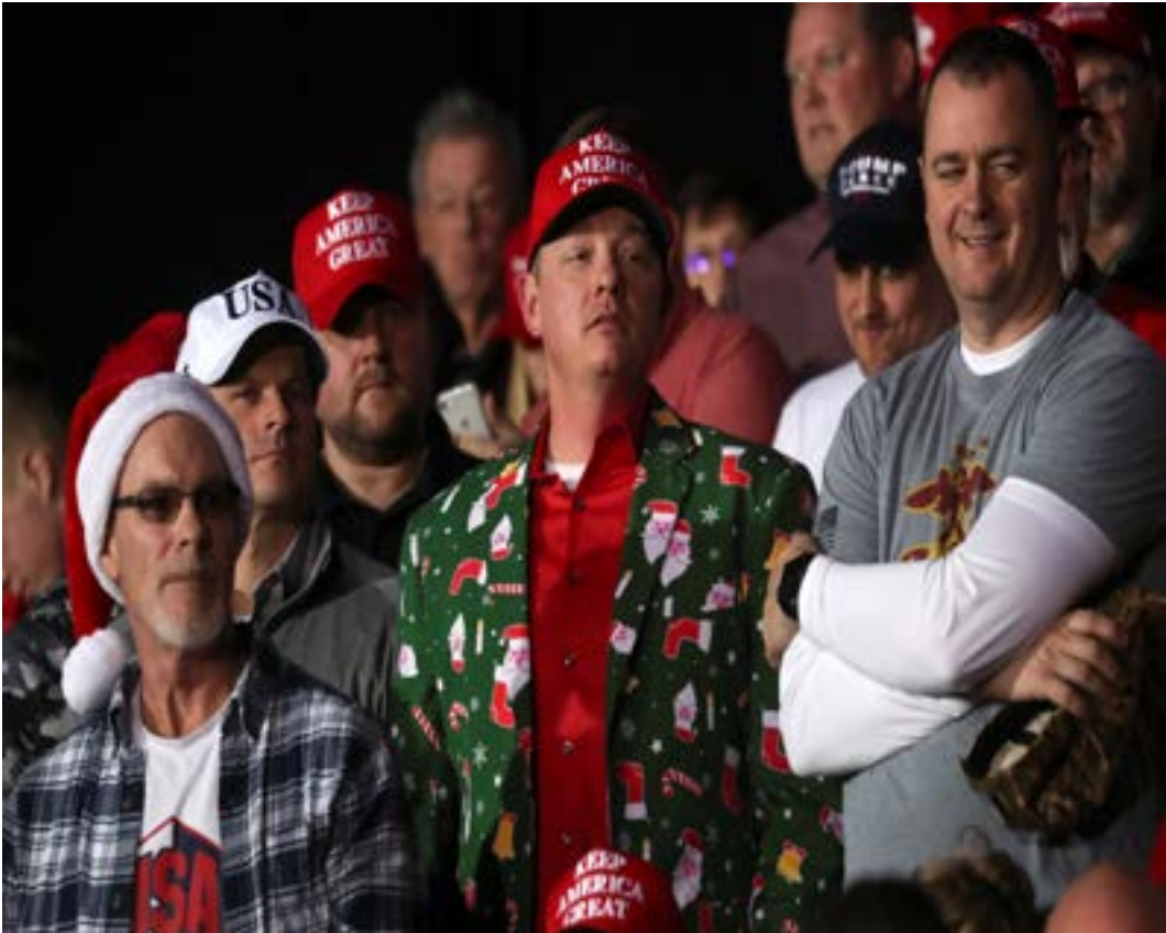
Supporters attend U.S. President Donald Trump's campaign rally in Battle Creek, Michigan