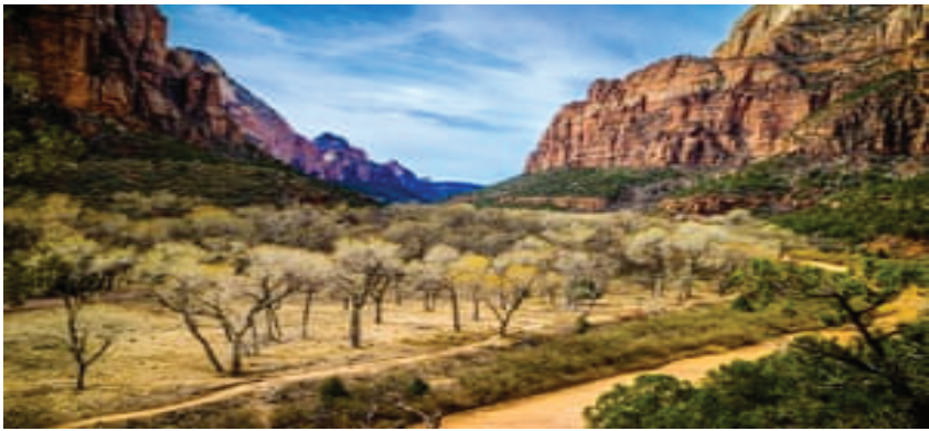
Mountain ridges in Zion national park, Utah.

Diverting Rangers Is A Way To Direct Federal Resources To The Border Without The Need For Congressional Approval