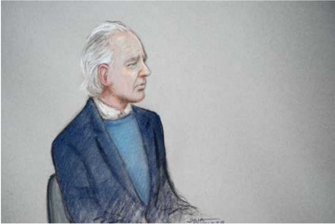
WikiLeaks founder Julian Assange is seen in the courtroom sketch during a case management hearing in Assange's U.S. extradition case at Westminster Magistrates Court, in London