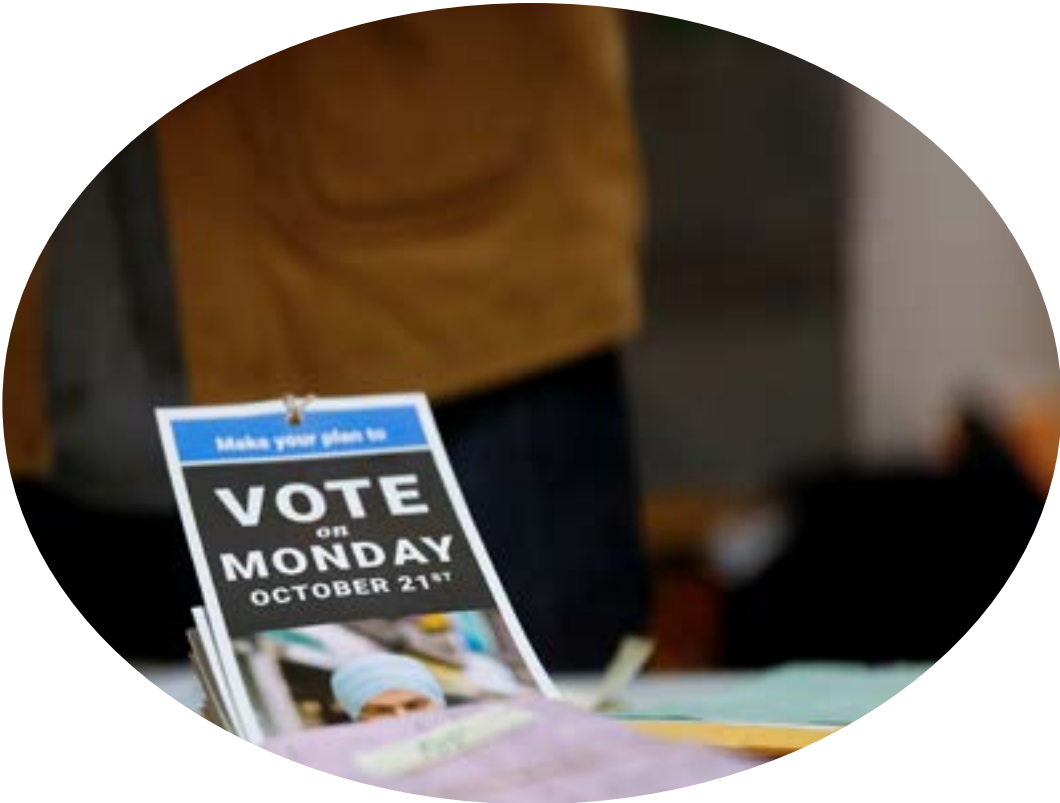
Voting information pamphlets sit on a table as NDP leader Jagmeet Singh helps sort documents at the NDP election office on Election Day in Burnaby