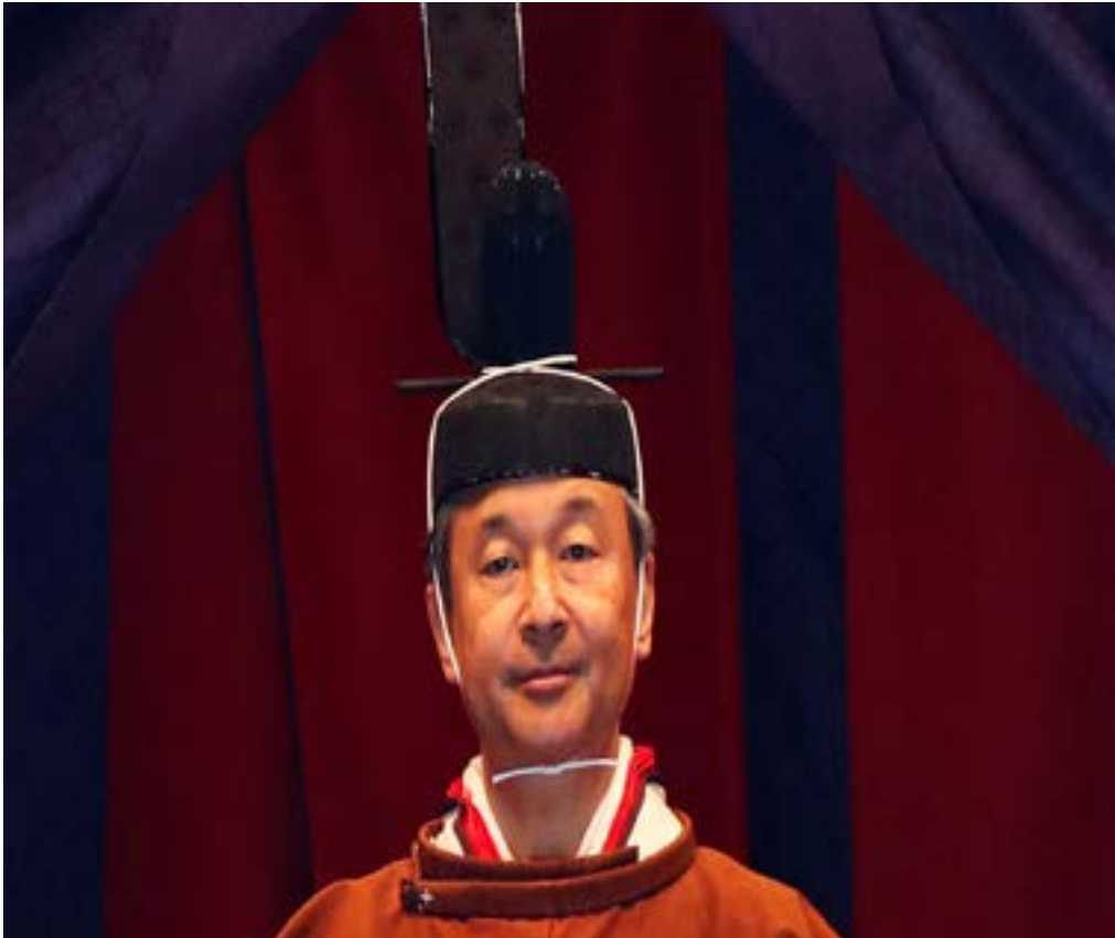
Japan's Emperor Naruhito makes his appearance during a ceremony to proclaim his enthronement to the world, called Sokuirei-Seiden-no-gi, at the Imperial Palace in Tokyo, Japan, October 22, 2019.