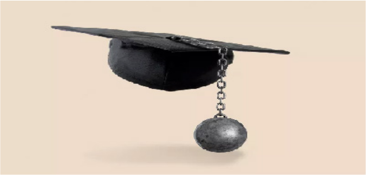
Compiled And Edited By John T. Robbins, Southern Daily Editor

•Two out of three of last year’s college grads owe more than 2017’s. •Students who attended college in the Northeast have the highest average debt. •Students in Connecticut had the highest average at $38,650, and students in Utah had the lowest at $19,750. •“Black students and those from low-income backgrounds were more likely to have debt at graduation,” per USA Today.