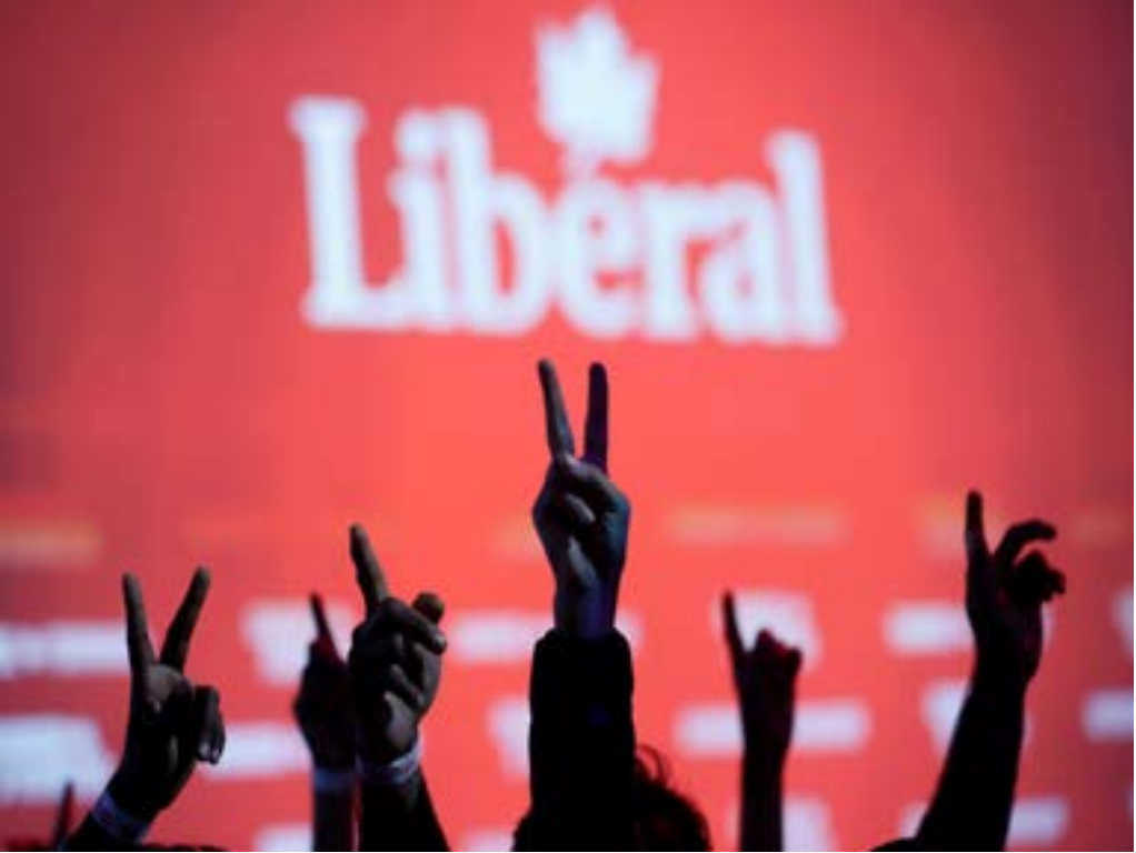
Liberal Party supporters flash V-signs while watching the live federal election results at the Palais des Congres in Montreal, Quebec, Canada October 21, 2019. REUTERS/Stephane Mahe TPX IMAGES OF THE DAY