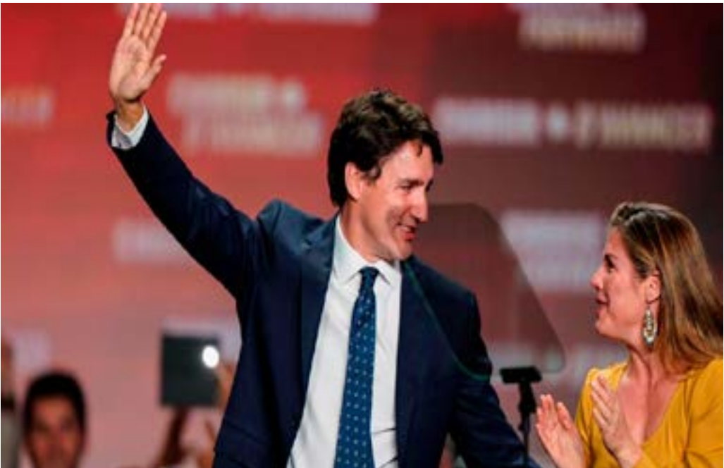
Liberal leader and Canadian Prime Minister Justin Trudeau reacts beside his wife Sophie Gregoire Trudeau after the federal election at the Palais des Congres in Montreal, Quebec, Canada October 22, 2019.

This win was different. But Trudeau barely mentioned the loss of his majority when he spoke to supporters early on Tuesday, saying he had “a clear mandate” for a progressive agenda and more action to combat global