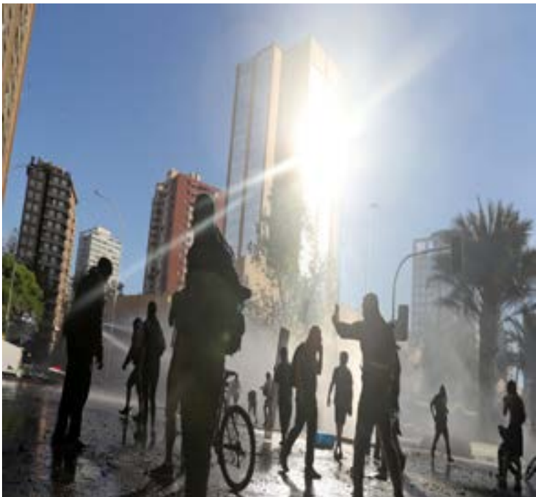
Demonstrators take part in a protest against Chile's state economic model in Santiago, Chile, October 21, 2019.