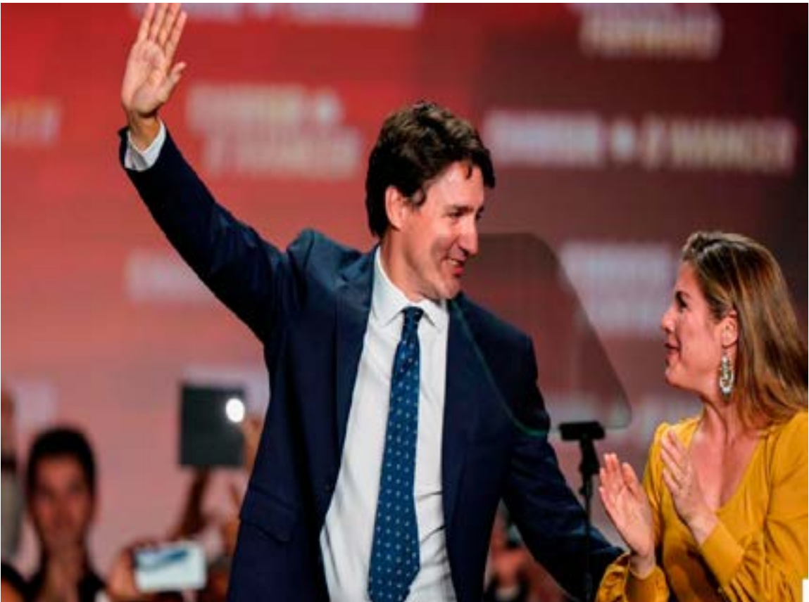
Liberal leader and Canadian Prime Minister Justin Trudeau and his wife Sophie Gregoire Trudeau wave to supporters after the federal election at the Palais des Congres in Montreal, Quebec, Canada October 22, 2019. TPX IMAGES OF THE DAY