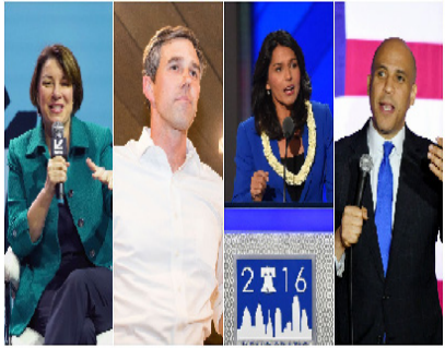
Sen. Amy Klobuchar, Beto O’Rourke, Rep. Tulsi Gabbard and Sen. Cory Booker.

A clear divide exists among 2020 Democrats who are rolling out plans to tackle the student debt crisis, whether tuition-free or debt-free policies are the way to win voter support.