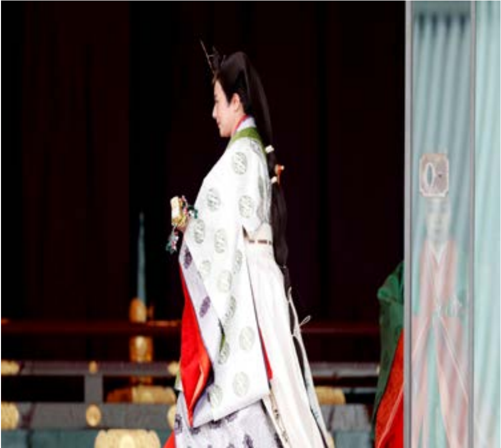
Japan's Empress Masako leaves after a ceremony to proclaim Emperor Naruhito's enthronement to the world, called Sokuirei-Seiden-no-gi, at the Imperial Palace in Tokyo, Japan October 22, 2019.