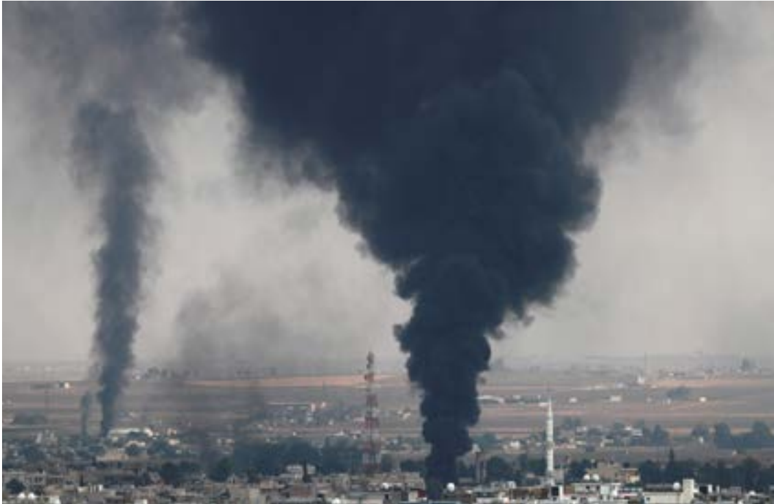
Smoke rises over the Syrian town of Ras al Ain, as seen from the Turkish border town of Ceylanpinar