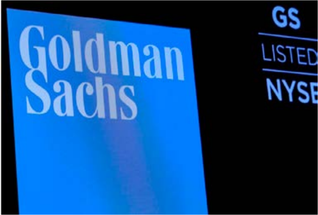
FILE PHOTO: The ticker symbol and logo for Goldman Sachs is displayed on a screen on the floor at the New York Stock Exchange (NYSE) in New York, U.S., December 18, 2018.