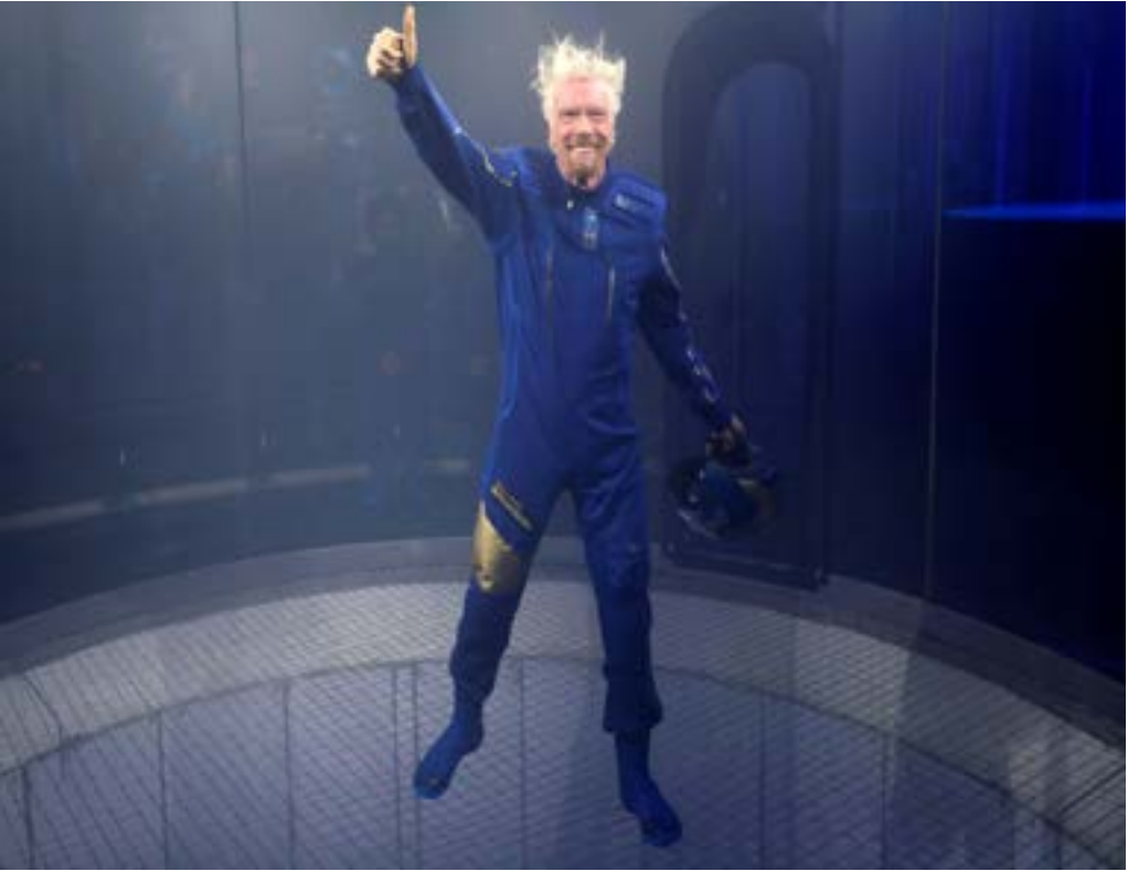
Sir Richard Branson appears in a sky diving simulator as he wears Virgin Galactic’s new space-wear system in Yonkers