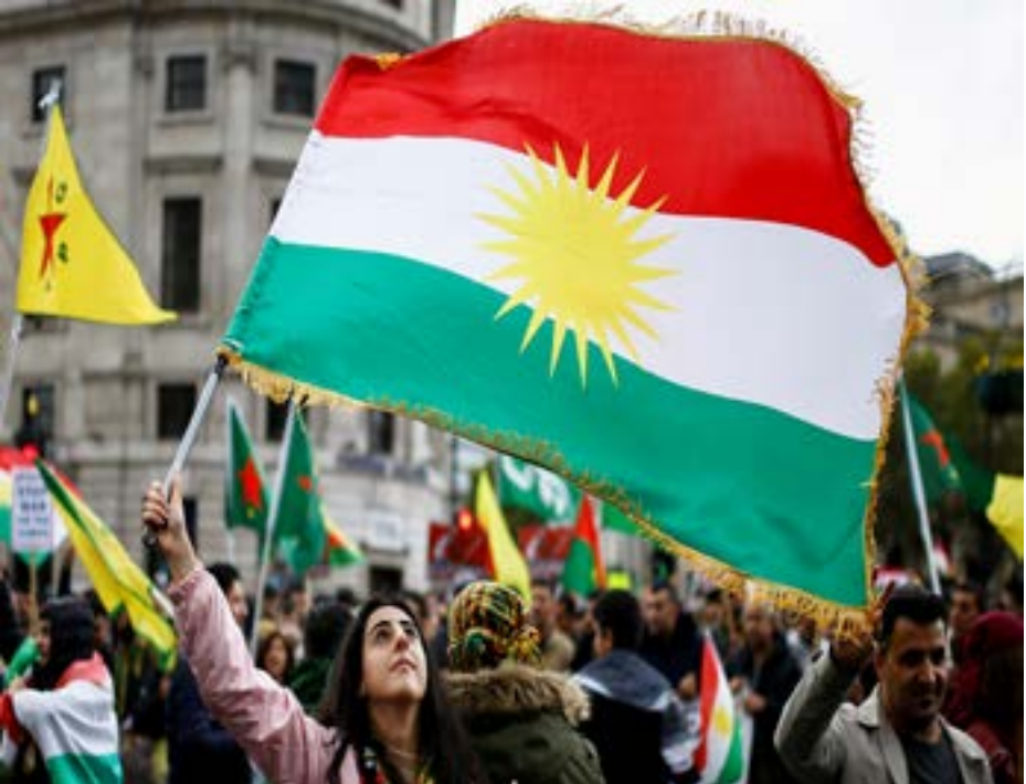
A woman flashes a V-sign as she waves a Kurdish flag during a pro-Kurdish rally against Turkey’s military action in northeastern Syria, in London, Britain, October 13, 2019. REUTERS/Henry Nicholls TPX IMAGES OF THE DAY