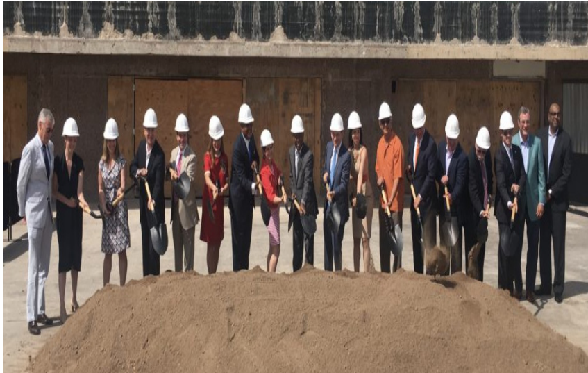
Officials break ground for the new Ion innovation hub at the site of the former Midtown Sears building on July 19, 2019.