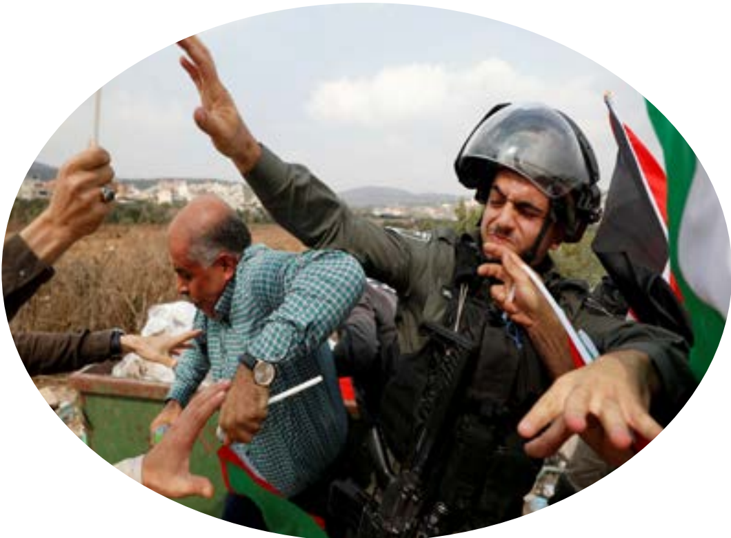
Israeli border policeman scuffles with demonstrators during a Palestinian protest against Jewish settlements in Turmus Ayya village near Ramallah in the Israeli-occupied West Bank