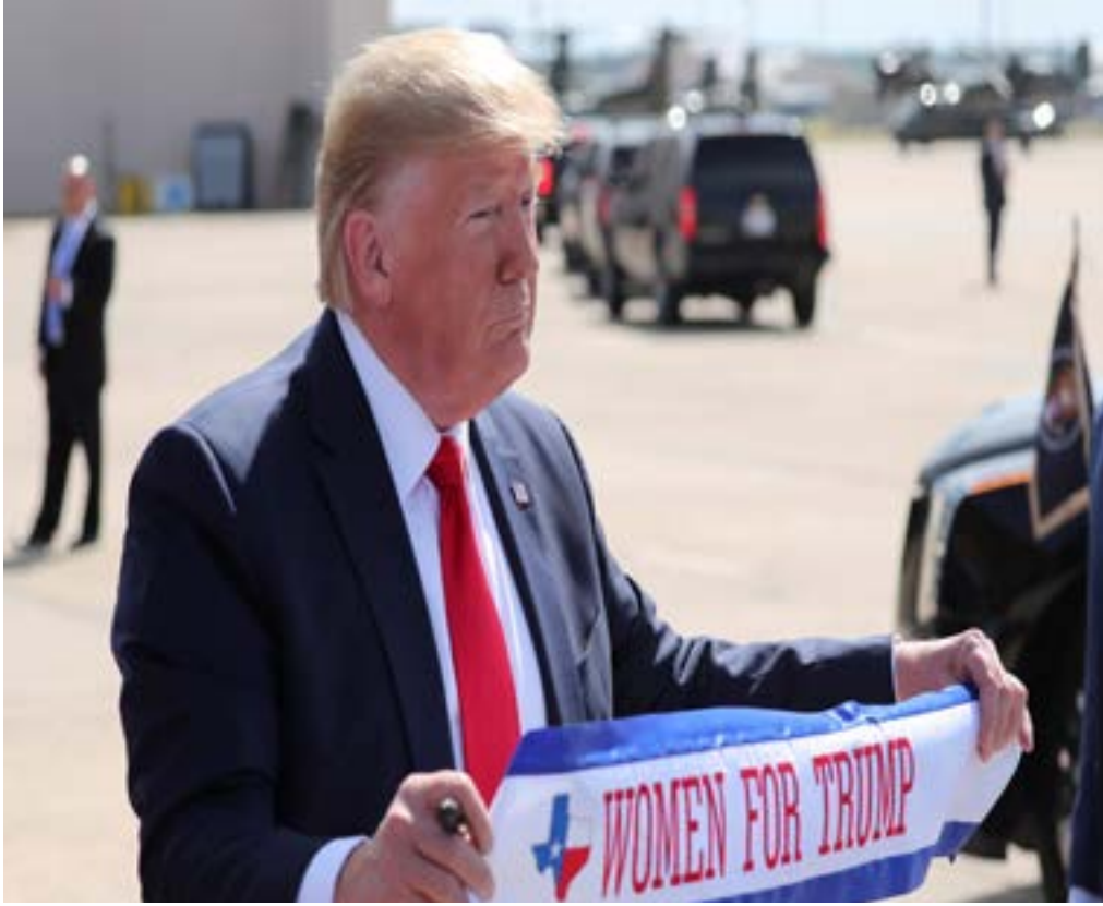
U.S. President Donald Trump greets supporters as he arrives in Fort Worth, Texas