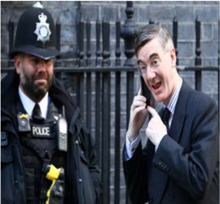
Britain’s Leader of the House of Commons Jacob Rees-Mogg at Downing Street in London