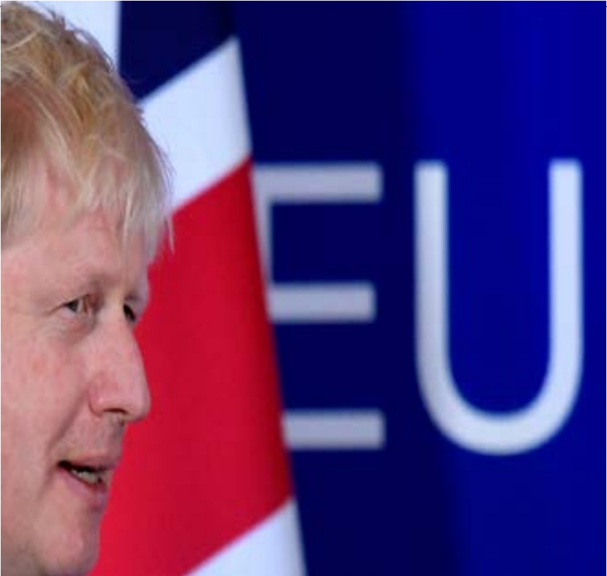
Britain’s Prime Minister Boris Johnson arrives to attend a news conference at the European Union leaders summit dominated by Brexit, in Brussels, Belgium October 17, 2019.