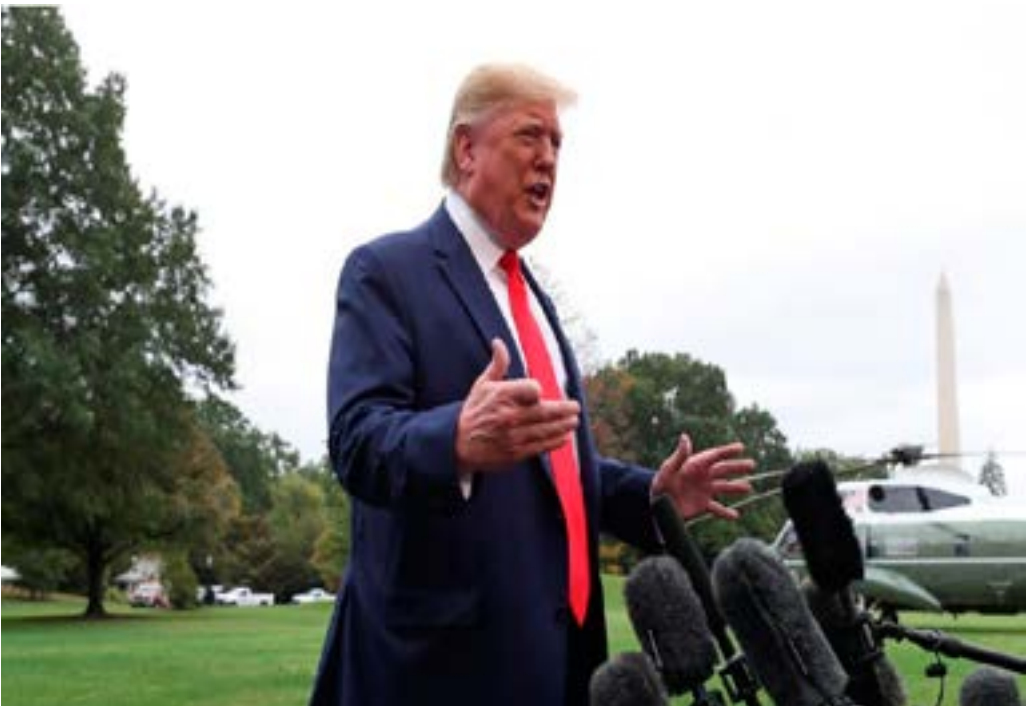
U.S. President Donald Trump talks to reporters as he departs for travel to Florida from the South Lawn of the White House in Washington, U.S., October 3, 2019.

U.S. President Donald Trump talks to reporters as he departs for travel to Florida from the South Lawn of the White House in Washington, U.S., October 3, 2019. IMPEACHMENT PROBE The impeachment probe could lead to the approval of articles of impeachment - or formal charges - against Trump in the Democratic-controlled House. A trial on whether to remove him