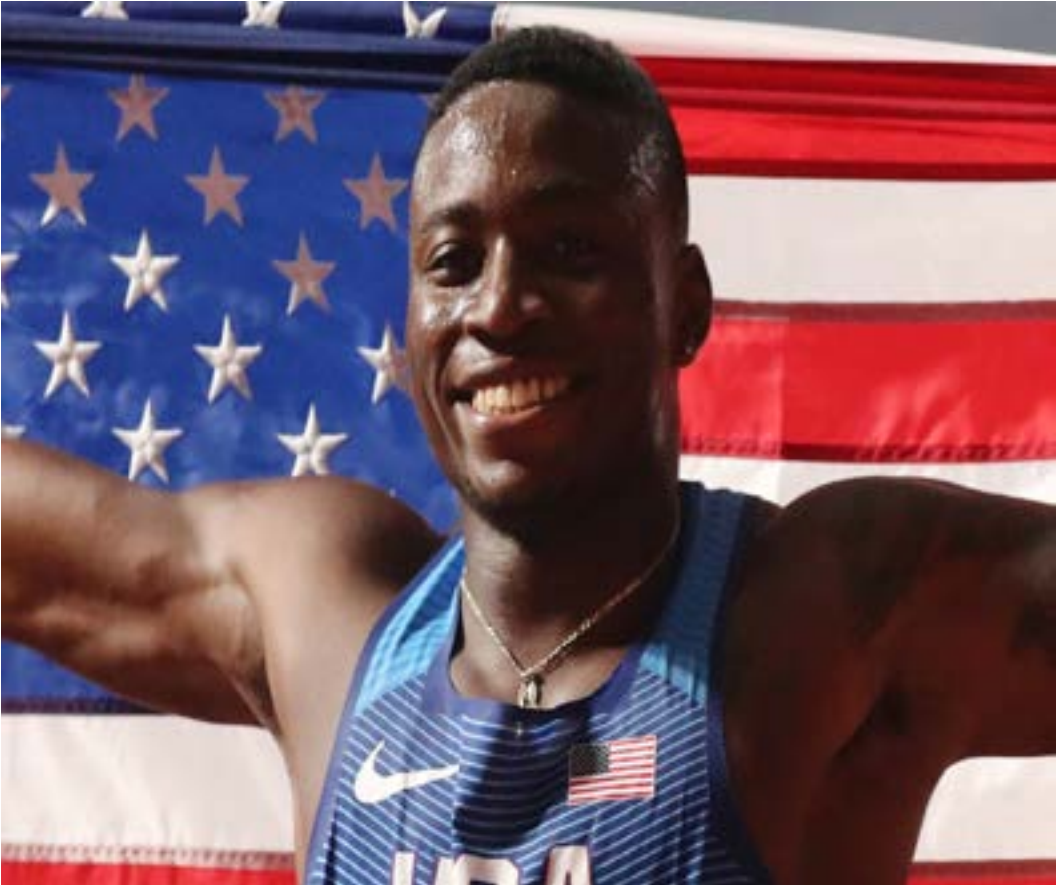
Athletics - World Athletics Championships - Doha 2019 - Men's 110 Metres Hurdles Final - Khalifa International Stadium, Doha, Qatar - October 2, 2019 Grant Holloway of the U.S. reacts after winning gold