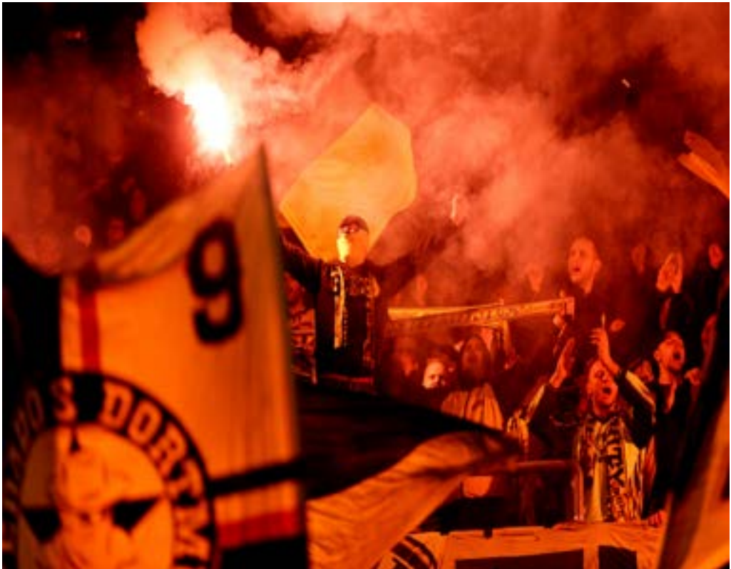
Champions League - Group F - SK Slavia Prague v Borussia Dortmund