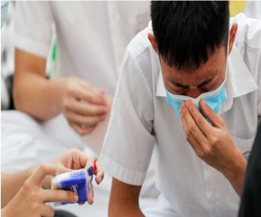
A schoolmate of a student protester who was shot by a policeman on Tuesday cries while participating in a student gathering at Tsuen Wan Public Ho Chuen Yiu Memorial College in solidarity with the student in Tsuen Wan