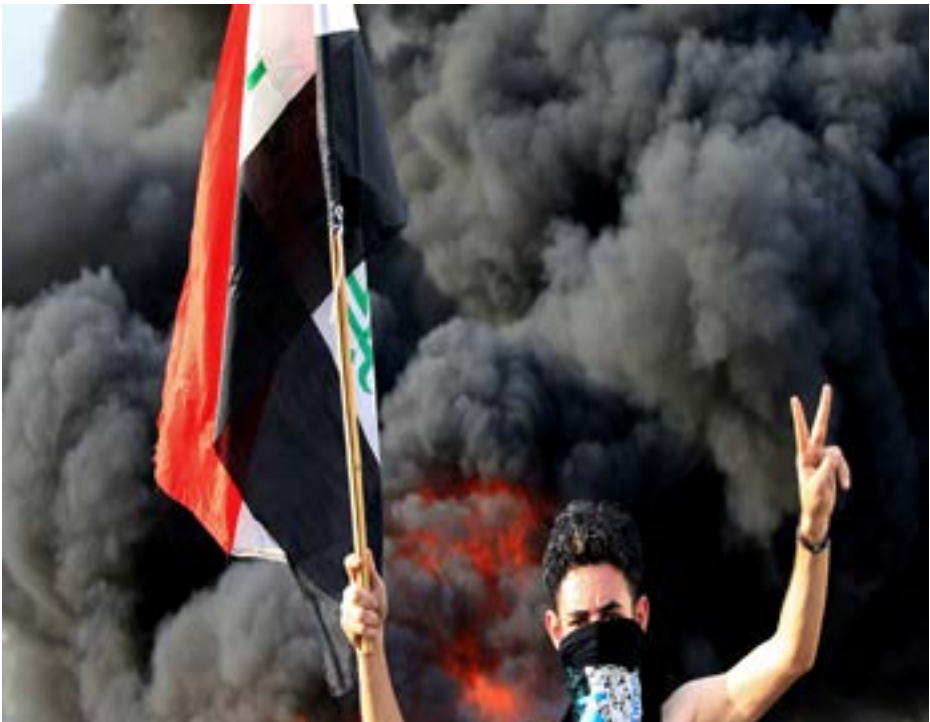
A demonstrator gestures as he stands close to burning tires blocking a road, during a protest over unemployment, corruption and poor public services, in Baghdad