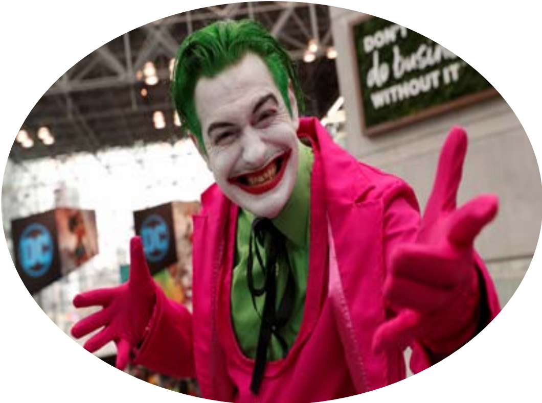
A person dressed up as the Joker attends the 2019 New York Comic Con in New York City