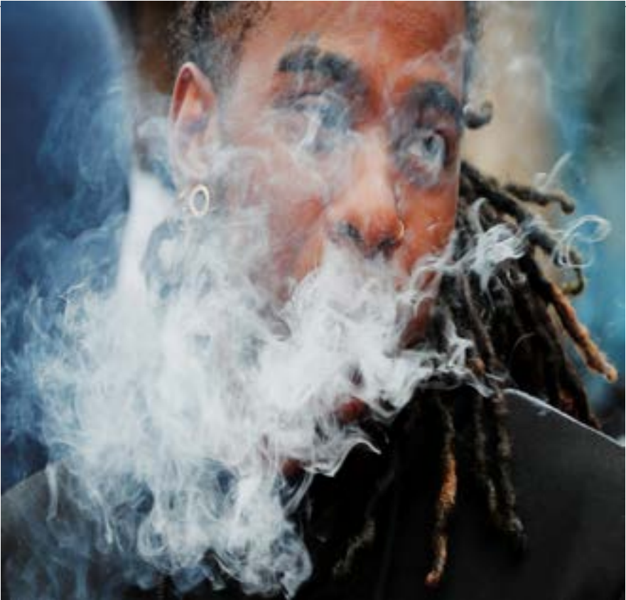
A demonstrator vapes during a protest at the Massachusetts State House against the state's four-month ban of all vaping product sales in Boston, Massachusetts, U.S., October 3, 2019.