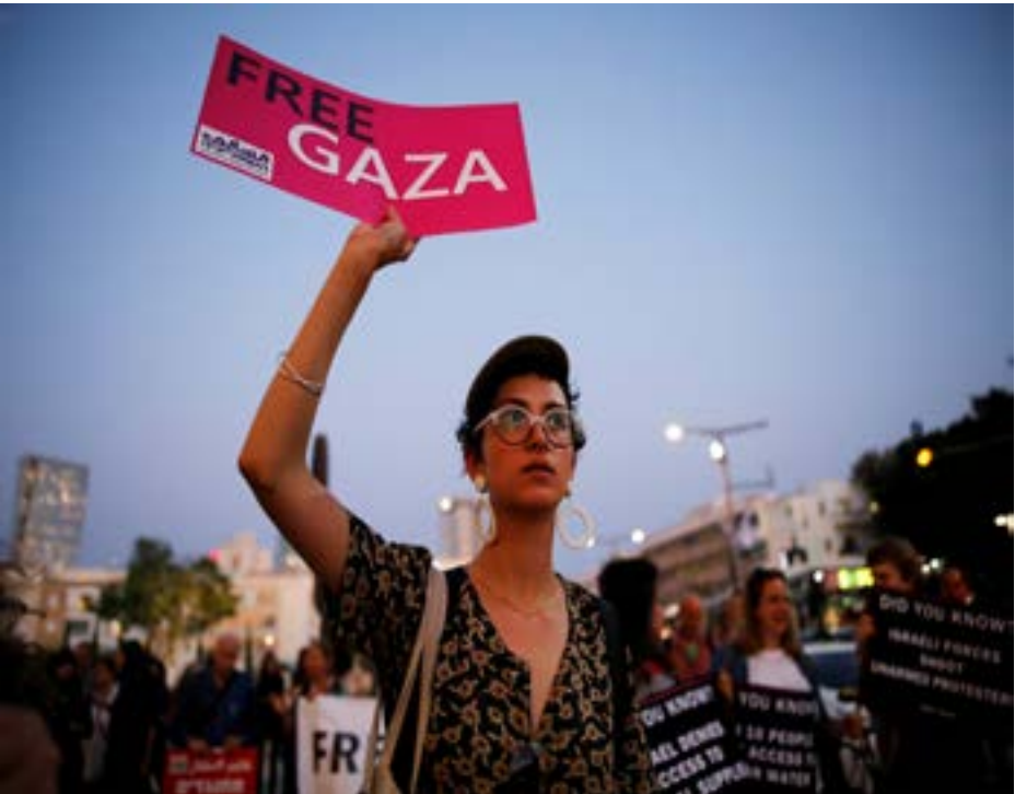
A protester holds a placard as she takes part in a demonstration calling for an end to Israel’s policy towards Gaza and a boycott of the 2019 Eurovision Song Contest as the first semi final of the contest begins in Tel Aviv