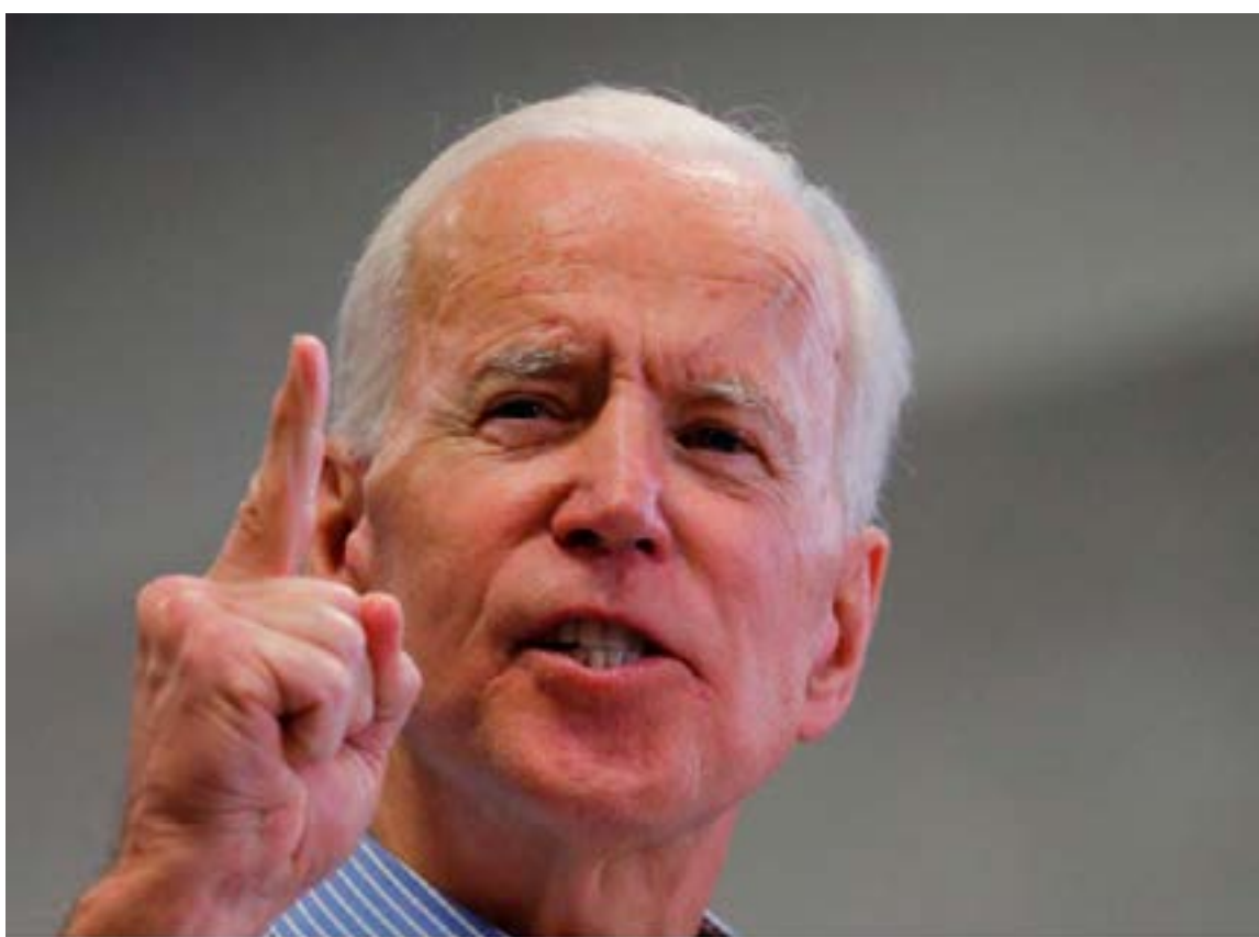
FILE PHOTO: Democratic 2020 U.S. presidential candidate and former Vice President Joe Biden speaks at a campaign stop in Manchester, New Hampshire, U.S., May 13, 2019. REUTERS/Brian Snyder/File Photo

"That means that there is not a significant anti-Biden block of voters split between the other candidates," said Chris Jackson, a polling expert at Ipsos.