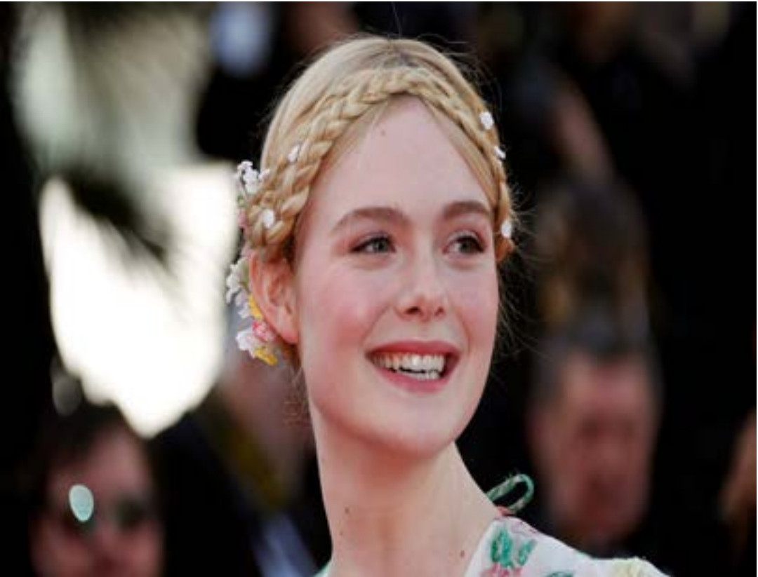
72nd Cannes Film Festival - Screening of the film “Les Miserables” in competition - Red Carpet Arrivals - Cannes, France, May 15, 2019. Jury Member of the 72nd Cannes Film Festival Elle Fanning. REUTERS/Eric Gaillard TPX IMAGES OF THE DAY