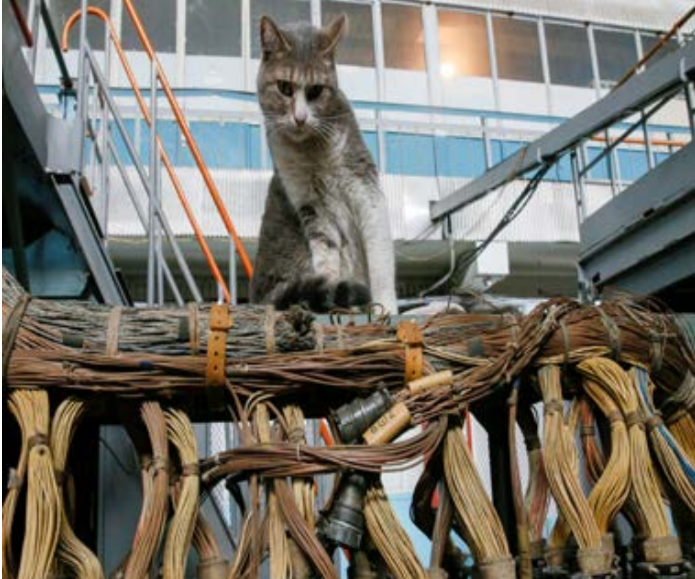
A cat sits inside a flight test facility at the Antonov aircraft plant in Kiev, Ukraine May 15, 2019. REUTERS/Valentyn Ogirenko TPX IMAGES OF THE DAY