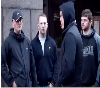
Undercover operations and traditional, boots-on-the-ground law enforcement were key elements of the strike force.