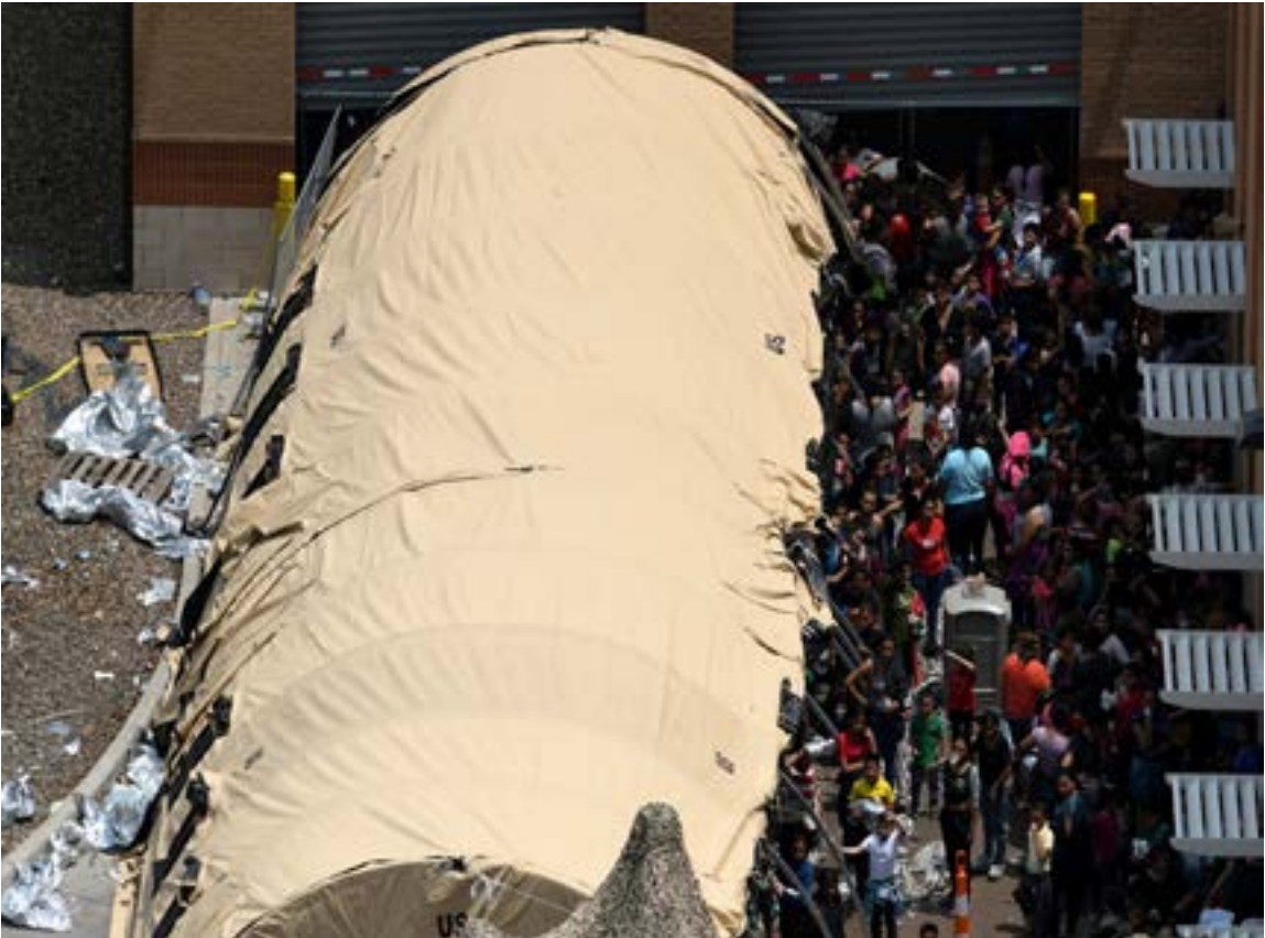
Migrants are seen outside the U.S. Border Patrol McAllen Station in a makeshift encampment in McAllen