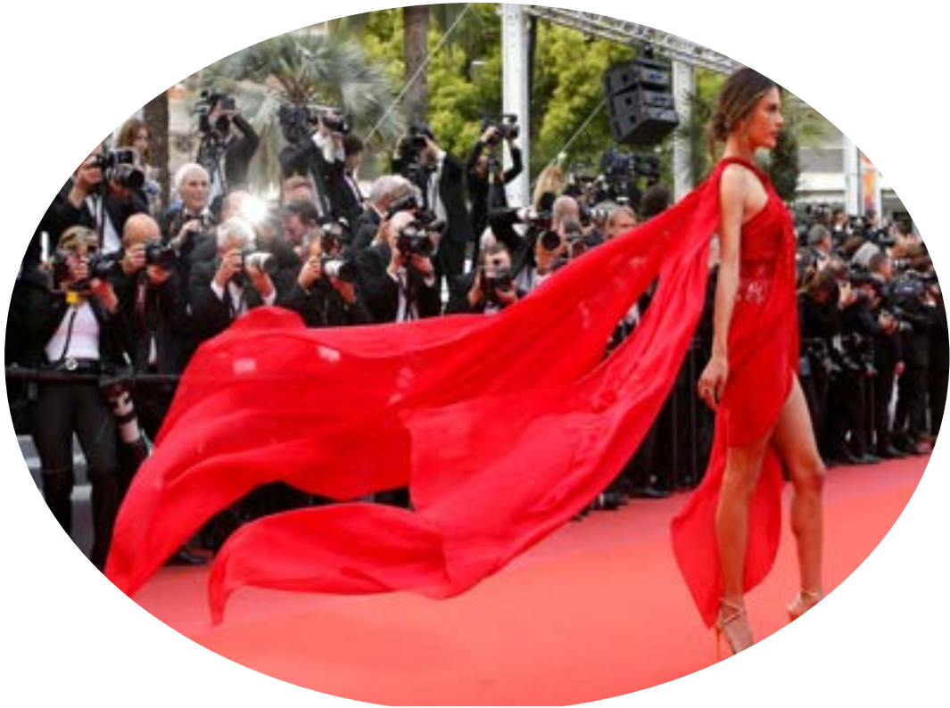
72nd Cannes Film Festival - Screening of the film “Les Miserables” in competition - Red Carpet Arrivals - Cannes, France, May 15, 2019. International top model Alessandra Ambrosio poses. REUTERS/Stephane Mahe TPX IMAGES OF THE DAY