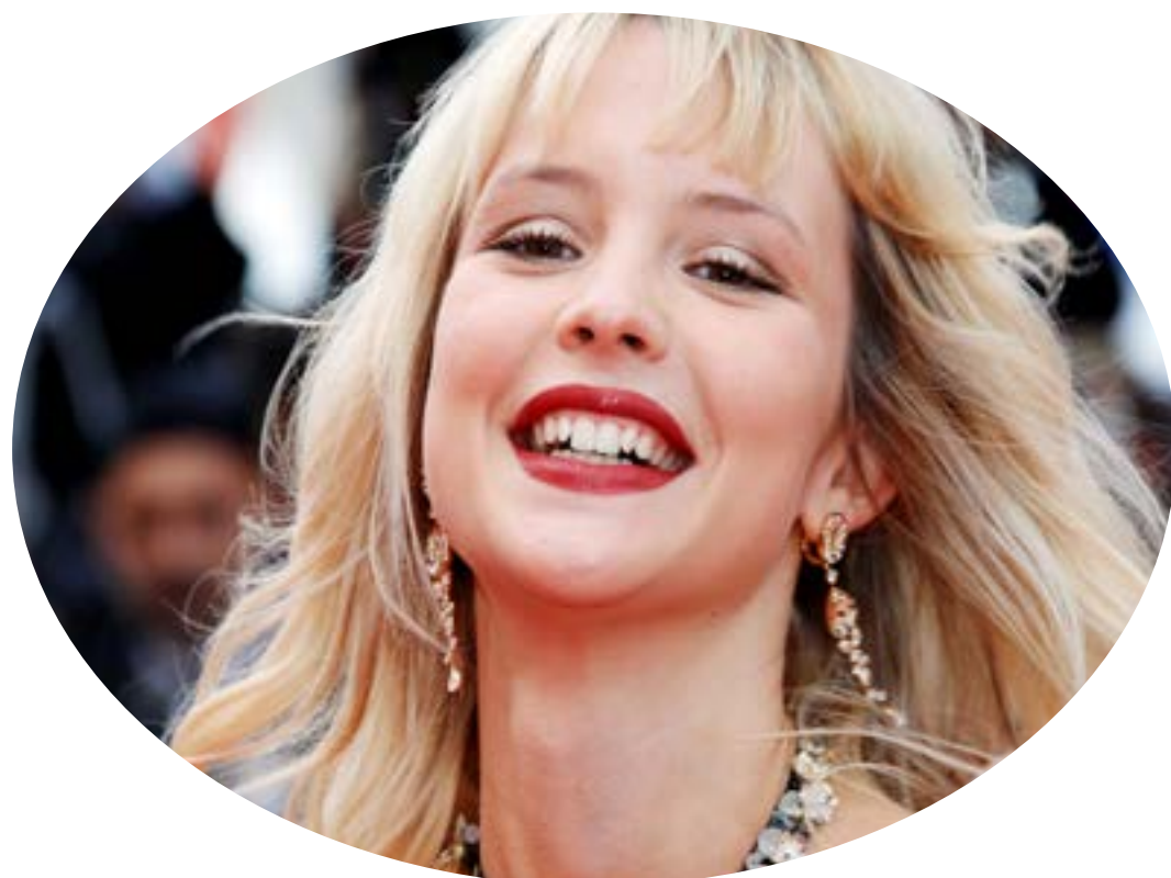
72nd Cannes Film Festival - Opening ceremony and screening of the film "The Dead Don't Die" in competition - Red Carpet arrivals - Cannes, France, May 14, 2019. Singer Angele. REUTERS/Jean-Paul Pelissier TPX IMAGES OF THE DAY