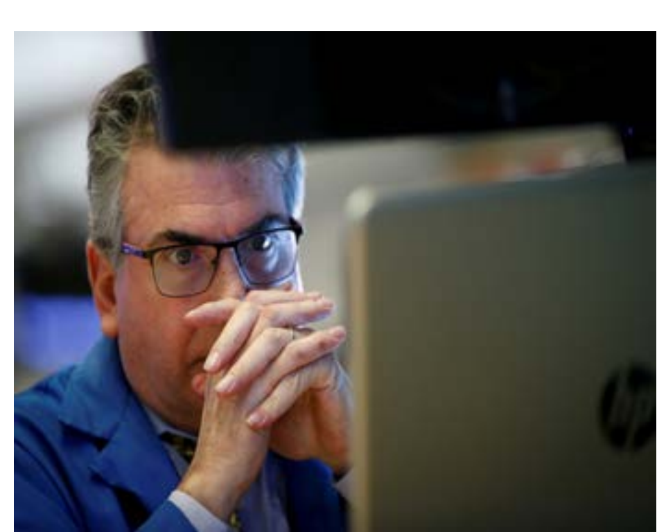
Traders work on the floor at the New York Stock Exchange (NYSE) in New York, U.S., May 13, 2019.