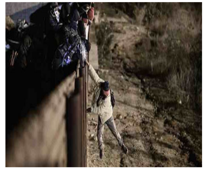
Illegals from Iran, Syria, Sudan and North Korea are on ICE's National Docket for removal.