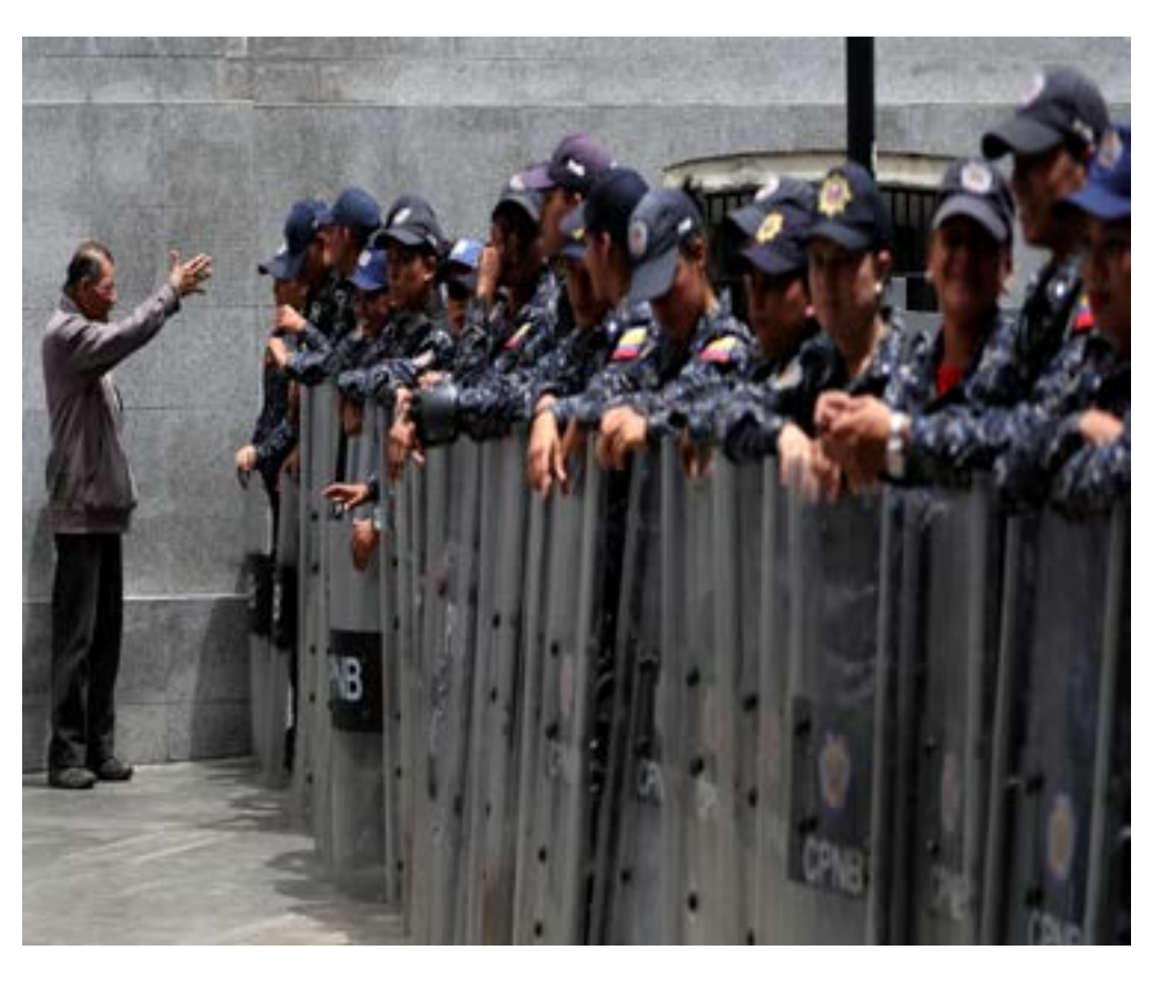
Venezuelan National Police members stand in line near the National Assembly building in Caracas, Venezuela, May 14, 2019.