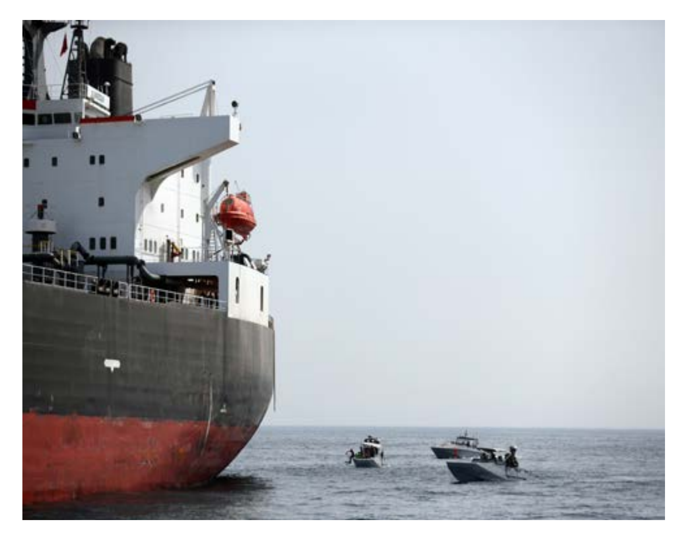
UAE Navy boats next to Al Marzoqah Saudi Arabia tanker are seen off the Port of Fujairah, UAE May ,13, 2019.

Aramco said it had temporarily shut down the East-West pipeline, known as Petroline, to evaluate its condition. The pipeline mainly transports crude from