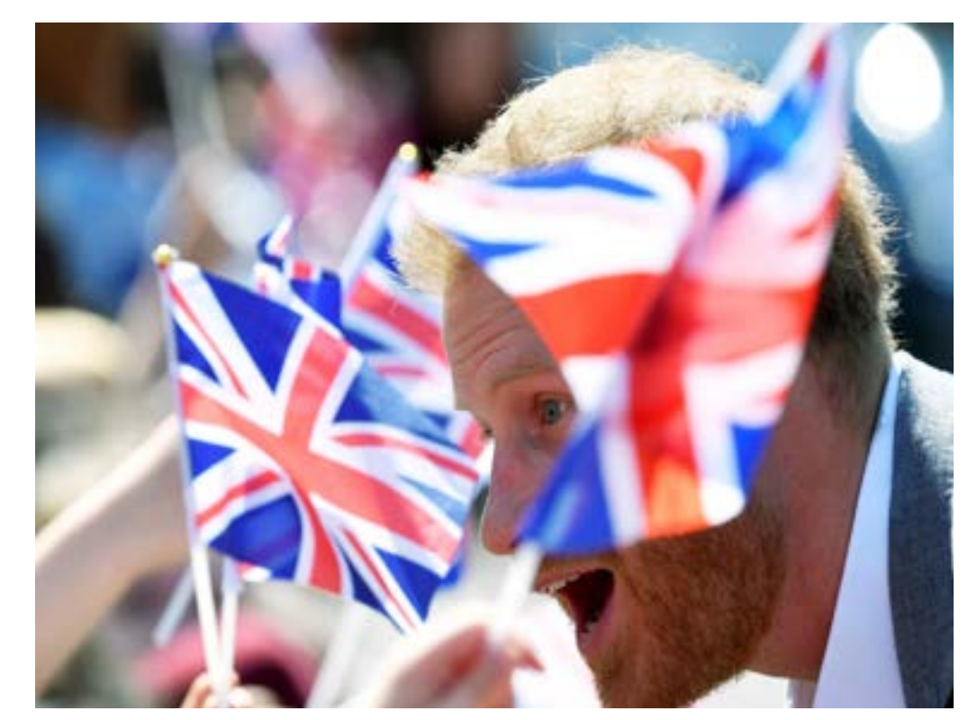
Britain's Prince Harry, Duke of Sussex, meets well-wishers outside of the Barton Neighbourhood Centre in Oxford, Britain, May 14, 2019.