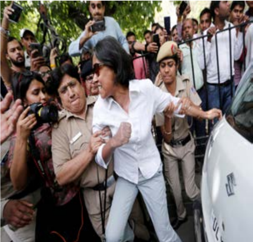
Police officers detain a demonstrator during a protest after a panel of judges dismissed a sexual harassment complaint against Chief Justice of India (CJI) Ranjan Gogoi, outside Supreme Court in New Delhi