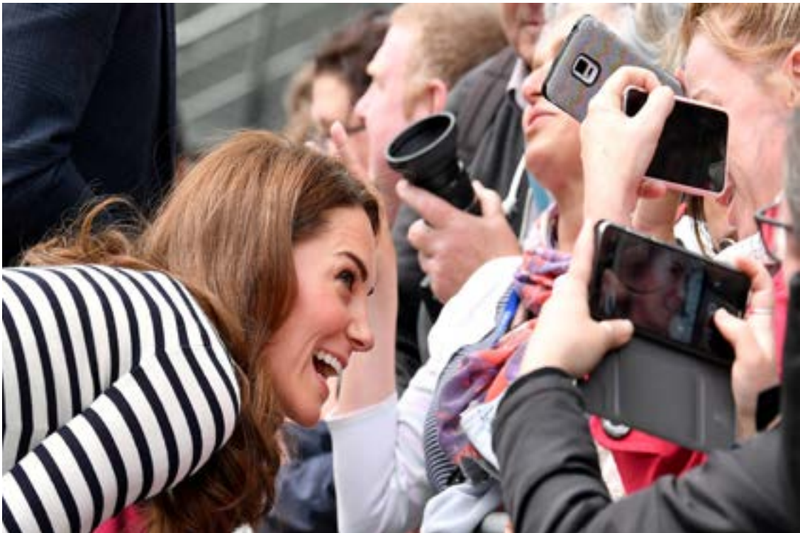
Britain’s Prince William and Catherine, Duchess of Cambridge, launch the King’s Cup Regatta in London