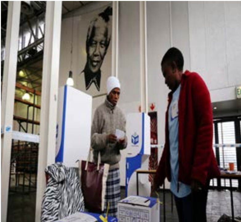
A woman casts her ballot during South Africa’s parliamentary and provincial elections, in Khayelitsha township near Cape Town, South Africa