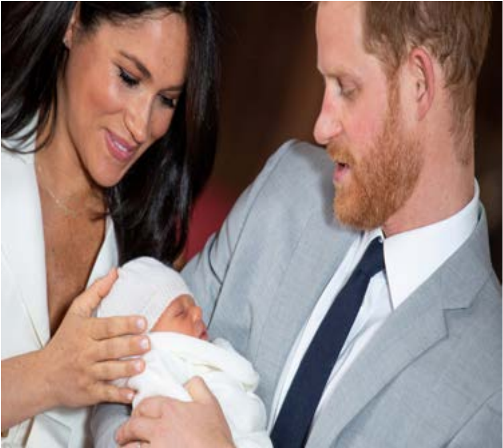
Britain’s Prince Harry and Meghan, Duchess of Sussex with their baby son at Windsor Castle