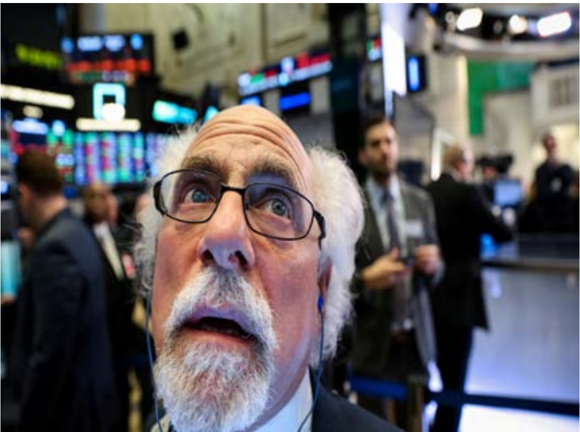
Traders work on the floor at the New York Stock Exchange (NYSE) in New York, U.S., May 8, 2019. REUTERS/Brendan McDermid TPX IMAGES OF THE DAY