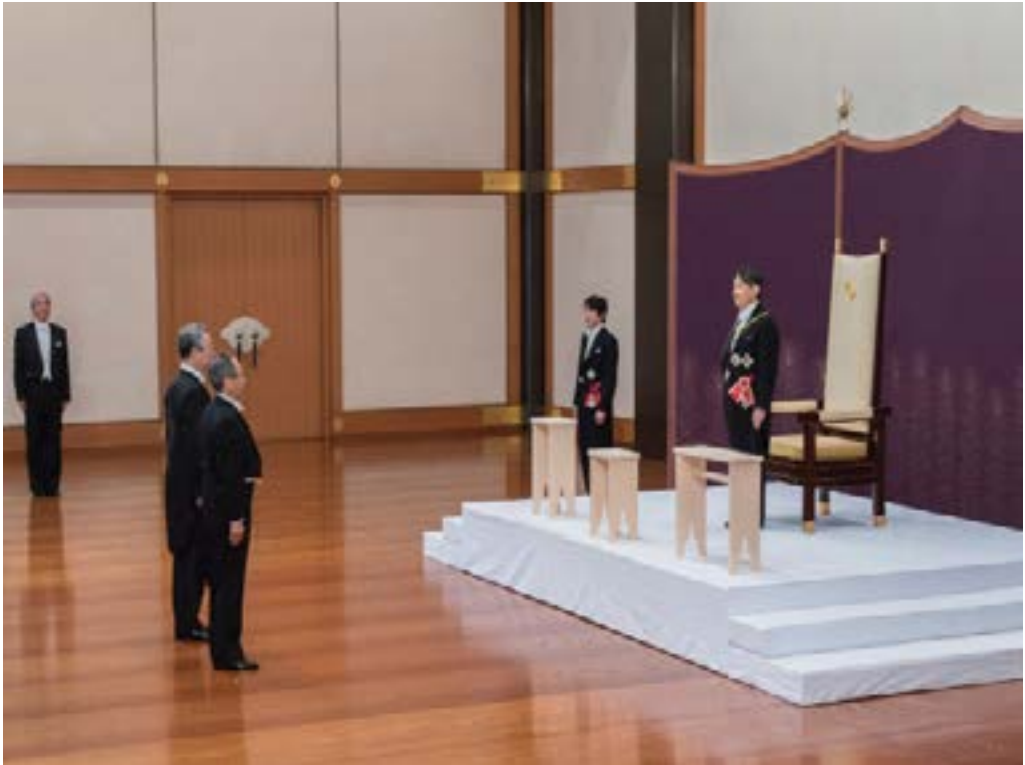
Japan’s Emperor Naruhito attends a ritual called Kenji-to-Shokei-no-gi, a ceremony for inheriting the imperial regalia and seals, at the Imperial Palace in Tokyo