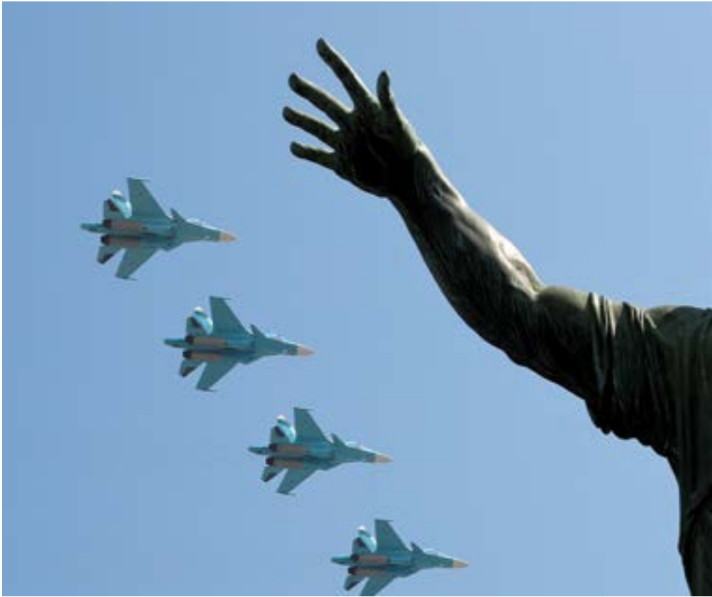
Su-34 military fighter jets fly in formation during a rehearsal for the Victory Day parade in Moscow