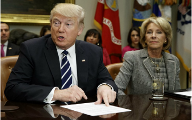
President Donald Trump and Education Secretary Betsy DeVos rolled back two Obama-era education rules Monday.

findings of the review. The review will be spearheaded by the Department of Education’s Regulatory Review Task Force, according to the order. Ms. DeVos already has authority to modify or repeal regulations that are deemed a violation of federal law. The order, however, creates a review for identifying those areas and makes clear her mandate from the president to take action. Reducing the federal government’s role in K-12 is part of Mr. Trump’s reform agenda, which also includes the expansion of school choice programs. Among those at the signing ceremony were Govs. Kay Ivey of Alabama, Gary Herbert of Utah, Paul LePage of Maine, Brian Sandoval of Nevada and Terry Branstad of Iowa.