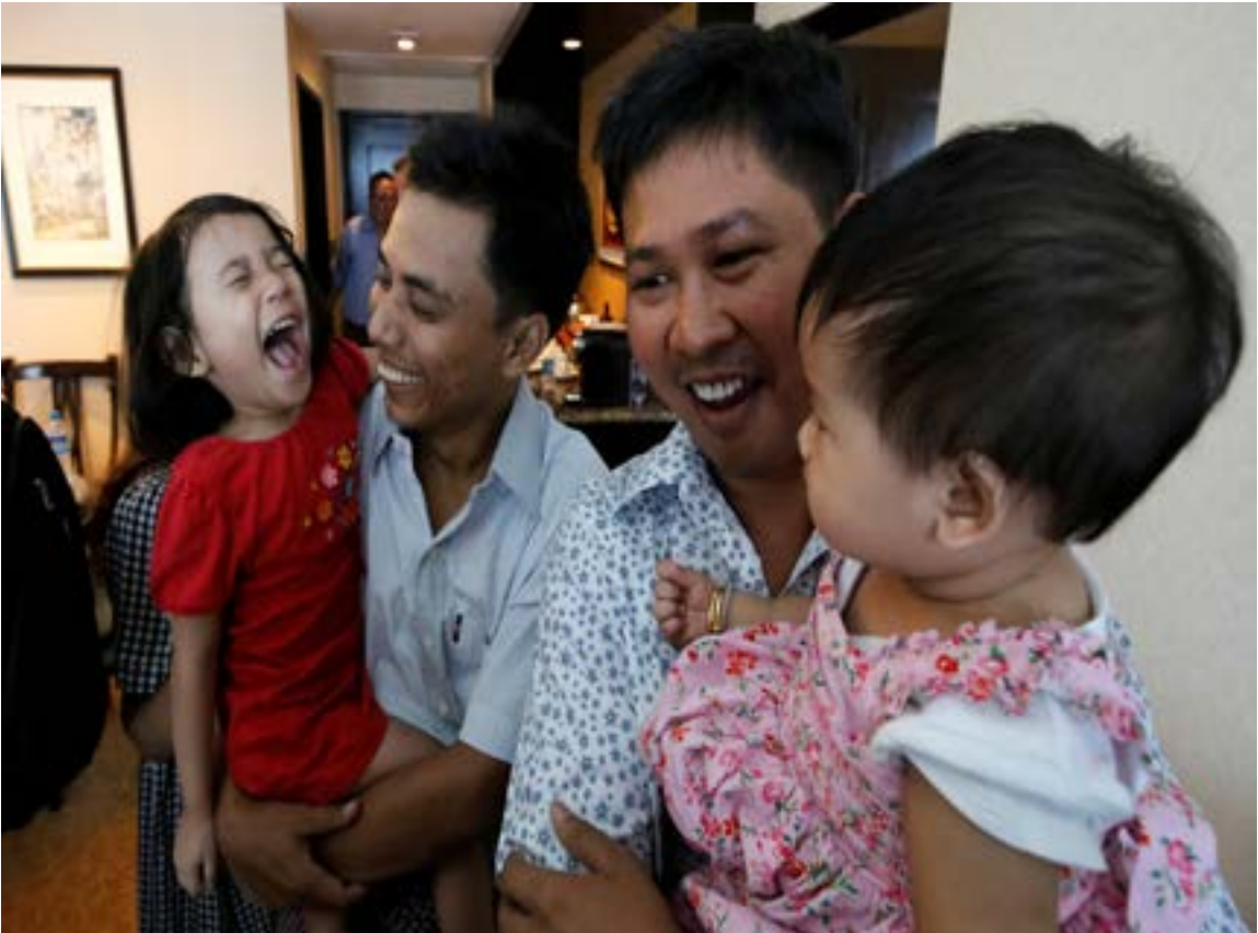
Reuters reporters Wa Lone and Kyaw Soe Oo celebrate with their children after being freed from prison, after receiving a presidential pardon in Yangon