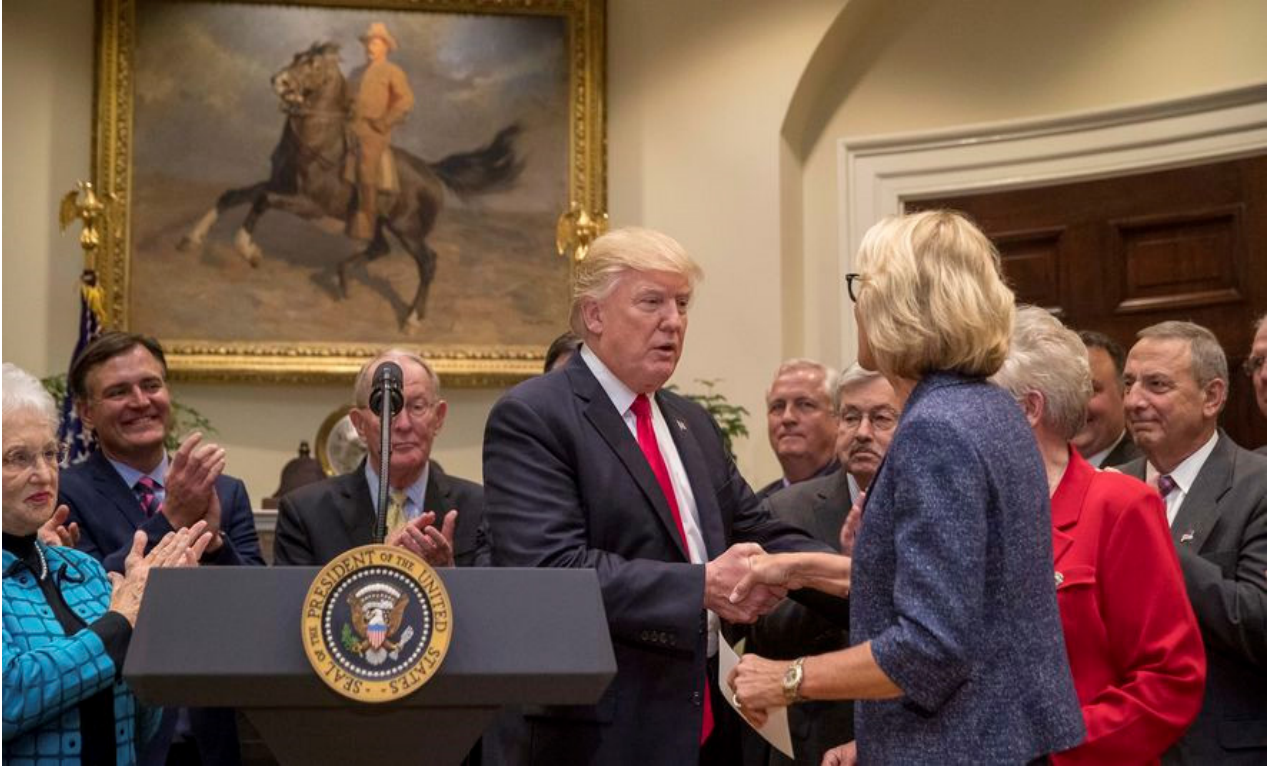
President Donald Trump greets Education Secretary Betsy DeVos before signing the Education Federalism Executive Order, Wednesday, April 26, 2017, in the Roosevelt Room of the White House in Washington.