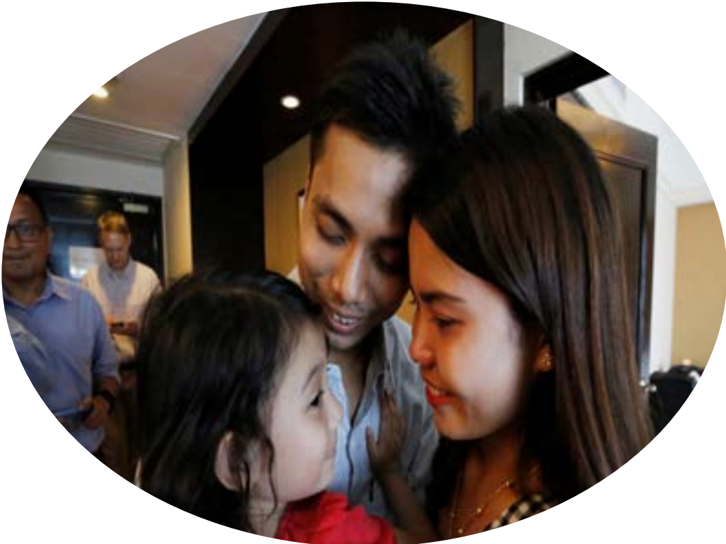
Reuters reporter Kyaw Soe Oo celebrates with his wife and daughter after being freed from prison, after receiving a presidential pardon in Yangon