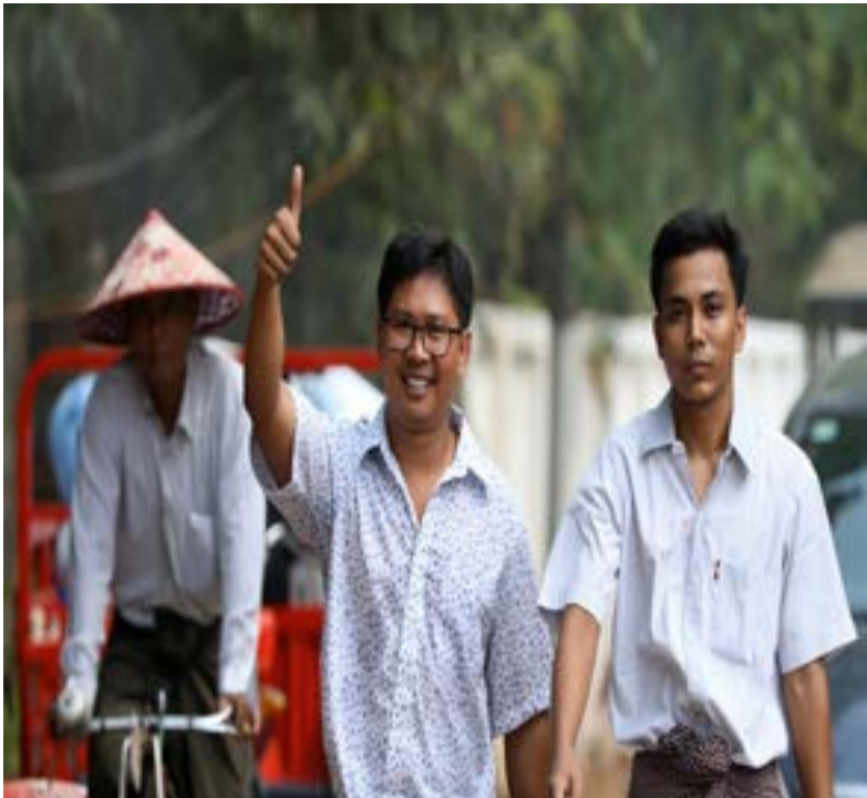
Reuters reporters Wa Lone and Kyaw Soe Oo walk to Insein prison gate after being freed, after receiving a presidential pardon in Yangon, Myanmar