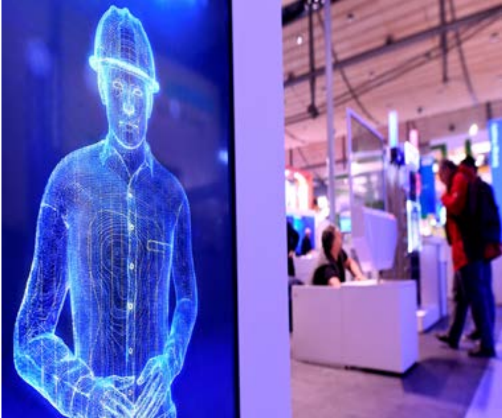
FILE PHOTO: An animation on a screen is pictured at the booth of Siemens at the Hanover trade fair, in Hanover