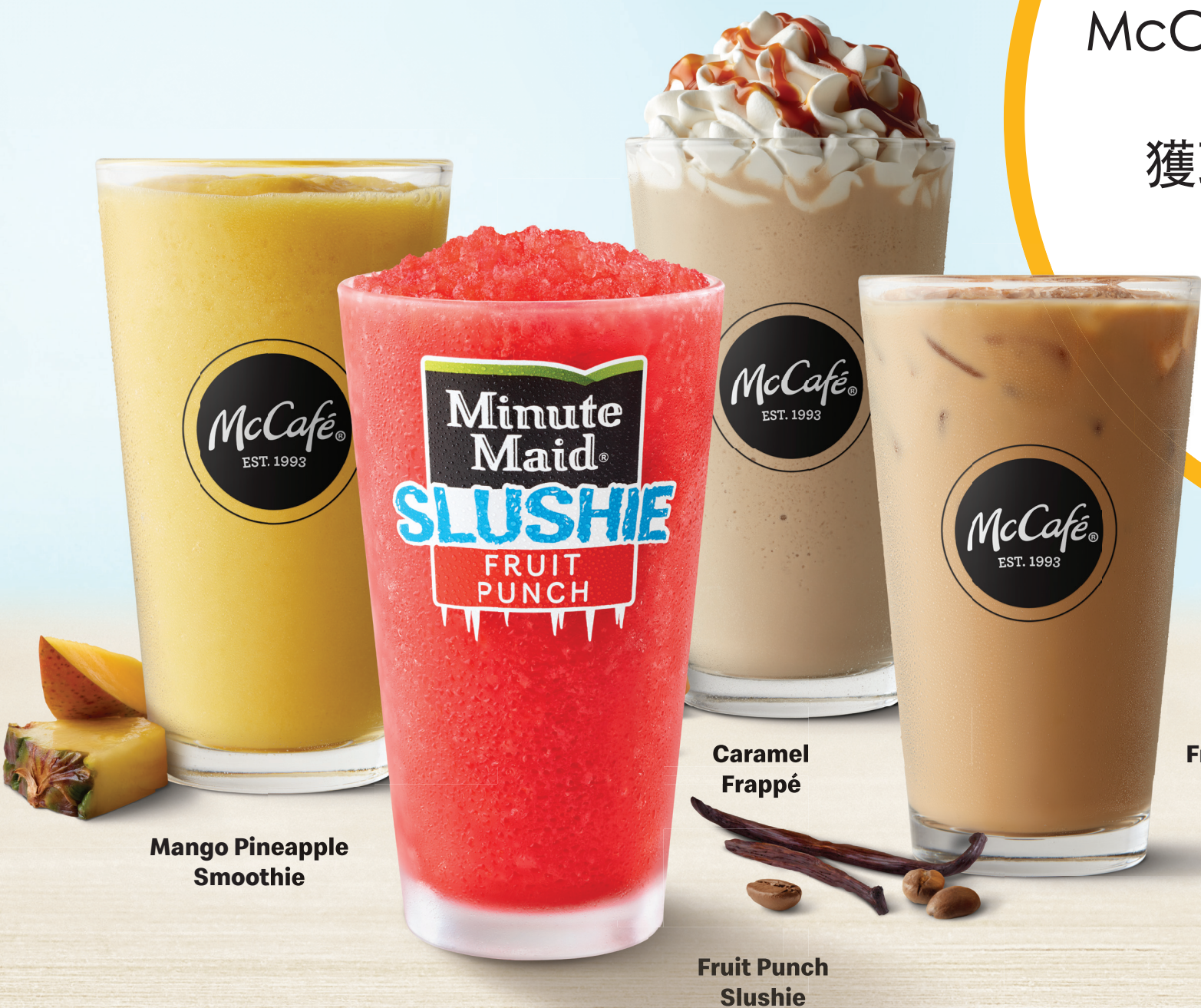
Mango Pineapple Smoothie