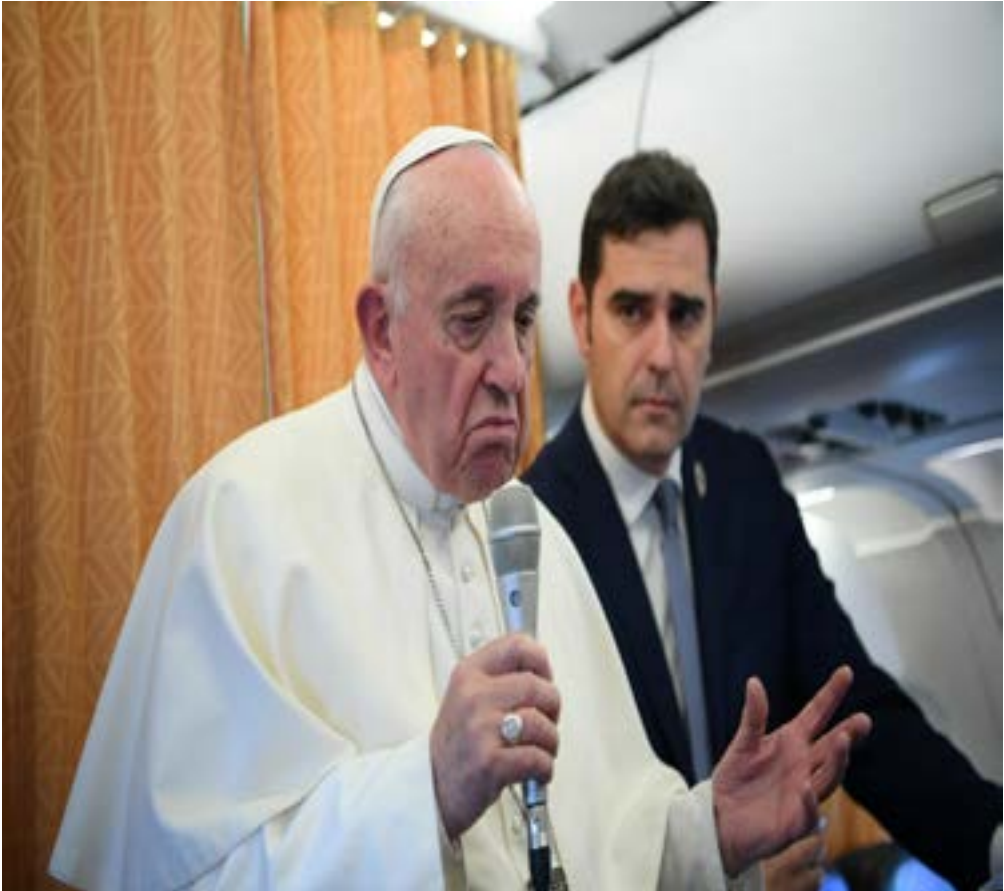
Pope Francis speaks to reporters during the flight from Skopje to Rome, at the end of his apostolic journey to Bulgaria and North Macedonia, May 7, 2019.