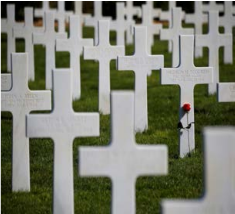
A rose is seen in front of a tombstone at the World War II Normandy American Cemetery and Memorial at Colleville sur Mer