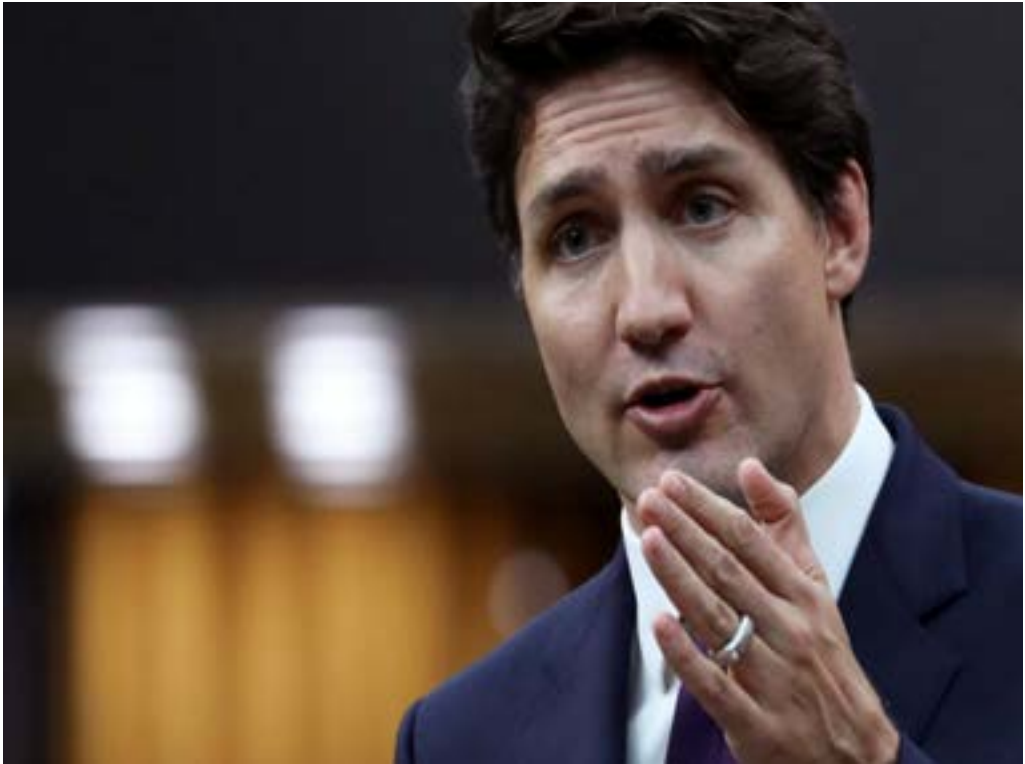
Canada's PM Trudeau speaks in the House of Commons on Parliament Hill in Ottawa