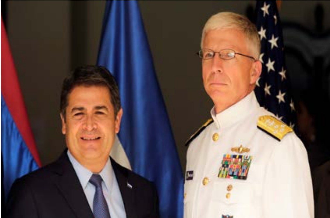
Honduras' President Juan Orlando Hernandez poses with U.S. Navy Admiral Craig Faller, Commander of U.S. Southern Command before they attend a news conference about the Regional Security Cooperation, in Tegucigalpa