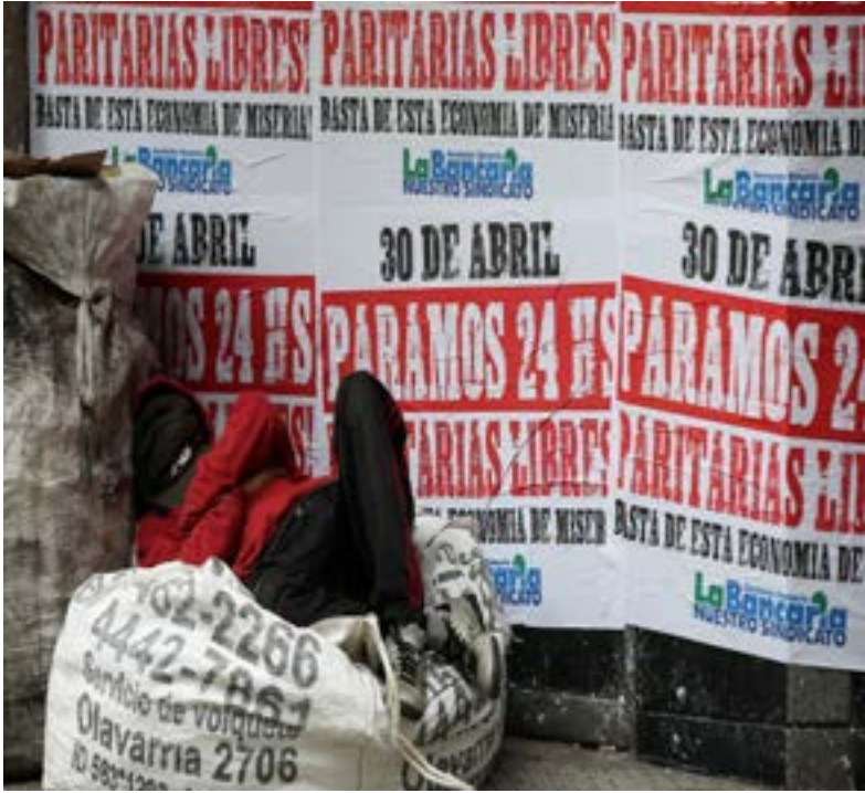
A homeless person sleeps outside a currency exchange shop with posters announcing a general strike action on April 30th in Buenos Aires’ financial district