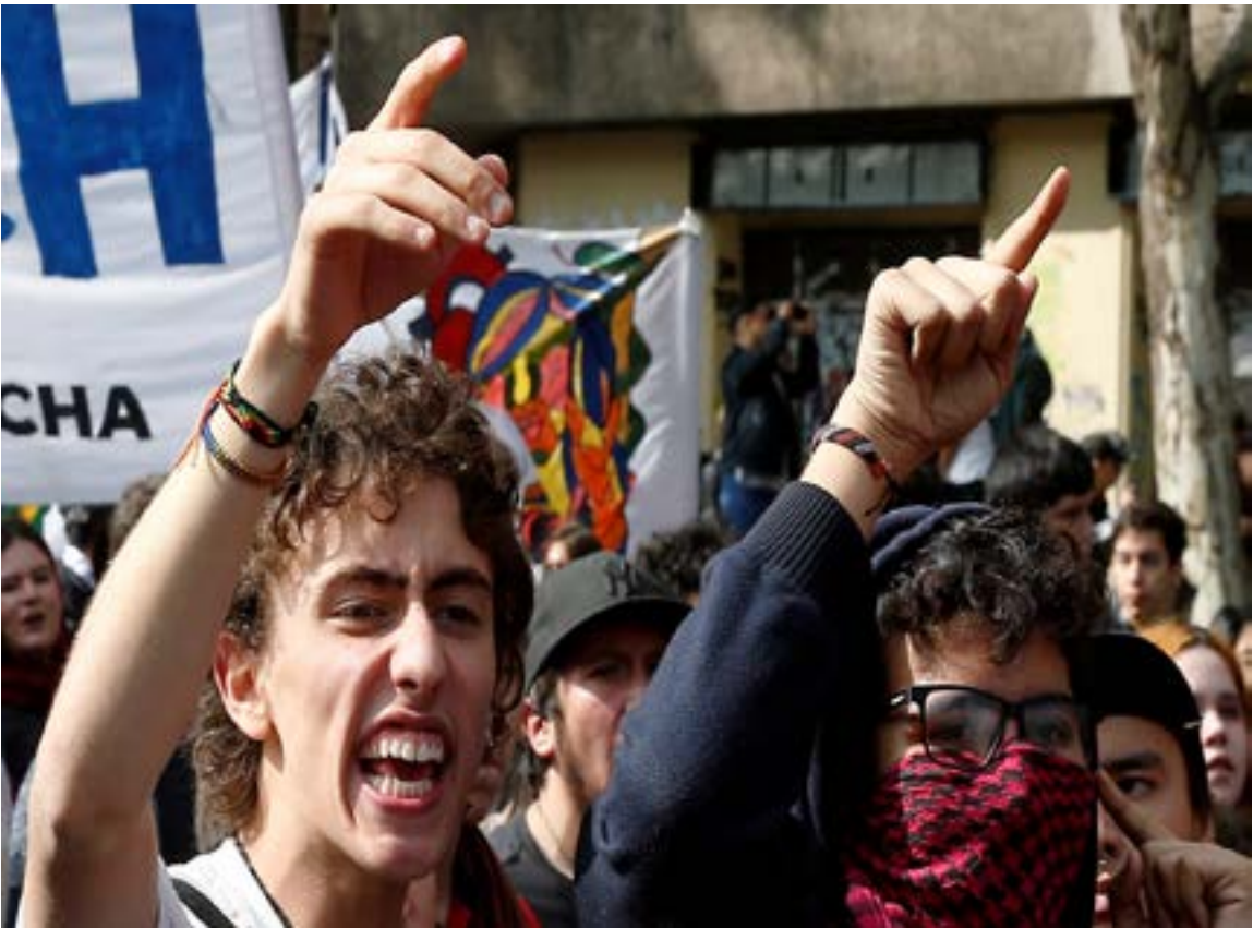
Demonstrators take part in a protest demanding an end to profiteering in the education system in Santiago