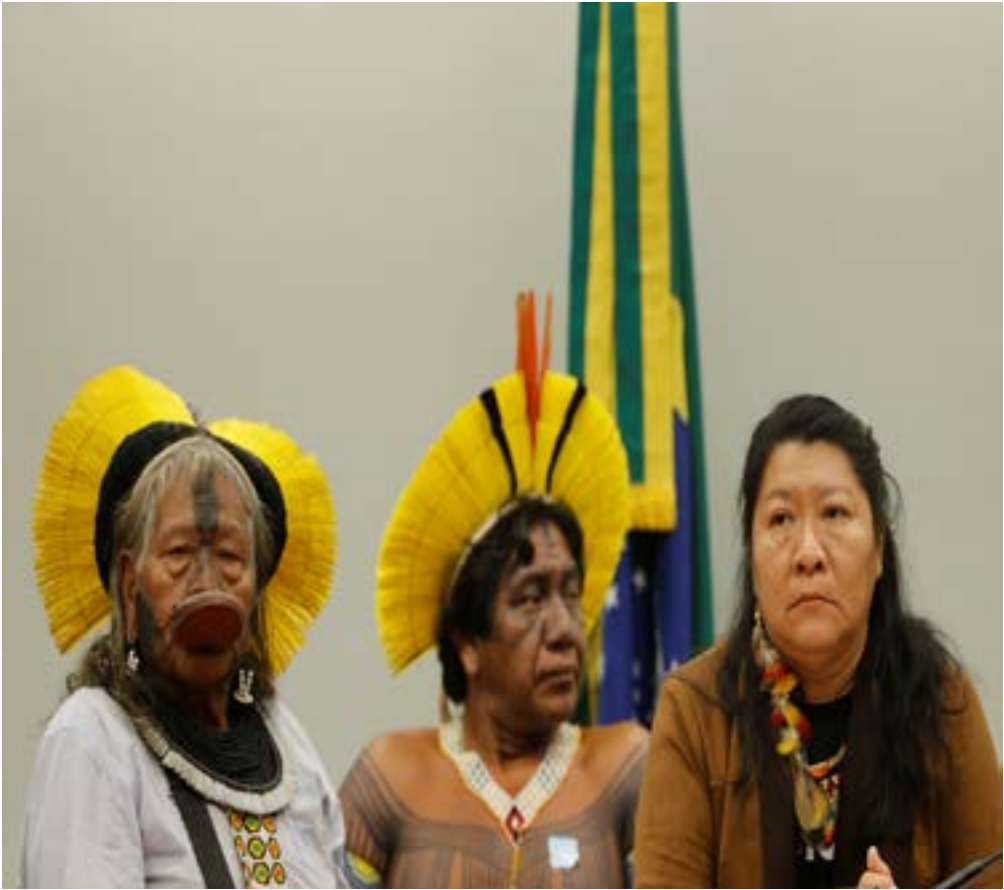
Raoni Metuktire, a leader of the Brazilian indigenous ethnic Kayapo people and the Congress-woman Joenia Wapichana attend a meeting with congressmen during the Terra Livre camp, or Free Land camp, at the National Congress in Brasilia