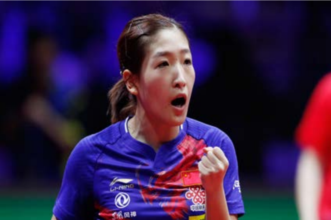
Table Tennis - 2019 World Table Tennis Championships - Hungexpo, Budapest, Hungary - April 25, 2019. Liu Shiwen of China reacts during her semifinal match against Ding Ning and Fan Zhendong of China.