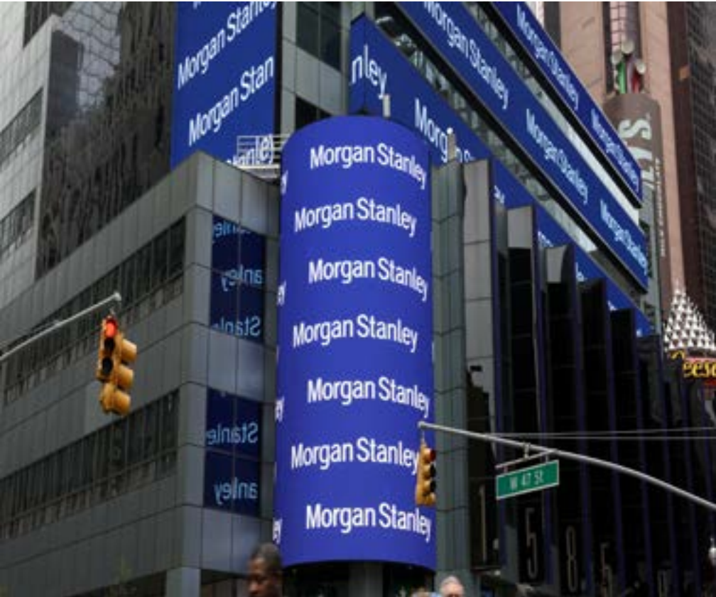
FILE PHOTO: The corporate logo of financial firm Morgan Stanley is pictured on the company’s world headquarters in New York