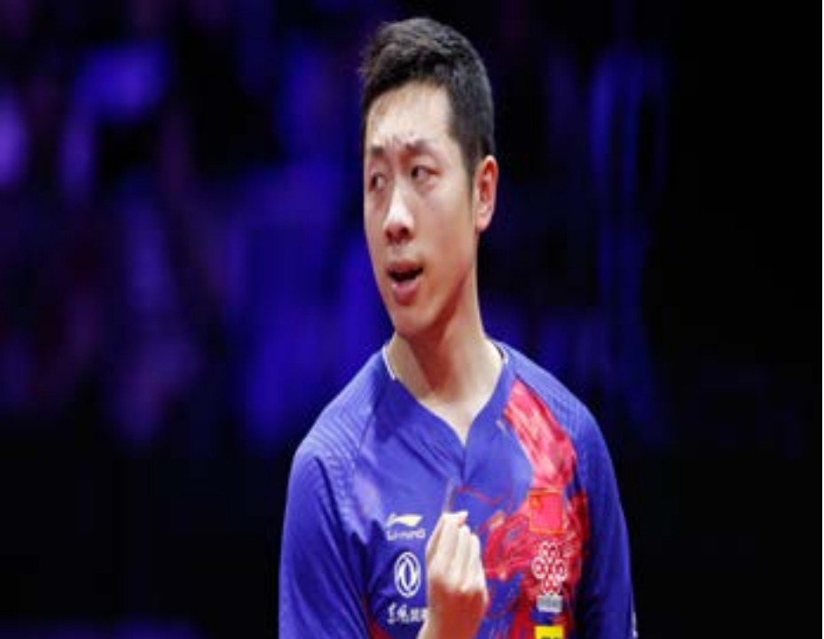
Table Tennis - 2019 World Table Tennis Championships - Hungexpo, Budapest, Hungary - April 25, 2019. Xu Xin of China reacts during their semifinal match against Ding Ning and Fan Zhendong of China.