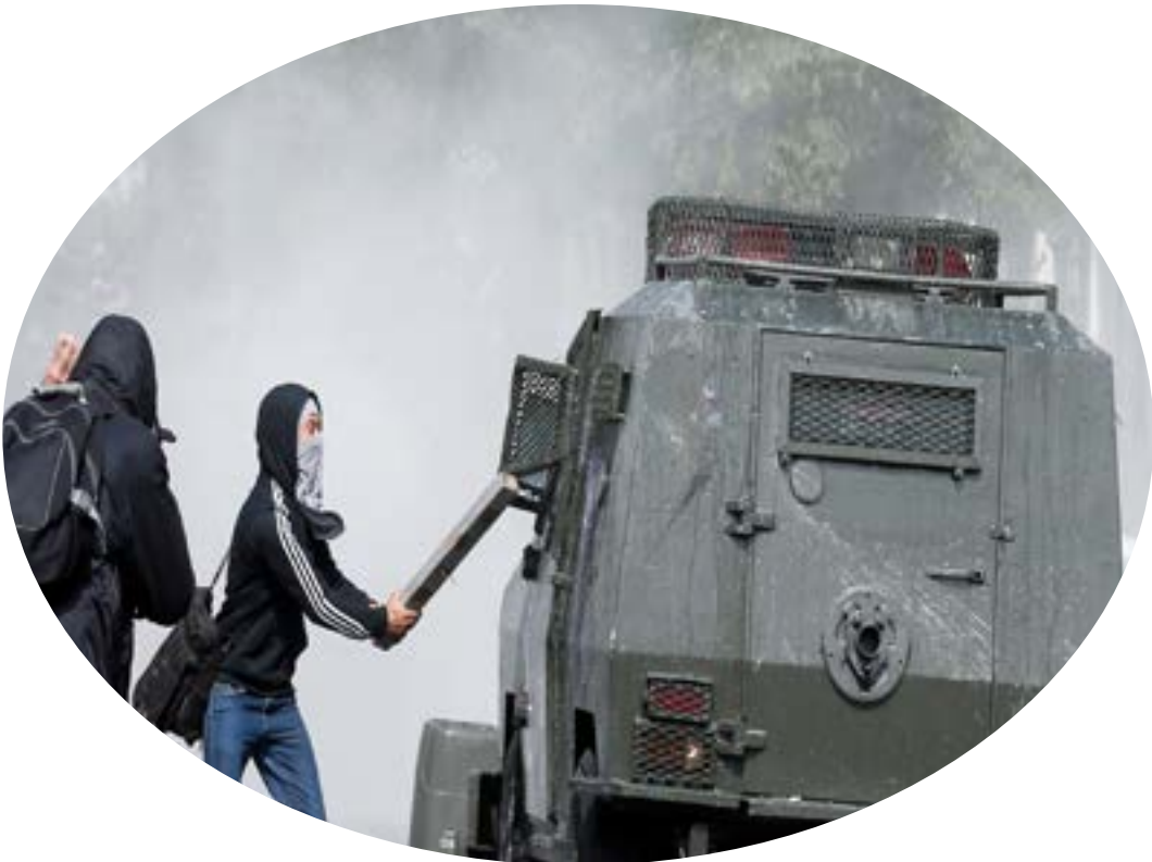
A demonstrator clashes with riot police during a protest demanding an end to profiteering in the education system in Santiago